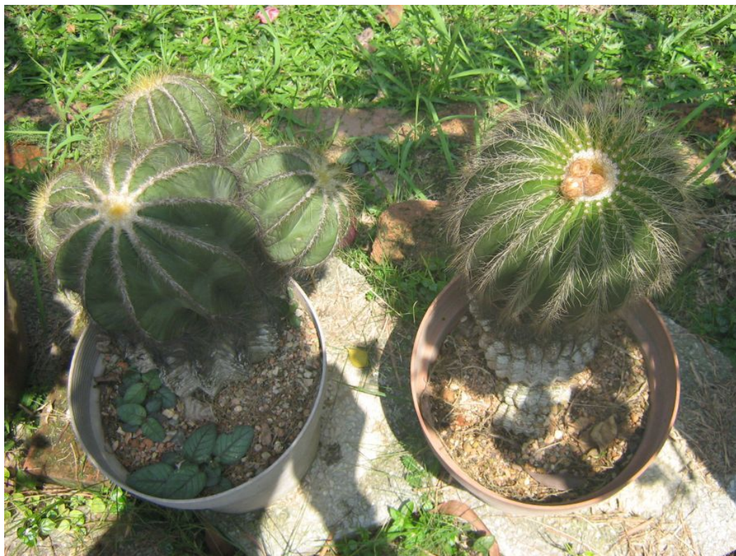
The big PMag and the big PClav in an unsheltered location, July 2013. There are three flower buds on the big PClav.

If you have good-sized PMag, PClav or MGeo, you can opt to be lazy and just leave them out in the sun and rain. The two specimens in the above picture have been exposed to the elements for several years at the time the picture was taken. They did flower on occasion, but less than once a year. The soil mix is primarily burnt soil, that fired clay stuff – almost zero organics, for safety.