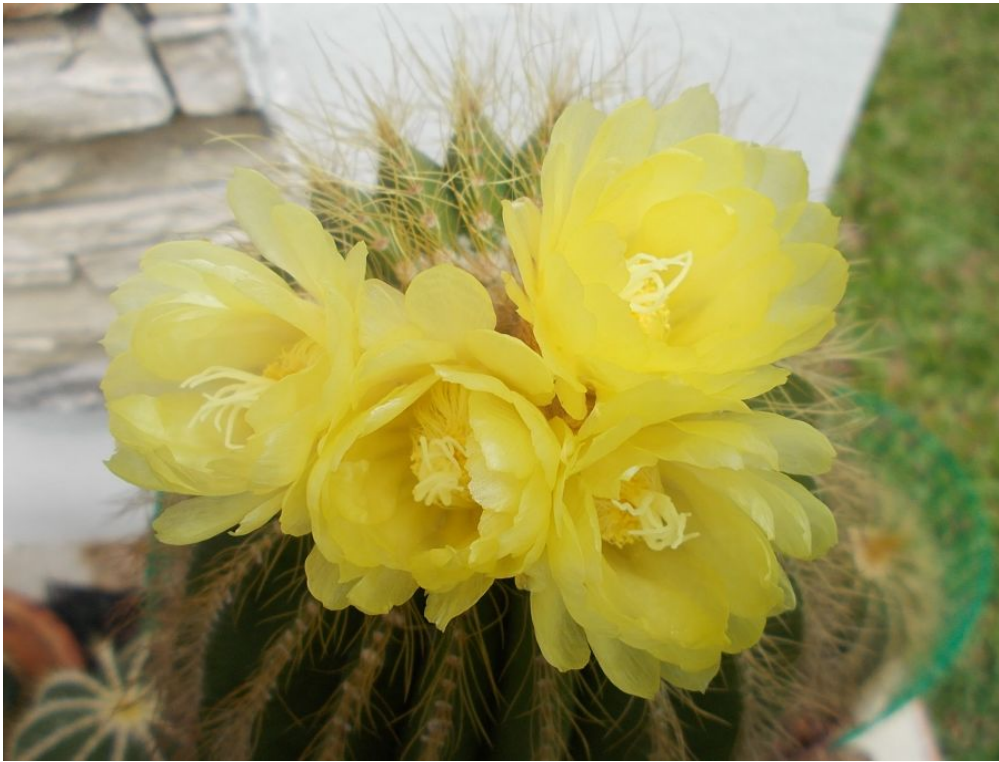
With four flowers, December 2017. Having one flower is pretty common...