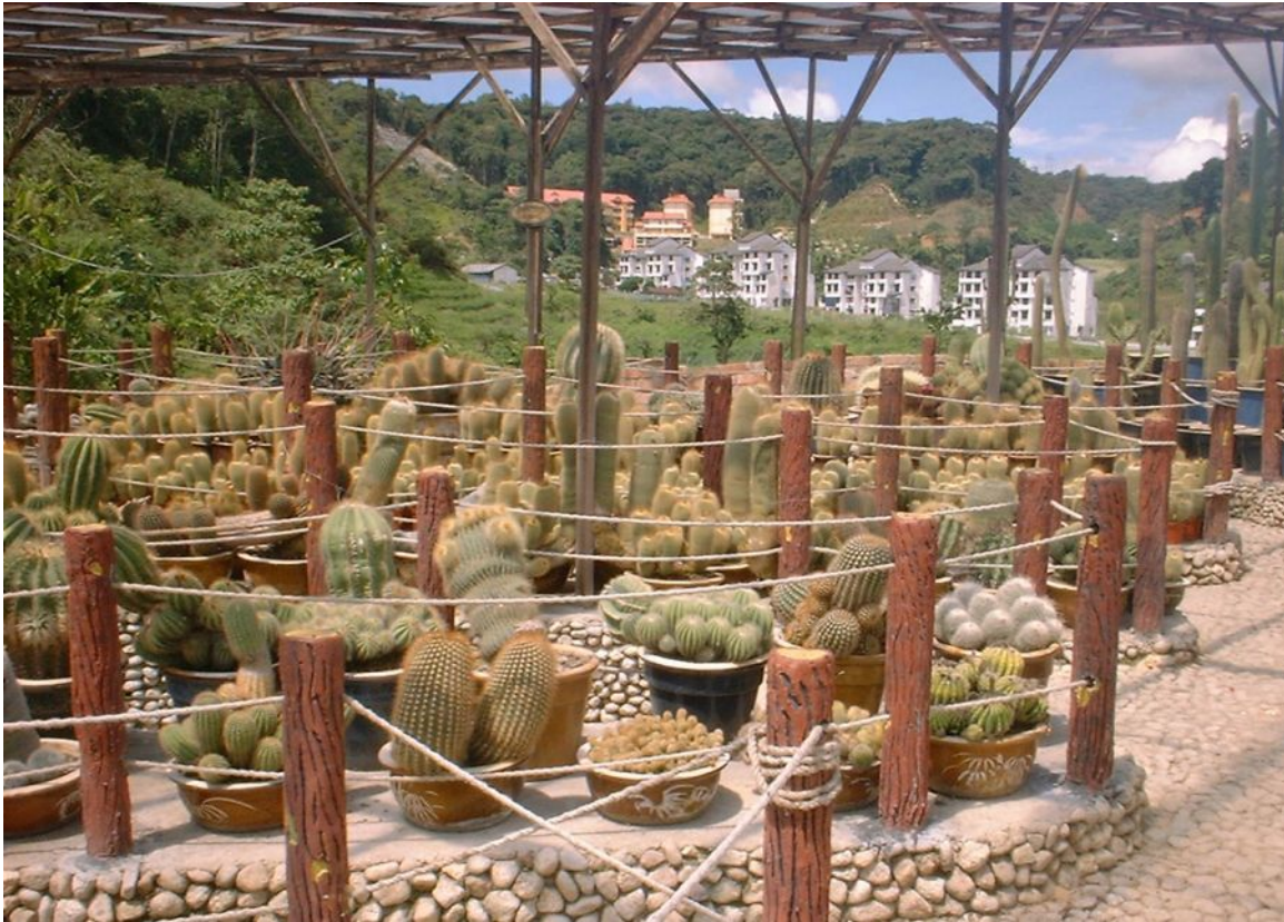
Cactus Valley in Cameron Highlands, Malaysia, 2002. It's all very nice, but can you maintain something like this in urban Klang Valley? Note: There are a lot of Parodia leninghausii specimens (columnar with yellow spines) in the middle of this picture.

What about all the other species of cacti, some of which are very beautiful even without flowers? Well sure, there is nothing to stop anyone from growing those. The issue is: Will you be able to care for the plants adequately in the long term? My choices were guided by some constraints and threats. The major constraints are: (1) the hot, humid and dusty urban lowland tropical climate, and (2) a policy of not using strong agricultural chemicals. The major threats are: (1) accumulation of dust attracts spider mite attacks, and (2) very spiny or wooly species or species with soft stems are next to impossible to clean if scale insects attack.