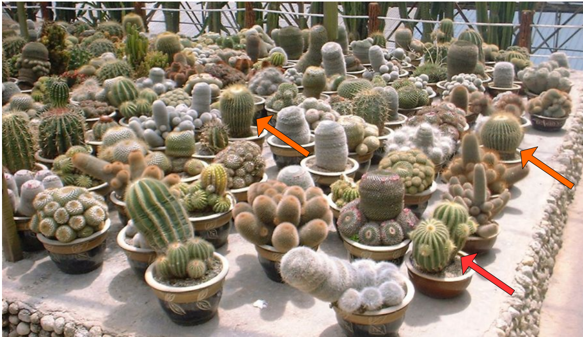
There is one PClav (red arrow) in the picture from page 4. There is one other picture with a flowering PClav in my old Cameron Highlands pictures. The two plants marked with orange arrows have many more ribs, they look like Parodia Schumanniana . PClav produces offsets (pups) from the top; PMag produces offsets from the base.