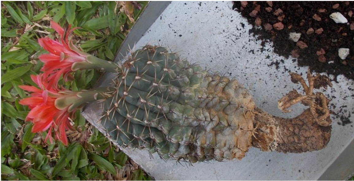
A GBald about to be repotted, July 2019. This specimen was flowering even though it keeps losing its fine roots in a soil mix with too much organic soil.

As for the hidden portion of the plant, it does not grow a taproot like some species of cacti. Instead, the lower part of a GBald will shrink and pull the plant downward into the ground in the dry season. In the past, I assumed that all cacti with ribs will deflate when water is scarce; I assumed wrong. And ladies and gentlemen, this is where it gets complicated for tropical urban gardeners.