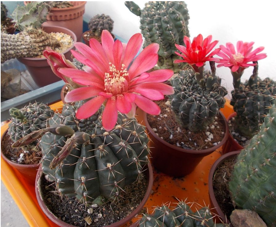
A larger picture of the GBald specimens from page 1, April 2017. This looks nice, but things are not perfect. In the last few years, practically all GBald seed pods have aborted themselves, even with manual pollination, so I have no GBald seeds at all. Note the failing pods at the lower left of the picture.

The maintainability of these three species is one big reason why these days I do not care about experimenting with other species of cacti that flower in the tropics such as some Mammillarias . There are plenty of things to do with these three species – while I've enjoyed plenty of flowers, there are other things that are not working out perfectly. PMag and PClav specimens have fewer issues compared to GBald specimens.