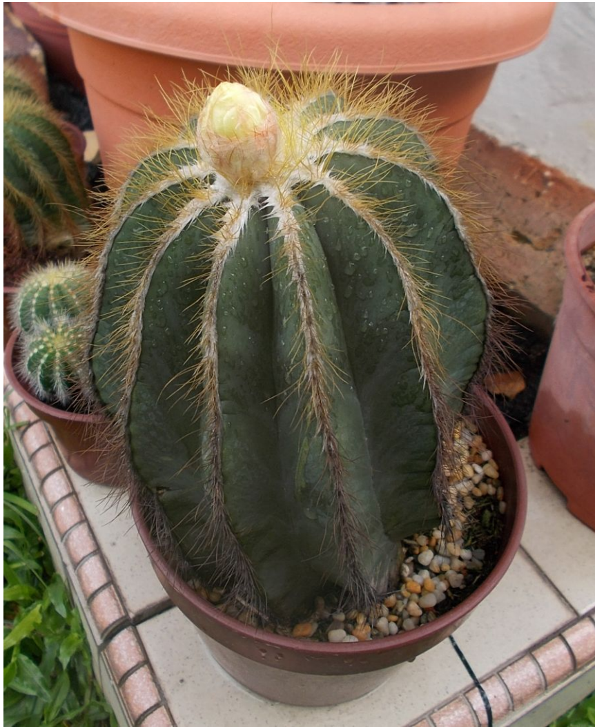
A second PMag with a flower in the process of opening, April 2019. The flower bud extends and increases in size markedly in the last 24 hours before opening. At the 9 o'clock position are two small PMag rooted offsets.

If you are worried that growing a mature PMag specimen will take a long time, do not despair. As a subtropical species of cactus, PMag is used to pockets of organic-rich soil among the rocks in its habitat. Specimens will respond to fertilizer feedings. So this is a species that you can force-feed to make it grow faster. There will be some risk of course, but risk can be managed.