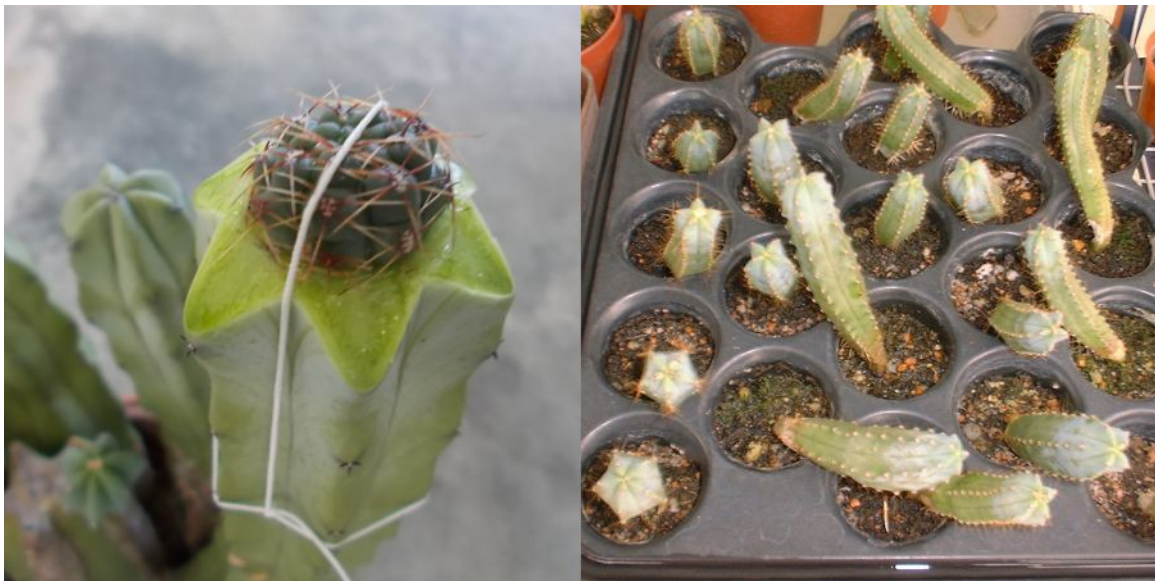
Left: Just after grafting 7 , March 2014. Right: MGeo seedlings, July 2000.

Grafting will be discussed in a future chapter, though I must add that grafting is not something I do regularly or have a lot of experience in because I do not have a ton of plants to slice up.