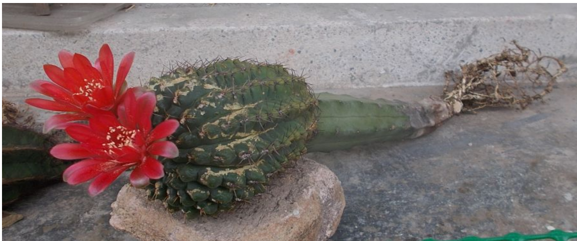
Mixed signals: maybe the MGeo stock doesn't want to go dormant (Dec 2017). The GBald looked like it went dormant, but there were flowers every month.

MGeo is very easy to grow and will even survive rich organic garden soil. However, scale insects may attack stressed specimens.