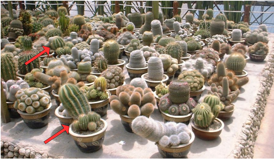
Many large specimens at Cactus Valley, Cameron Highlands, in 2002. There are two PMags in the picture (red arrows) but now I know that these aren't happy plants. Note the wrinkles on the PMag in the foreground. I guess they are doing it wrong.

Why am I getting flowers on my PMags all the time while there are none on the specimens in the picture above? I've checked my old Cameron Highlands pictures, I cannot find a single PMag in bloom, and only a single picture had a PMag with a dried pod. Think of all the potential wasted by growing subtropical PMags like North America desert cacti!