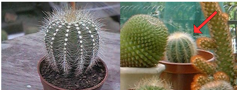
Left: A juvenile PMag, June 1999. (It's an old 320 x 240 digital camera pix with poor colour!) Right: Probably the same specimen, 11 months later, May 2000. Those Mammillarias were more beautiful but did not survive in the long term.

Although a PMag can be fairly large, I would still call it a mid-sized cactus because generally one person can still move a PMag pot. Note that we are talking about a mature specimen. So all you need to do is buy a juvenile specimen that is sold as commodity cacti in 2 inch pots, then grow it to maturity. A juvenile specimen will have the same wide ribs and are more green than bluish-green in colour. Or, you can probably buy a big one in Cameron Highlands.