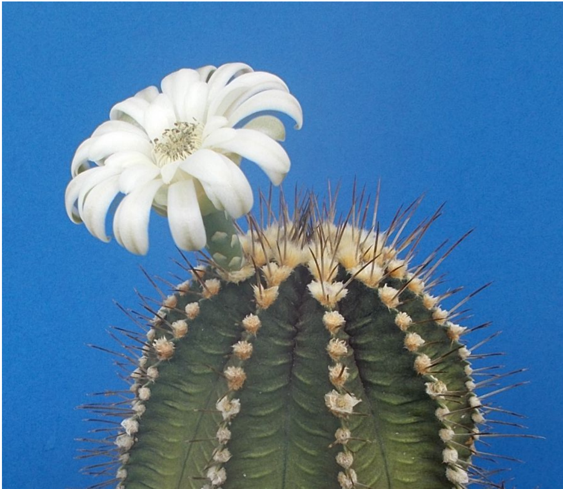
Here is the GSteno with a single open flower in July 2019. In the tropics, this species is not quite as happy to flower as GBalds.

Although my old GSteno specimen is quite reluctant to flower 6 , observe the younger areoles in the picture above. Can you see how much wool the topmost areoles have? Compare this to GSteno specimens on the Internet – just do an image search for Gymnocalycium stenopleurum . The top portion of this specimen is surprisingly very woolly compared to other people's specimens. It's a clear physiological response. This specimen may be reacting to regular water sprays – it is producing more wool to collect more moisture.