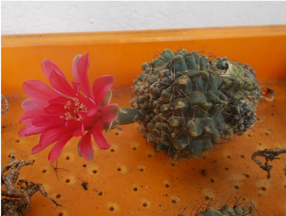
“Look Ma, no soil!” The flower developed normally and opened normally, over 2 weeks after the specimen was taken out of its pot. (November 2017)

A note on nappy liners: Cheap nappy liners made of non-woven fabric is an excellent soil barrier for cacti in plastic pots 14 . They last a long time and I sometimes re-use them 15 . A regular paper separator or barrier will decompose in the same time frame. Try not to use old paper (especially for anything to do with seedlings) – they tend to turn moldy very quickly.