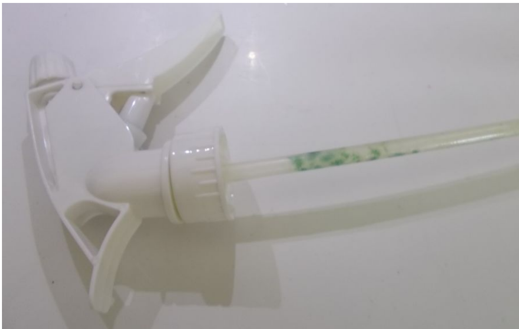
Healthy algae in the tube of a spray bottle. (2019)

For any other mineral micronutrient needed by the cactus plants, we can supply it via scoria or pumice breaking down in the soil mix. As for pH, I have pH paper strips but I rarely bother with pH testing. Is slight acidity important for cacti? Well, I got 7 flowers simultaneously on a GBald with coral in the soil mix, so I'm not overly concerned about pH.