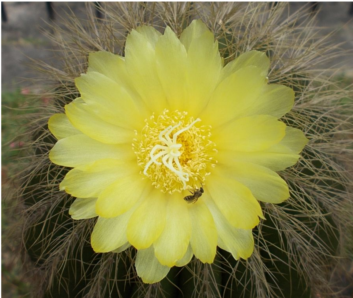
A bee on a PClav flower, February 2015.

Since February 2016, there was at least one cactus flower open in each month in my collection. From January 2020 to May 2020, there has been two months where one or more cactus flower was open for each day of the month. The specimens that flowered from January to May 2020 are: 4 PMags, 2 PClavs and 12 GBalds. The numbers of all flowers in those 5 months were: 28, 37, 35, 51 and 45. One doesn't need a huge cacti collection to reap some nice rewards.