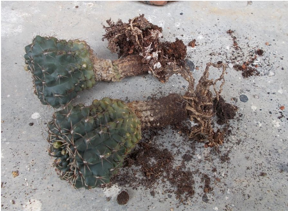
These two GBalds had just been taken out of their pots. Some perlite can be seen, but the smaller whitish bits are probably root mealybugs. (March 2017)

GBalds are a whole other ballgame compared to those large Parodias . In the picture above, you can see the typical look of the root systems of older GBald specimens. The soil mix was fairly rich. There are usually some thick anchor roots, while the thin fibrous roots easily crumbles away. It's not much to look at. Deep pots would be wasted on such fragile and weak root systems.