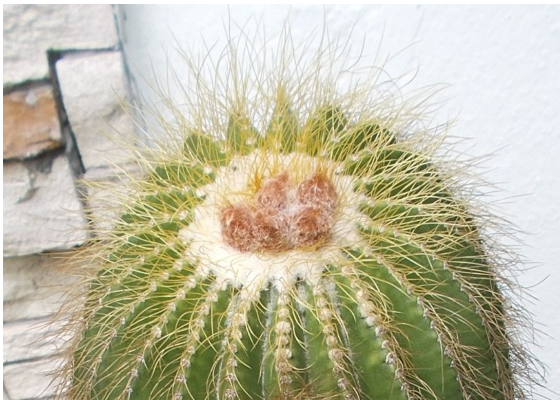
A lot of wool and many buds. Perhaps spraying with fortified water and fertilizer water had a much bigger effect than I expected. (January 2017)

That's it. Keep your plants supplied with minerals and they should do pretty well. Some growers however may have a strong preference for natural or organic fertilizers. A mineral soil mix will be necessary. For organic fertilizers, watch out for that nitrogen content!