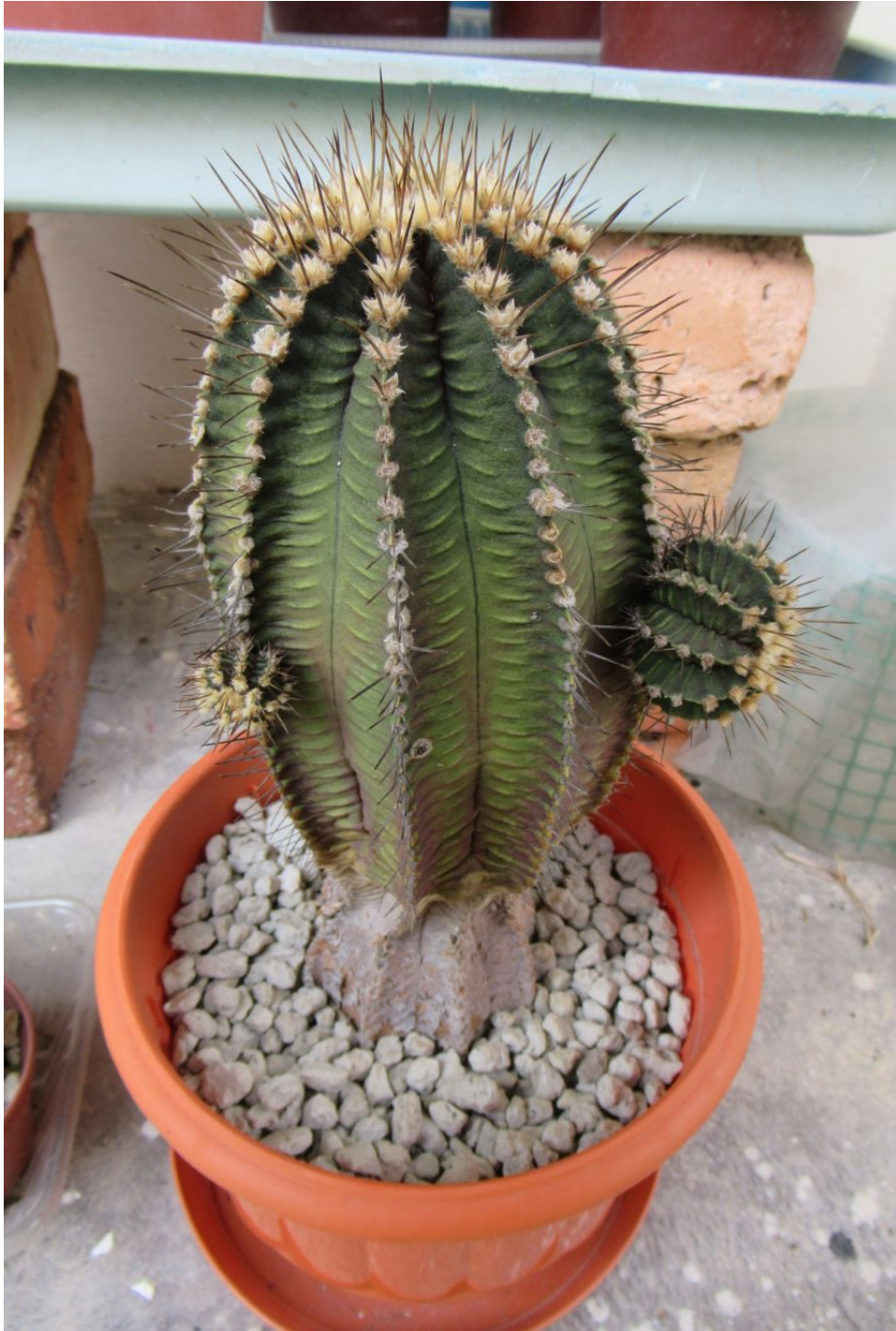
Fortified water keeps woody stems away! (January 2020)

I haven't seen any issues with the use of tap water. Some growers think that chlorinated water tends to weaken the lower stems of cacti or turn them woody. I no longer believe that. These days I would point the finger at mineral deficiency. With fortified water, you eliminate mineral deficiency. And for GBalds (and possibly other species of Gymnocalycium ) the problem is the life cycle of the plant – it needs to shrink the lower stem to pull itself into the ground.