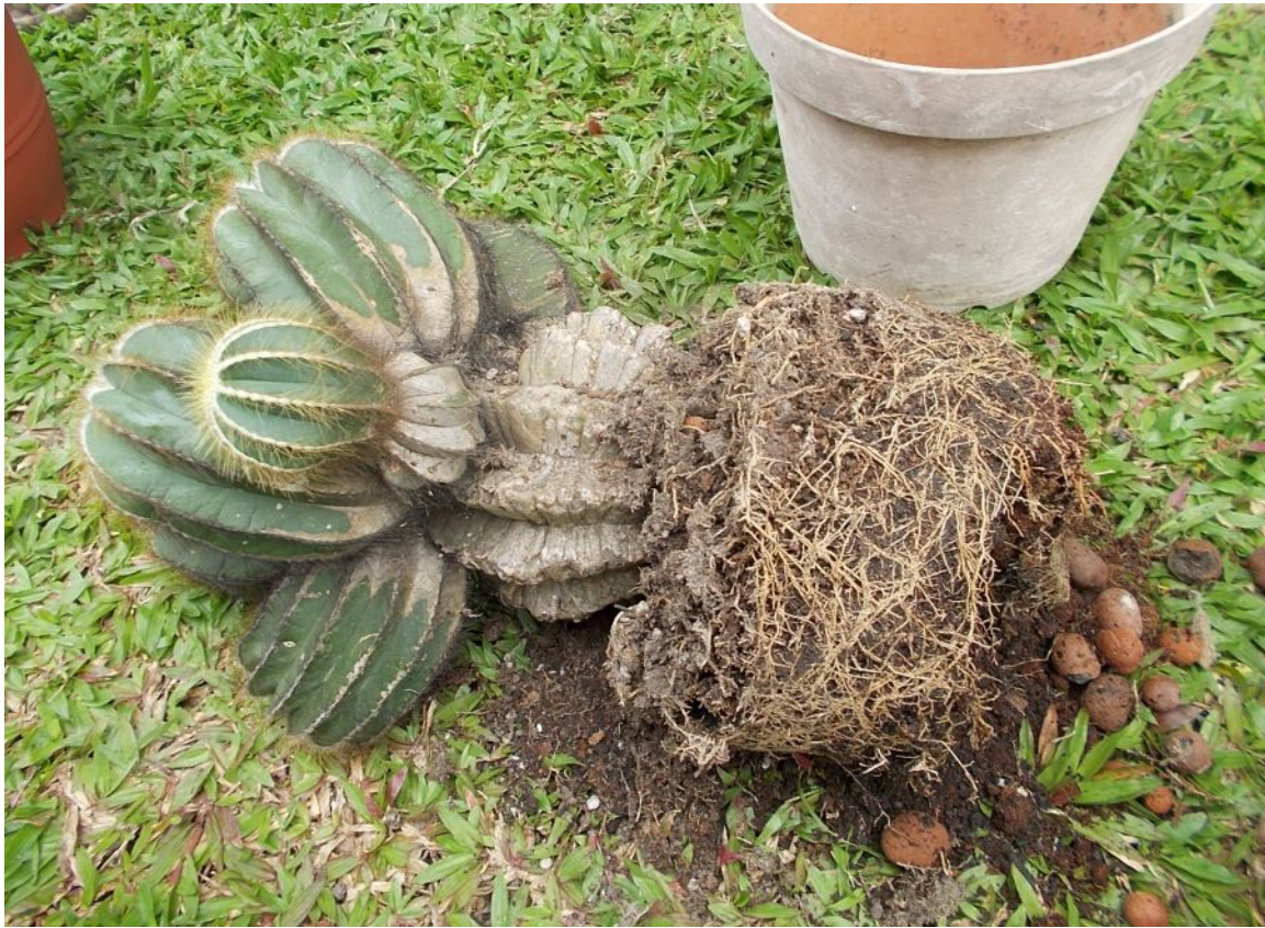
Repotting the big PMag. It had just been taken out of the pot. This is the side that faces the wall 9 . The woody lower stem is caused by growing it outdoors in the sun and rain. (April 2017)

The trio of larger species – MGeo, PMag and PClav – are not fussy about soil mixes. The larger PMag and PClav specimens produced many flowers even with pretty regular black soil plus burnt soil 10 plus some Leca balls. When a specimen stops producing flowers and there is no new growth for a long time, then it is pot-bound and you should repot the specimen. If it is not repotted, there will be no flowers and no growth – the plant may be ‘stuck’ forever.