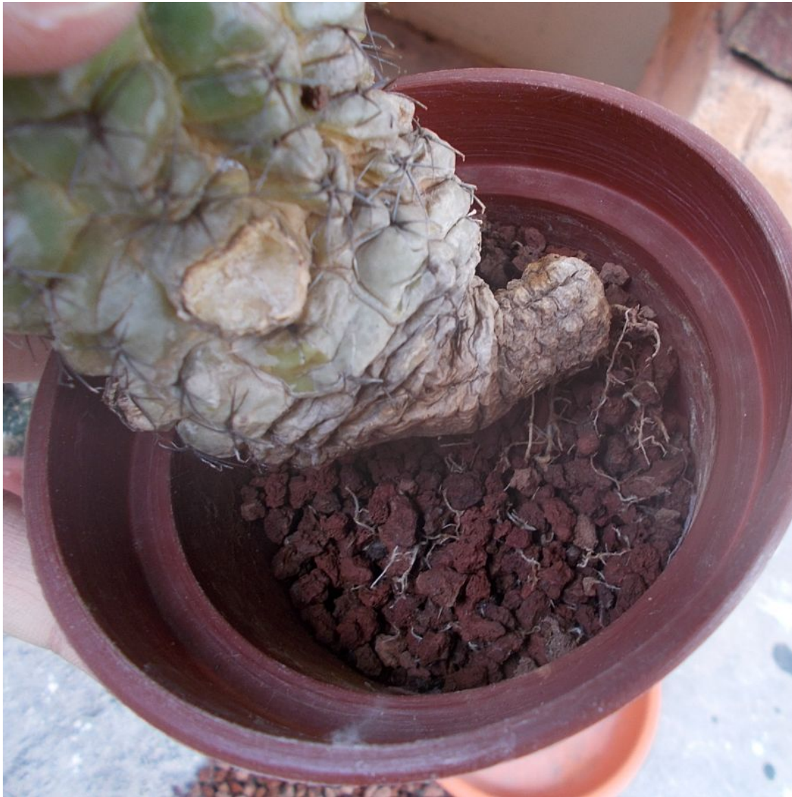
Fibrous roots were holding some of the scoria in place. The roots are kind of like glue – the pot tipped over but the scoria still in the pot was held fast. (June 2019)

So far, I like the performance of specimens in this soil mix. Healthy GBalds grow almost non-stop in the tropics and mature specimens are often willing to flower. Some appear to be growing while at the same time shrinking their lower stem. They appear to be healthy. It's not possible to compare this to the behaviour of specimens in habitat because all the material that I have seen involves researchers going on expeditions. There is nothing that I can find that involves an extended study of GBalds in habitat. Caring for GBald specimens is far from a solved problem.