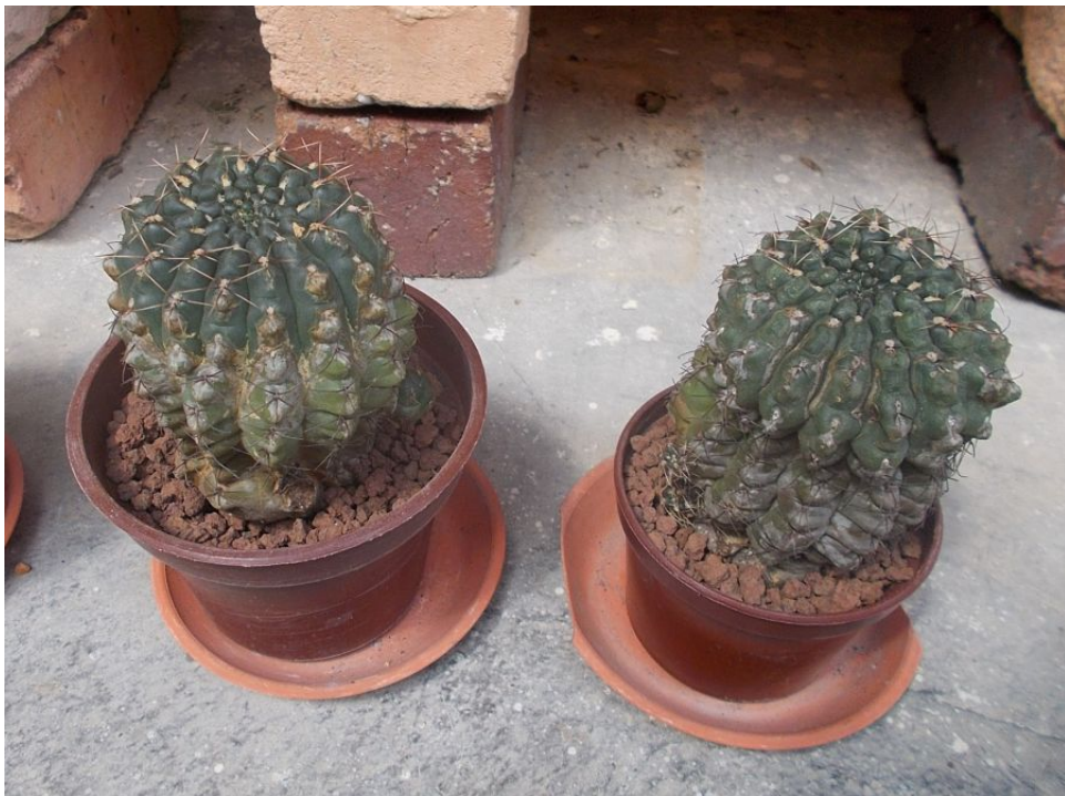
Just after repotting, February 2019.