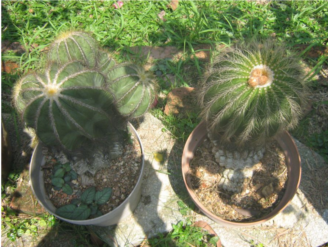
The big PMag and the big PClav in an unsheltered location, July 2013. There are three flower buds on the big PClav.

If you have good-sized PMag, PClav or MGeo, you can opt to be lazy and just leave them out in the sun and rain. The two specimens in the above picture have been exposed to the elements for several years at the time the picture was taken. They did flower on occasion, but less than once a year. The soil mix is primarily burnt soil, that fired clay stuff – almost zero organics, for safety.