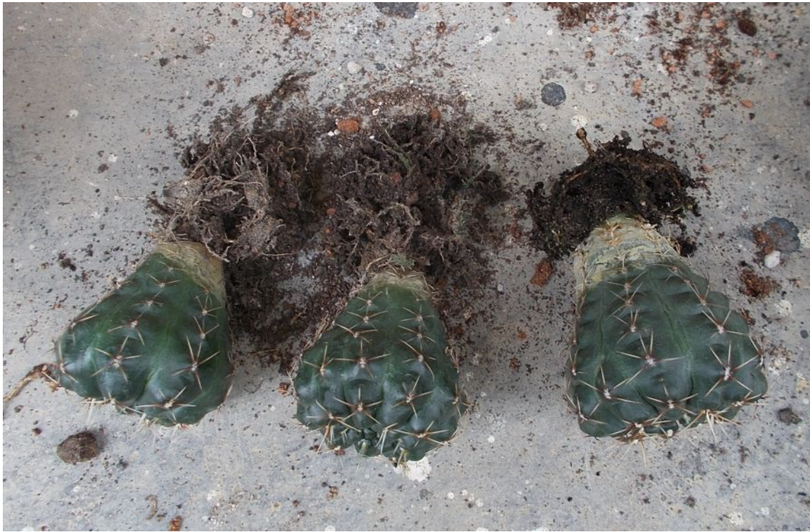
Three GBald offsets that were rooted at about the same time. By April 2020, each of them has produced at least one flower. (March 2017)

These root systems look different (picture above) because the specimens haven't shrunk their lower stems yet. These three specimens are probably the same ones that were pictured at the end of the chapter on Useful Concepts. They are rooted offsets that haven't stopped growing. Only fibrous roots are visible. One of the three was pictured later with a mild scale insect infestation in October 2019 in the chapter on Battling Bugs. By that time, the lower part of the plant has clearly shrunk. Anchor roots are probably more prominent on older GBald specimens.