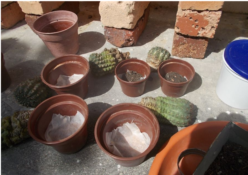
GBald specimens being repotted in February 2019. No roots can be seen because the roots were removed – I wanted the plants to grow new roots. Burnt soil has been sandwiched between pieces of cheap nappy liner. Some black soil mix has been added to the smaller two pots. Later, a top layer of scoria will be added.