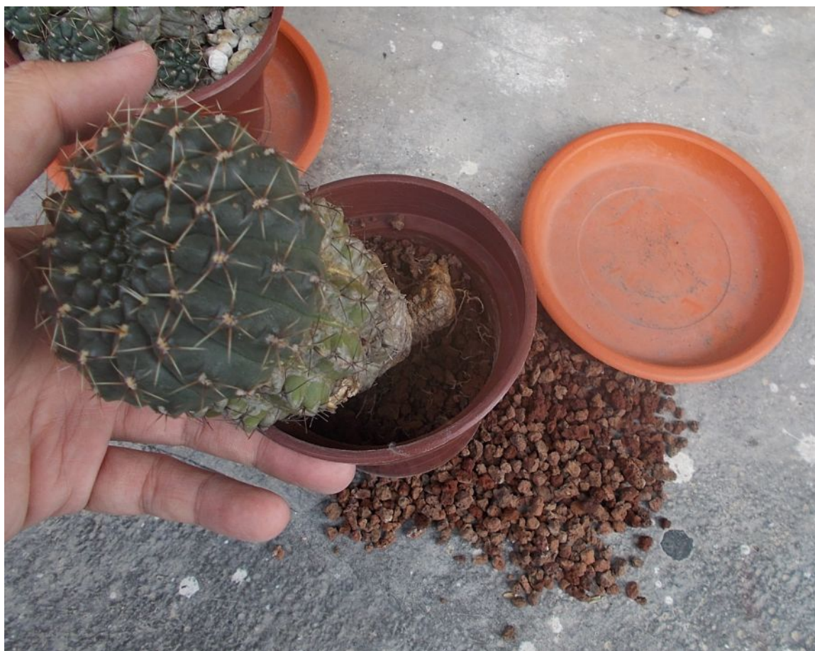
Four months later, there has been significant new growth with healthy spines. This pot was tipped over when I stepped on the saucer while trying to take pictures. The inside of the pot can be seen in detail in the next picture. (June 2019)

In the following two pictures, you can see that a lot of fibrous roots have grown since the 4 months after it was repotted. The roots always look too fragile to me, but the specimen is growing strongly and has nice spines. A healthy specimen with good spines means successful care and potentially flowers. If spines are weak but growth is strong, it may mean that the plant is being over-fed.