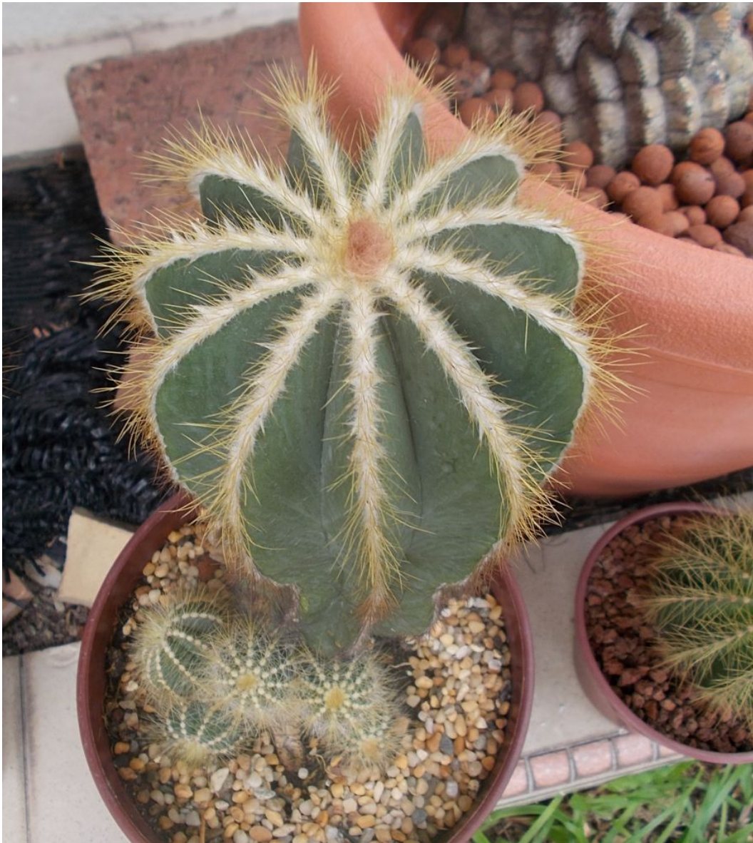
In my picture archives, this is PMag 3rd, the third of my current crop of PMags that has flowered. This was its first ever flower bud. (September 2019)

When a PMag matures and becomes all woolly, such as the one in the picture above, it often produces a number of offsets at the base of the specimen. These offsets can be detached easily for propagation purposes. A large detached offset will grow faster than a small one. If you don't remove the offsets, the single PMag stem will turn into a cluster of stems.