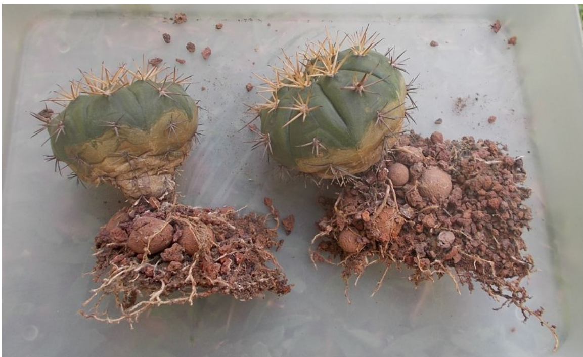
The two specimens after removal from the tray. A lot of scoria and many LECA balls have stuck fast onto both root systems. (September 2019)