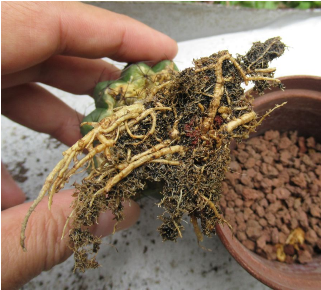
A closeup view of the cleaned-up roots of the smaller specimen. (September 2020)