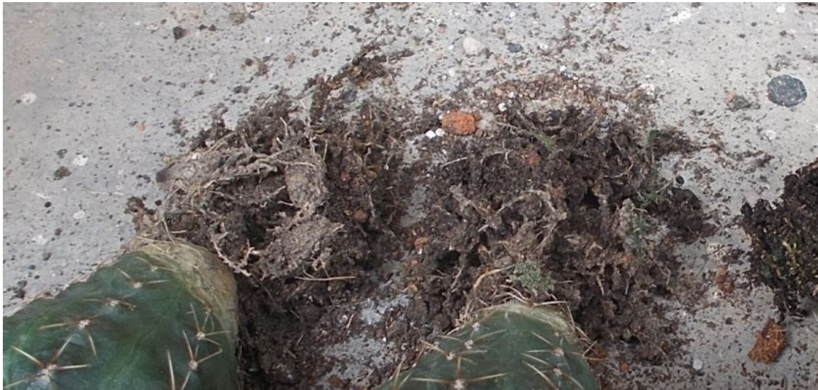
GBalds roots grown in soil look fibrous and fragile. (March 2017)