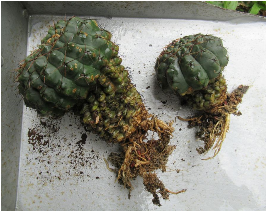
Two GBalds wet after a bit of cleaning. (September 2020)