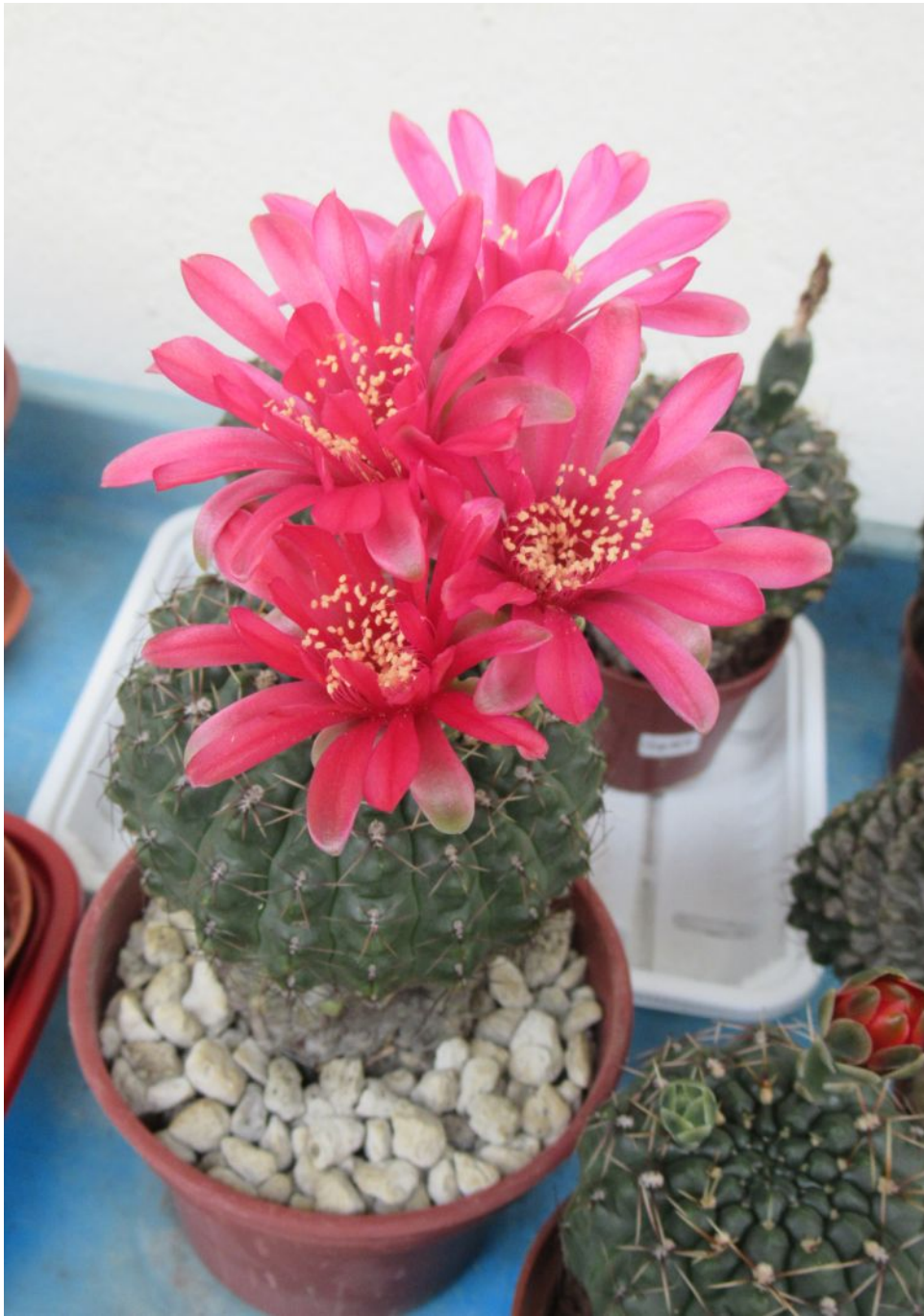
The two non-crested GBalds wasted no time after repotting. Here they are with flowers (the smaller one is at the lower right), just under 2 months later. (Nov 2020)

Growing GBalds in rocks – specifically porous rocks such as scoria – is great for their root systems. Porous rocks provide the right kind of airy moisture cycling environment for strong roots to flourish. But when limited resources are put into growing roots, stem growth slows and flowers are few or non-existent. Better feeding can probably improve matters and make a balanced growth strategy more viable. But if we want lots and lots of flowers, then a phased scheme with different rocky mixes ought to be worth trying.