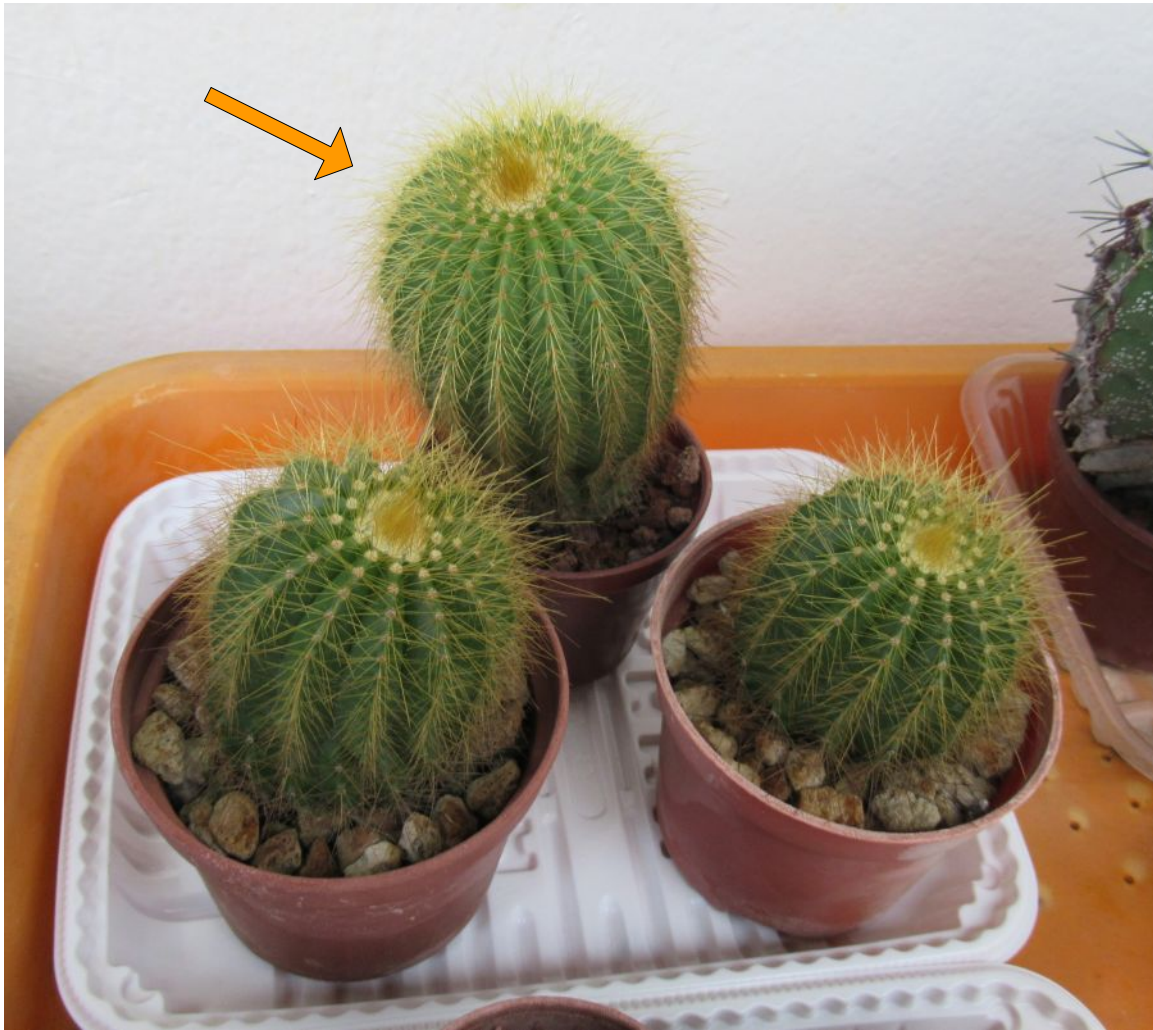
The PClav specimen (arrow) about 11 months later, in August 2020, still in its 2½ inch plastic pot. I think more scoria helps to produce long and dense spines.

PClav offsets are very easy to grow. Avoid attracting fungus gnats by not having wet organic matter around, then spray water to remove dust and deter spider mites and you'll be okay. Layers of pure scoria in the soil mix will absorb some water so that any soil isn't saturated for too long. The water retained in the porous scoria will provide moist conditions for roots to thrive. It's also a rocky mix, so there is good air exchange.