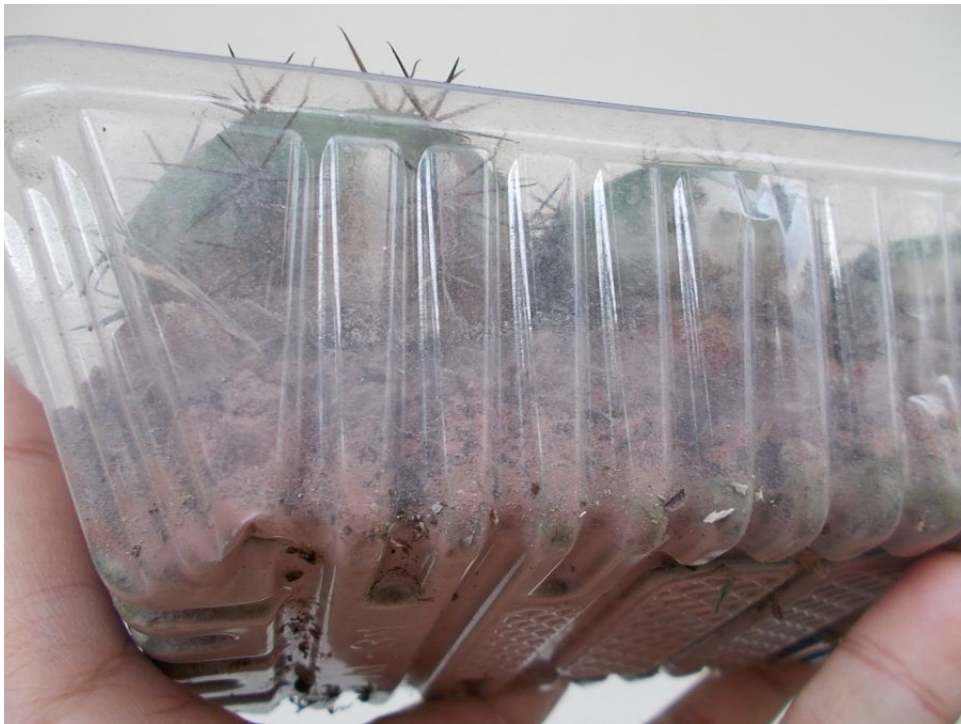
Closeup of the underside of the clear tray. Scoria powder has accumulated at the bottom. (March 2019)