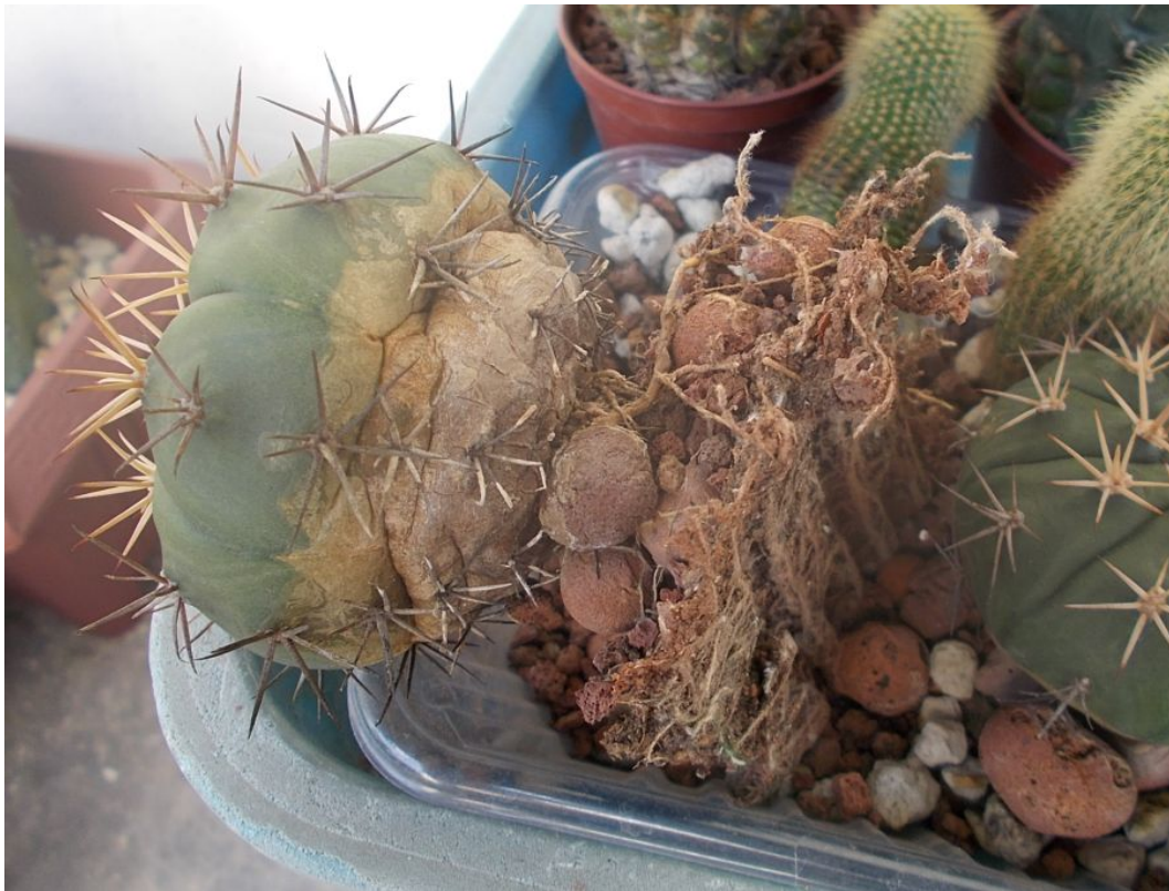
The same GStella, showing the bottom root mat. (September 2019)