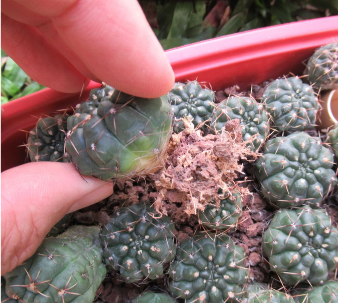
Removing several rooted GBald offsets for planting into individual pots, August 2020. These have been growing in the disposable bento tray since March 2019.

The following piece is part of a collection of writings published on the Practical Small Cacti Malaysia site.