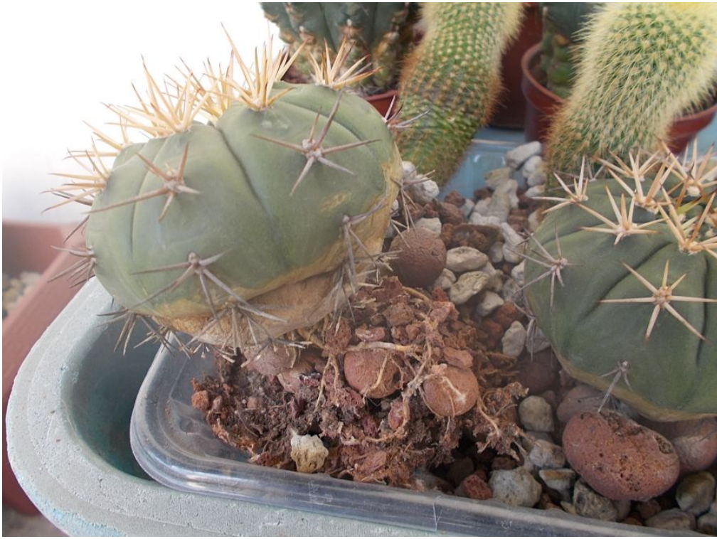
One GStella, lifted out of the tray. (September 2019)