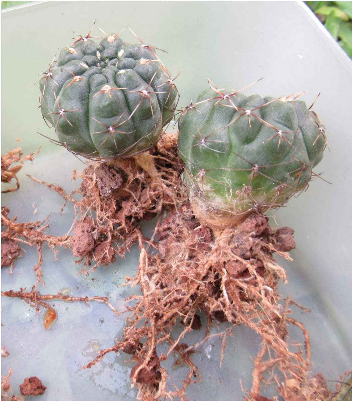
A closeup view of two of the GBald specimens. (August 2020)

As you can see in the picture above, each small GBald has one main root that is tapering, almost like a tap root. I don't see such roots on GBalds in regular soil. There are a lot of branches and the finer roots have stuck onto scoria and glued everything together into a clump of roots and rocks.