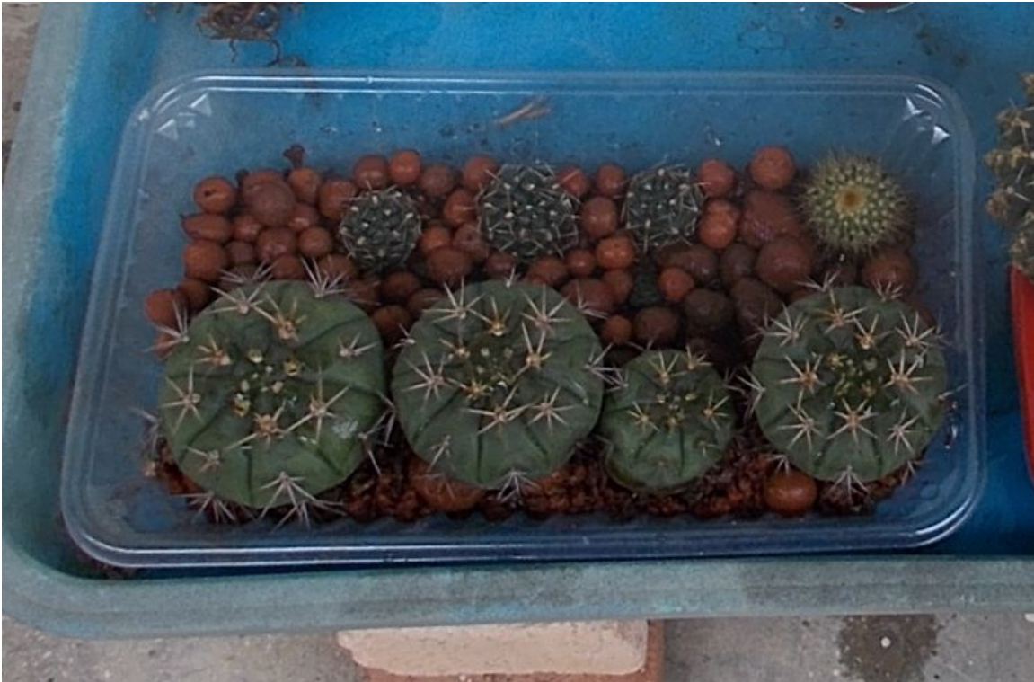
The clear tray after spraying with water, November 2018.

Before late 2018, I had harvested many GBald offsets in order to grow them indoors, near a window. As discussed in previous chapters, this did not work out well, because scale insects still managed to get at them through a window with a mosquito screen, thanks to the wind. I also had occasional problems with fungus gnats. In addition, the indoor GBald specimens grew long and soft stems. As such, it wasn't a good solution for propagating GBalds via offsets.