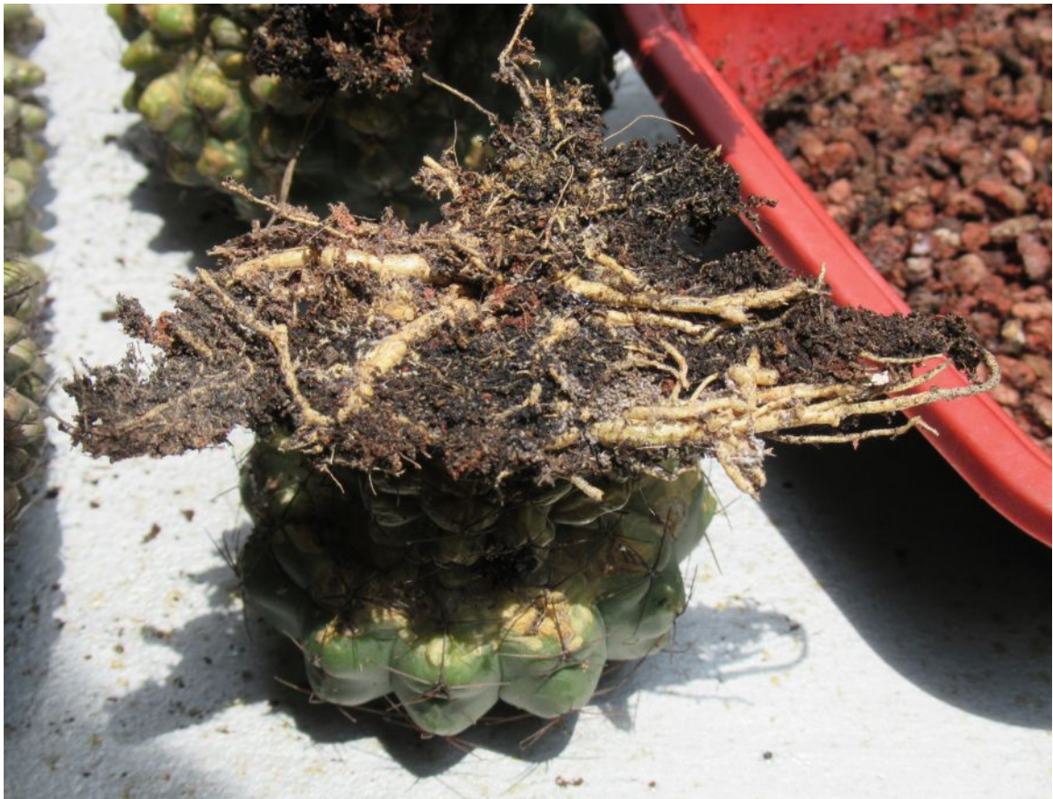
The root system of the small GBald. (September 2020)