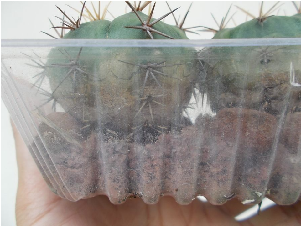
Side closeup view of the clear tray. (March 2019)