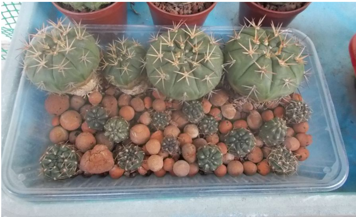
In March 2019, just before the rooted GBald offsets were moved to a new tray.