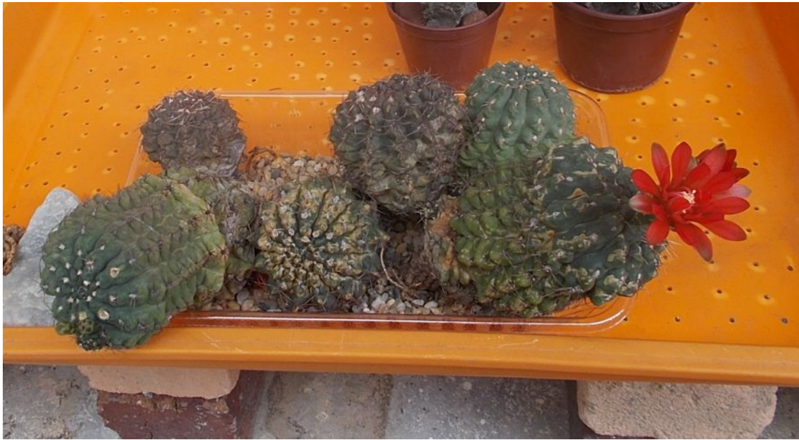
A clear plastic tray with no drainage, filled with pebbles. A tray of pebbles wasn't a very good medium for growing GBalds. (May 2018)