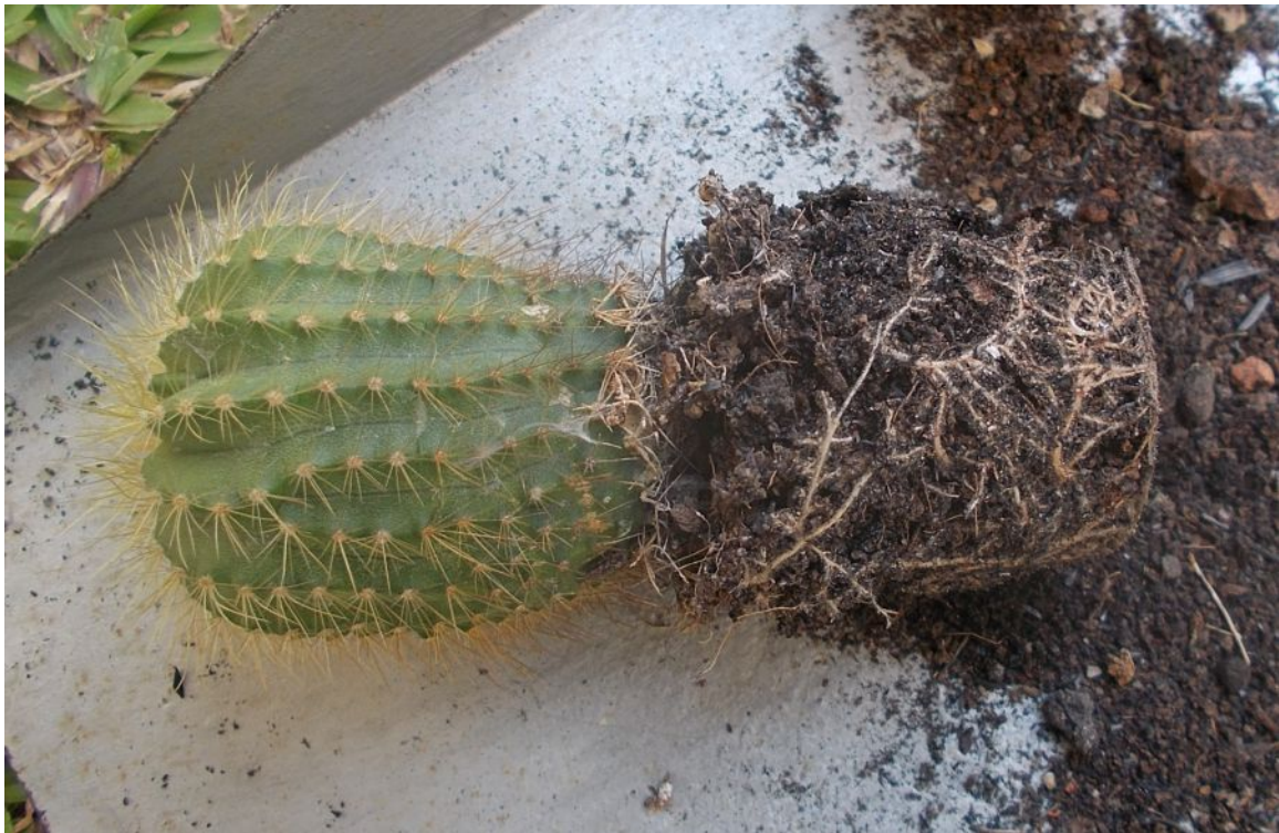
The specimen after being pulled out of its pot. It's fairly healthy although in 2019 I sprayed my plants only once or twice a week. As such, this specimen was not getting ideal amounts of water and nutrients for growth. It was later put into a 2½ inch pot in a layered soil mix with lots of scoria. (September 2019)