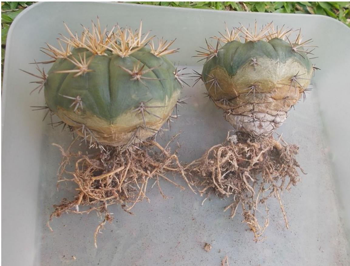
The root systems were trimmed and largely cleaned of rocks to force both specimens to regrow new roots in their new pots. (September 2019)