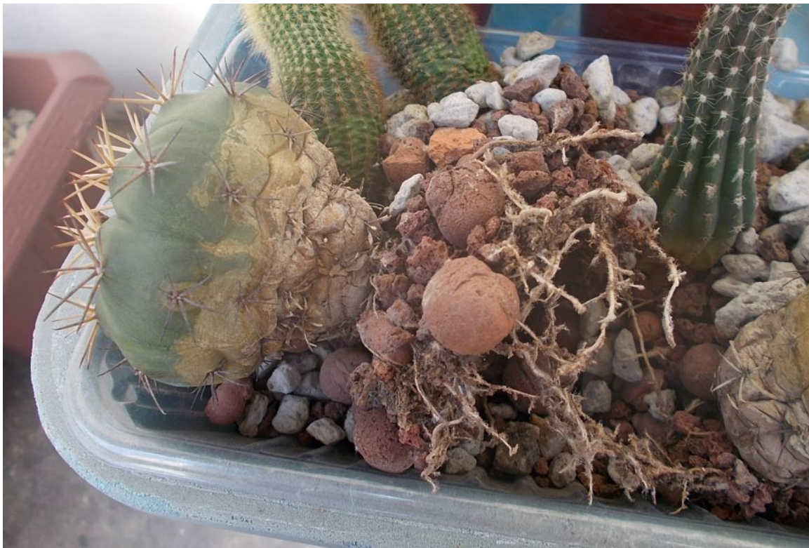
Another view, showing long root strands that stretched quite far. (September 2019)