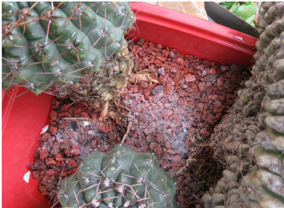
Wispy webbing under the two rocks – probably spider mite webs. (September 2020)

One problem that arose was spider mites hiding under the two large rocks. Below is a picture of what is probably spider mite webbing, seen after the rocks were removed. So spider mites could shelter from sprays of water under the rocks. The rocks act as weights on the scoria so there is some pressure on the roots – it was supposed to simulate cacti growing in gaps between rocks.