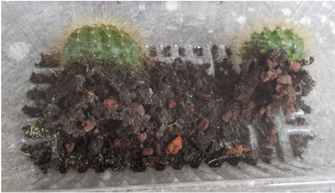
A closeup side view of the two specimens. Subjectively, their roots do not look any different from PClav offsets rooted in a soil mix. (May 2019)