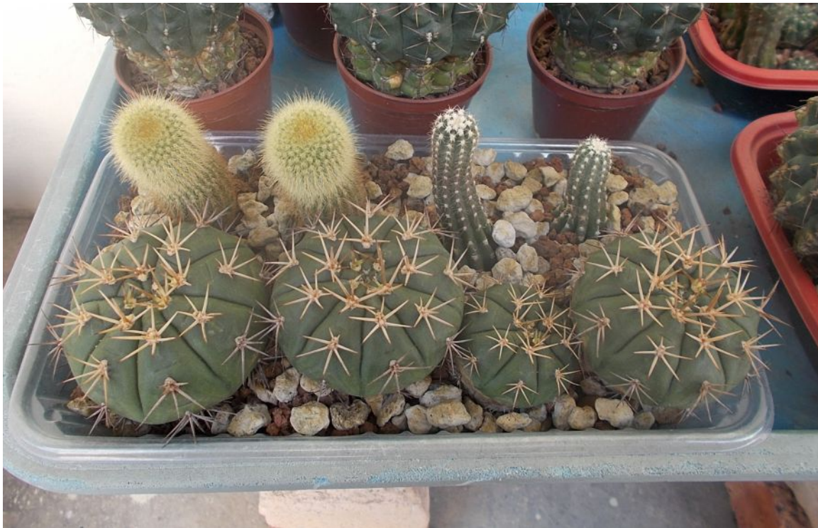
The GStellas (bottom row) with very nice newer spines. (September 2019)

After 15 months in the clear tray (picture above), the GStella specimens were running out of space. All four have grown, with strong white spines on new growth. In September 2019, two of the four were removed from the tray to be placed into regular plastic pots.