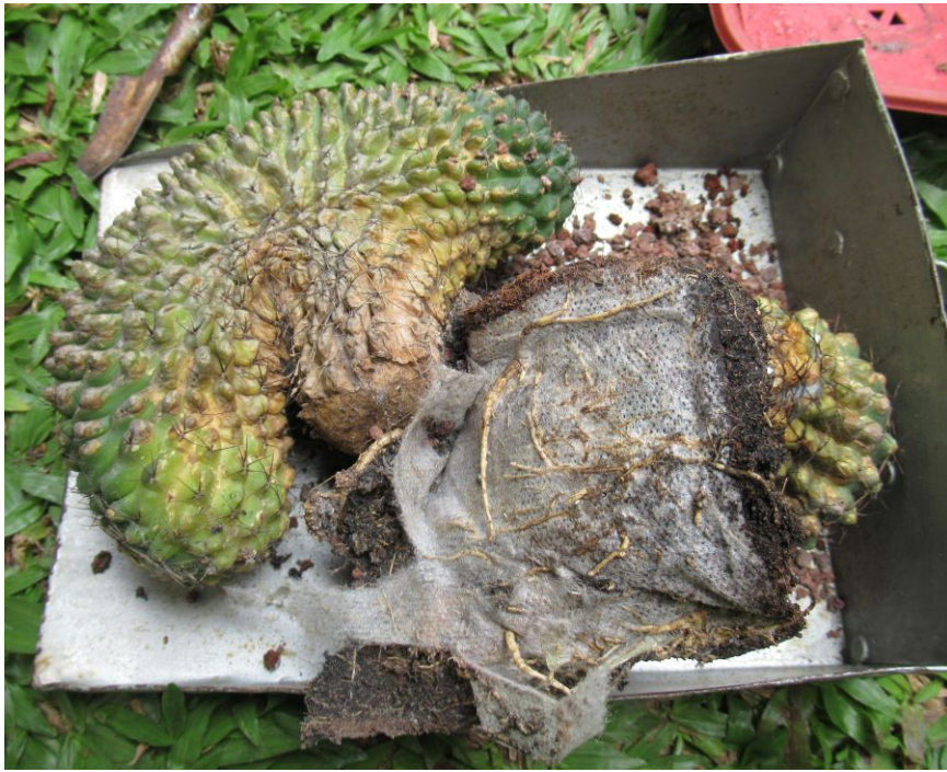
Lots of thick roots have penetrated the nappy liner. (September 2020)