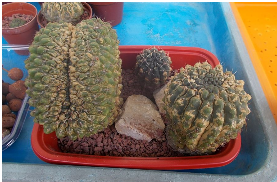
This was how they looked at the start of the experiment. (April 2018)