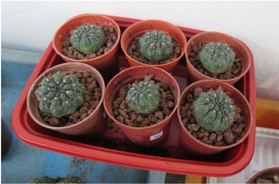
The six GBald specimens in their pots. (August 2020)