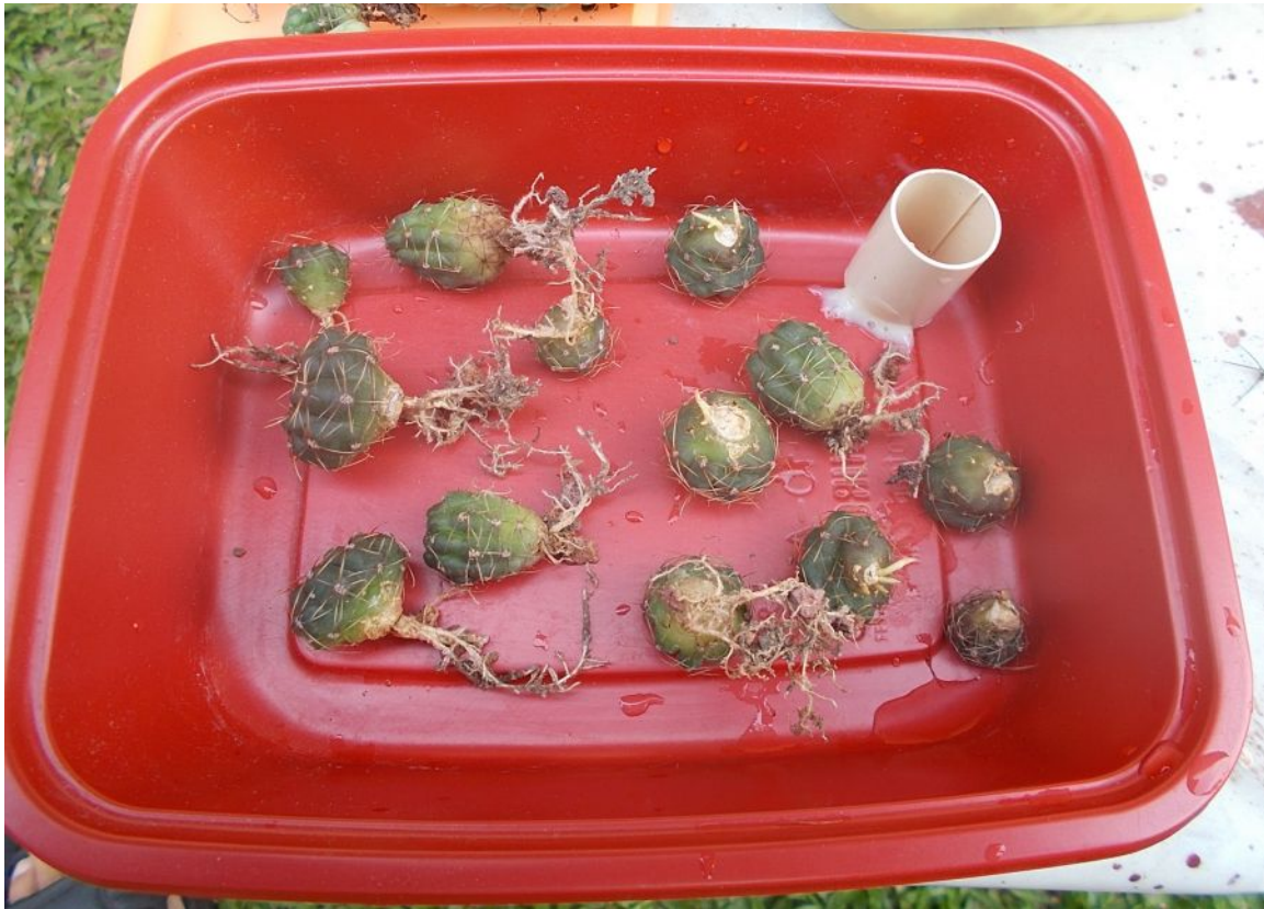
Rooted GBalds after removal from the clear tray. Three of them look somewhat cylindrical because the three had been indoors for a while. (March 2019)

The above picture and the pictures on the next page shows the improved setup. This is a disposable bento container and there are still no drainage holes. Large LECA balls were a hindrance for small GBald offsets, so they are not used here. Bits of sphagnum moss were placed with the roots of each small specimen so that the roots are moist for a longer period of time. Soria is porous and absorbs water; it also freely drains water. Therefore, wet conditions are largely avoided.