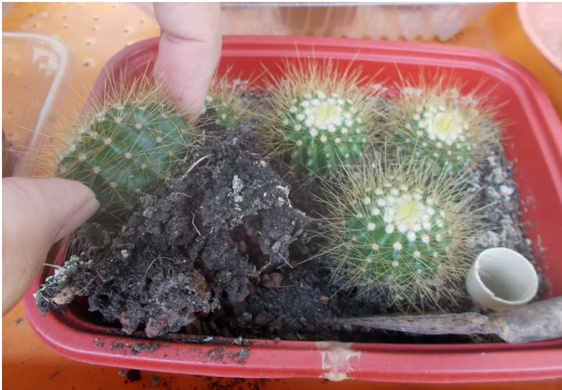
Removing a rooted PClav offset from its tray. (May 2019)

As far as growing cacti in rocks is concerned, this isn't a particularly good experiment, because there was a layer of soil on top of a layer of scoria. Also, these specimens did not get optimal amounts of water or nutrients. PClavs are easy to grow, and I wasn't in a hurry to expand my collection of PClav specimens. I was more interested in improving the health of my GBalds.