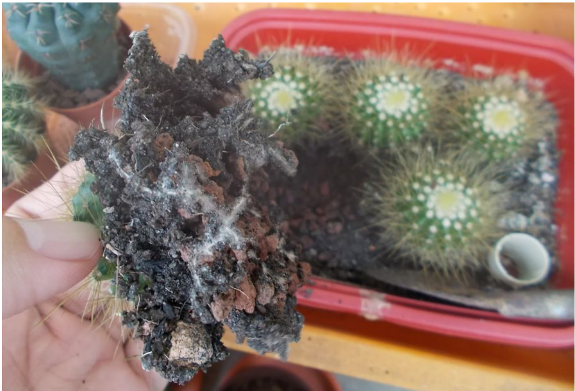
The roots were clinging to scoria along the bottom of the tray. (May 2019)