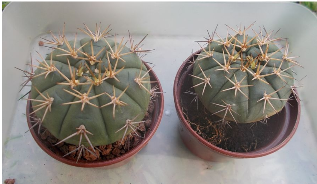
Both specimens were put in layered mix. The middle layer of soil can be seen in the pot at right – the top scoria layer has not been added yet. (September 2019)