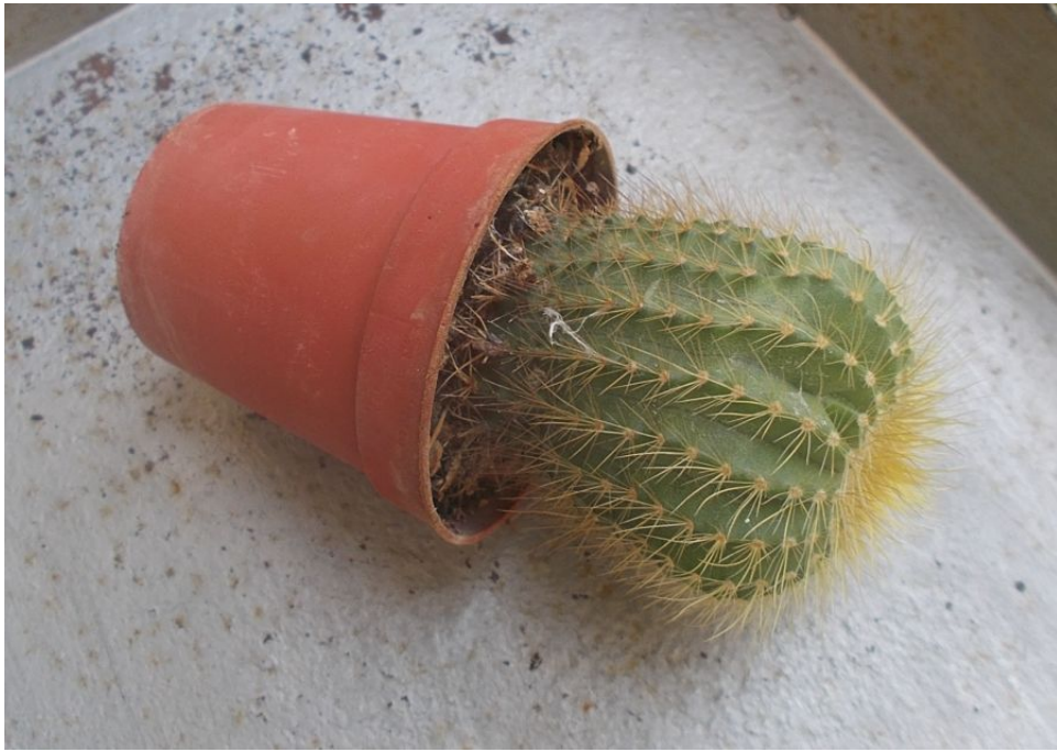
The specimen in September 2019, after about 8 months of growth.