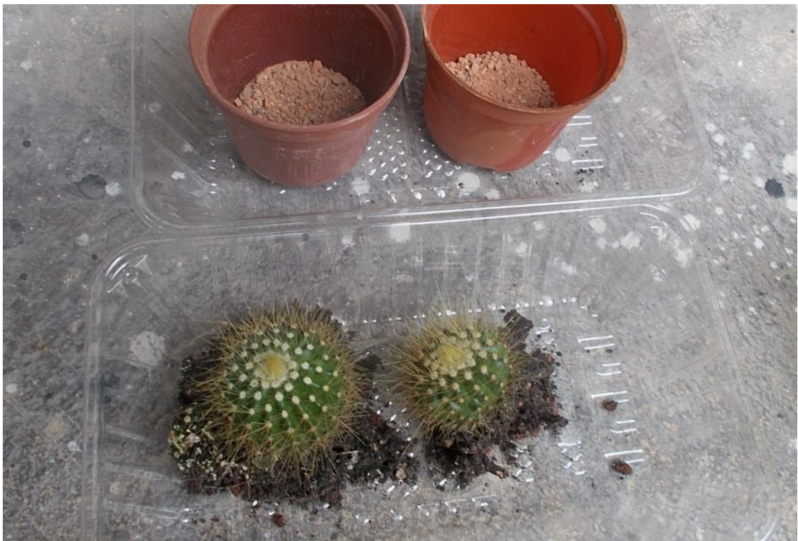
Preparing to pot up two PClavs. (May 2019)