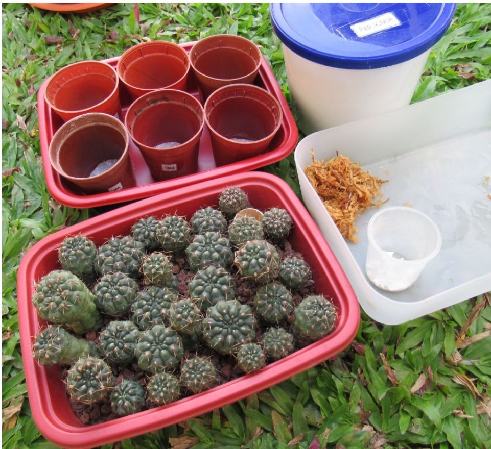
Preparing to transplant some GBalds. (August 2020)