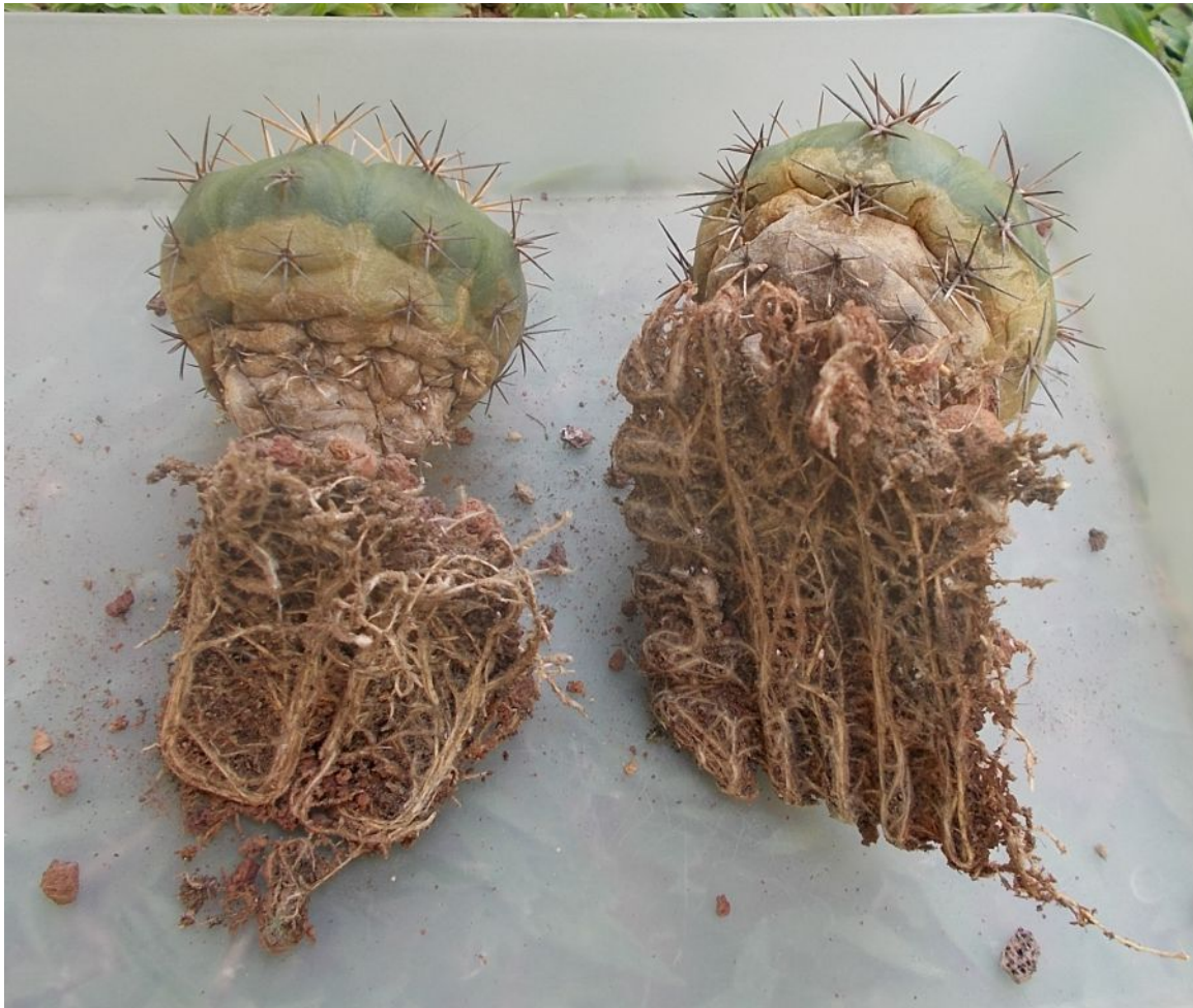
A bottom view of the root mats of the two GStella specimens. (September 2019)

As you can see in the picture above, the root system of the GStella at left circulated along the bottom of the tray, where it is moist longest. It appears that GStellas love a very rocky mix. Specimens in the clear plastic tray were sprayed only once or twice a week during this period. So even with short bursts of moisture, the GStellas were able to maintain a strong, extensive root system.