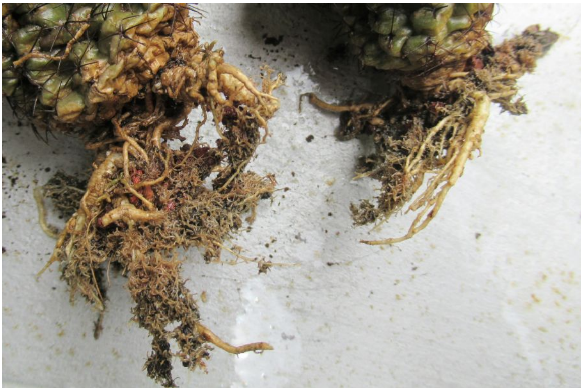
The nappy liner probably led to a dense thicket of short roots. (September 2020)