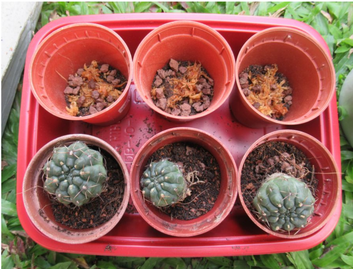
Potting up the GBald specimens. Sphagnum moss was placed near the bottom of the pots to encourage roots to grow down to reach moisture. The bottom three pots have had the middle layer of soil (mixed with scoria) added. A layer of scoria will be added as a top layer, so in theory no wet soil will ever touch the stems. (August 2020)