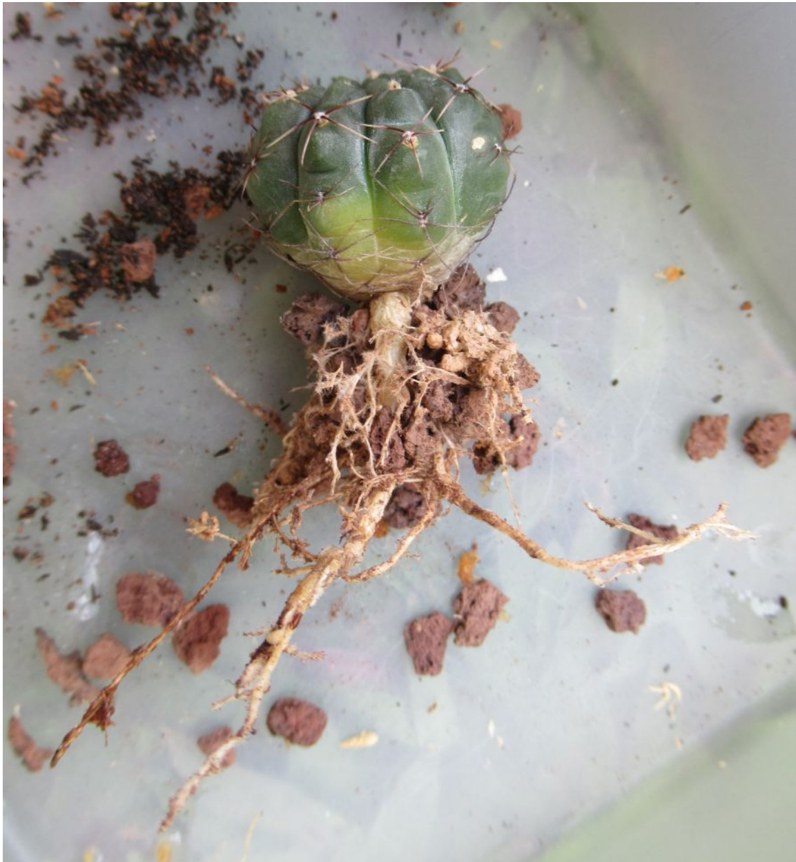
A closeup view of the long, tapering root system of one specimen. (August 2020)

A GBald with a strong tap root may prove to be healthier than a GBald with a lot of fragile fibrous roots. We shall see; these six specimens will be the guinea pigs. As of October 2020, they are growing strongly and steadily (see pictures on the next page.) After 2 months, roots have already penetrated the nappy liners at the bottom of the pots. Since I have one GBald in a 2 inch pot that is flowering steadily since June 2020, these specimens will be left to grow in their 2 inch pots for as long as possible.