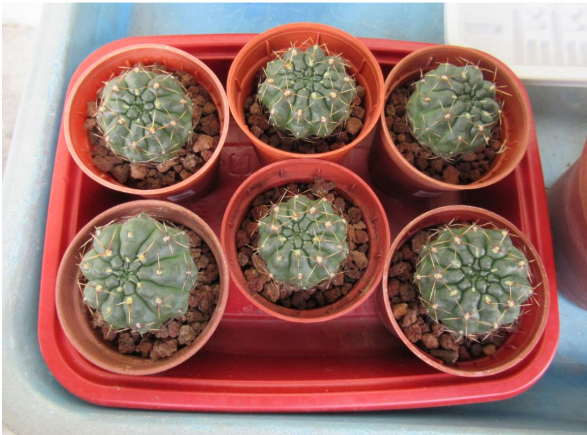
The six GBald specimens after 2 months, at the end of October 2020. The pots in the upper row have extra eggshell flakes. All six specimens are growing well.