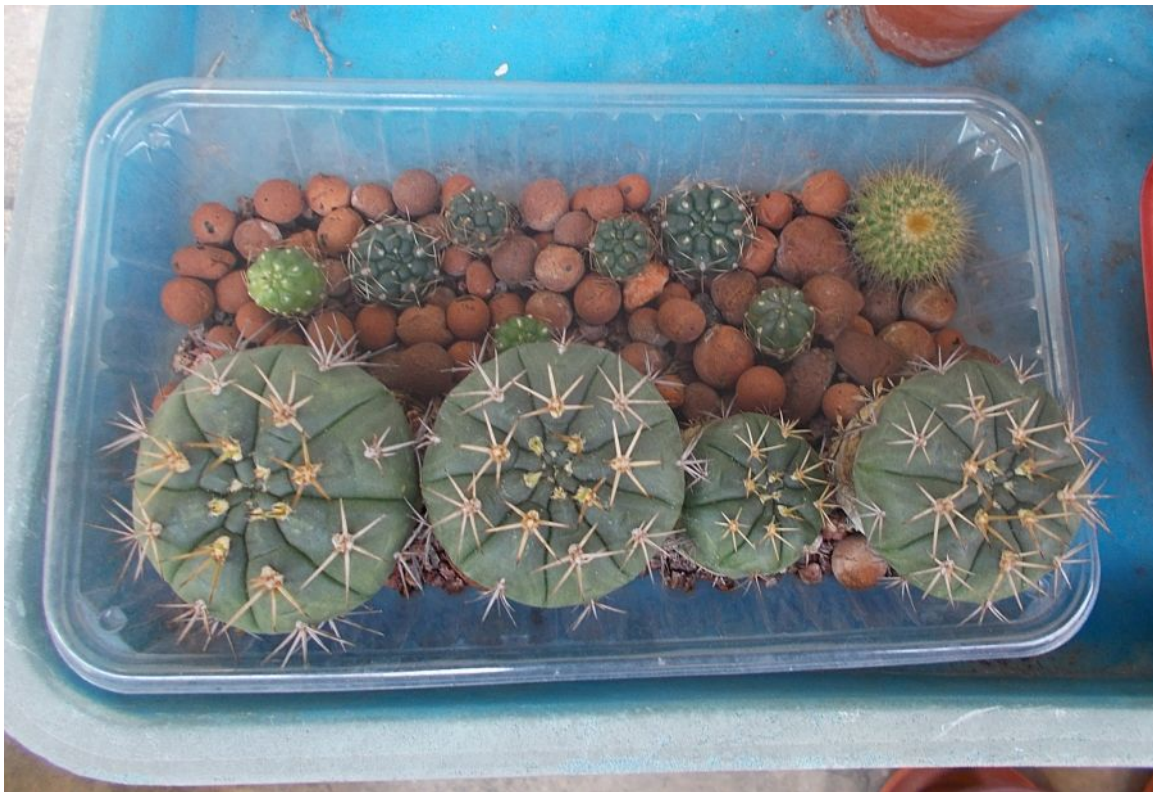
The tray in January 2019, with more GBald offsets added. The bottom three GBalds are of a lighter shade of green; these were probably from indoors.