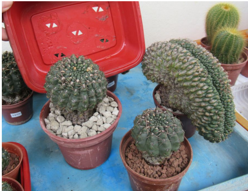
The three specimen potted up, with the old bento tray behind them. (Sep 2020)