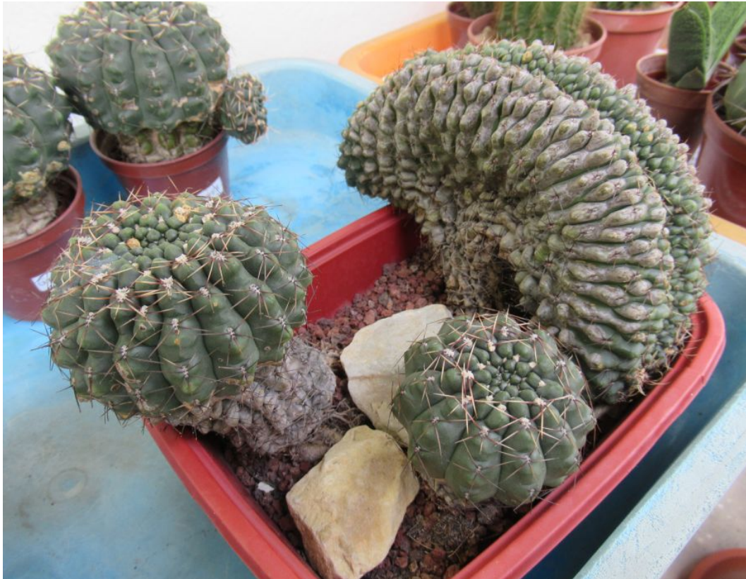
Three GBalds grown in scoria, after about 2½ years. (September 2020)