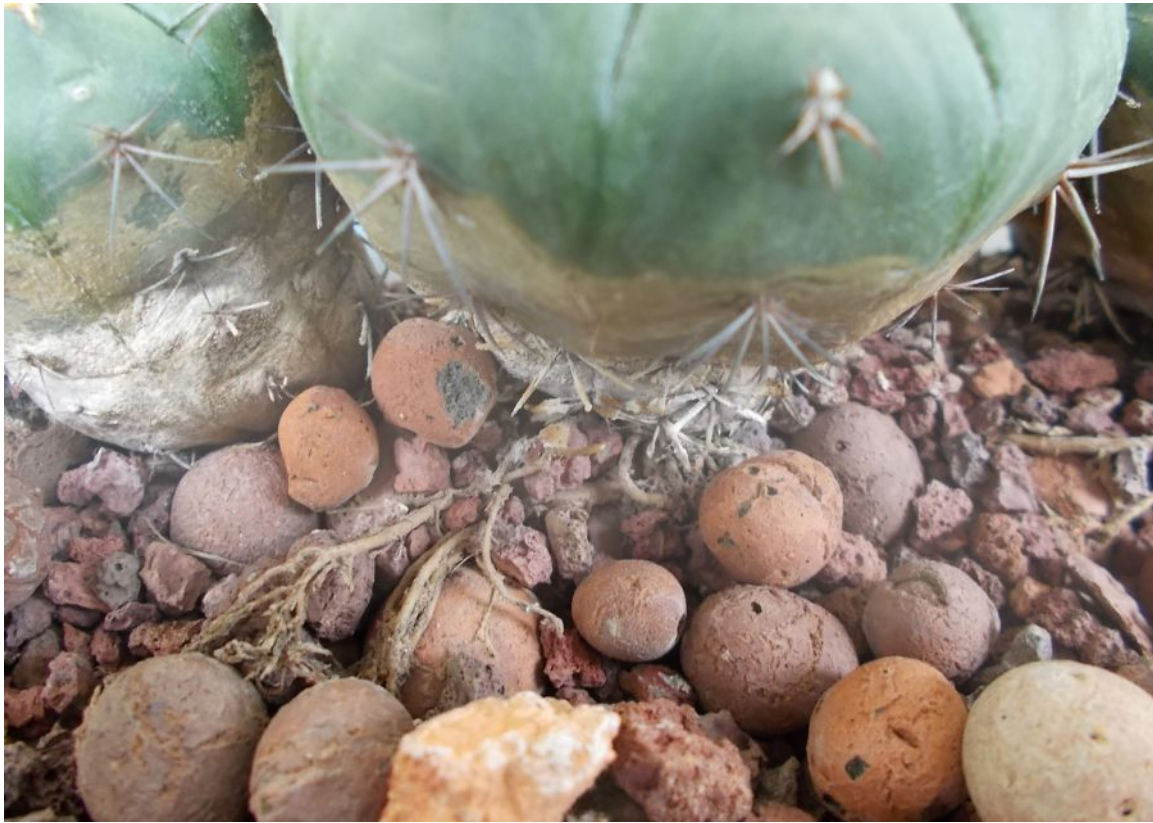
Closeup of one GStella specimen showing the thick roots in detail. (March 2019)

As you can see in the picture above, the GStella roots were thick and coarse. The upper part of the scoria dries faster, so the bulk of the roots actually grew along the bottom of the tray, where it is moist longest. In time, the scoria breaks down and produces a layer of rock powder at the bottom of the tray (see pictures on the next page.)