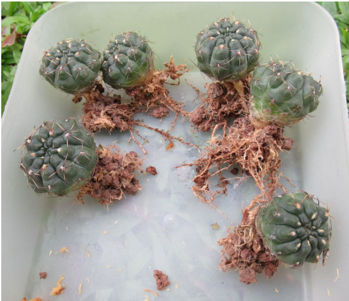
Small GBalds grown in scoria have fabulous roots. (August 2020)

Below are the six small GBalds that were removed from the bento tray. The root systems look fabulous. Many had one major root that look much like a tap root. I have never seen tap roots on GBalds that are grown in regular soil mixes. The roots were strong and tough, not soft and fragile. Most roots have grown onto scoria.