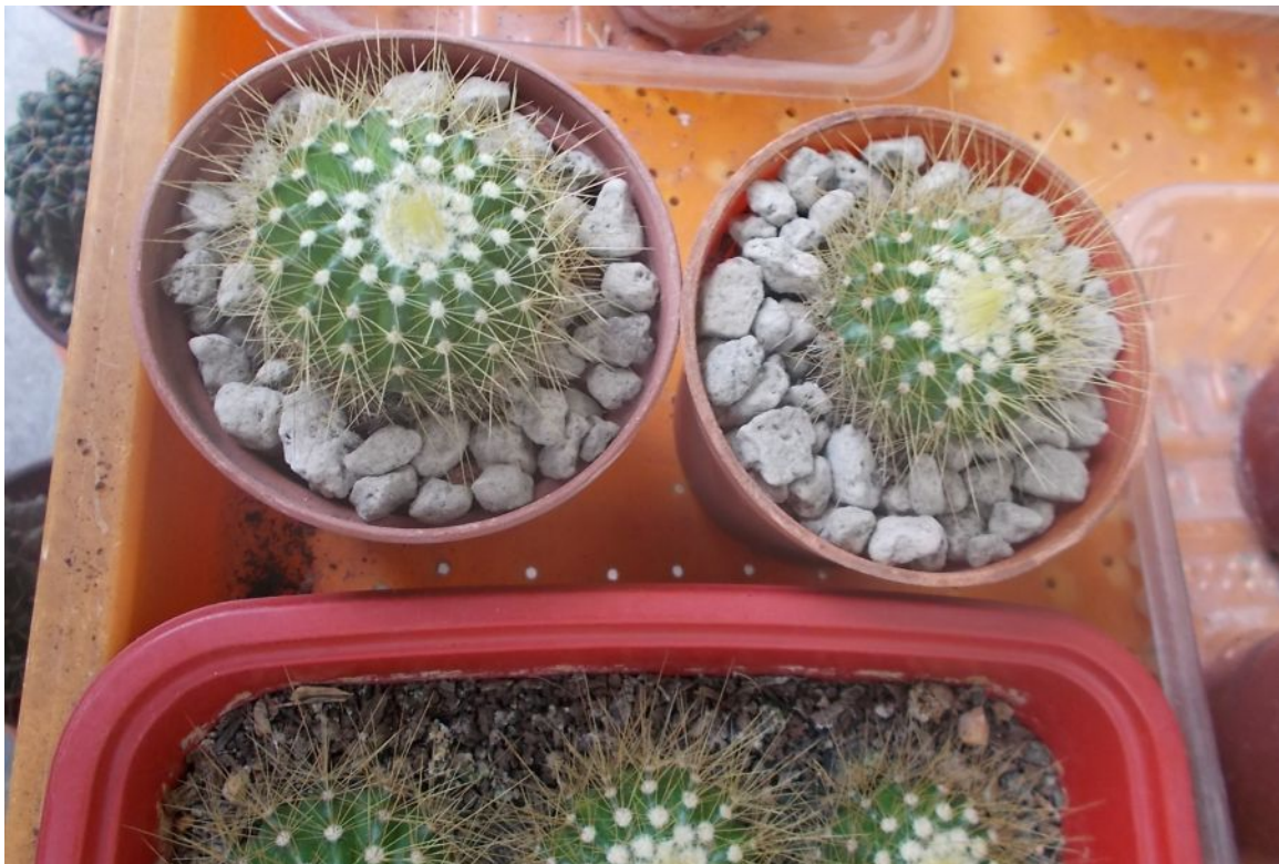
The two PClav specimens after potting up in May 2019. You can see them pictured 15 months later on page 7.