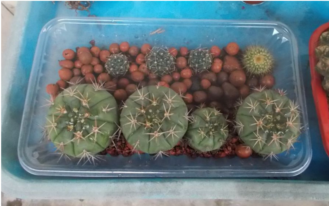
The GStellas looking plump and green in November 2018. The tray is wet, having just been sprayed. A few offsets were planted in the tray to let them root. In the upper right corner is a PClav offset from the big PClav. The other three are GBald offsets. One of the three GBald offsets failed due to rot because I sprayed too often. After reducing water sprays, I had no further problems with GBald offsets rotting.