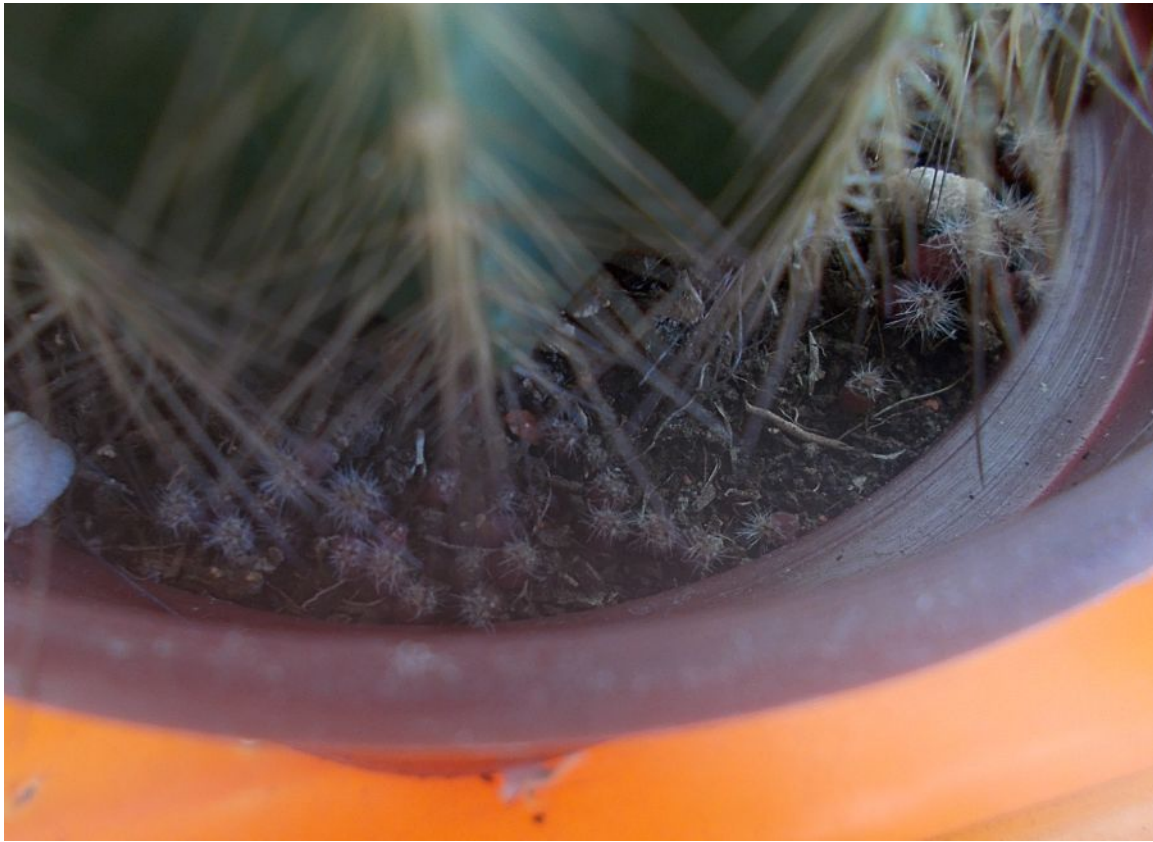
Closeup of the other pot. These are stressed cactus seedlings. (December 2018)

As seen in these pictures, tens of seedlings were found in two smaller PClav pots. These two PClavs were rooted offsets, and had been pushed to flower 2 . The smaller specimen has yet to flower at this time, while the larger specimen had already produced two flowers. This means the two specimens also got better care, and the pots were usually moist. Therefore seeds that spilled into these two pots were lucky.