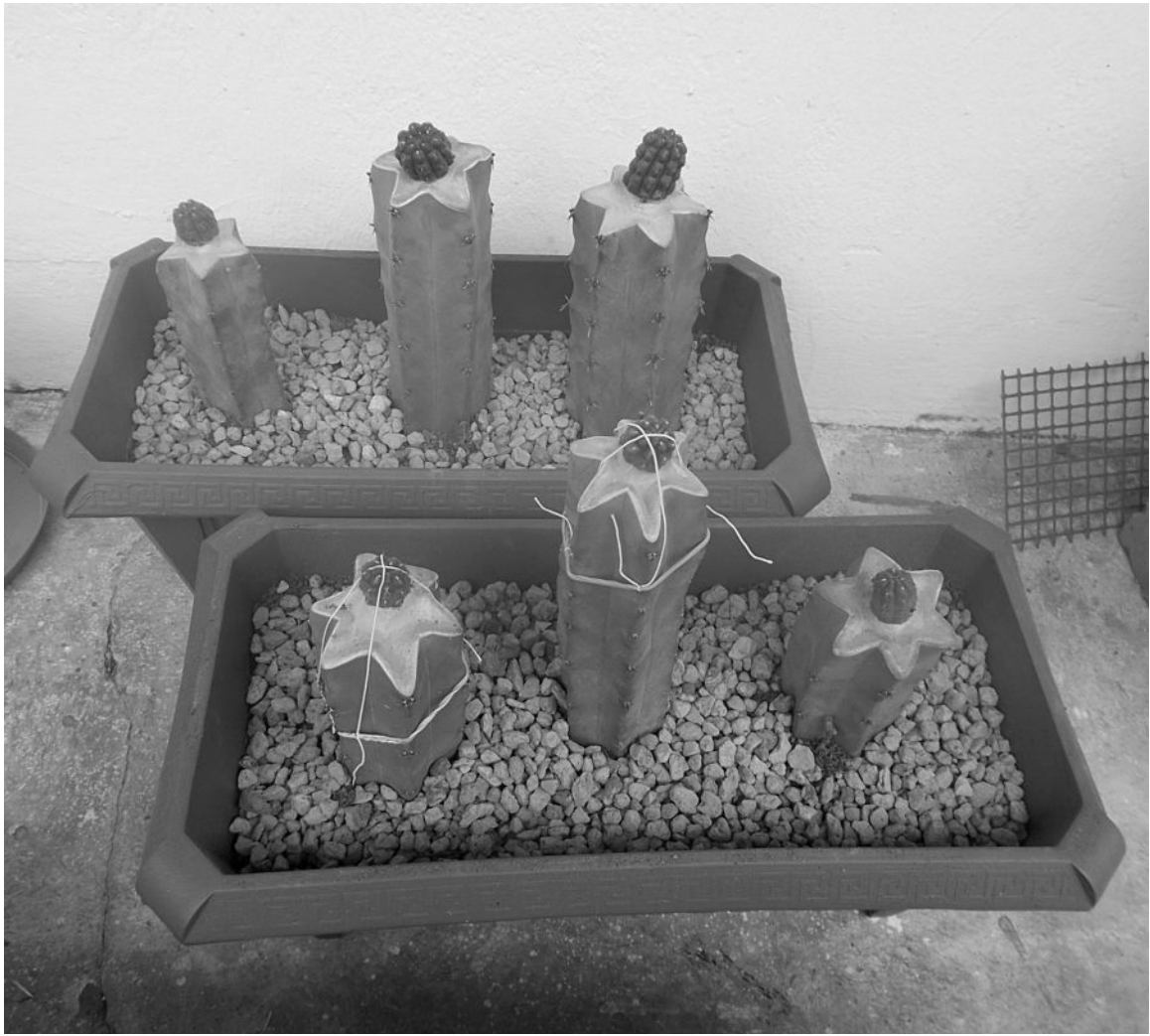
Easiest way to get a ton of Gymnocalycium flowers.