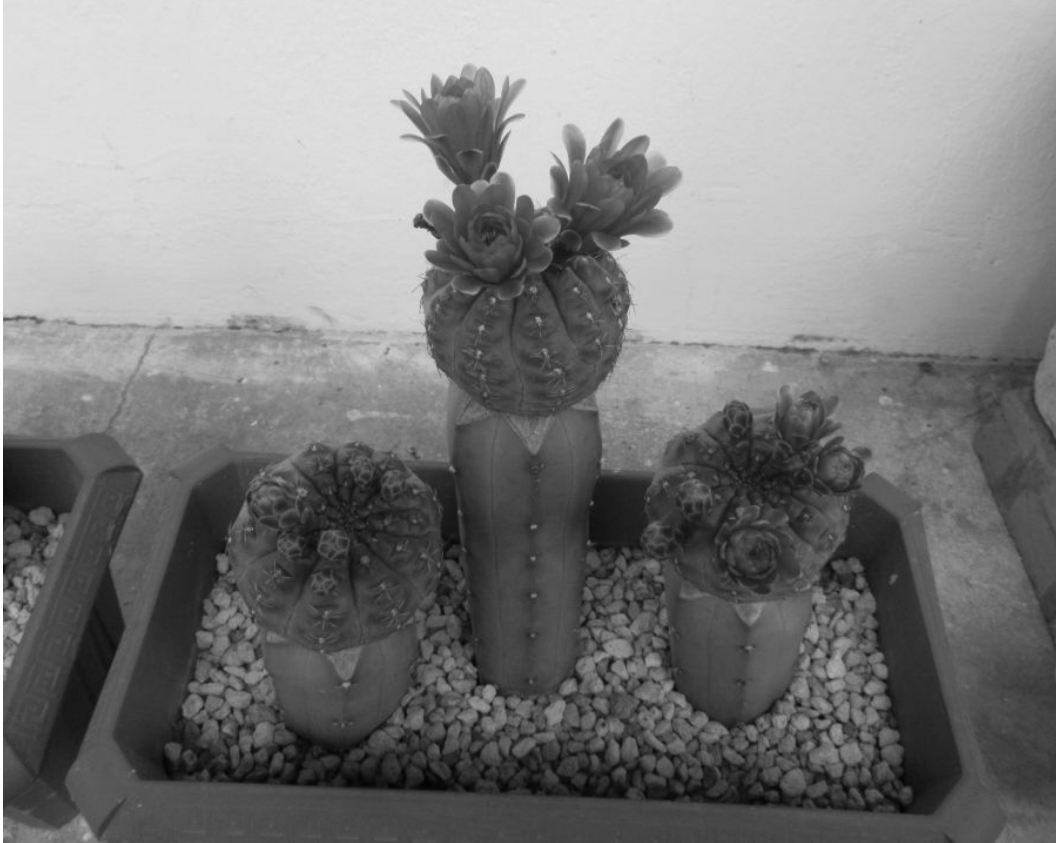
This is a lot more fun than Gymnocalycium 'Hibotan' grafted cacti.