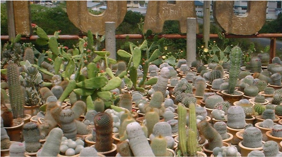
Opuntia with red flowers and yellow flowers, Cactus Valley, Cameron Highlands, Malaysia, 2002.