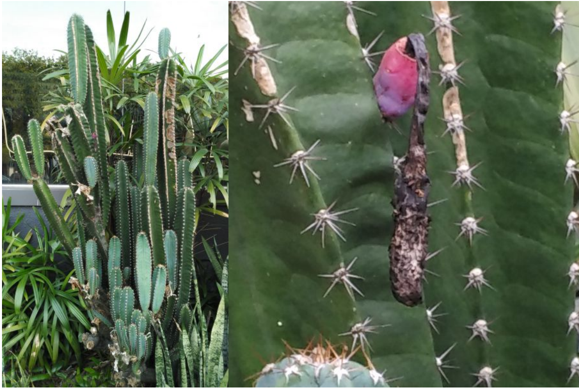
Found at Kompleks PKNS Shah Alam, March 2017. Looks like Cereus hildmannianus to me. One fruit. Also note the damage on older stems.

A roadside cactus. Occasionally one can see Cereus outside of houses or along roads in Malaysia. Large specimens, such as the plant in the above picture, are also sometimes planted as landscaping. Large specimens may produce flowers. I have inspected one specimen in a housing estate that had pale yellow flowers that did not fully open. These days it's easier to come across a dragon fruit plant in a housing estate rather than a columnar Cereus .