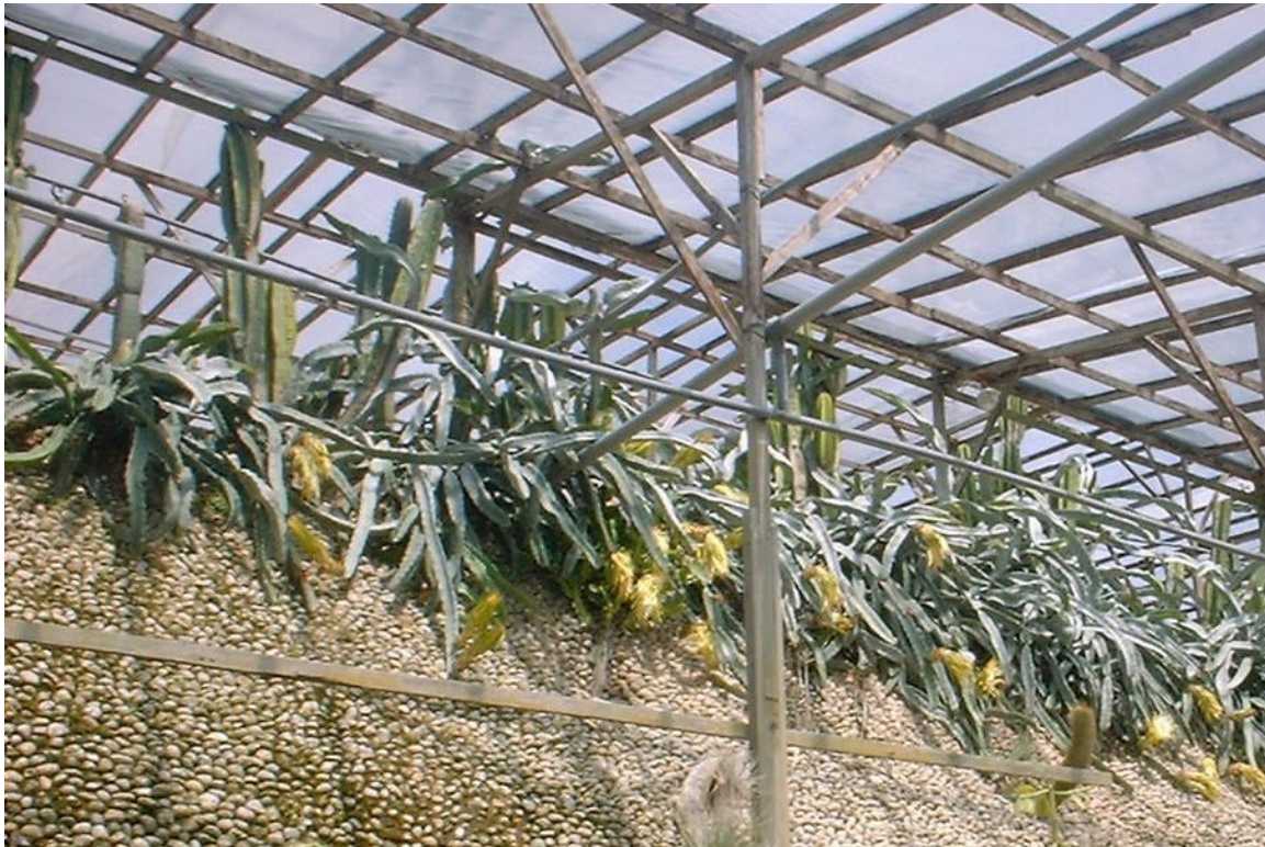
Hylocereus undatus at Cactus Valley, Cameron Highlands, 2002, before dragon fruit was popular in Malaysia. The flowers are nocturnal, so they are closed in this picture.

Hylocereus undatus is widely grown in Malaysia these days for its fruit, the 'dragon fruit'. Some supermarkets use the names 'pitaya' or 'pitahaya'. Commercial dragon fruit H. undatus have been bred for fruit size and taste. It originates from Central America and northern South America and has been cultivated for centuries.