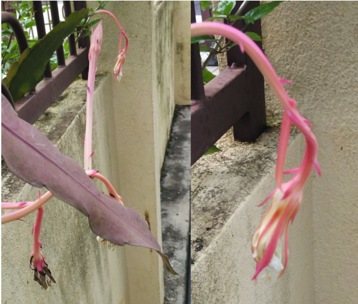
An Epiphyllum in bloom in a housing estate in Klang Valley, Malaysia (May 2018). A few stems have spilled over the garden wall or fence and are in bloom. The stem seen at left is reddish, perhaps due to exposure to too much sunlight or heat.

Epiphyllum is a family of epiphytic or climbing cacti from Central America. Epiphyllums have flat stems that look like long leaves with notches. Like Pereskia , this is another cactus that is rarely found at nursery retail but is spread by cuttings passed from gardener to gardener. I don't grow these because I do not want to maintain a large plant with long stems. Occasionally one may come across a flowering specimen. Flowers are white in colour. I have never seen any Epiphyllum hybrids with brightly-coloured flowers in urban Klang Valley, Malaysia.