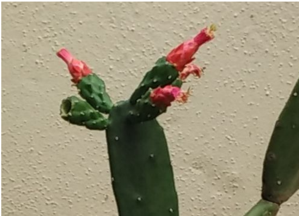
Opuntia cochenillifer is the species commonly found in urban Klang Valley, Malaysia. This one was found in a housing estate. Ripe fruits are purple in colour (March 2018).