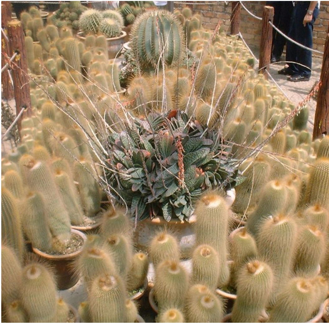
A large pot of Gasteria with flower stalks, surrounded by Parodia leninghausii , at Cactus Valley, Cameron Highlands, 2002. I grow a pot or two of Gasteria because their thick leaves are very tough. They are survivors and bugs have not managed to do a significant amount of damage to their leaves over the years.

There are probably many other cacti that are willing to flower in Malaysia, because what has been discussed is just what I have seen with my own eyes. There are many columnar cacti from Brazil, for example, whose natural habitat is in the highland-grassland-subtropical-tropical climate range. And so on. But large or uncommon imported specimens will not be cheap. To the average tropical urban gardener, commodity cacti are still the most widely available plants.