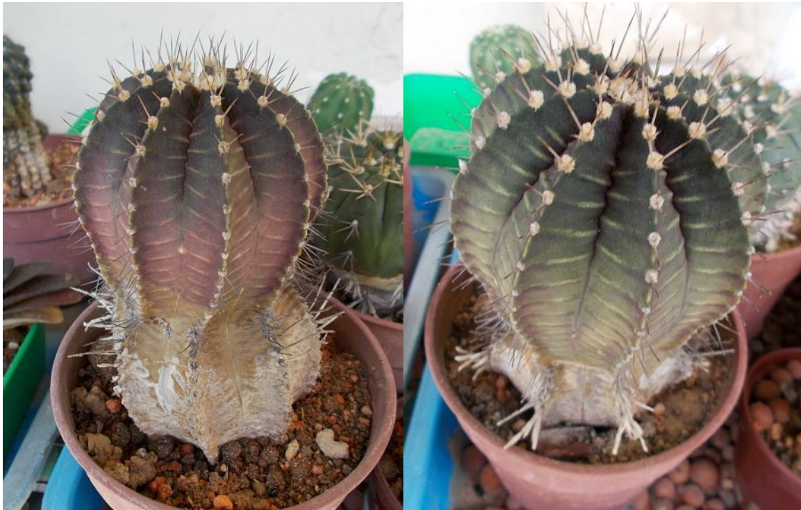
What is the colour of a GSteno? Left: March 2014. Right: July 2014.