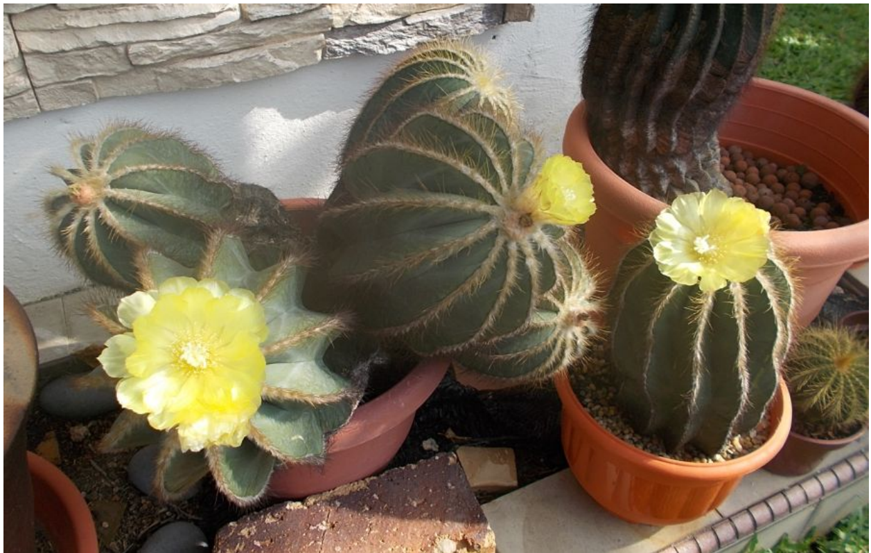
Here are some yellow flowers for a change. Two PMags in bloom, November 2019.

We all want our cactus plants to do well. But all of us also have our own personal preferences. Thus, no cultivation method will fit everyone perfectly. It is better for us to understand why we cultivate in this way or that way. Usually we cannot have what's perfect for our plants because we have limited time and resources that we can expend on their care. With knowledge and understanding, you can make your own choices and strike a balance that works for both you and your plants. ♦