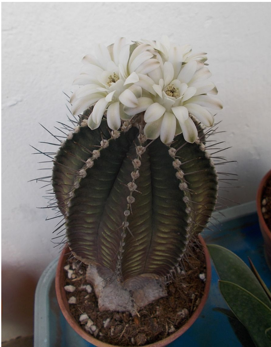
The GSteno with its first flowers, April 2017. Thanks to better nutrition.

For growers like you and me, we cannot give our specimens the perfect, computer-controlled care that the commodity cacti are getting. In tropical climates, we cannot maintain that soilless mix properly. Whether small pots or big pots, the hot tropical weather will quickly dry out the top portion of the soilless mix, and you will have trouble getting it wet again. To solve that problem, one can use a layer of scoria as a mulch to prevent the mix from drying out too quickly – this is another reason why I use a layered mix with scoria or pumice as the top layer.