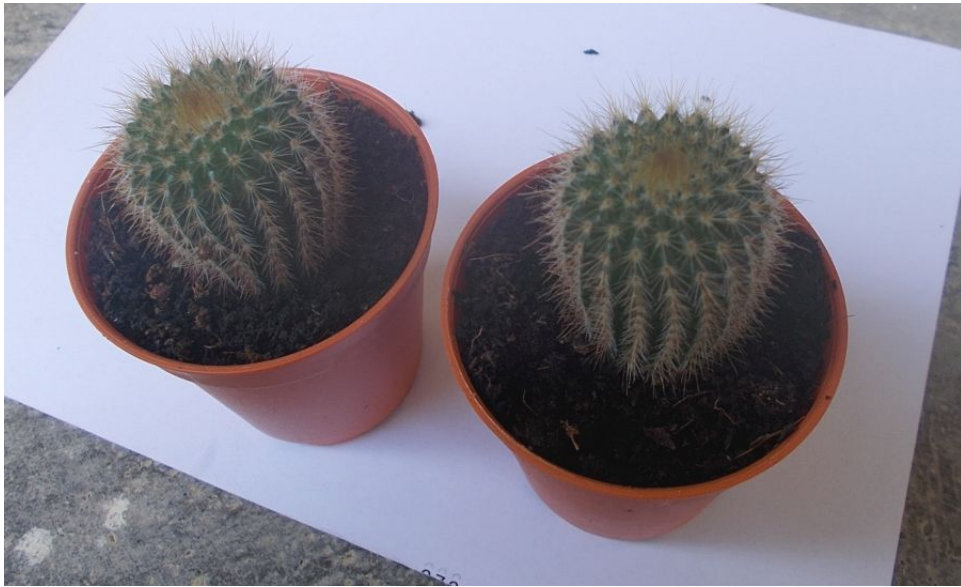
Two commodity cacti just after purchase, September 2018. These two are some kind of Parodia or Notocactus . Sure...