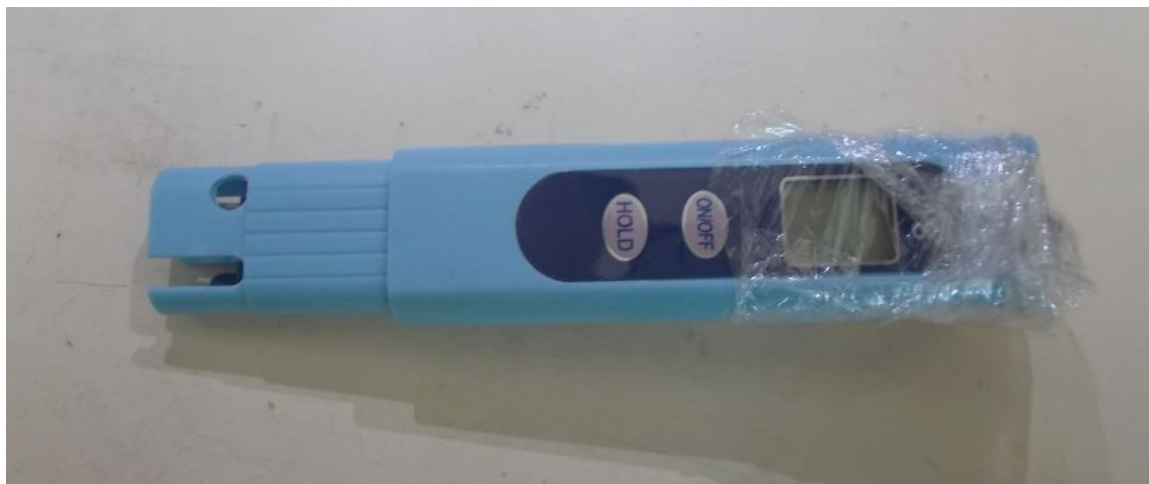
A very cheap EC meter, converted to use one CR2032 (a lithium coin cell will not leak as easily as alkaline LR44 cells.) Good enough for non-scientific work.

For fertigation or foliar feeding, it is useful to know the concentration of the solution that you are using on your plants. You will need an EC meter (electrical conductivity meter). Once you are used to mixing soluble fertilizers, it is not necessary to always measure the resulting solution, but it is extremely useful in the beginning when you are finding your way. In 2015, boiled water measured about 130 \mu\text{S}/\text{cm} , while stored rain water was about 50 \mu\text{S}/\text{cm} . A tiny pinch of magnesium sulfate in 1 litre of water measures perhaps 200–300 \mu\text{S}/\text{cm} , so it's still quite dilute.