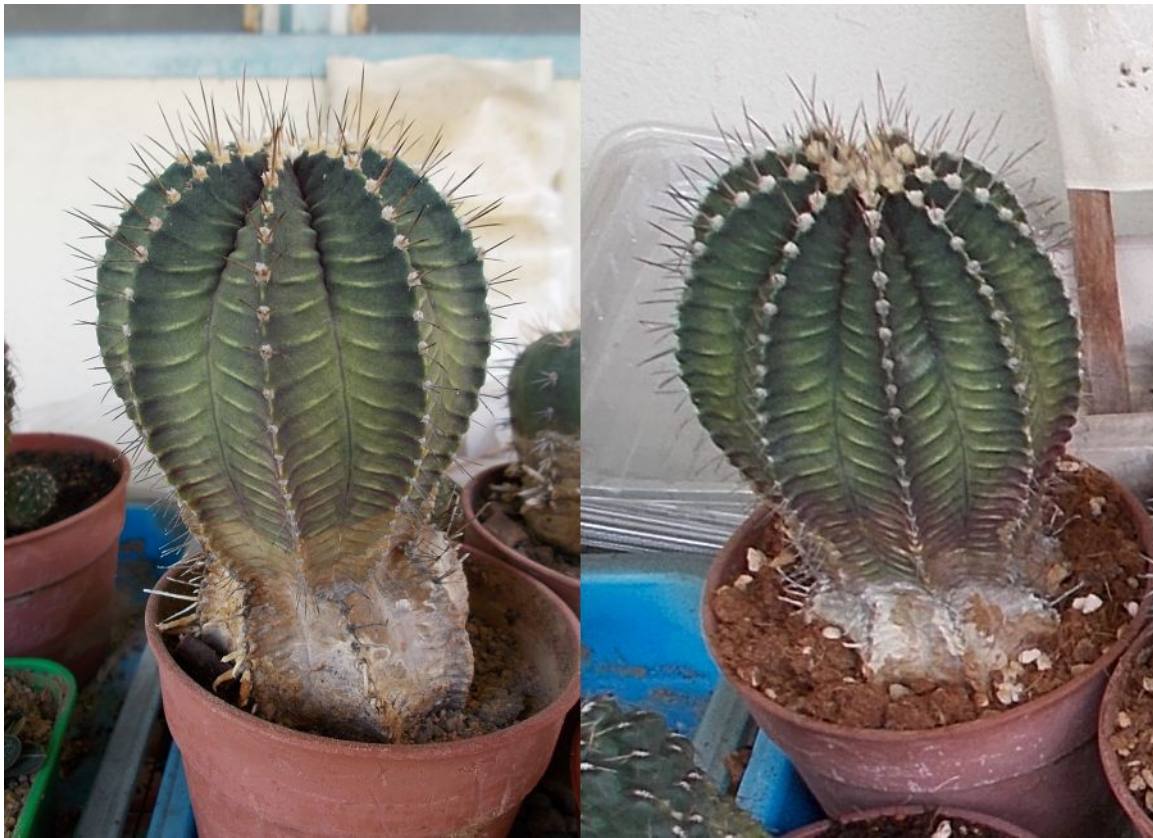
Maybe dark green, if under shelter and not starved. Left: Feb 2015. Right: Nov 2015. The optical distortion is due to the plant being near the edge of the digital picture.