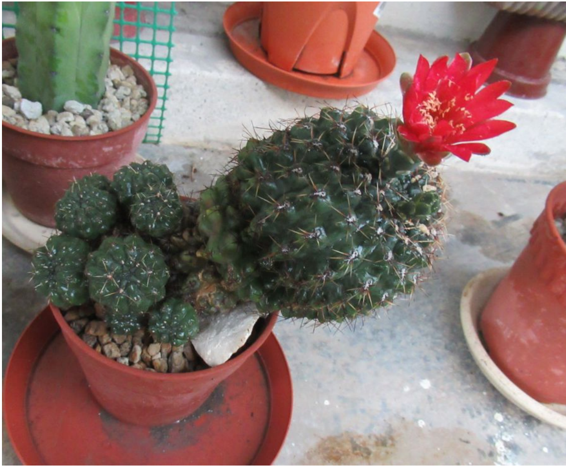
The ex-graft wet either after rain or spraying around the middle of November 2020. The flower looks messy, but look what happened a few days later (see below).