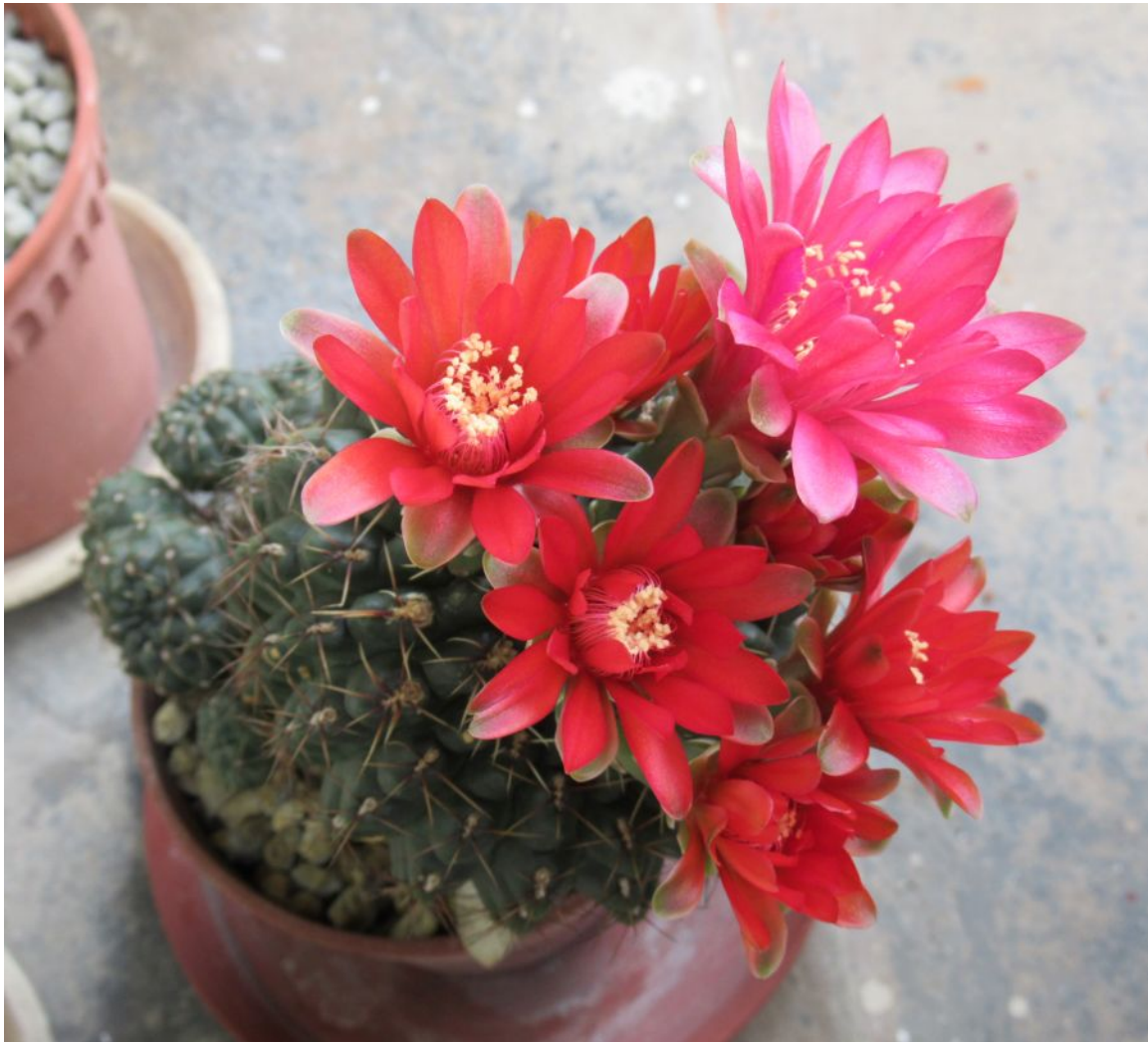
A month later, going strong with 7 flowers open in February 2020.

A GBald-on-MGeo graft is still a wonderfully productive plant even though it may not last a very long time as a grafted specimen. From its first flower in June 2015 to finally detaching from its stock in January 2020, the GBald scion produced at least 116 flowers in about 4½ years 1 . After it detached, the now ex-graft produced 49 flowers for the rest of 2020. That's at least 165 flowers from a single GBald. In addition to that, many large and strong offsets were harvested – a simple thing to do to get more GBald specimens.