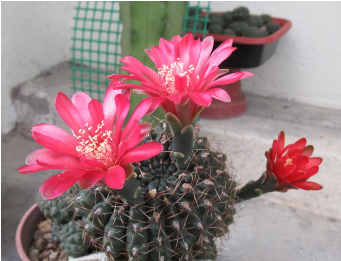
A nice display of normal-looking flowers two days later. An older areole has also produced a flower. The two larger flowers are open on their fourth day; the smaller flower is open on its first day. (February 2021)

Just a month ago in December 2020, this ex-graft produced two flowers with a sad complement of stamens. By the beginning of February 2021, poor quality flowers appear to be all but forgotten as the specimen resumed producing normal-looking flowers. The condition of the plant would not have changed much in a single month, but the resumption of hotter tropical weather had perhaps switched flower production into “summer mode”.