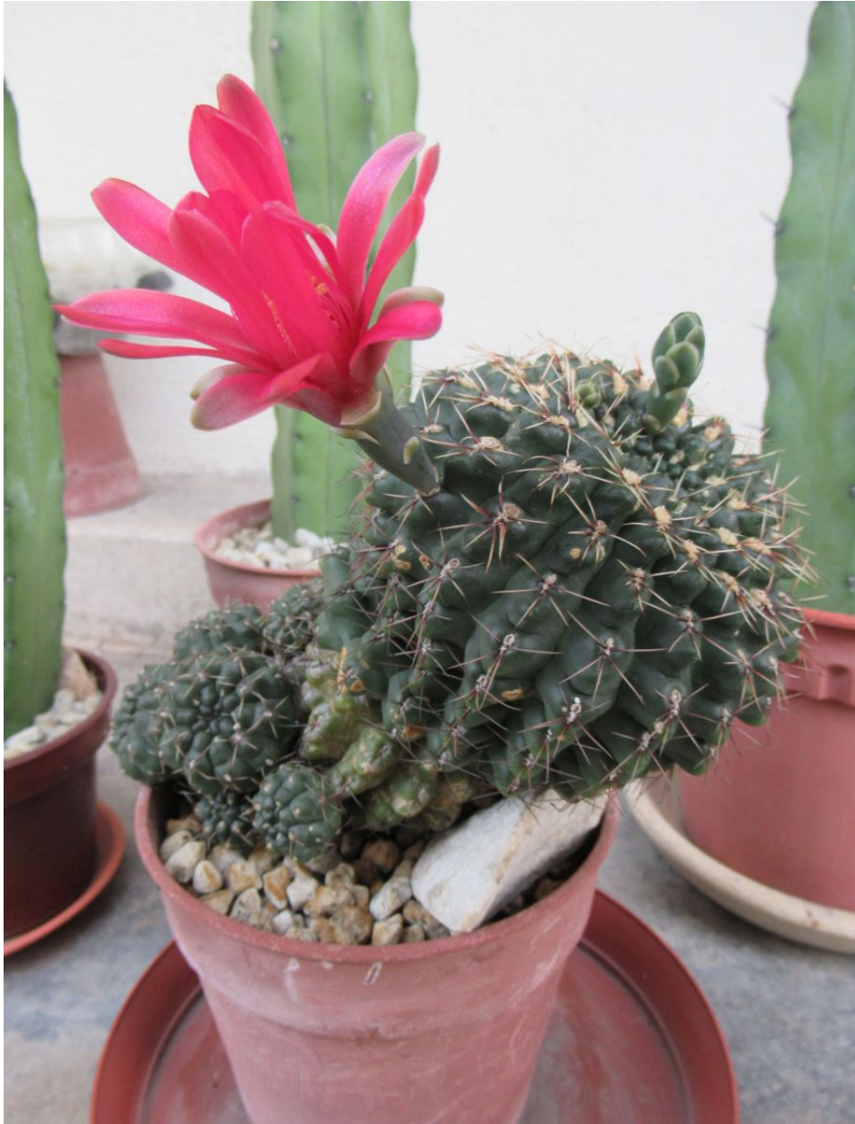
In April 2020, an older areole was reactivated and produced a bud. So this flower ended up appearing from the side of the stem.

For the first 6 months after detaching from its MGeo stock, the GBald exhibited strong flower production and growth. It is still shrinking, however, and I have not pulled it up to look at its roots. But it is generally behaving like a normal GBald, only stronger, since it is much larger than GBalds that are not grafted specimens.