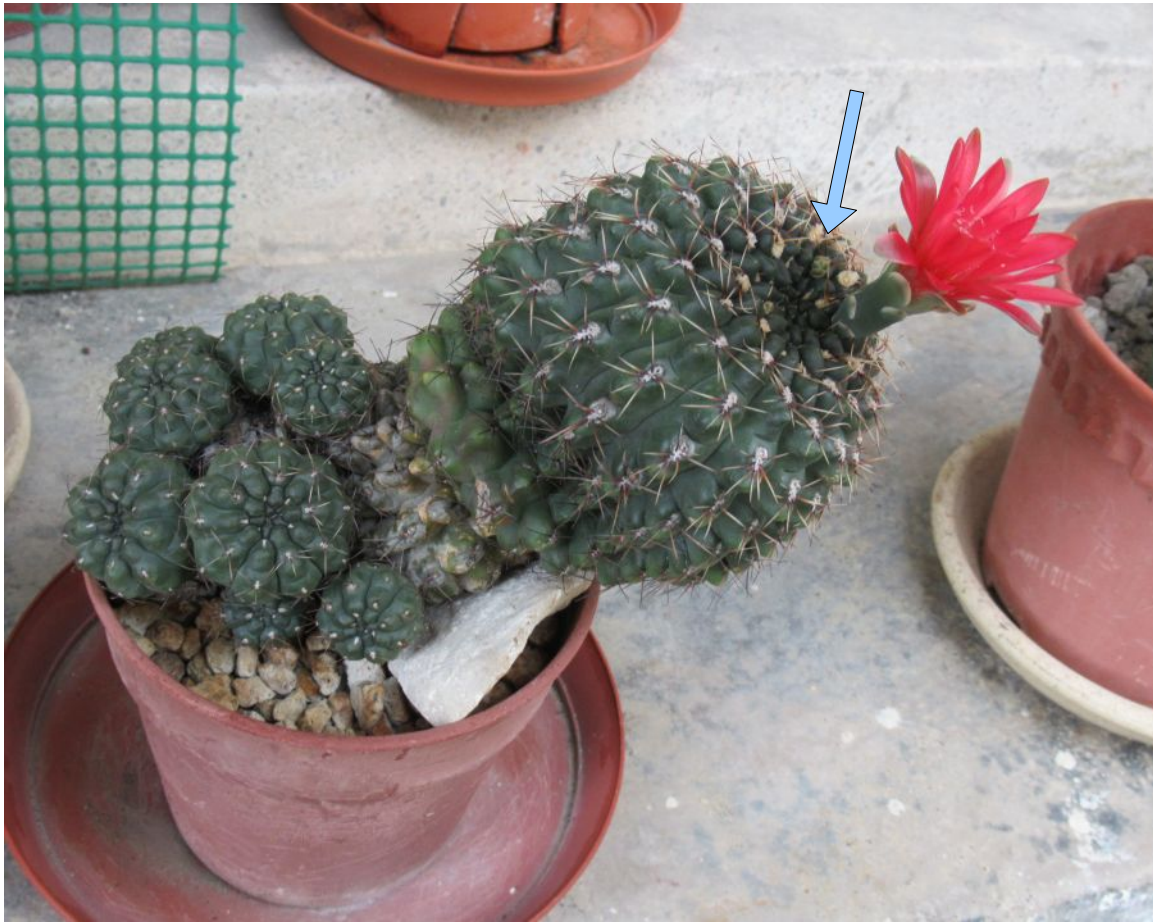
The ex-graft with one flower at the start of October 2020. The bud (blue arrow) was aborted, drying up and dropping off.

If you look at the chart for 2019–2020 GBald flowers in the Data and Charts chapter, flower production bottoms out in October 2019. Perhaps coincidentally, the ex-graft experienced its low point in October 2020. In that month, only one flower was produced.