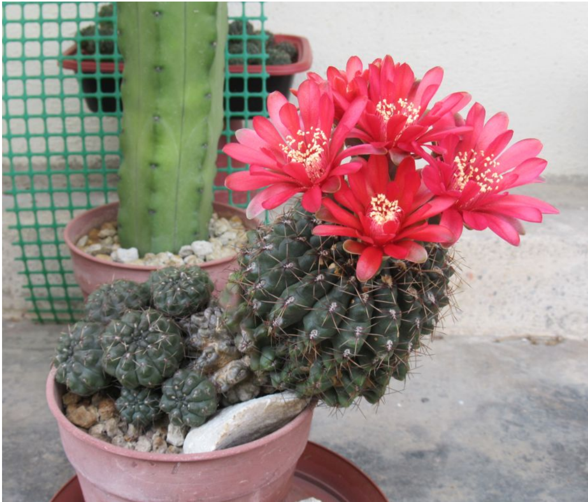
The ex-graft GBald with six healthy flowers open in early March 2021.

And just like that, the ex-graft is behaving like a strong flower producer again. From zero to hero in a few months – it supported six flower buds and a large seed pod with no problem. The behaviour of the ex-graft GBald strongly suggests seasonal behaviour in a tropical climate. The effect may be subtle, because it can only be seen by studying flowering behaviour over one year – the tropical climate may be too evenly hot for GBalds to display proper seasonal behaviour. Without those flowers to observe, the specimen won't appear to be doing much except the upper stem grew a bit and the lower stem shrunk a bit.