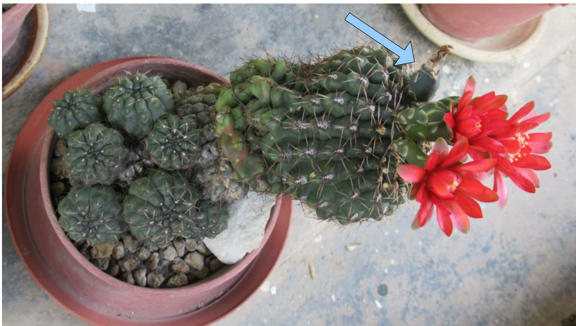
The pod (arrow) was harvested the next day; it contained 72 seeds. (March 2021)