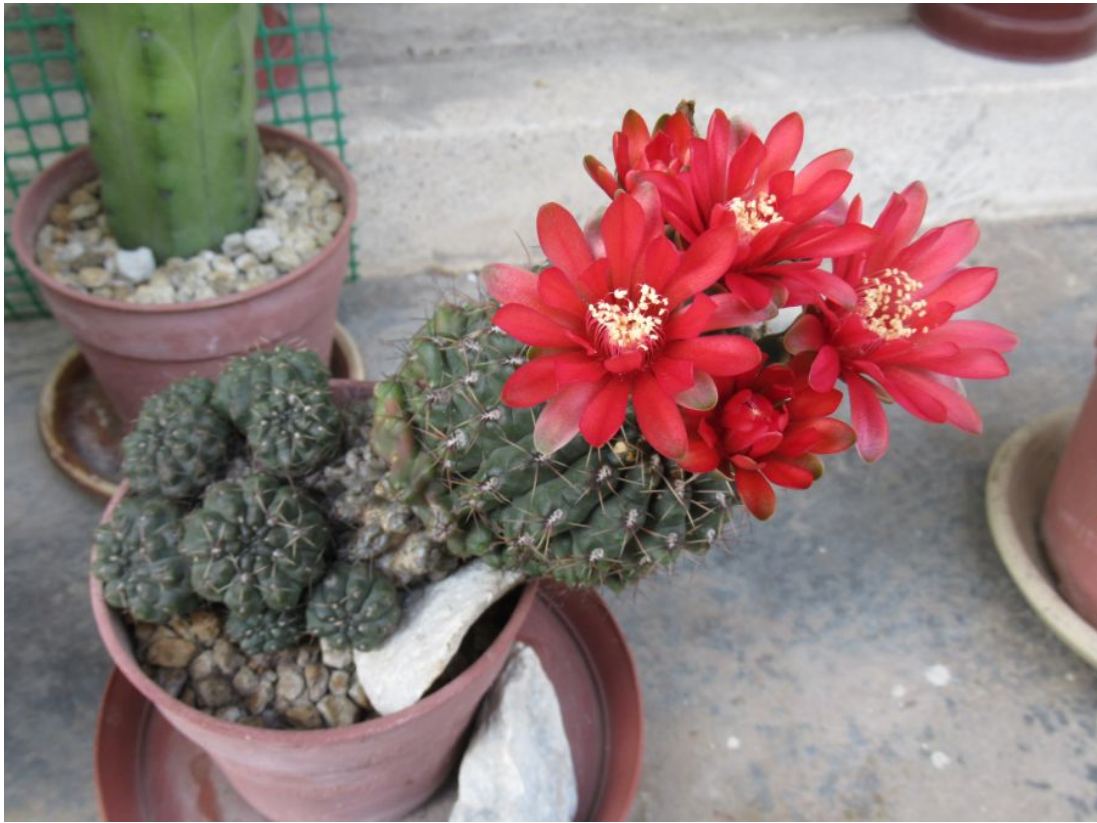
There were five flowers open the next day. (March 2021)