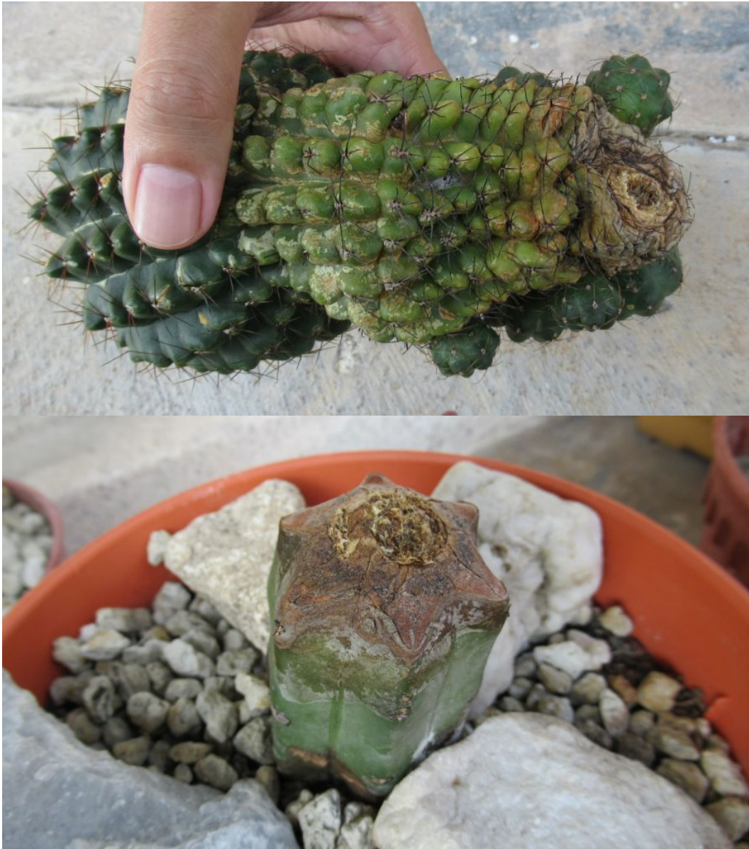
Two views of the just-detached GBald scion and MGeo rootstock. (January 2020)

The following piece is part of a collection of writings published on the Practical Small Cacti Malaysia site .