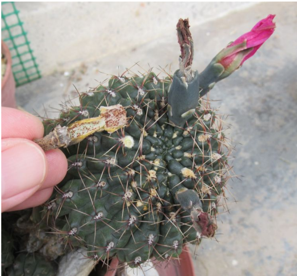
The old pod detached the next day. Splitting the pod open revealed the insides to be empty. The brown bits are failed ovaries. There was not a single seed to be found, yet the pod did not abort early. One of the new pod is promising. (February 2021)