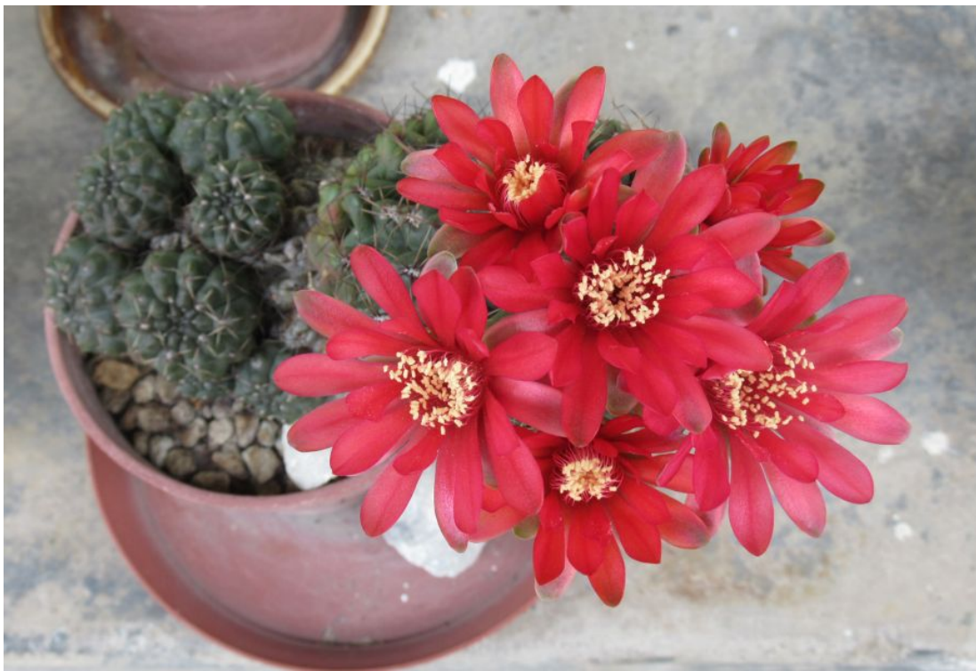
Six flowers opened the day after that. (March 2021)