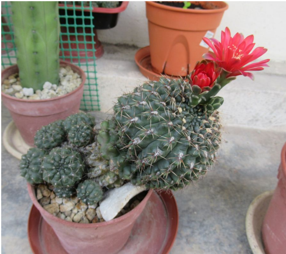
About the same number of flowers in early September 2020. Stamens are still poor.