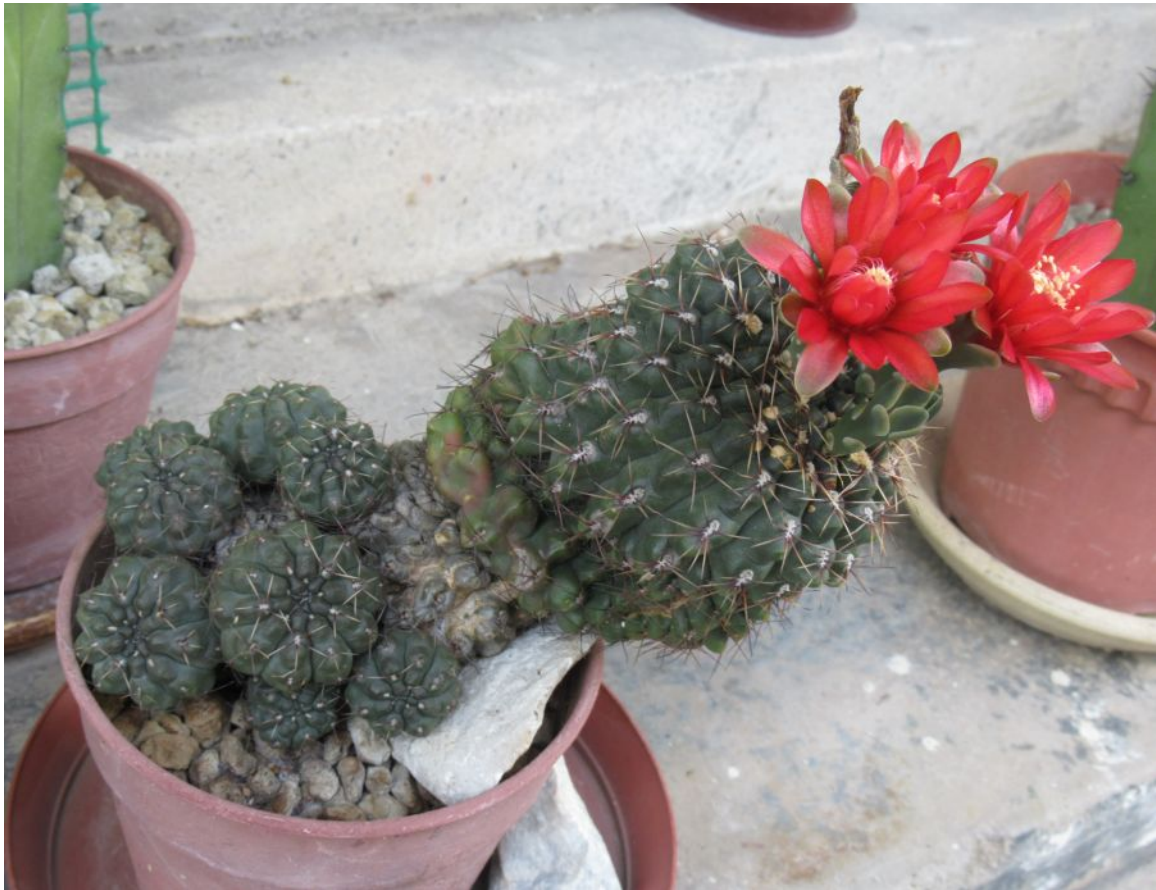
With three normal-looking flowers open a week later. (March 2021)