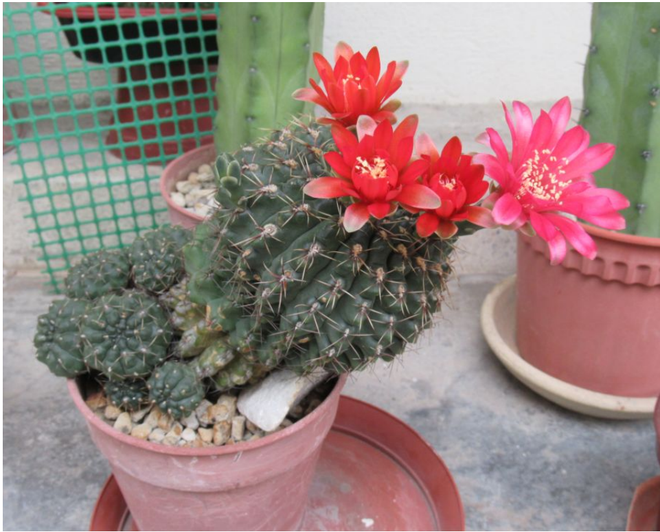
In May 2020, with 4 flowers open.