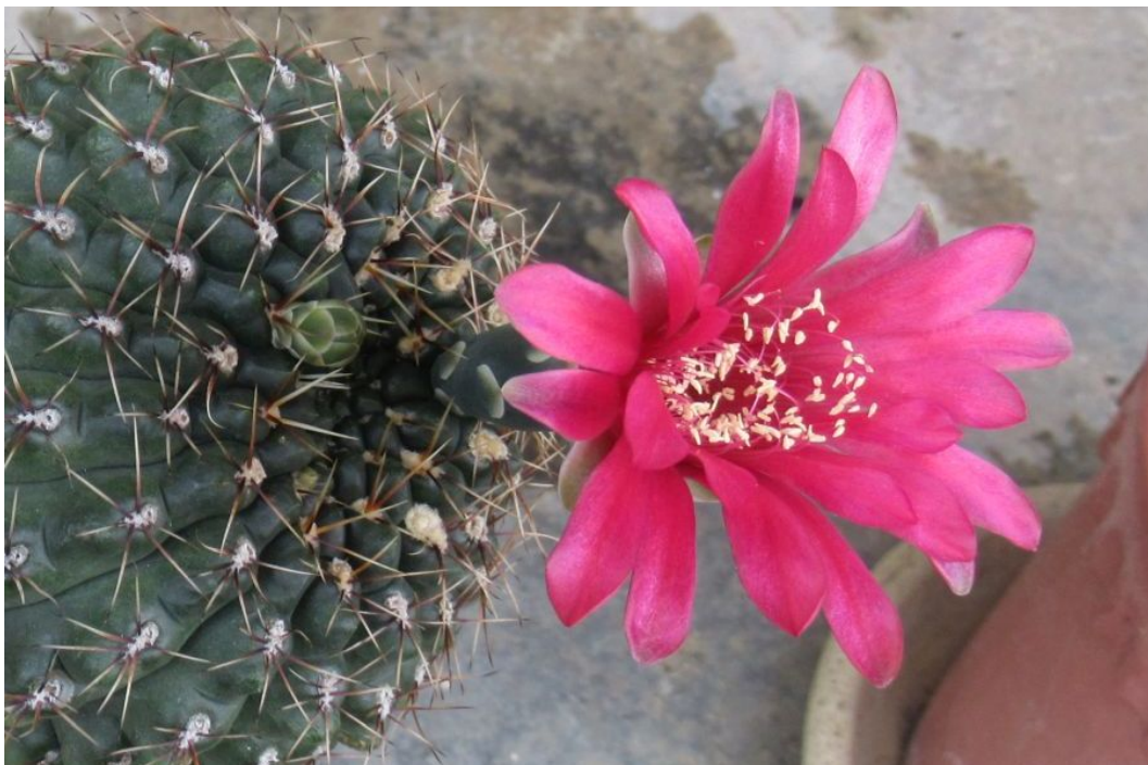
Closeup of the flower showing the stamens arranged in an untidy manner. Stamen pattern on normal GBald flowers look much better than this mess. The flower look slightly distorted too. (November 2020)