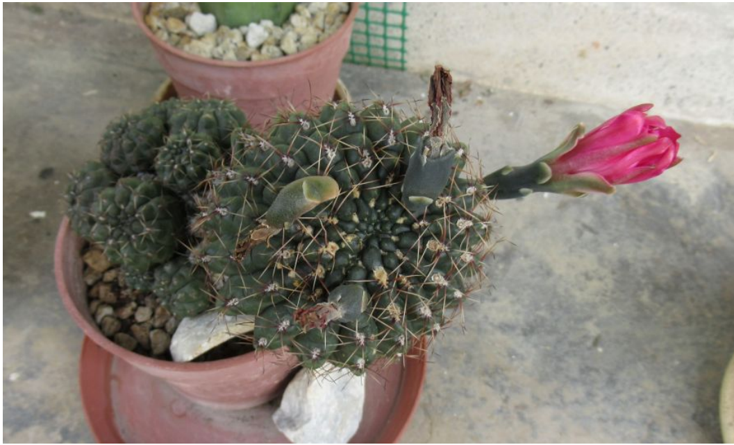
A week later. More potential pods. The old pod is finally failing. (February 2021)