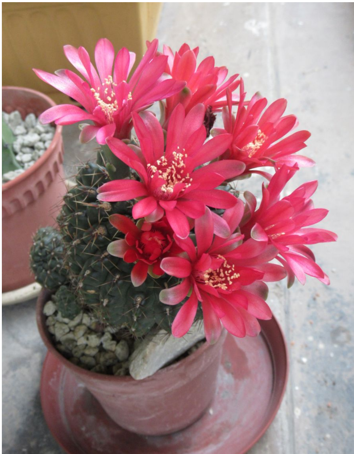
With 7 flowers open again, three days later. One flower is new. (February 2020)

It is better to choose healthy offsets or young stems for grafting or propagation. A GBald-on-MGeo graft in its prime can produce about 50 flowers a year! As such, it is more profitable to renew your collection. Old GBalds will still produce flowers, but expect them to eventually weaken. Any GBald that shrinks will not last forever, so you must propagate replacement plants.