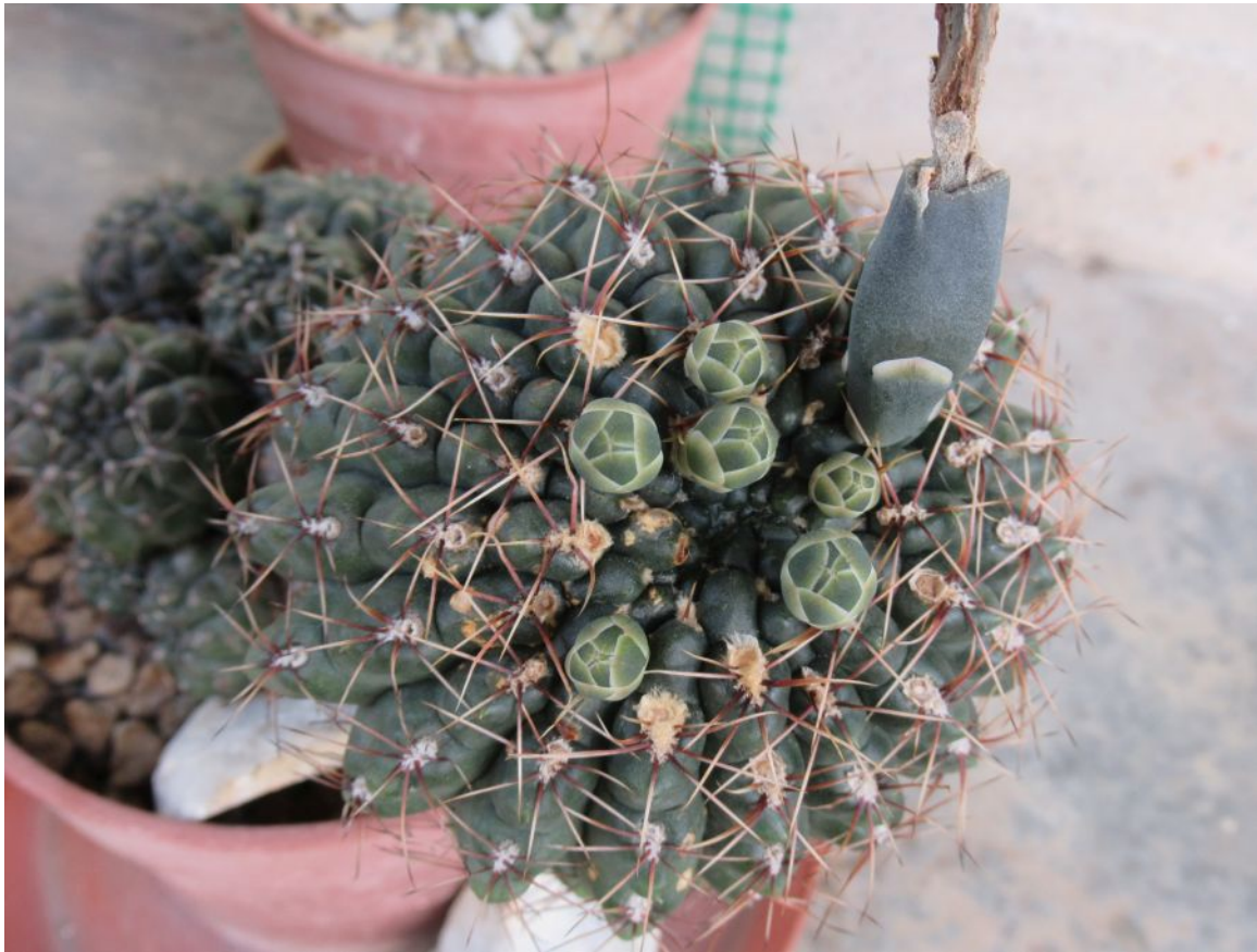
From not being able to sustain a single bud back in October 2020 to producing six flower buds and keeping up a large pod in February 2021. All systems are Go now.