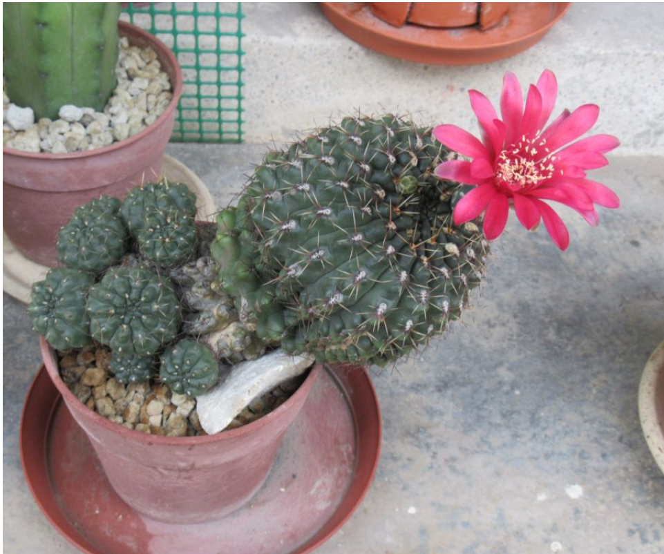
In early November 2020, this flower has better stamens.