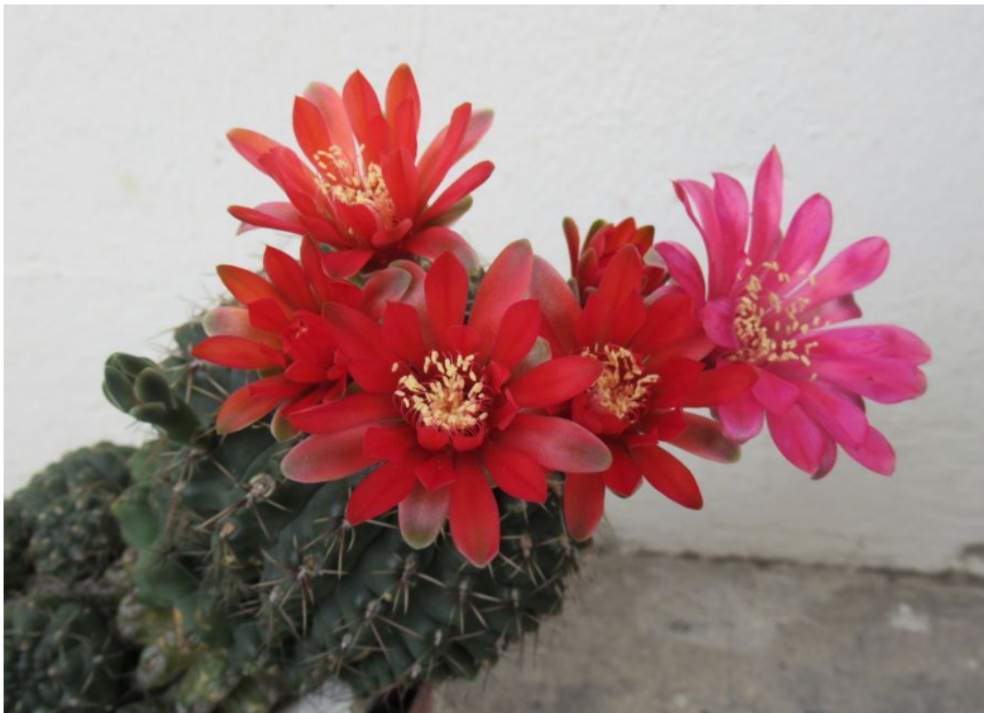
There were 6 flowers open the next day. (May 2020)