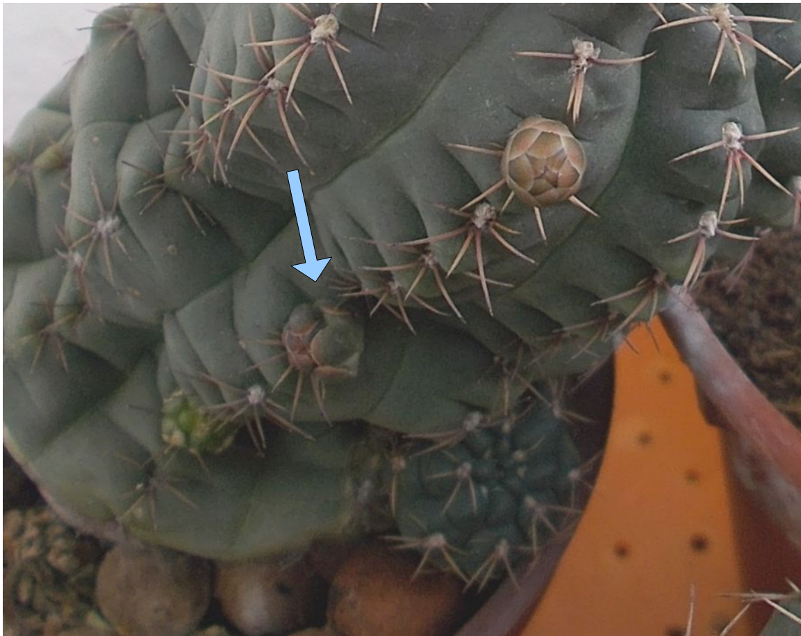
An old GBald with three different things growing out of areoles. At lower left is a normal offset. At upper right is a flower bud. In the middle (blue arrow) is a weird 'something' that is a cross between an offset and a flower bud. (March 2017)

The abnormal pod is slightly abnormal compared to the totally abnormal outgrowth, in the sense that it may have some characteristics of an offset near its base. So the weird pod never detaches, even though it's mostly a pod, because the base of the pod thinks that it's a stem. It may have finally aborted itself when hormonal balance changed.