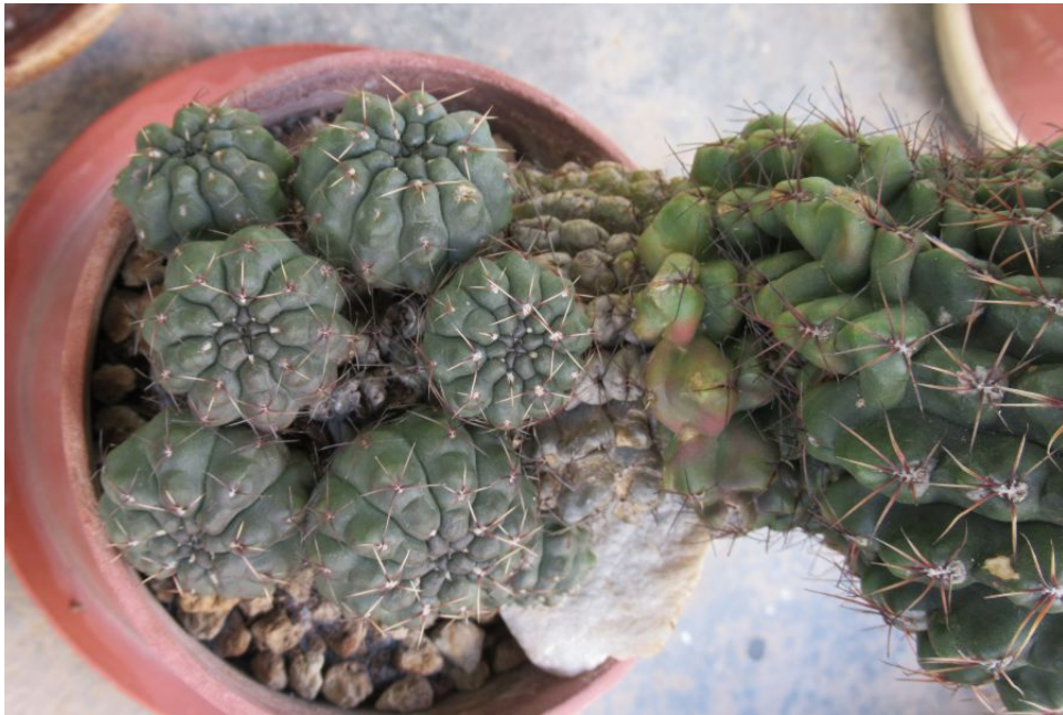
A view of the the different degrees of shrinking of the lower stem. (Feb 2021)