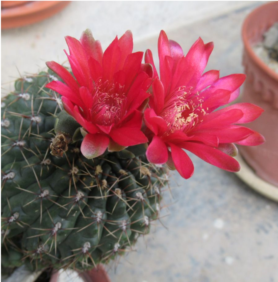
Closeup of the two flowers. Those are very poor stamens. Again, such flowers appear to keep their intense red colour better than normal GBald flowers. (December 2020)