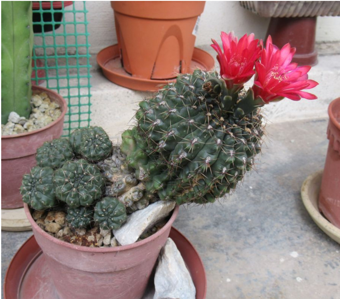
The ex-graft on the last day of December 2020. There are two flowers with awful stamens and surprisingly, the pod is still on the plant.

In November 2020, there were flowers that looked pretty good. The rate of flower production was back to about 3 per month. In 2020, I did manual pollination on occasion among GBald flowers, and got a few seed pods with apparently viable seeds. The ex-graft flower that produced this particular pod was however never pollinated. Normally, such flowers will not set pods, because the current behaviour of my GBalds is that they are rather reluctant to produce seed pods – I don't know why they are so unwilling to produce seed pods.