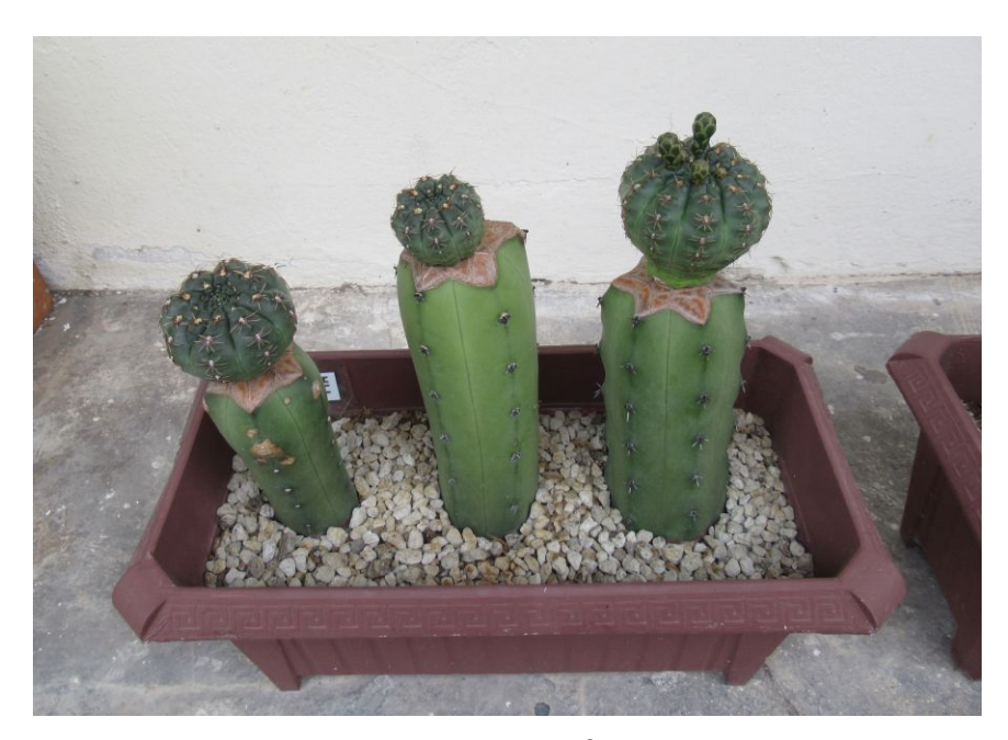
2019ABC at the beginning of September 2020.