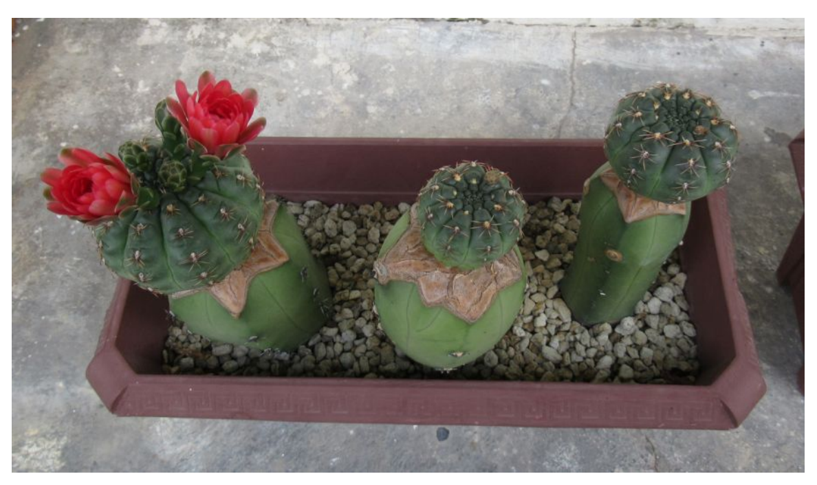
2019CBA three days later. The buds on 2019A and 2019B are just visible. (Sep 2020)