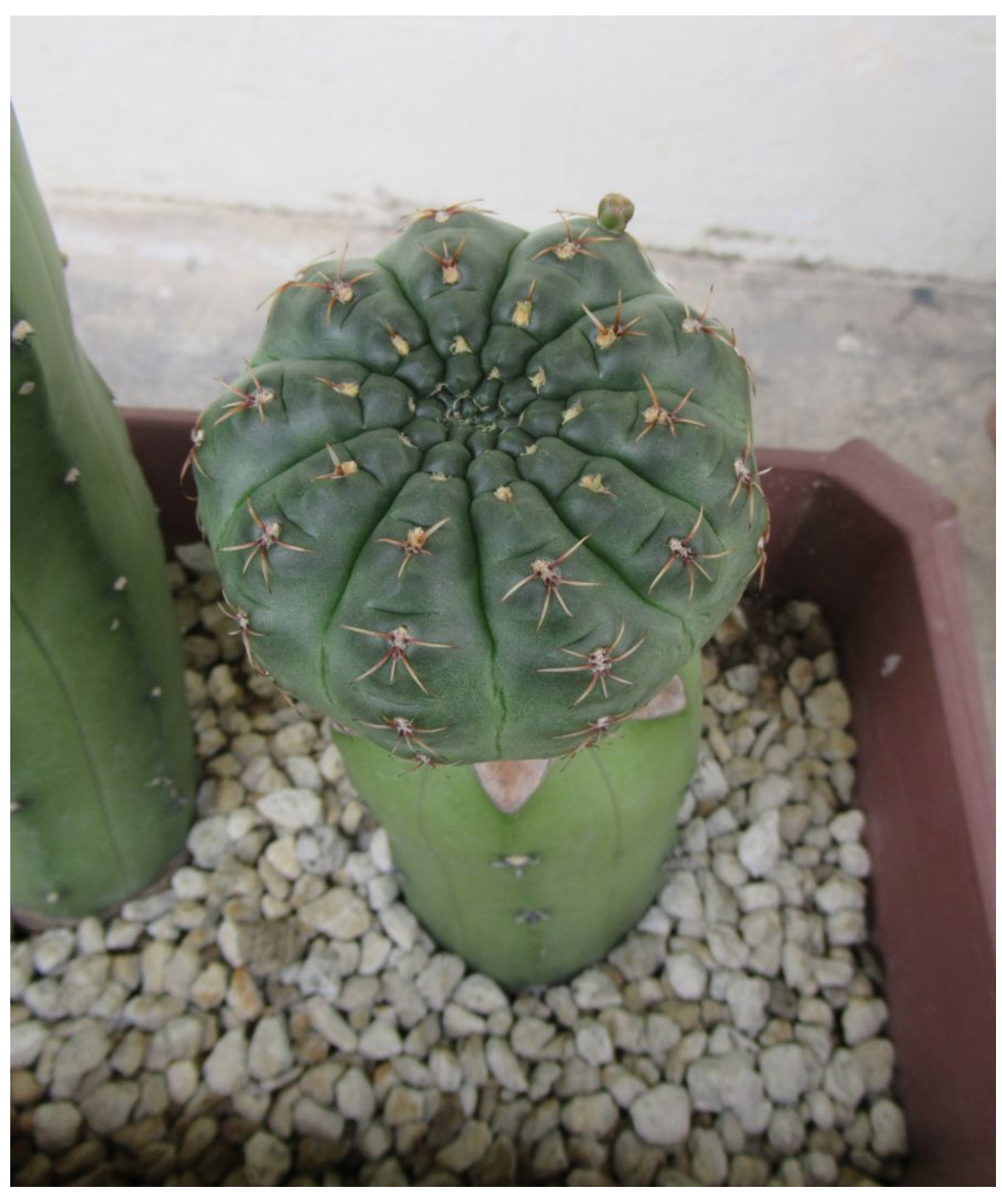
Nine days later, a bud was spotted on 2019F. Instead of producing a bud from near the apex or growing point, it appeared from out of an older areole. (August 2020)

When the flowers on 2019D and 2019F finally opened at the beginning of September 2020 (see pictures on the next page), there were no pollen on the stamens of either flower, so the two specimens also had hybrid GBald scions. It makes sense that I would have so many of these descendants of a hybrid GBald of unknown provenance, because they appear to be somewhat more vigorous than regular GBalds. It's nice to have plenty of offsets – and flowers.