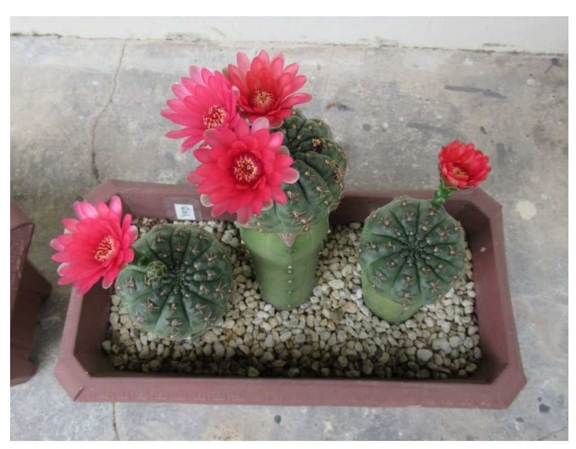
Top view of three grafted specimens (2019DEF) in bloom. All three have no pollen in their flowers, a trait of the hybrid GBalds that I have. (September 2020)