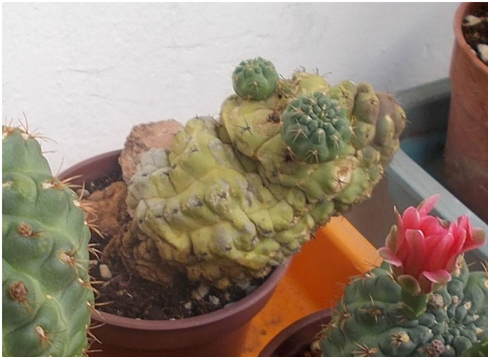
4 months later, in August 2017. Several offsets have been harvested. The stem has little reserves now and there won't be any more new offsets to harvest. The pieces of broken bricks were meant to prop up the specimen. At that time, I have not understood the weakness of the shrinking stem, hence I was still hoping it would somehow revive itself and turn into a green stem again. Now I know better.