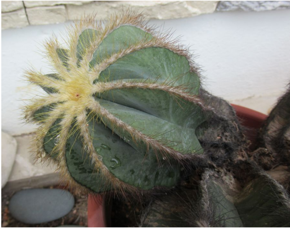
The left rear stem in July 2020 with a flower bud.