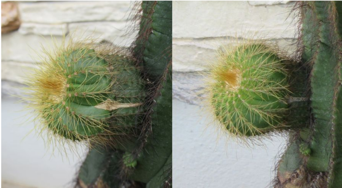
Left: The offset with a split stem in early June 2021. Right: Looking much bigger at the end of October 2021.

The strong and sustained production of flowers on the large PClav means that nutrition is successfully getting to the apex or growing point of the specimen. In about 2 years (2020–2021) the PClav managed to produce almost 200 flowers. Most likely, foliar feeding is responsible for a big part of that. A few years ago, I thought getting 3 or 4 flowers on the PClav was great; now I want to experiment some more. On another note, the PClav's offset is also benefiting from foliar feeding.