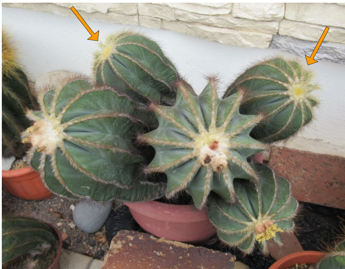
The big PMag in early June 2020. The two rear stems are marked with arrows.

One of the main objectives of daily spraying of fortified water is to improve the performance of the big PMag. While the specimen flowers almost continuously, its two rear stems (see picture above) rarely flower. The stems appear to be growing well, and each has a somewhat dense apex. However, they have not been producing flowers for a long time.