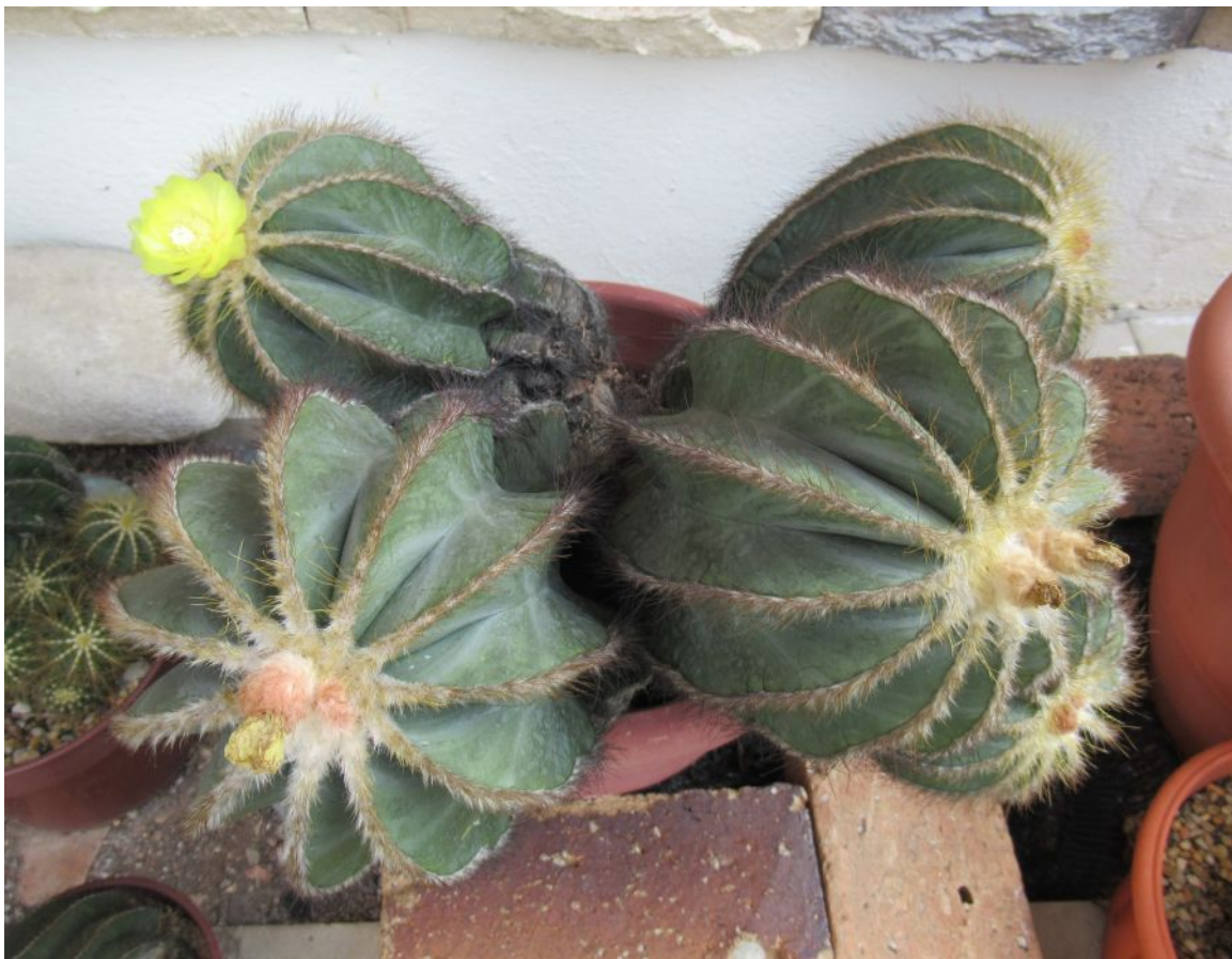
After about 3 weeks, the left rear stem has a flower open. (August 2020)