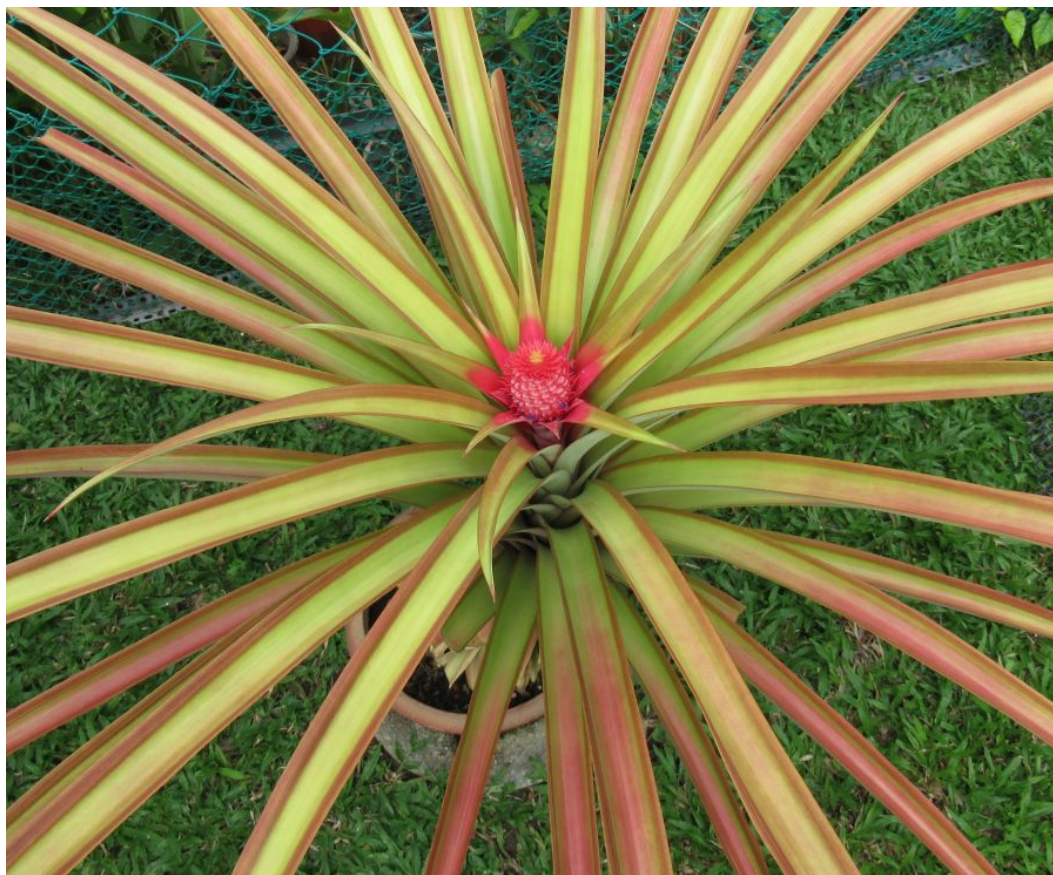
A wider view of the pot-grown pineapple plant. (July 2020)

Since many bromeliads are also epiphytes, pineapples can absorb a lot of nutrients via its leaves. Leaves also act as funnels, directing water and debris to the base of the leaves. Pineapples are CAM photosynthesis plants like cacti, with reduced water loss in order to better survive drought.