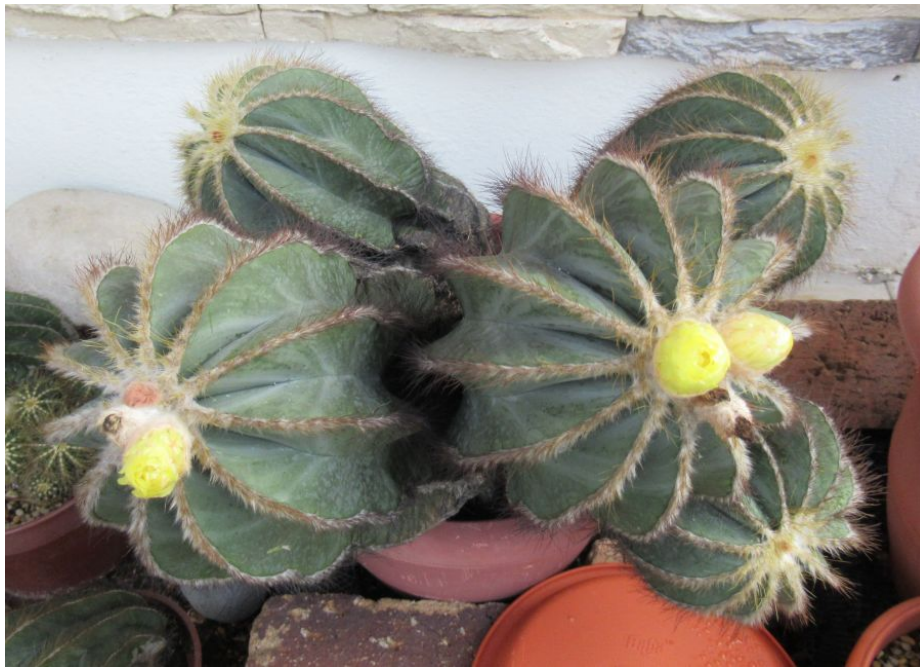
By the end of July 2020, the flower buds on the rear stems are clearly visible.