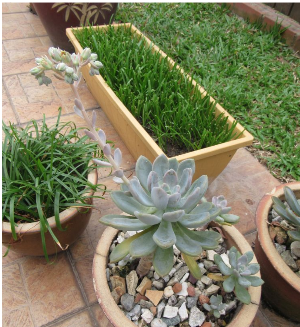
An Echeveria in bloom in January 2021. Note the healthy colour of its succulent leaves. The other two pots contain rain lilies, Zephyranthes .

Regular fortified sprays improved some Echeveria specimens too (picture above), resulting in better leaf colour and a flower stalk appeared in January 2021. Normally these plants are not watered, and there is no soil in the two pots containing the succulents, only small stones and rubble. The roots survive on organic debris that get trapped among the stones and rubble.