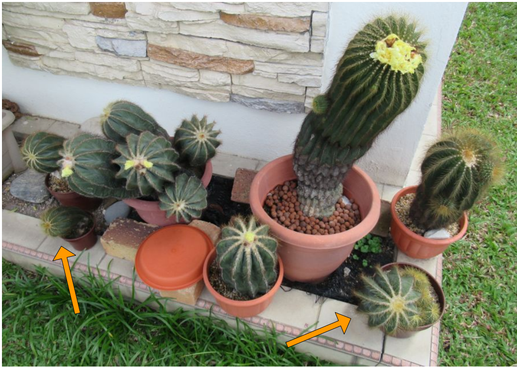
The arrows point to two specimens that ‘woke up’ and produced a flower bud each. Before this, the one on the left has never previously flowered, while the one on the right has flowered once or twice. Since they have been in their pots for a long time, there are plenty of roots in there and they are likely pot-bound. Both were originally stems (or offsets) of the big PMag specimen. (August 2020)