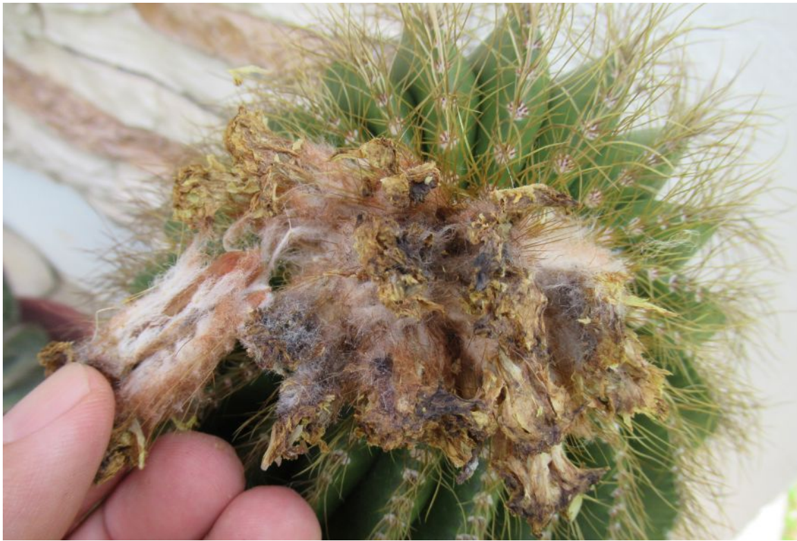
Normally, dried flowers that failed to set viable pods will detach easily after a few days. But this was a wet mess that was packed together, decorated with some sort of insect or mite webbing. Clean it up or risk damage to the plant. (April 2021)