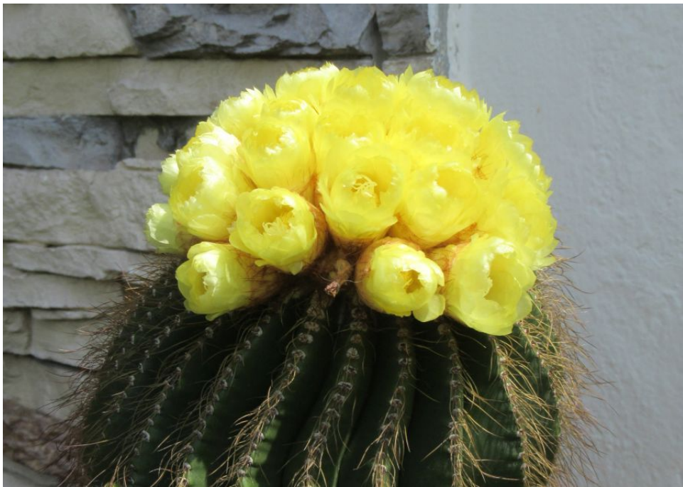
A few hours later, 21 flowers partially open in full sunlight. (April 2021)