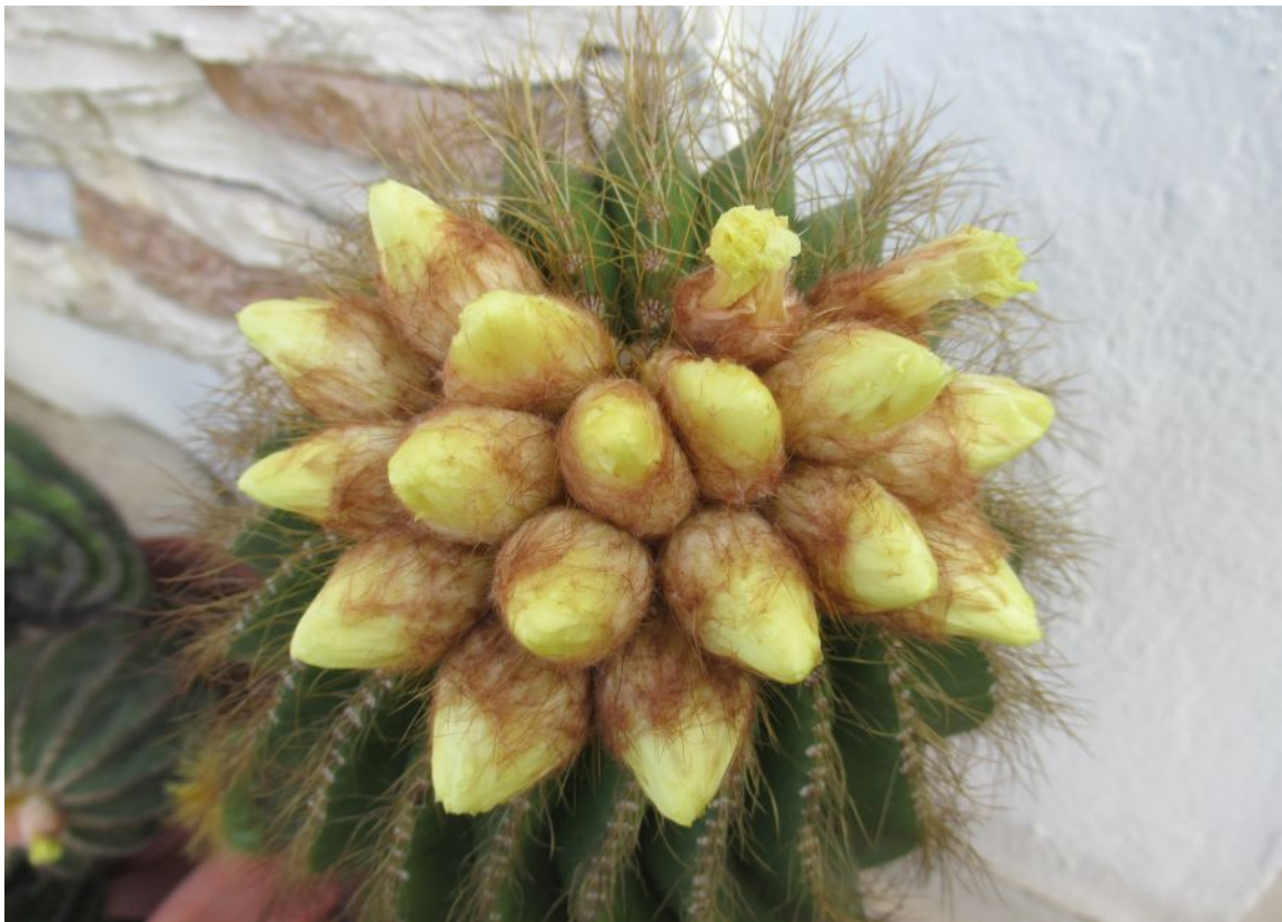
The next day. 16 flower buds opening for the first time. (February 2021)