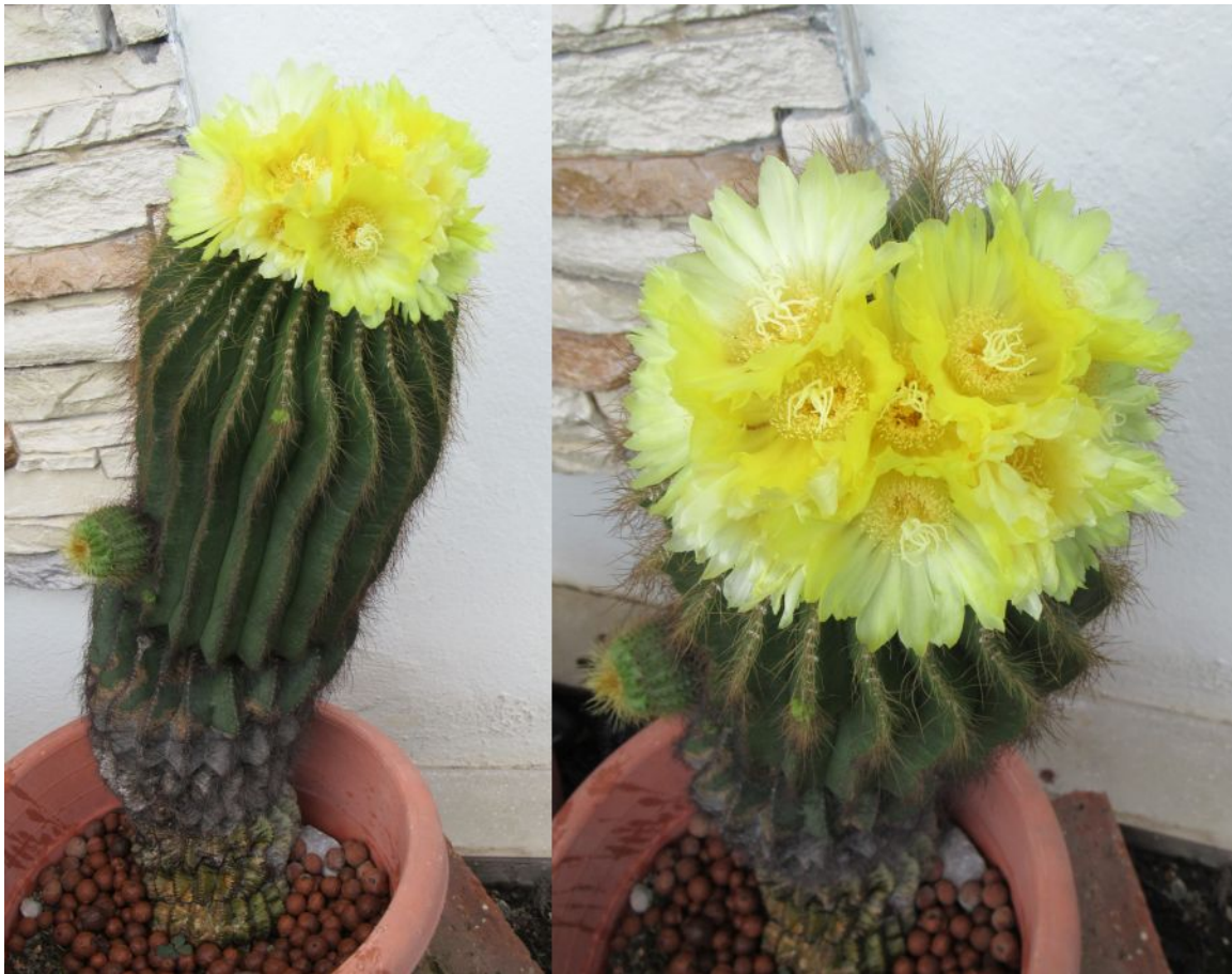
The large PClav five days before that, with 11 flowers open. (December 2020)