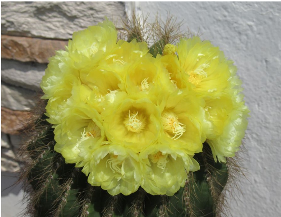
With 16 flowers almost fully open in full sunlight. (February 2021)