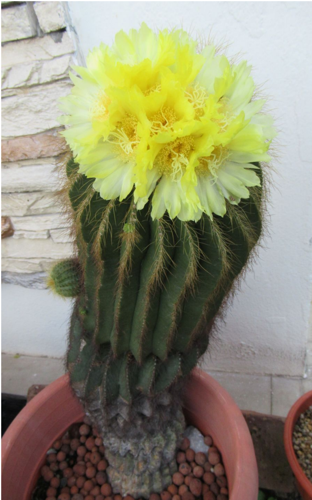
With 9 flowers open the next day. (August 2020)