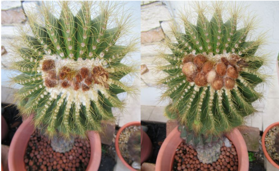
Flower buds shown a week apart on the large PClav, late August 2020.

For the large PClav, growth and flower production appear to be sustained and vigorous. It took many months of spraying before something other than “vigorous flower production” could be observed.