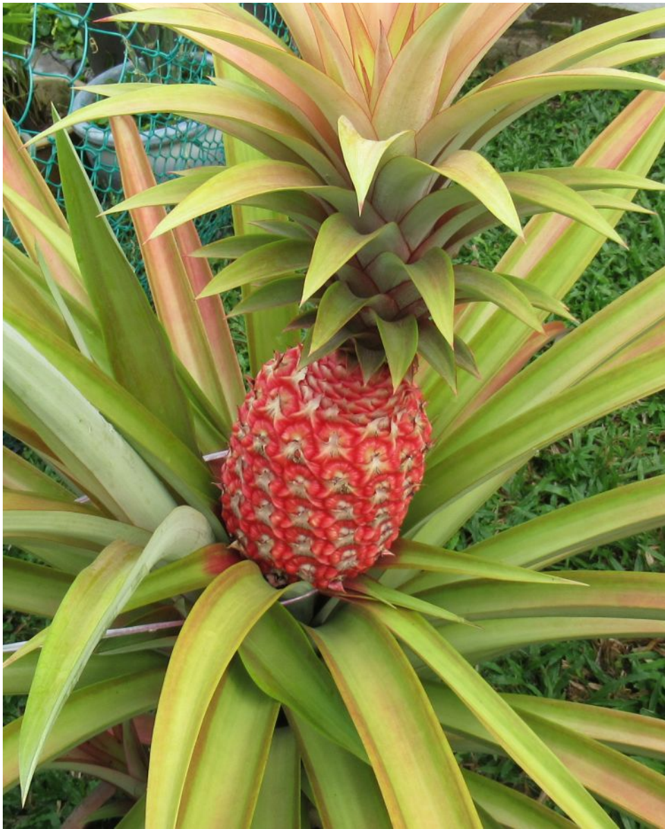
The pineapple plant with its fruit, about a week before harvest in mid-October 2020.

Foliar feeding works for pineapples. The fruit was harvested in late October 2020 – it weighed 1.9 kg. Pineapples are easy-to-grow CAM plants. So if you live in a tropical urban area and you don't want to grow your pineapple plants in the ground, you can grow them in pots 1 . Provide them with adequate nutrition and you will still get to enjoy fairly large fruits.