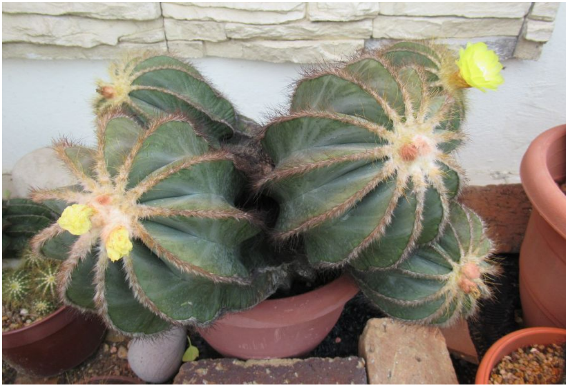
After another 3 weeks, the right rear stem has a flower open. (September 2020)