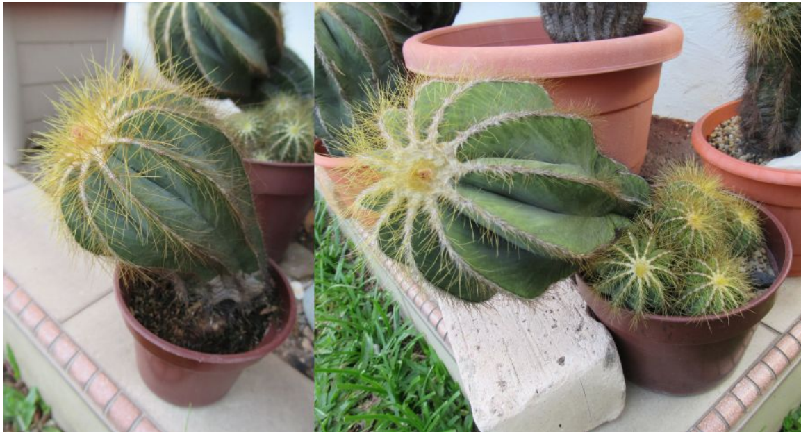
The two PMag specimens with flower buds in late August 2020.