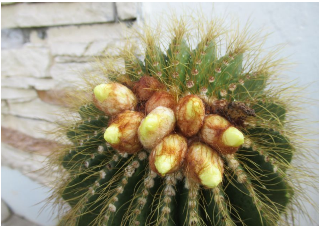
The day after the second picture, with 7 buds opening in the morning. Note that there are 2 more buds at maximum size, ready to open the next day. (August 2020)