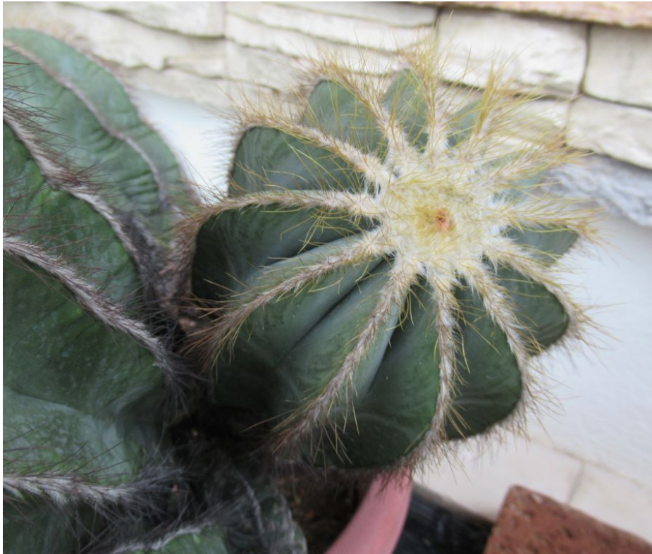
The right rear stem in July 2020 with a flower bud.