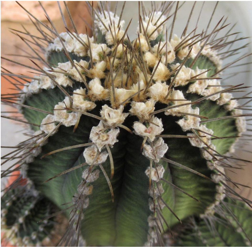
The top of the GSteno specimen with many failed flower buds, August 2020.

As for flower production, many flower buds were produced, but so far all were aborted. Foliar feeding leads to stronger growth, and new areoles on mature Gymnocalycium like this species often appear elongated and probably has the capability to produce flower buds.