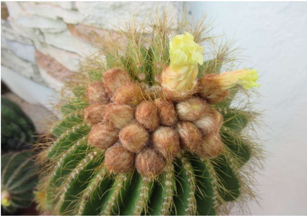
Two days later, the first two flowers have dried up. (February 2021)