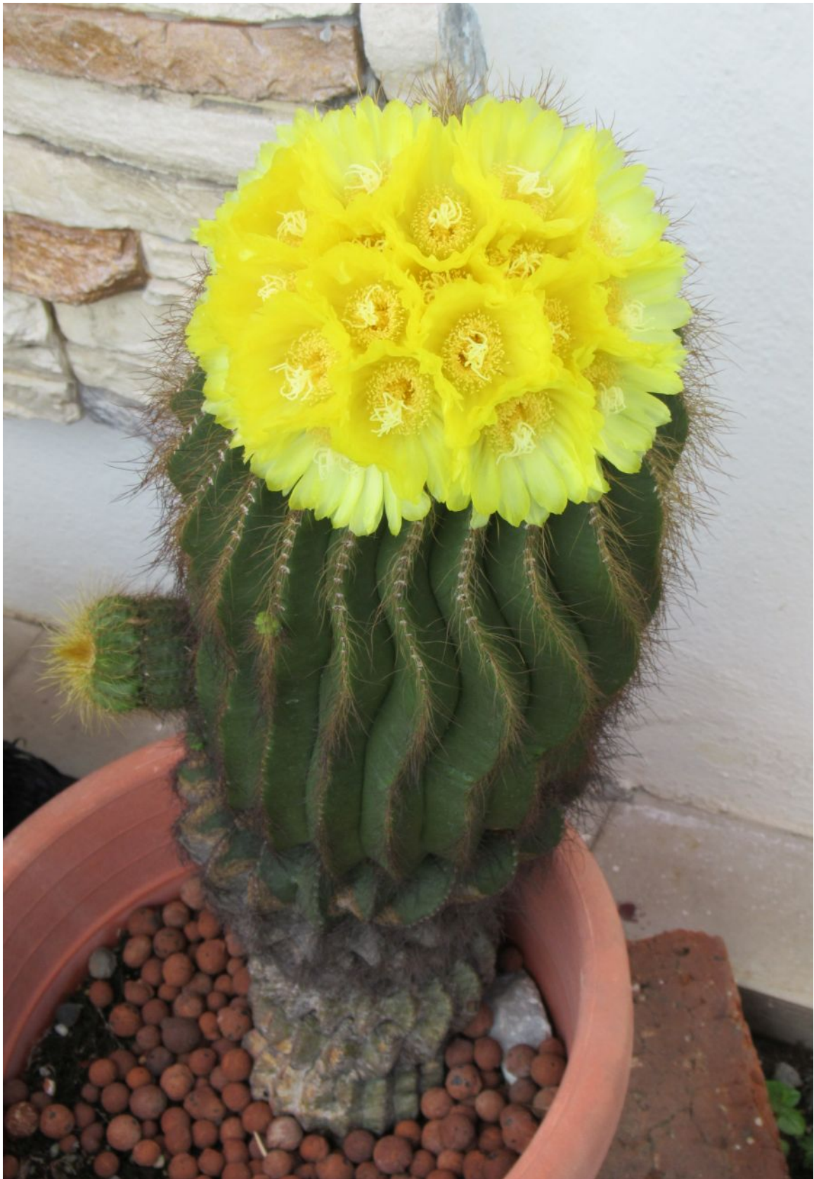
The 21 flowers were fully open in the afternoon. (April 2021)