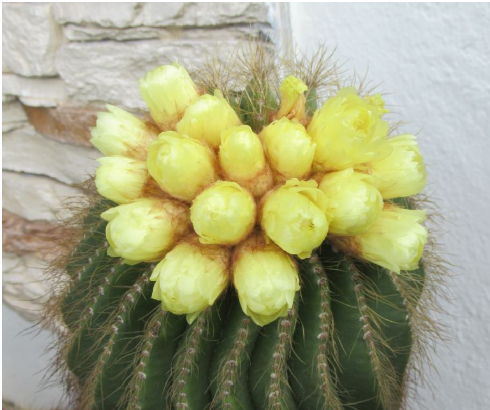
A little later, the 16 flowers were opening. (February 2021)