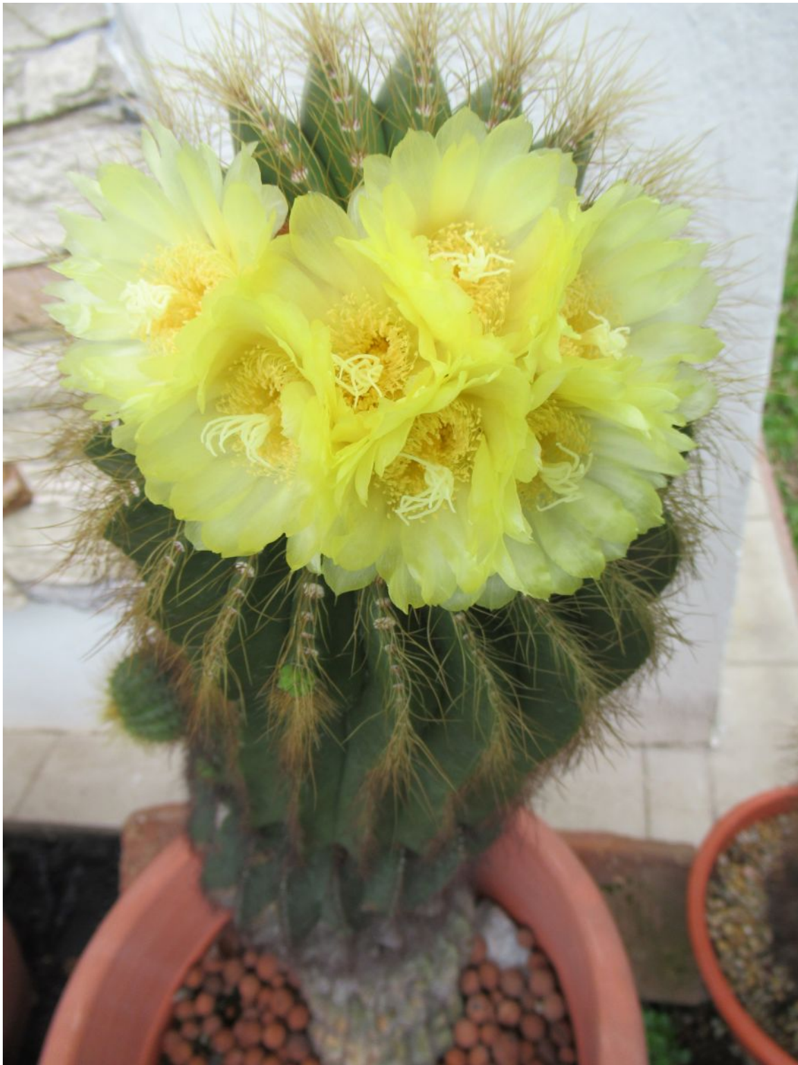
With 7 flowers open later in the day. (August 2020)

Flower production was sustained throughout the year. Stronger growth – a probable direct result of better nutrition – led to the specimen producing ever-larger bursts of multiple flowers. The number of flowers produced by this specimen is reported in the Data and Charts chapter.