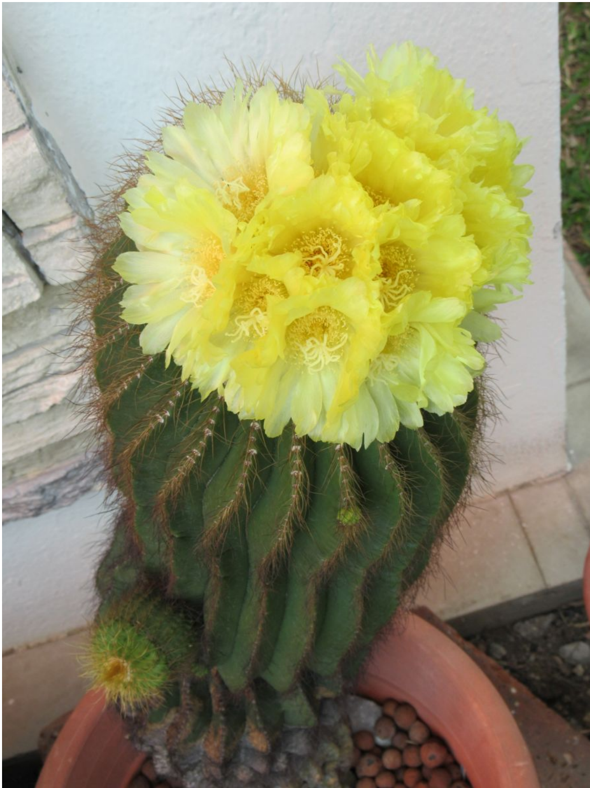
There were still 16 flowers open on the large PClav the next day. Pictures don't fully do the display justice, because it's hard to capture the entirety of the crown of flowers in a single camera shot. The flowers were noticeably smaller than usual, but still impressive to see. (February 2021)