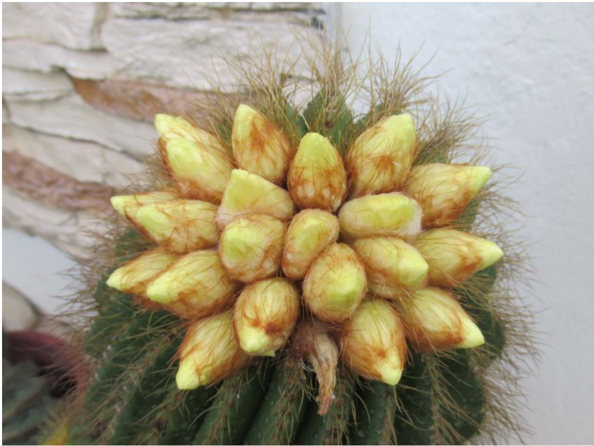
The PClav with 21 flowers opening in the morning. (April 2021)