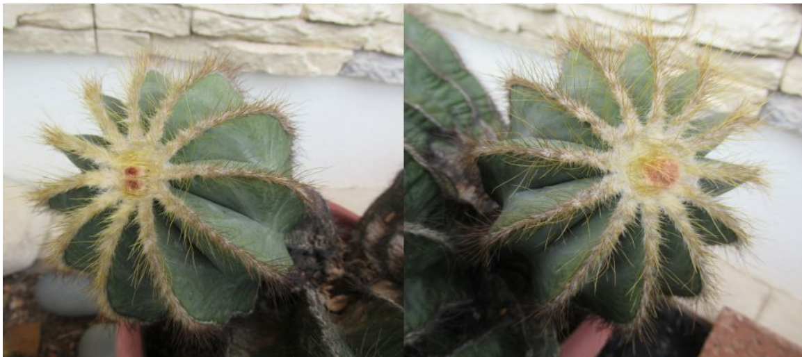
The two rear stems in late September 2020. Both stems still have buds, so all five stems 4 of the specimen are steadily producing flowers.

That's not all. Another two PMag specimens also started to produce flower buds (see next page.) Since the two specimens are likely pot-bound, they will probably be reluctant to produce more flowers. But foliar feeding did push them to produce flower buds.