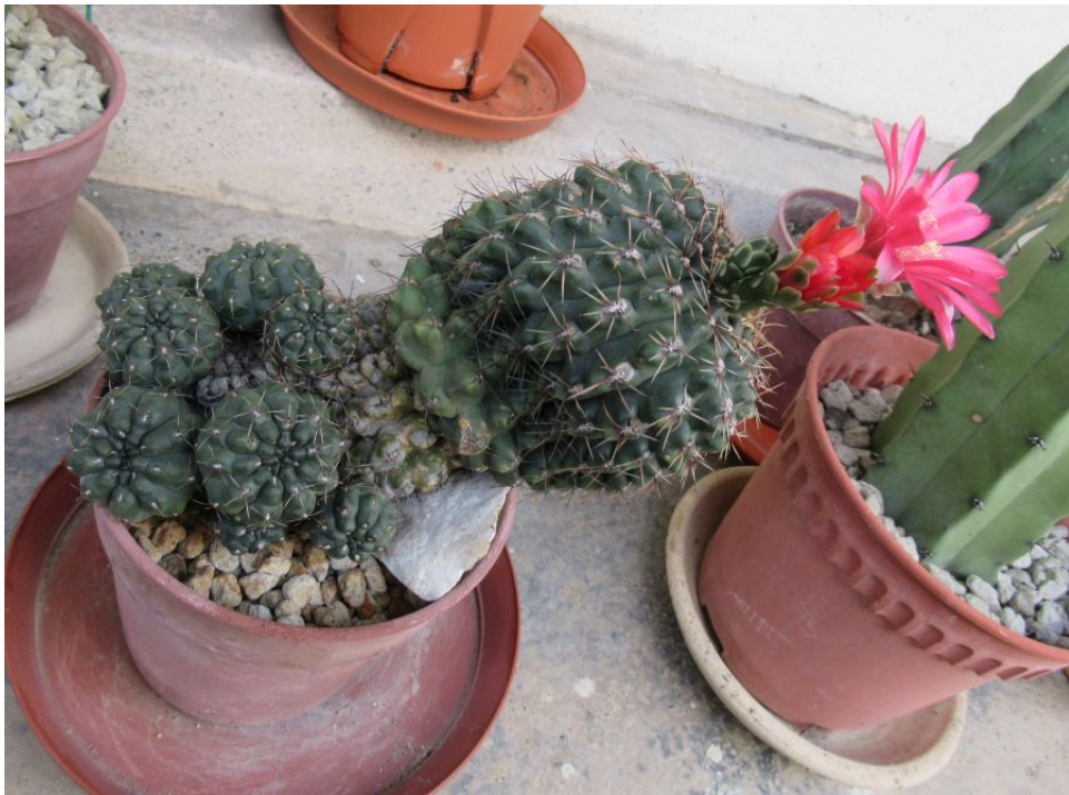
Plodding along at about 3 flowers a month. This is in mid-August 2020. Note the shrunken lower stem of the ex-graft.