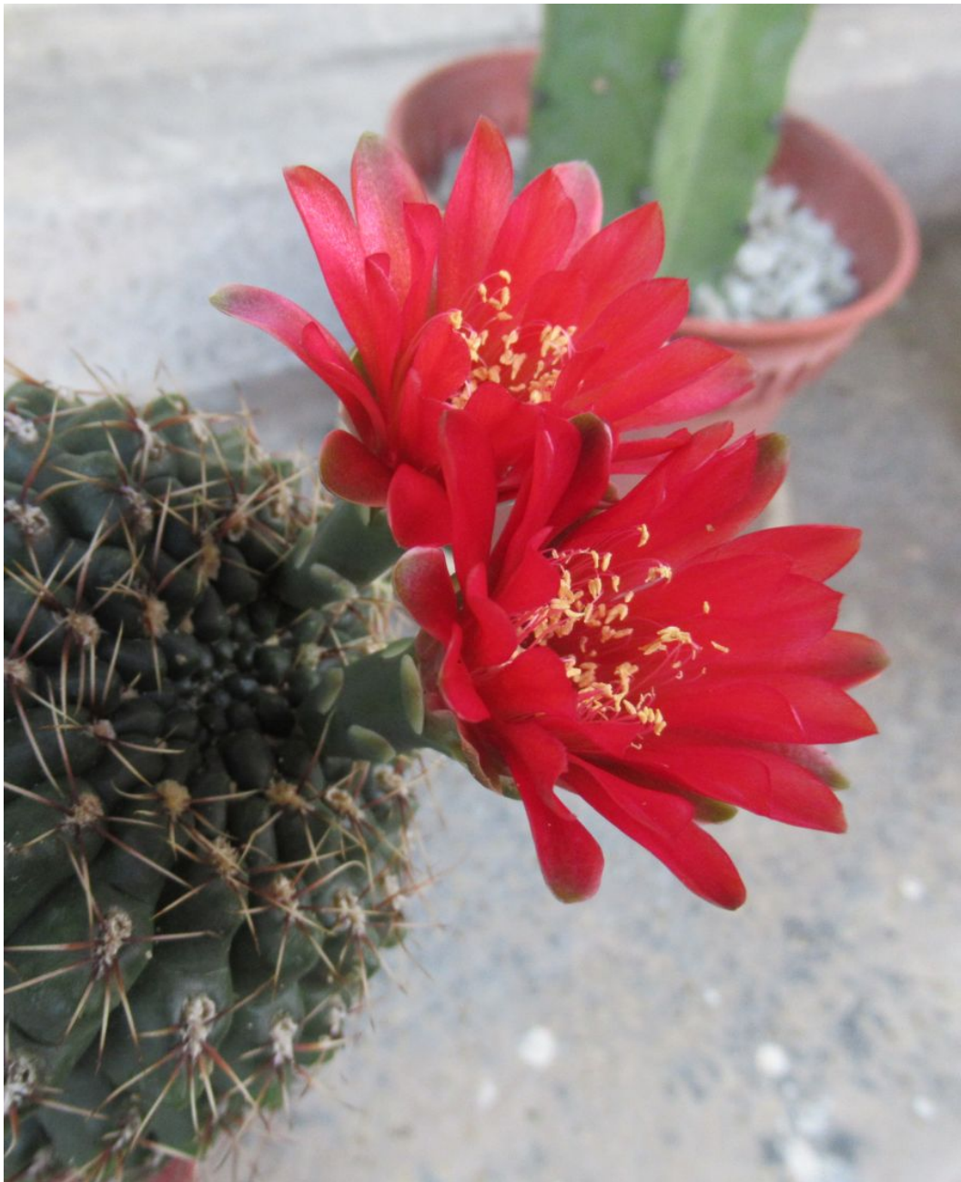
Closeup of two flowers in July 2020. Occasionally the flowers on this ex-graft have an unusually intense red colour that holds up better than usual. The stamens of the flowers, however, do not look healthy.

My GBalds on their own roots display slight seasonal behaviour on an annual basis. You can see this in the Data and Charts chapter, where the number of GBald flowers in 2019 peaks in the first half of the year, then drops in the second half of the year. In Klang Valley, Malaysia, the first half of the year is usually hotter on average, so GBalds probably like to produce flowers in the summer.