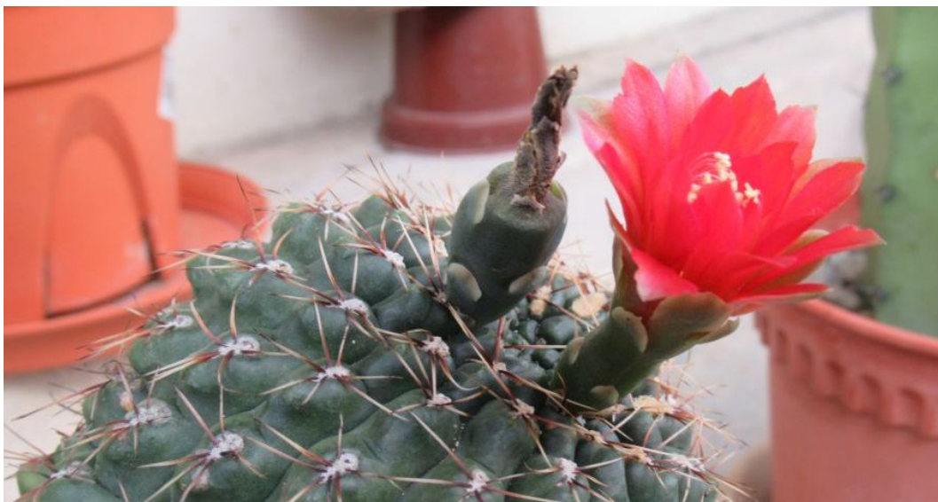
Four days later. That big pod looks promising. Non-viable pods do not usually grow this large. (November 2020)