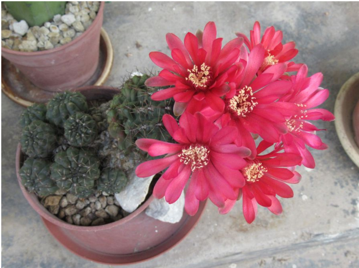
Two days later, there were still six flowers open. (March 2021)

The flower buds that made up the six flowers were pushed out almost at the same time, thus leading to flowers opening at nearly the same time, such as those in the picture above. Sometimes, flower buds on this and other specimens would be spread out. When there are many buds of different sizes, you may end up with flowers on a specimen for two weeks or more, but since they are spread out, the display would not be as impressive as having many open flowers of the same size.