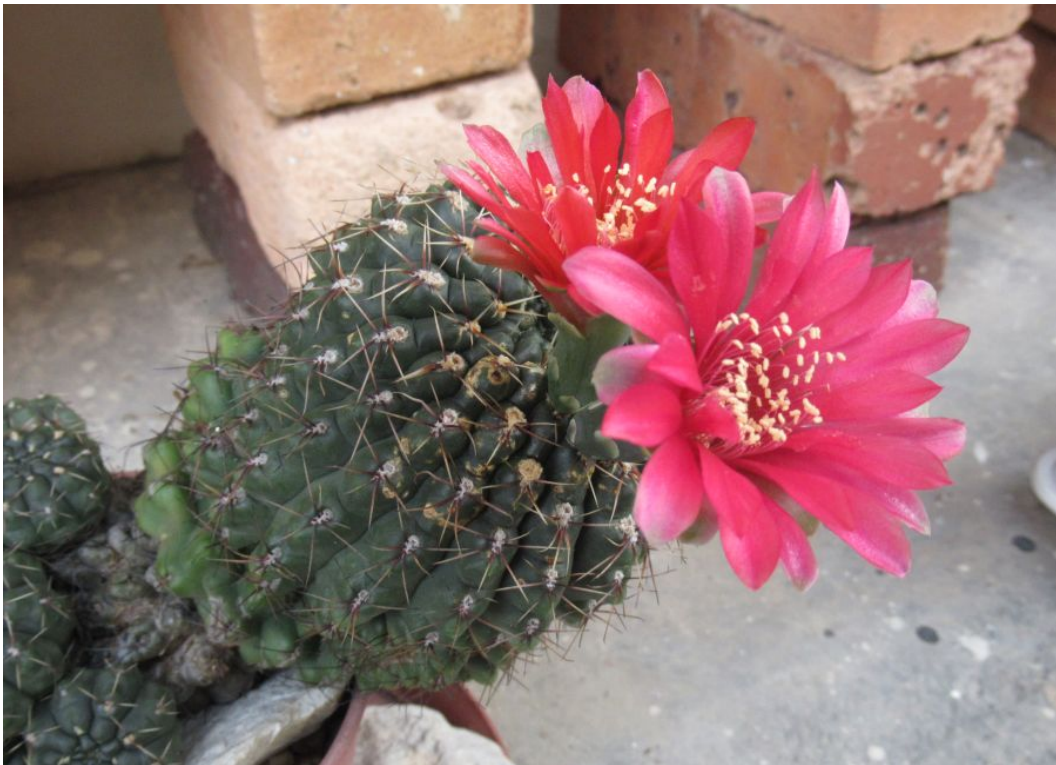
A month later, early July 2021. Not too shabby. The stamens are not great.