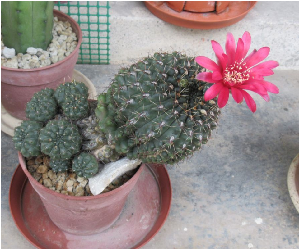
In early November 2020, this flower has better stamens.