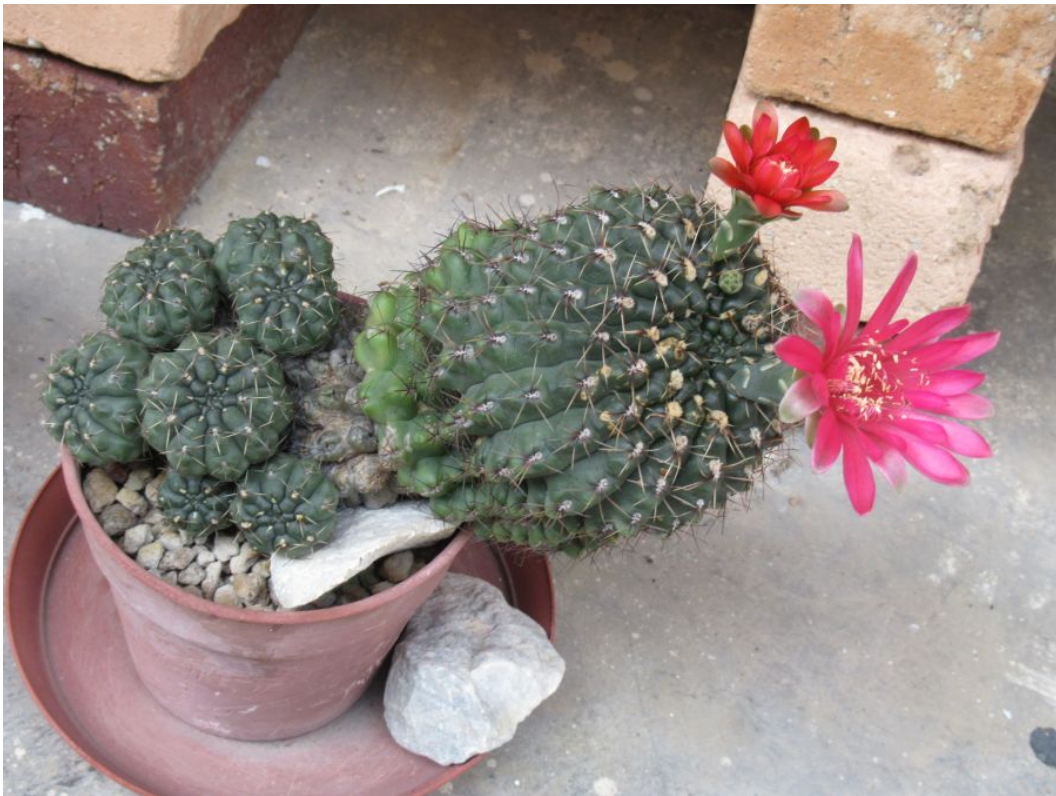
With two flowers in early June 2021. Flowers are now “spaced out”, or further apart in age – there is an old flower, a new flower, and a flower bud.