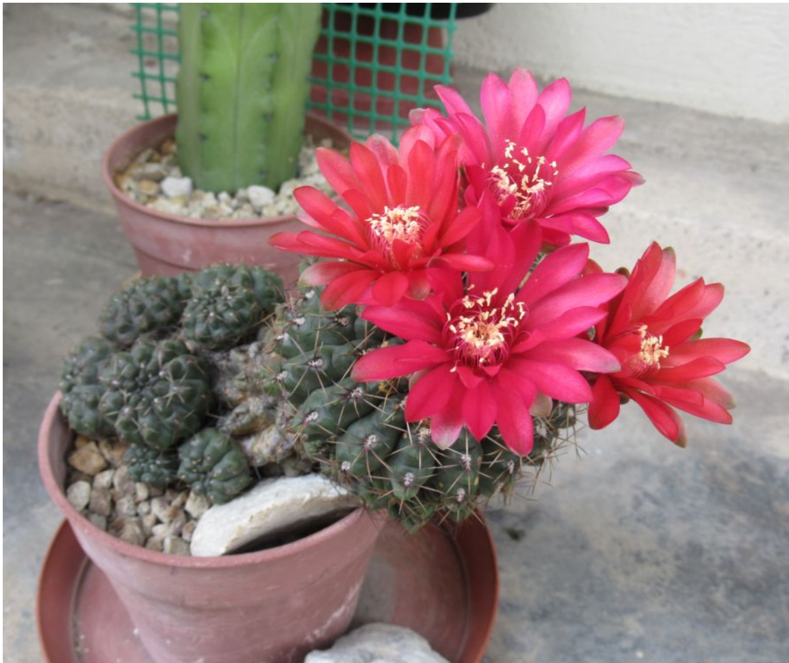
About a month later, the ex-graft GBald produced a display of four flowers. (April 2021)