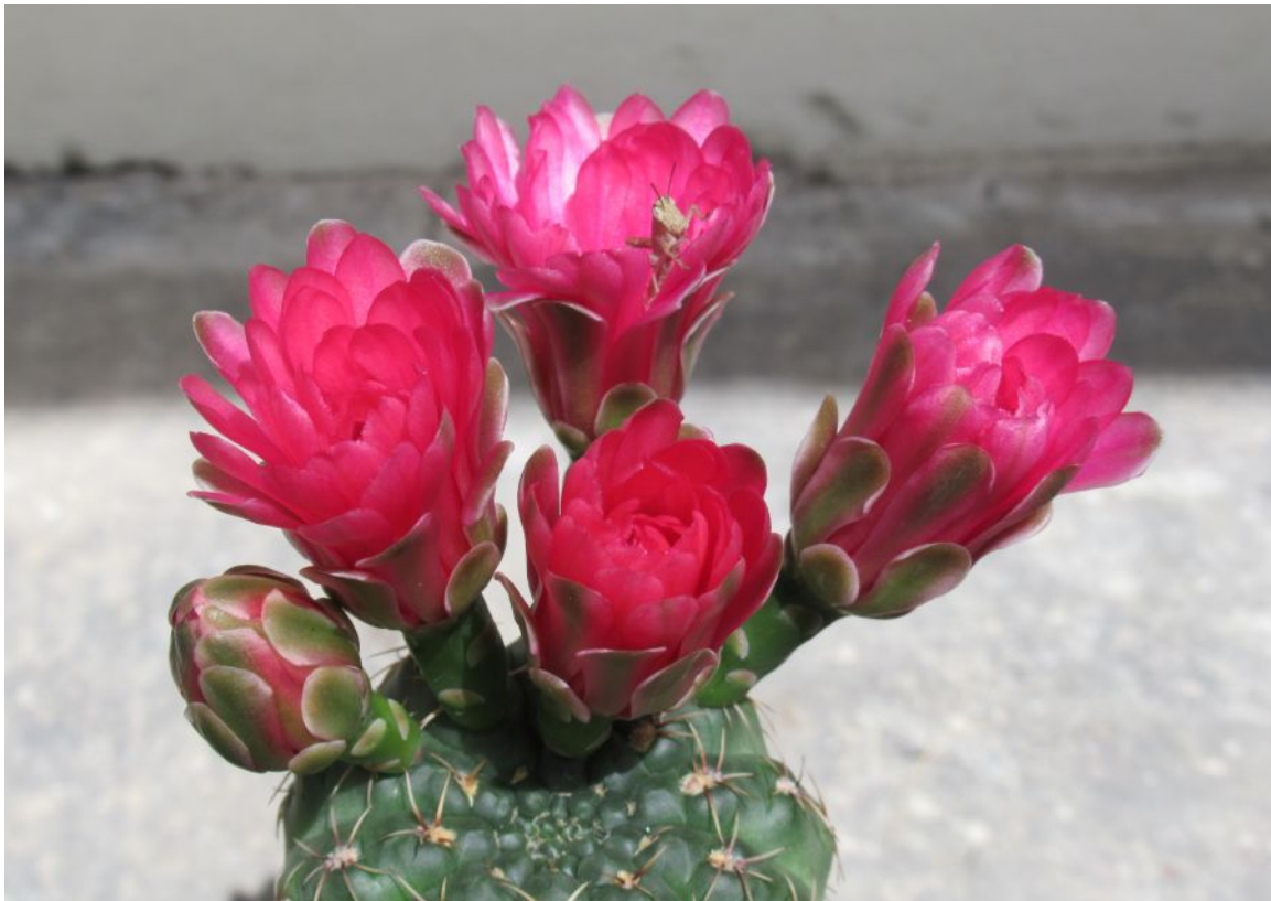
Two days later, a juvenile grasshopper paid a visit to 2019C's flowers. (May 2020)