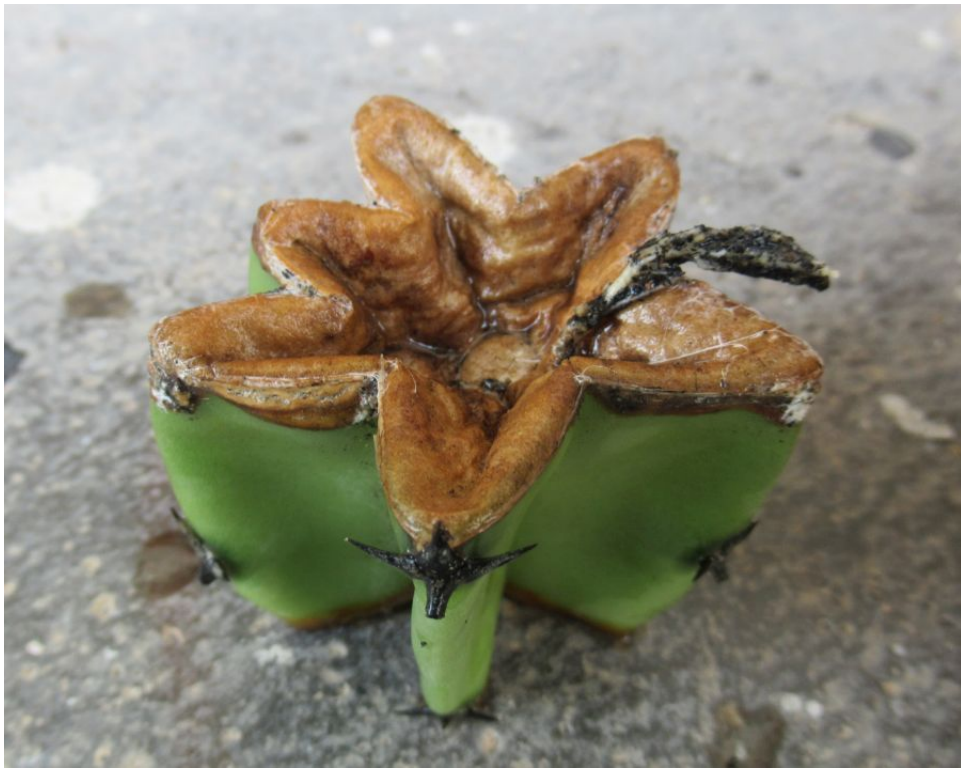
The MGeo top with one root. After about a month, the piece still has one root. At least the root is healthy. (July 2020)