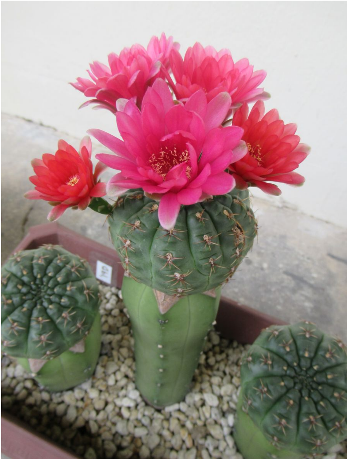
2019E with five flowers at the beginning of August 2020. If the GBald scion is healthy, it can produce a flush of flowers about once a month.