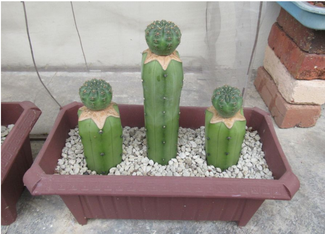
2019DEF in early January 2020. The smallest GBald scion when it was grafted in April 2019 is now the biggest of the six. The ribs on the MGeo stocks can't expand anymore – the stems have become cylindrical. Note the new rib on 2019F at right.