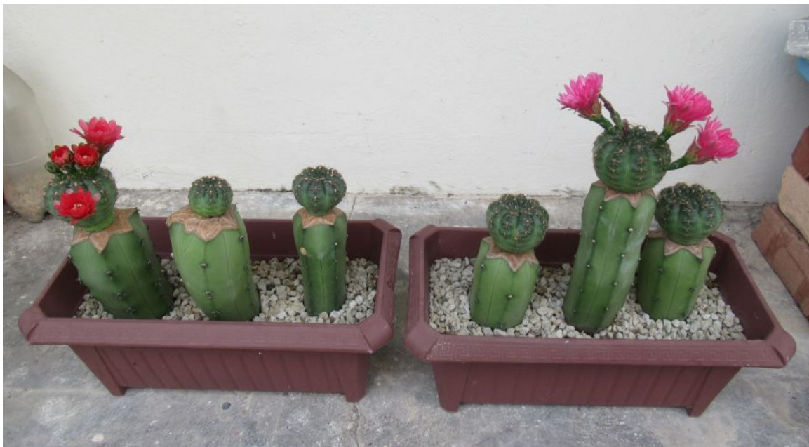
Late May 2020, five days later. 2019C is at the beginning of its third flower flush, while the three remaining flowers on 2019E are on their last legs.

Flower flushes are really constrained by the growth speed of GBalds. One areole can produce only one flower bud, so flower production is limited by the growth rate of the stem. In the tropics, the climate does not change much, so it may not be possible to make these GBalds stop producing flower buds. The weather may be too hot to make them stop flowering. Or these hybrids are simply crazy.