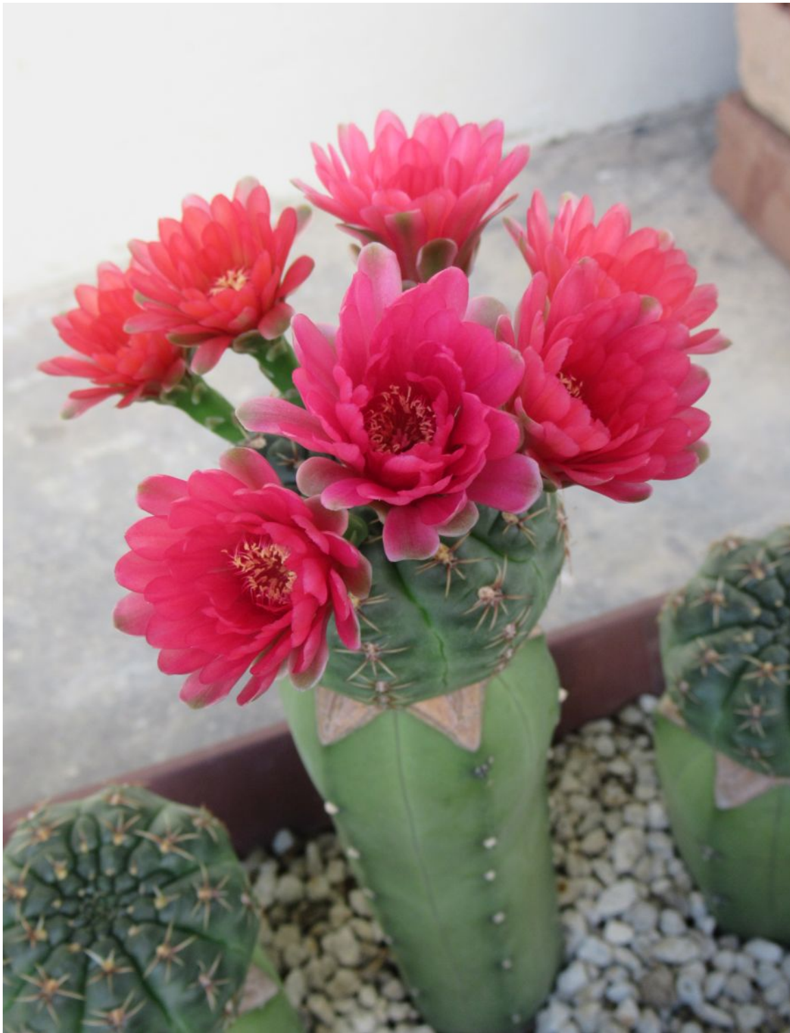
The seven flowers opened normally the next day. (May 2020)

I think seven is the typical maximum number of simultaneous flowers that a GBald can do. I've had many specimens hit seven flowers at a time. Eight or more is not impossible, just very, very rare.