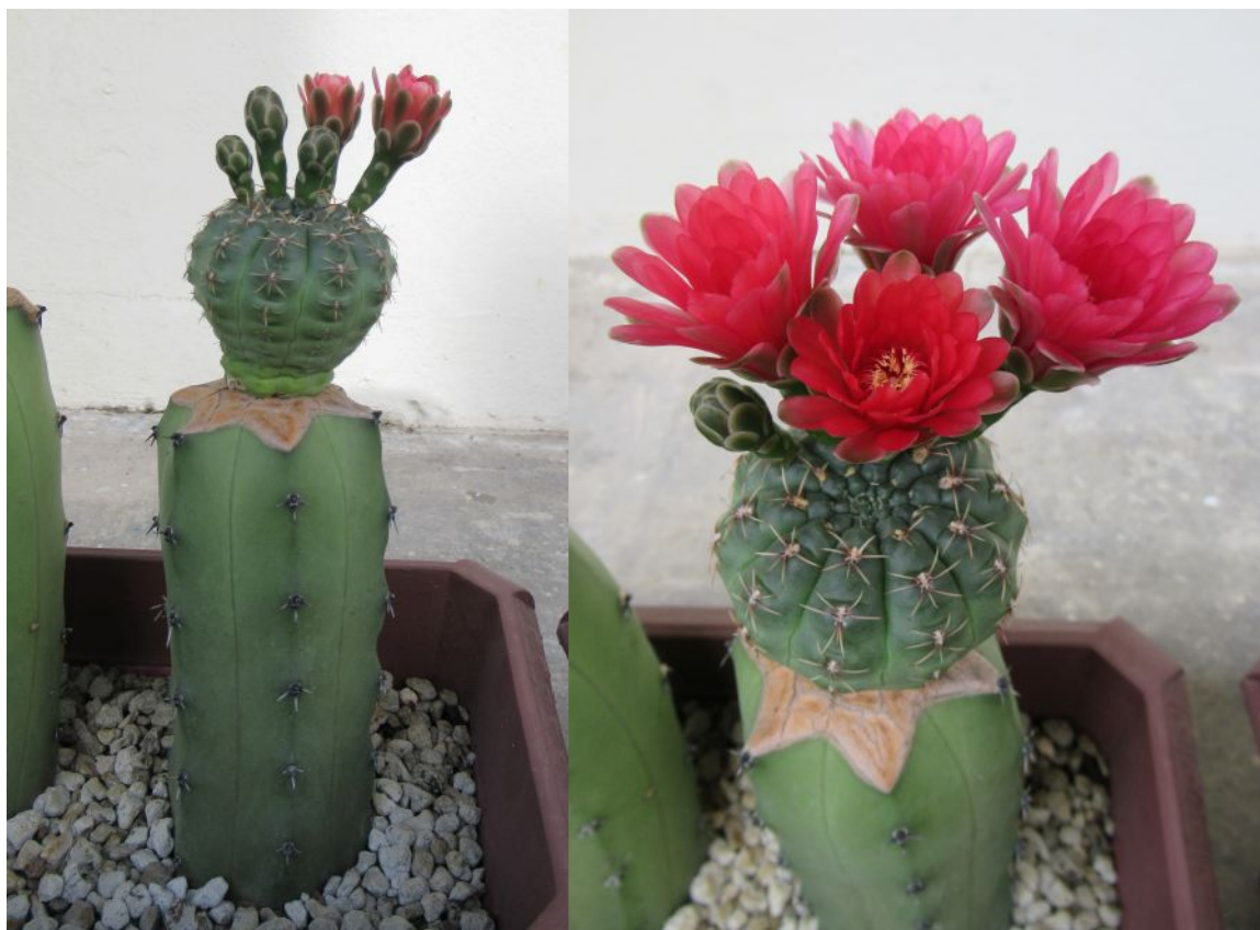
The second flush of flowers for 2019C. Left: Two flowers about to open for the first time. (2020-04-26) Right: Four flowers open three days later. (2020-04-29)

Since 2019C is also a GBald hybrid, its behaviour proved to be similar to 2019E. The second flush of flowers for 2019C also totalled five flowers. For 10 months in 2020, 2019C produced 43 flowers.