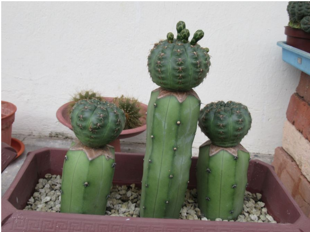
Side view of 2019FED in late July 2020.