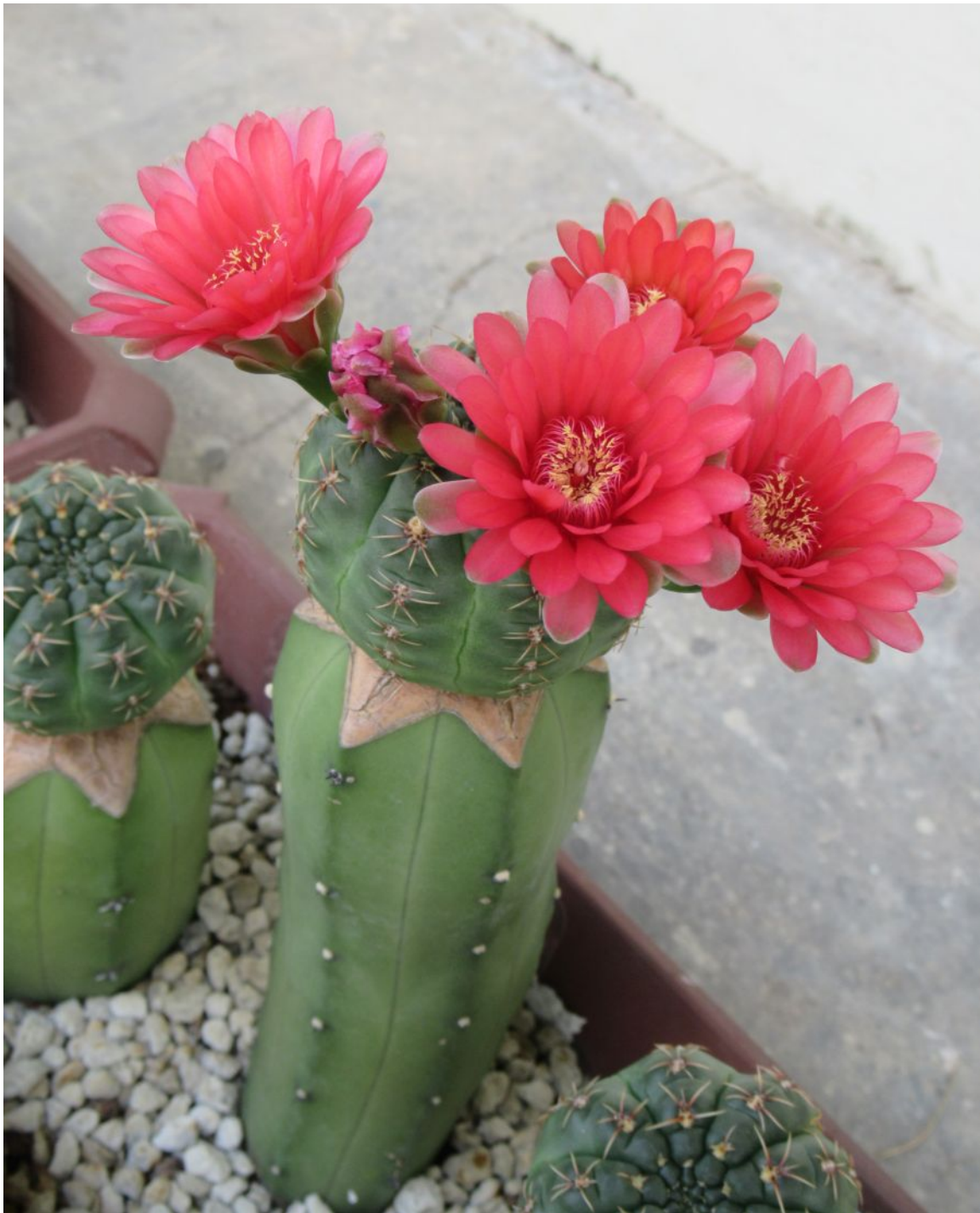
A fifth bud opened the next day, but the oldest flower in this flush had already dried up. All the stamens on the flowers lack pollen. (April 2020)

The downside is increased susceptibility to fungi damage. Also, the scions will all start to shrink or collapse at some point, and keeping fat stems alive will become increasingly more difficult. Having no pollen on stamens is not a huge problem, but I haven't had luck getting seed pods from these hybrids. And when there are many flowers open on the hybrid GBald scions, one can detect a slight rancid smell. I guess this is a GBald hybrid with genetic defects.