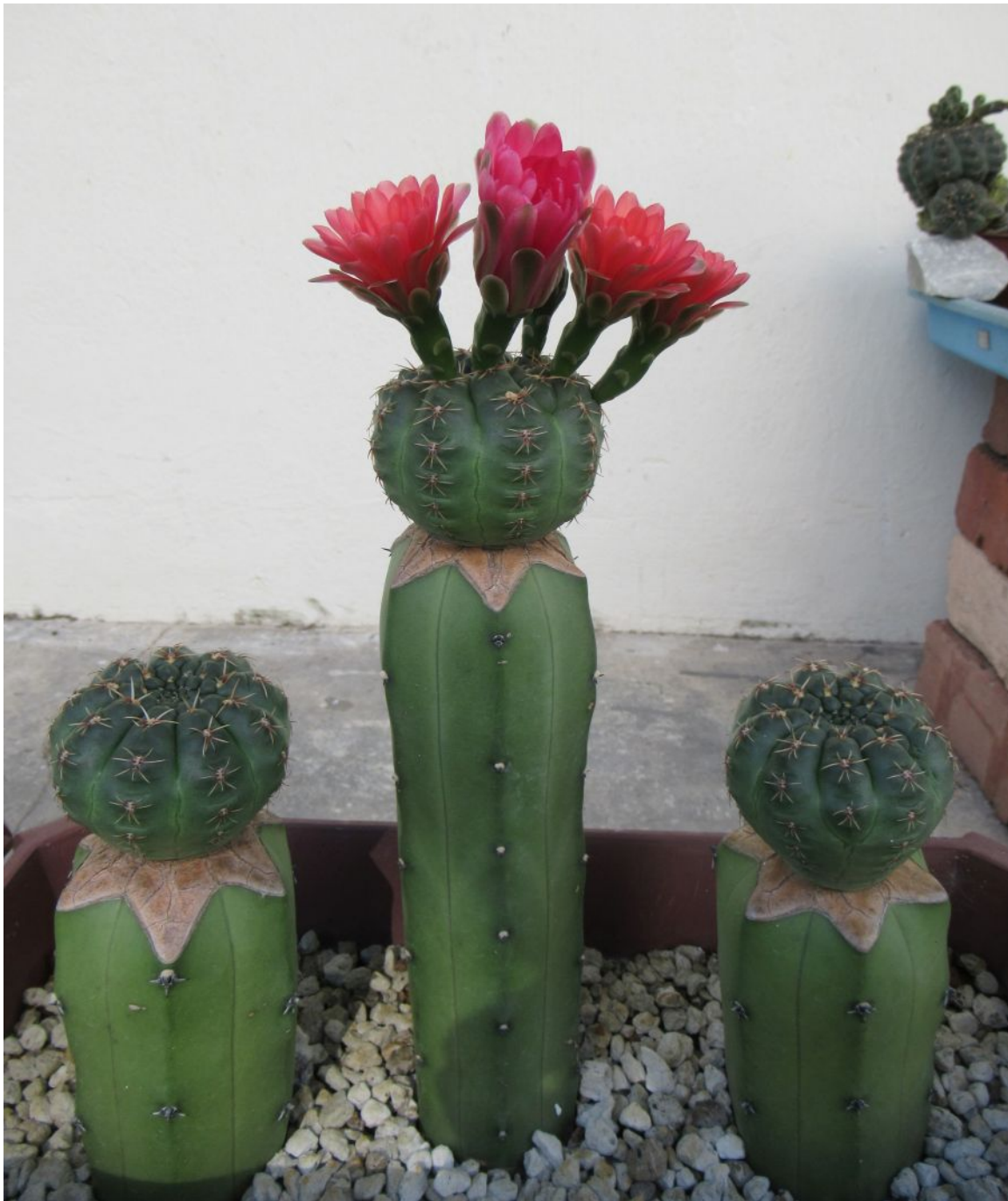
Fifteen days later, there were four flowers open. (April 2020)

There were five buds for the second flush of flowers (I am counting the first flower as the first flush) and the bud on the older areole successfully opened. Thanks to better nutrition and being hybrids, these 2019 grafts appear to be much stronger than the 2014 graft.