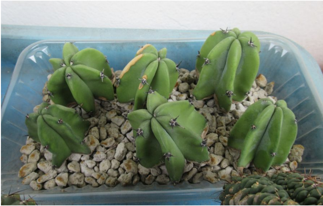
Over a year after being cut, there are still no roots on these MGeo tops. (June 2020)