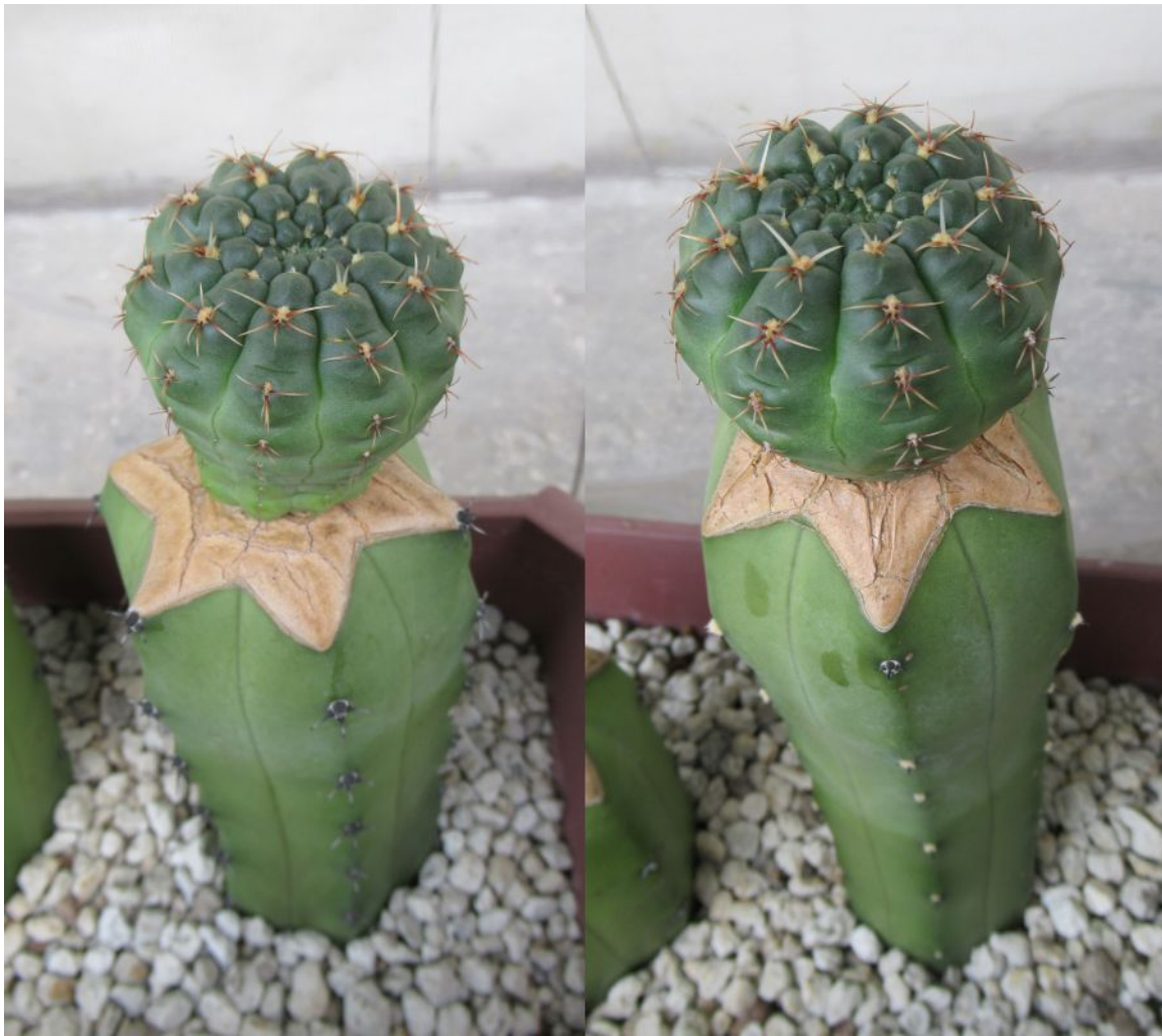
2019C (left) and 2019E (right) in early January 2020.

The above pictures shows the final phase of the scions' growth. Many of the changes are related to the scions changing from juvenile offsets to mature stems that are capable of reproduction – flower production.