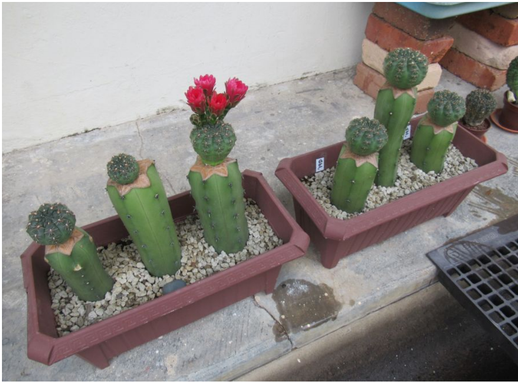
2019ABC and 2019DEF at the end of April 2020.