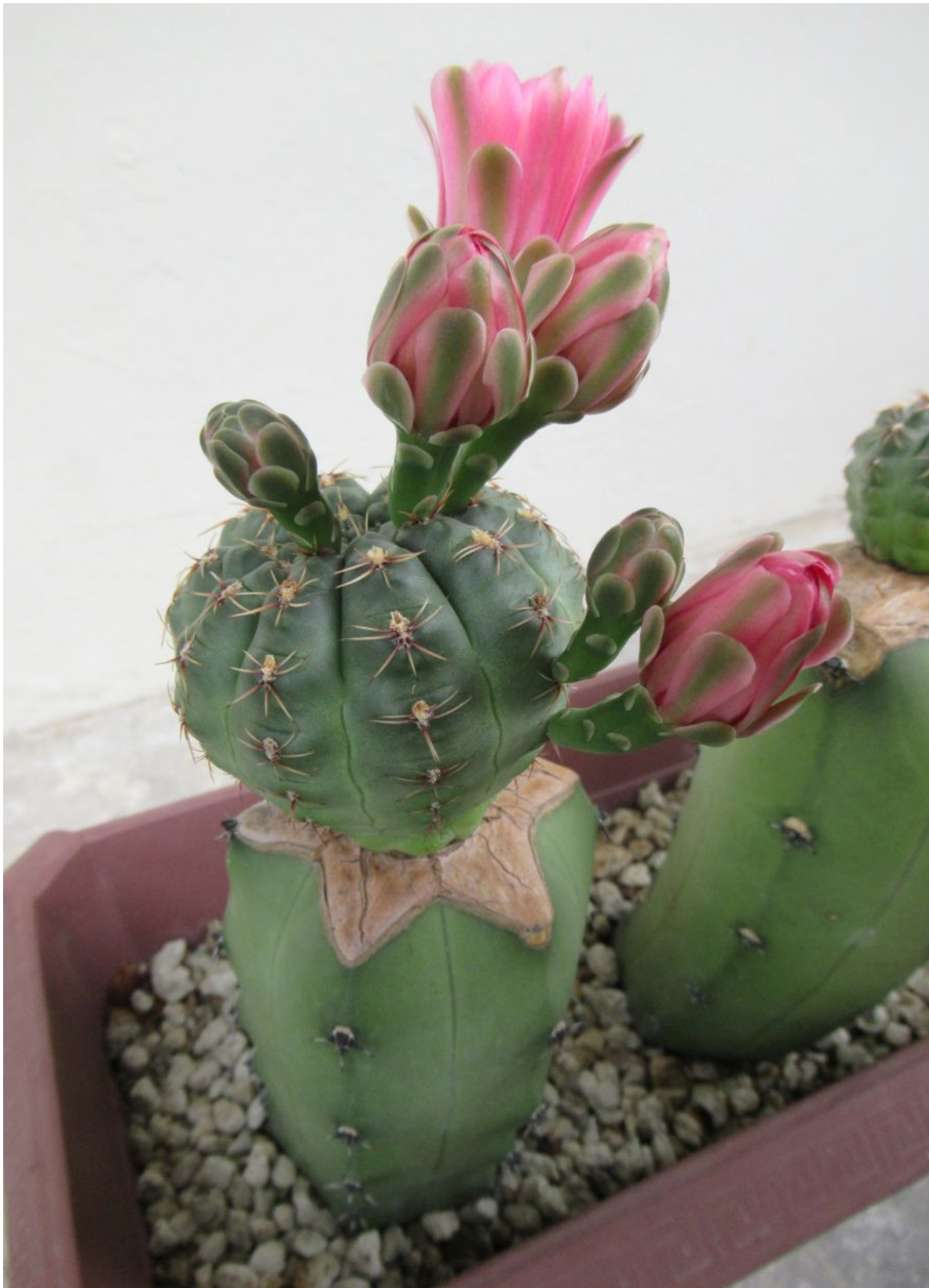
2019C the day before. Note the two flowers lower down the stem. Flowers normally do not appear on the lower stems of GBalds, but these two are arguably still part of the new 'mature' part of the stem. (May 2020)