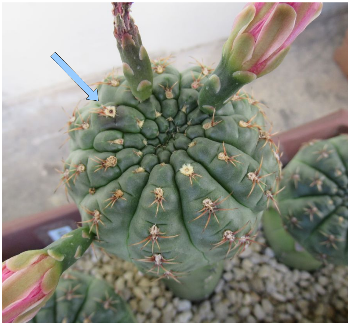
2019E in early August 2020. Another black patch has appeared (blue arrow). This picture shows the beginnings of the black patch. There is what looks like a drop of dark fluid in the flower scar.

In the tropical urban environment, a major source of fungal spores may be moldy walls. While most paint products have some kind of fungicide mixed into the paint, mold and fungi will still get the upper hand because the hot sun eventually degrades the paint. This is an aspect of the tropical urban environment that growers need to be aware of. Remember, it's not a benign environment.