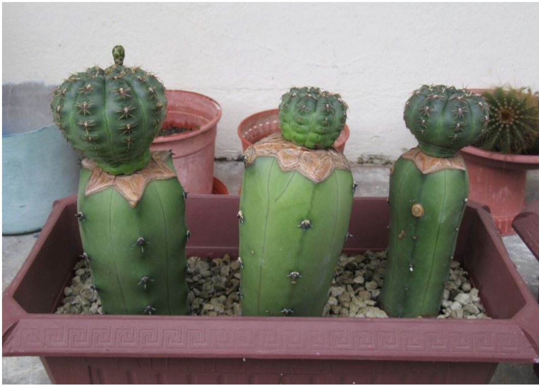
Side view of 2019CBA in late July 2020.