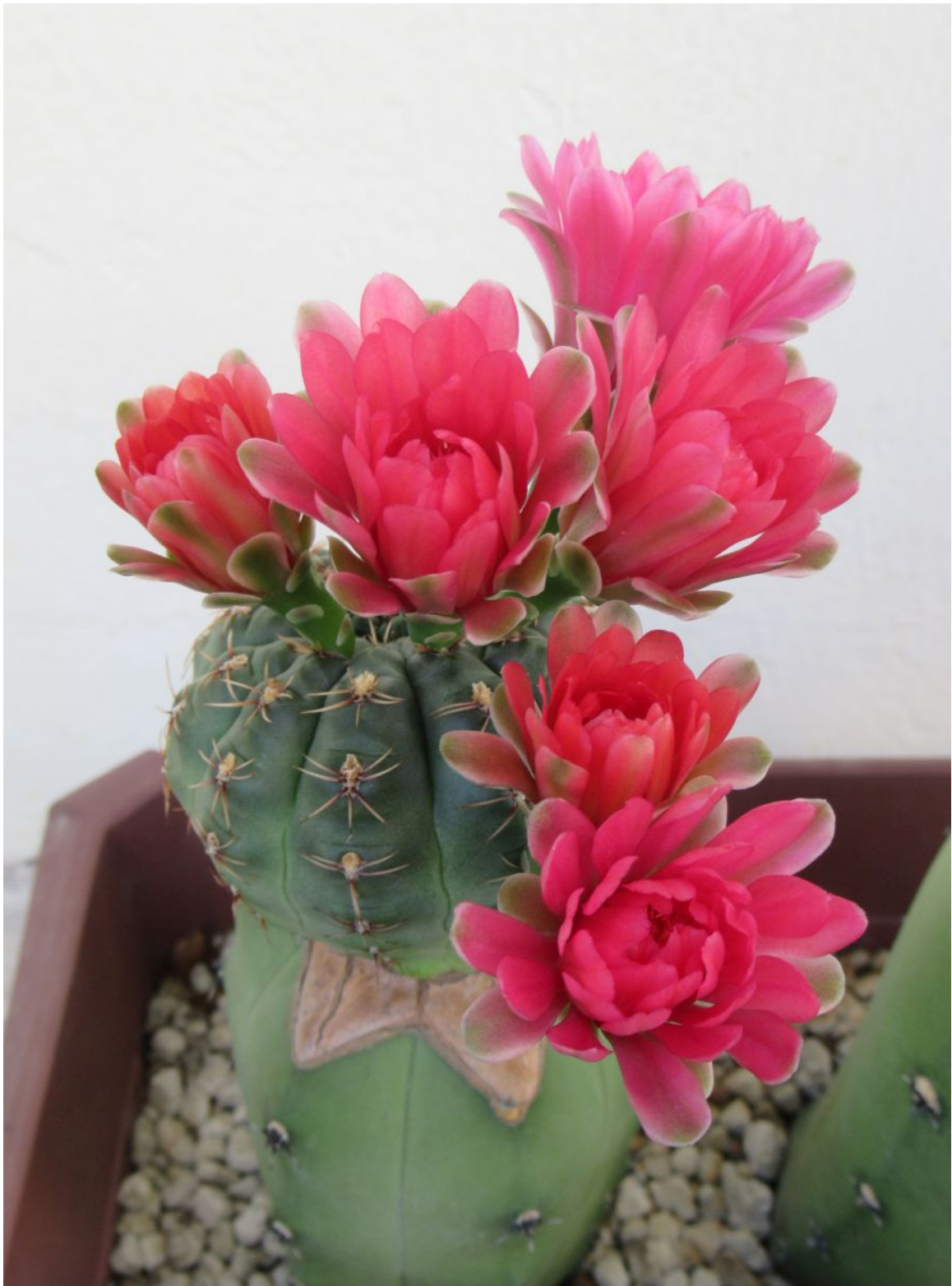
2019C with six flowers not quite fully open, three days later. (June 2020)