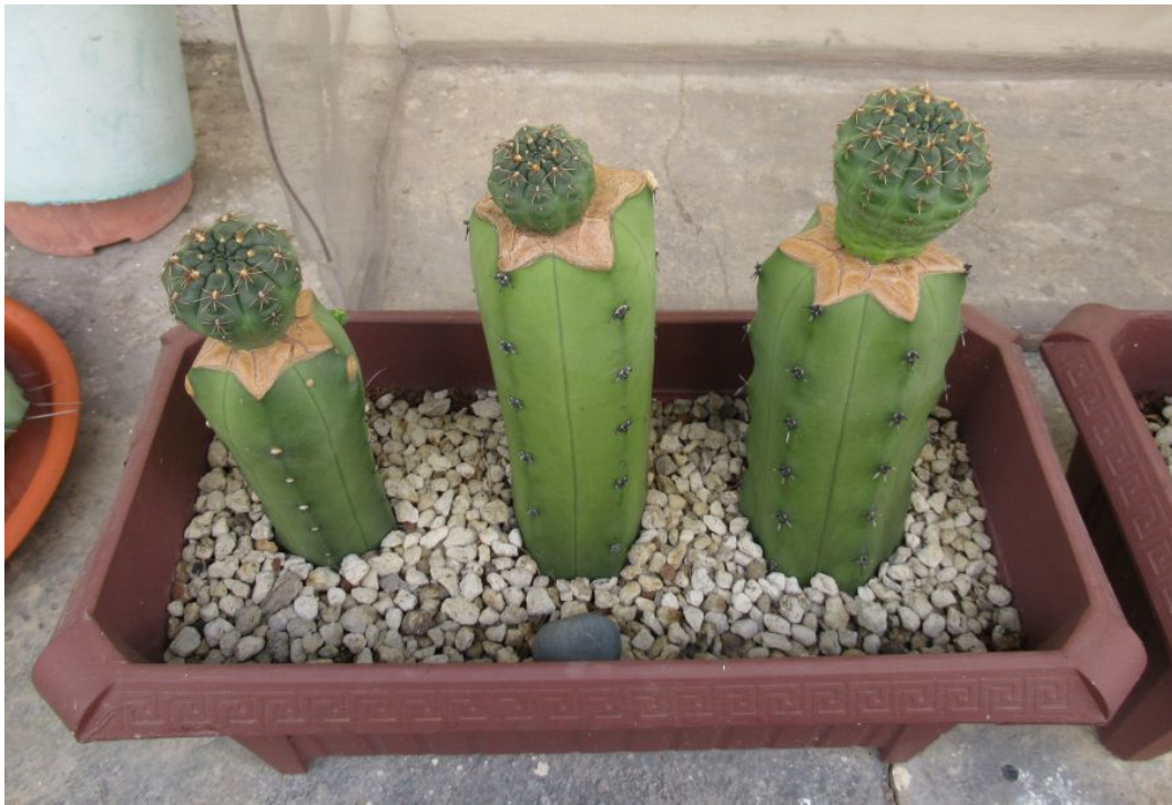
A month later, 2019ABC in early February 2020.