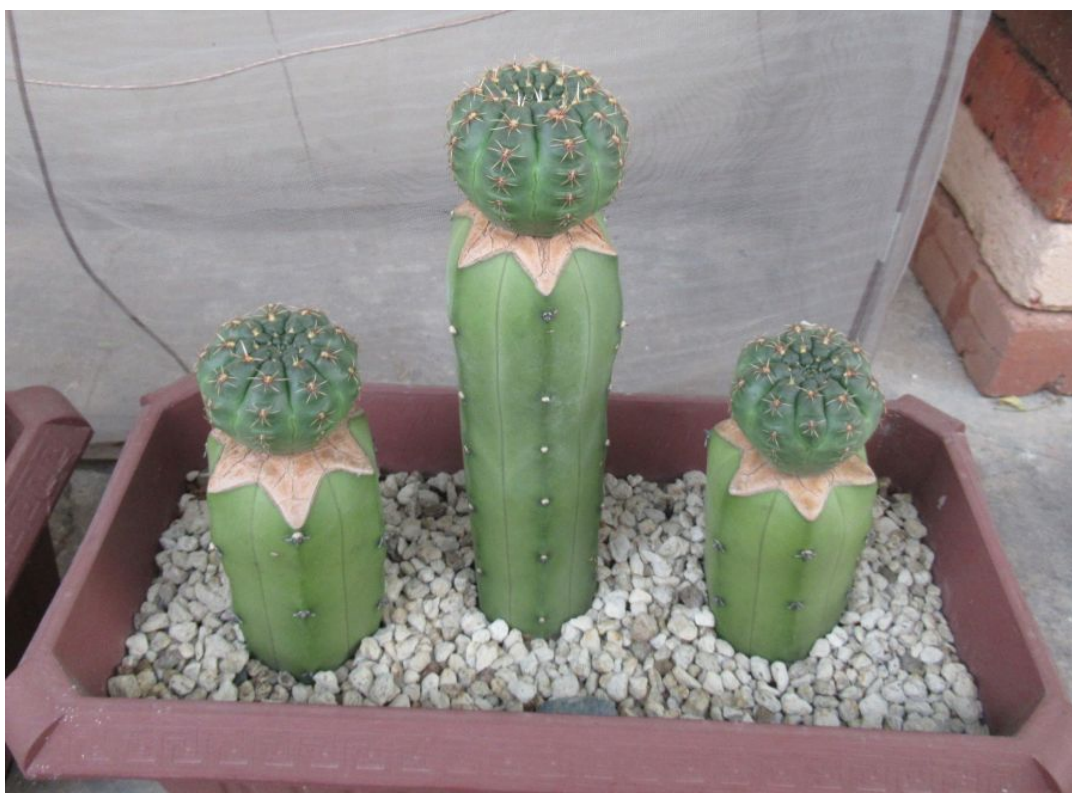
2019DEF in early March 2020. The new rib on 2019F may not have grown a lot in one month, but the stem of the scion has expanded as a whole.