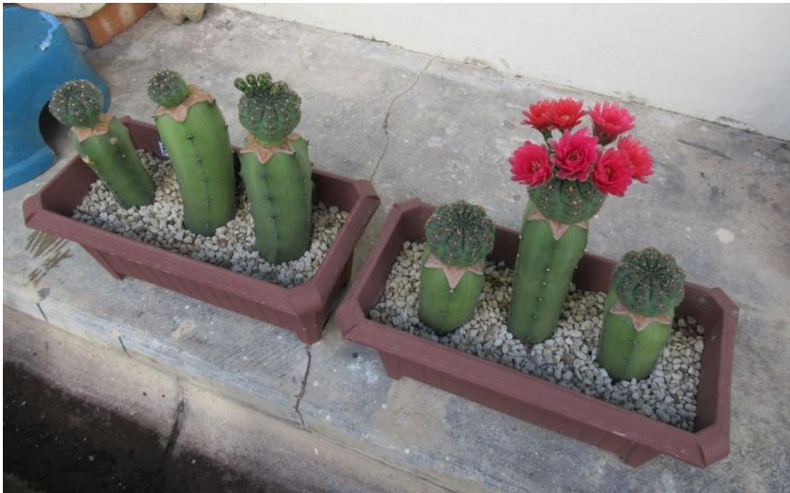
All six of the GBald-on-MGeo grafts on the same day. (May 2020)