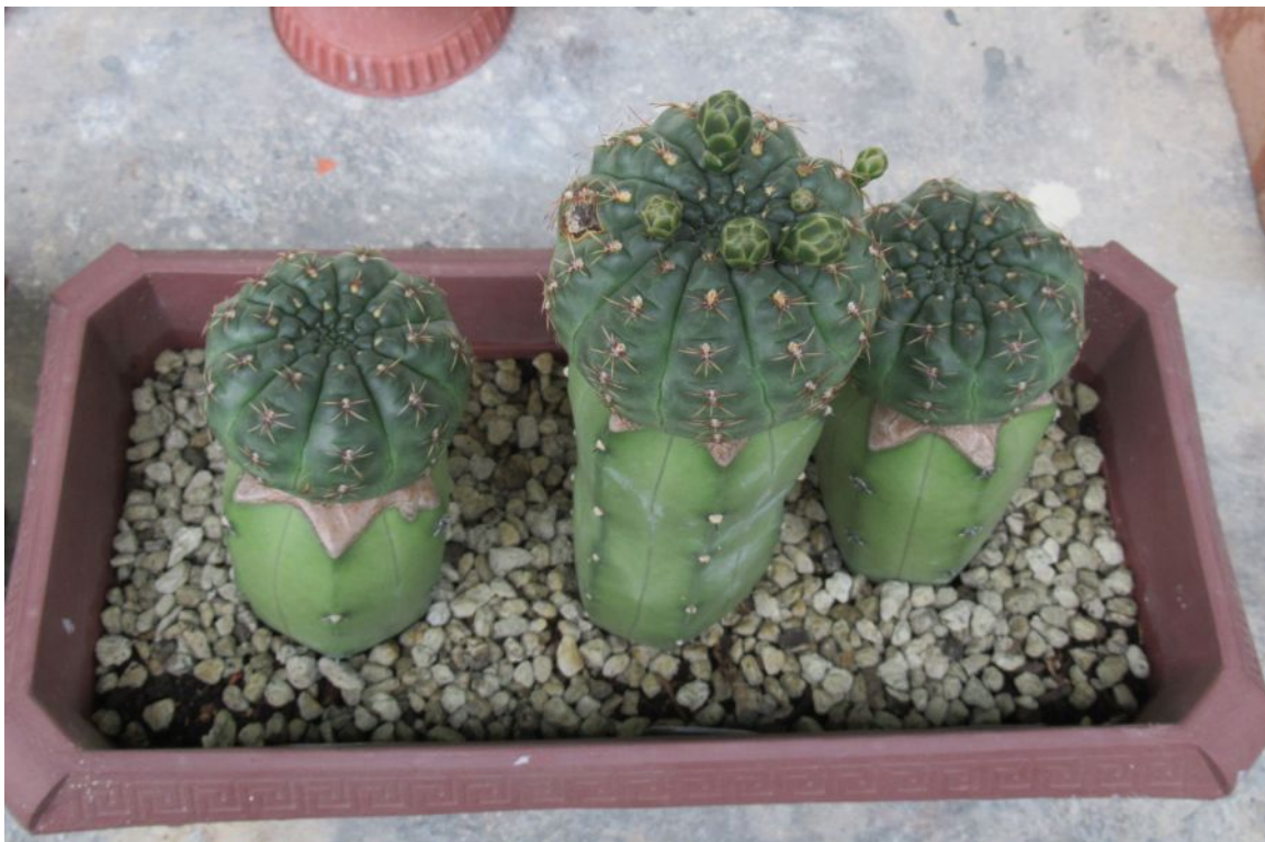
Top view of 2019FED in late July 2020.