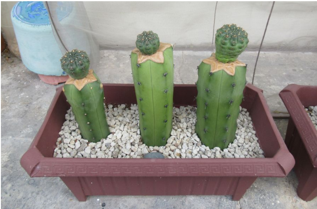
2019ABC in early January 2020. (The wire-frame netting enclosure behind them was made for growing vegetables, and is not related to my efforts in growing cacti.)