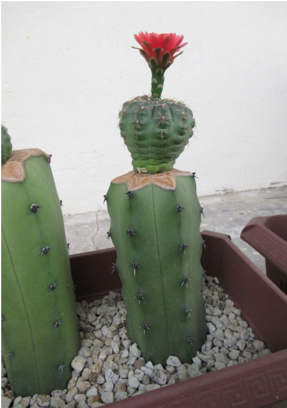
2019C with its first flower in late March 2020, 16 days after the bud was first detected.

So there you go. In the tropics, I think it's easy to get GBald flowers by grafting GBald onto MGeo. The only problem with this kind of graft is the spines on MGeo. These specimens must be handled with care: not for the plants, but for the well-being of your hands. Also, I strongly suggest that you do not consider these as perfect specimens: the GBald scions are too bloated to be truly healthy. But the flowers are awesome because bloated stems are able to push out many buds. It's a blast.