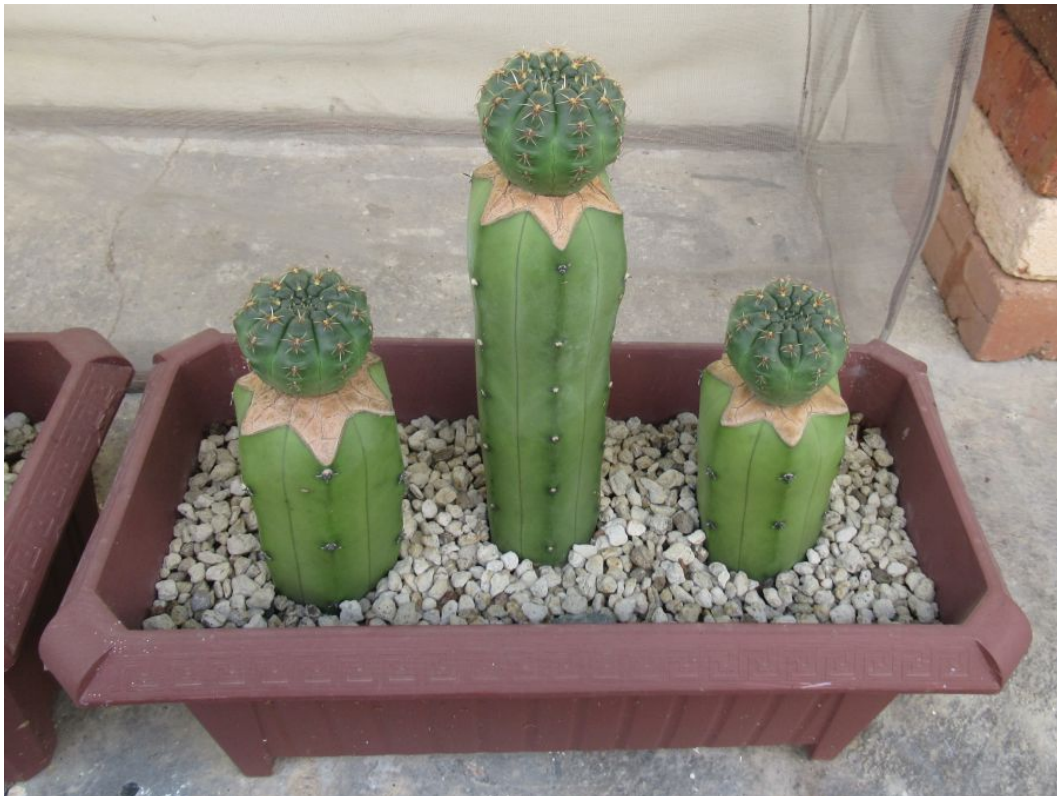
2019DEF in early February 2020. If you compare these pictures to those from a month ago, you can easily see the changes in the size of the GBald scions. The new rib on 2019F has grown a bit.