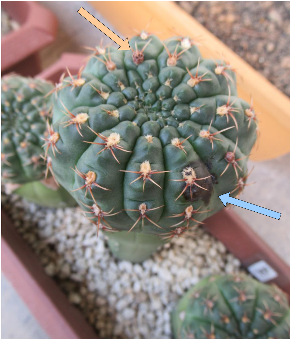
The first fungi attack on a post-flower areole (blue arrow) of 2019E, early June 2020. Note also the dry flower bud (orange arrow) – this was one of the aborted buds from the second flush of flowers.

This problem with fat GBald stems in the tropics is described in the Battling Bugs chapter. When a GBald flower drops, the flower scar on the areole becomes a temporary weak point. During a bout of wet weather, post-flower areoles may be susceptible to fungi attack. Black patches are generally non-existent during dry weather – a clue that fungal spores may be involved.