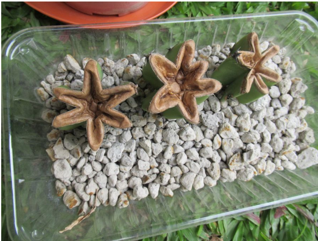
The underside of the headless pieces. The middle piece has a root nub! (June 2020)