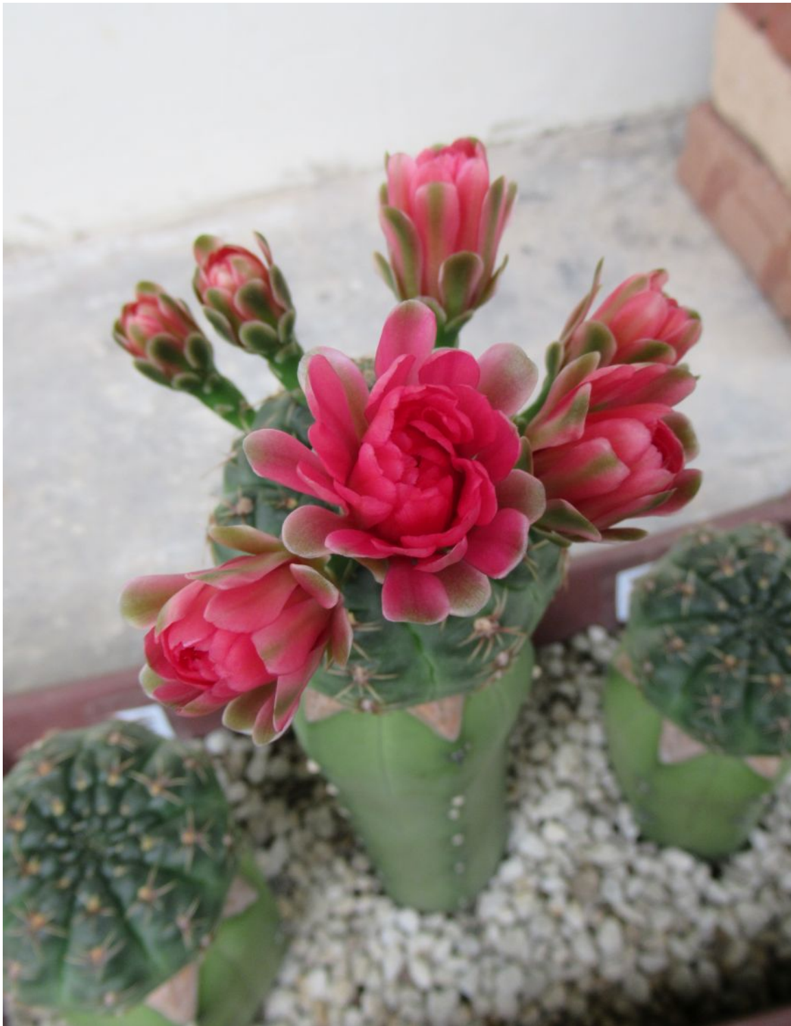
2019E with seven flowers, ten days later in late May 2020. This picture was taken in the evening, so the flowers may not have opened properly due to rainy weather. The planter box is now facing the normal way – 2019DEF. The laminated labels visible in many pictures were added in late April 2020.