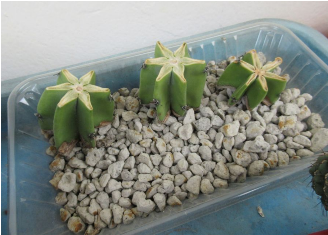
The three headless MGeo tops after 6 days, in late June 2020. The weakest piece on the right is clearly drying up and dying, too weak to survive.