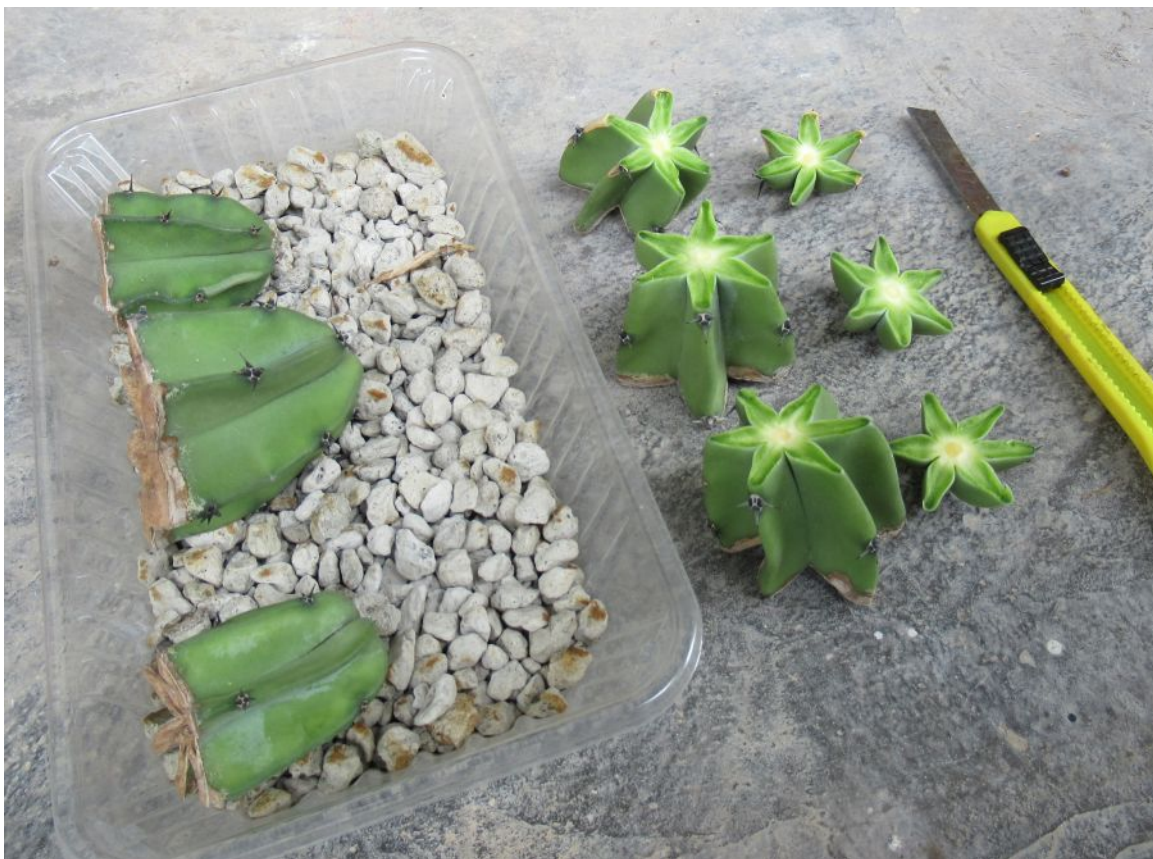
Three of the MGeo tops on the right had their growing points cut off. The other three in the pumice tray on the left were buried in recycled garden soil in a pot. (June 2020)

Since it is suspected that the growing point is suppressing root growth, three pieces had their growing point or apex cut off – I will call these the headless MGeo tops. Initially they were left in the pumice tray. The other three were buried in recycled garden soil as an experiment. In the event, the three that were buried in soil as-is did not survive the experiment, rotting in the space of a few weeks. The soil in the pot did not manage to coax a single root out of the three pieces.