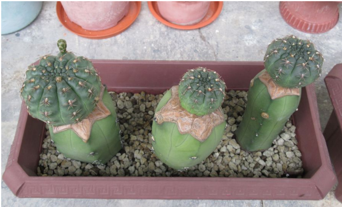
Top view of 2019CBA in late July 2020.

2019CDEF are crazy hybrid GBalds, while the normal GBalds – 2019AB – are slower-growing.