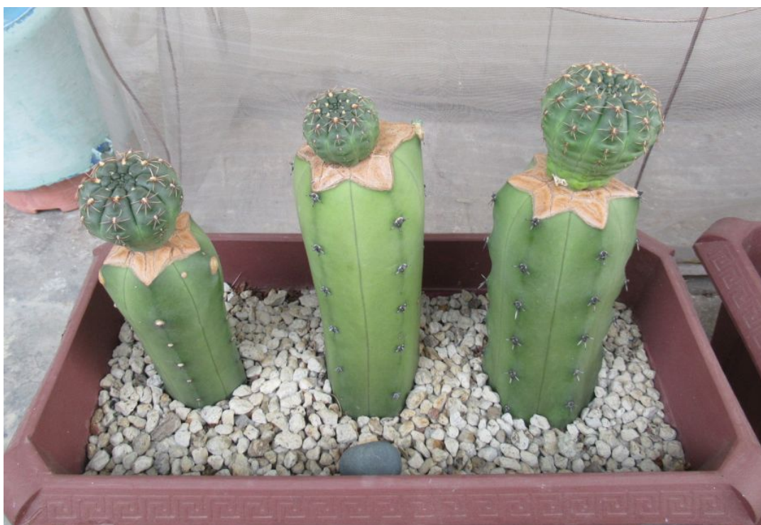
2019ABC in early March 2020.