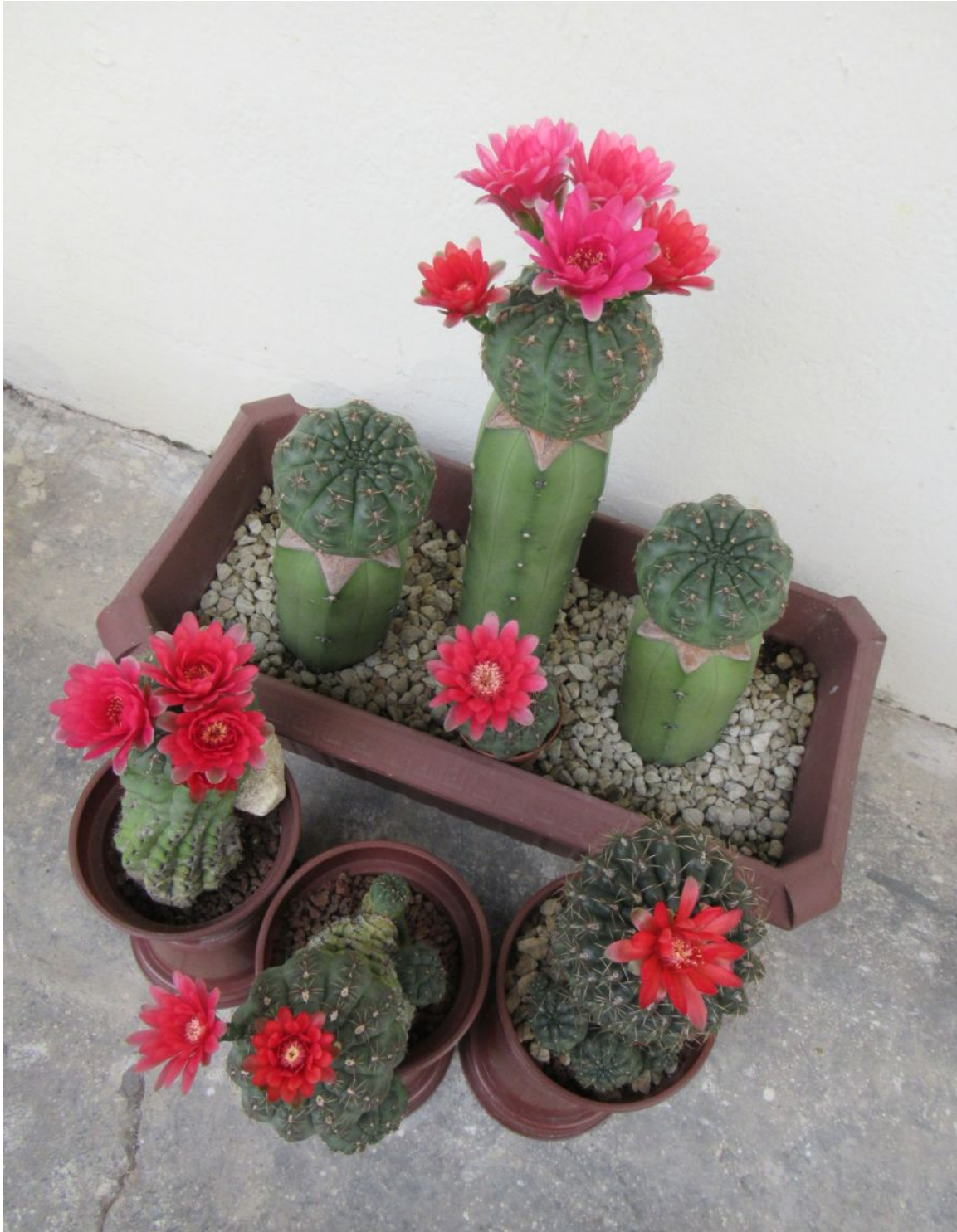
2019E posed with four other flowering GBalds. (August 2020)

And so the flushes of GBald flowers kept appearing. Initially, it's plain sailing. But when the GBald scions get older, we will have to face the challenge of keeping shrinking GBald stems alive. ♦