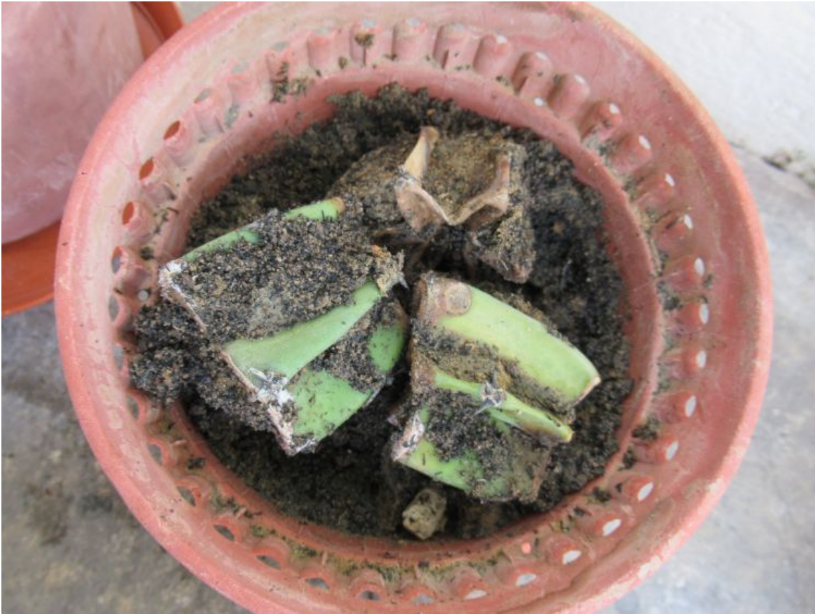
Inspecting the buried headless MGeo tops in July 2020. The weakest piece is now dead, as expected.

In the end, the remaining MGeo tops – the headless ones – were still pretty messed-up pieces of cacti. Slicing off the growing points did not change anything, or perhaps the MGeo tops were already quite weak. The one single root on the large piece was still the only root that appeared.