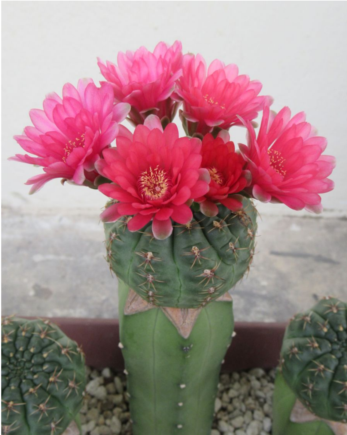
2019E near the end of June 2020. Another flush of flowers.