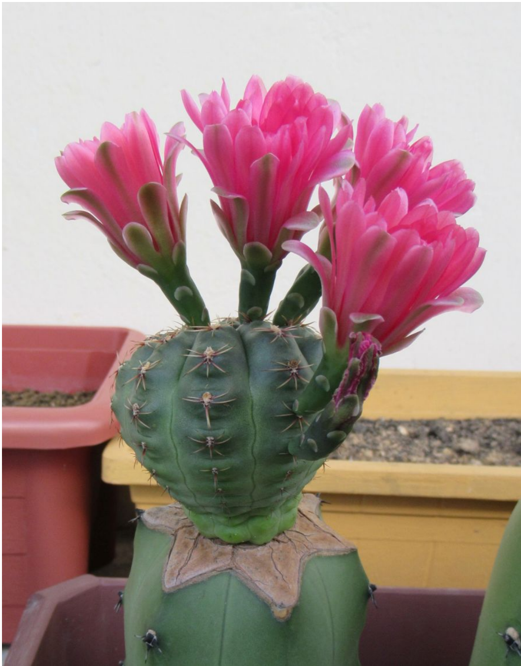
2019C a few days later, in early June 2020. Two flowers have been open for five days, and another two have been open for eight days.

Looking at the picture above, three phases can be discerned. First, the spineless light green base of the scion is the original indoor-grown stem. Second, the expanding section with weak spines is the juvenile part. Third, the upper stem with elongated areoles and strong spines is the mature part.