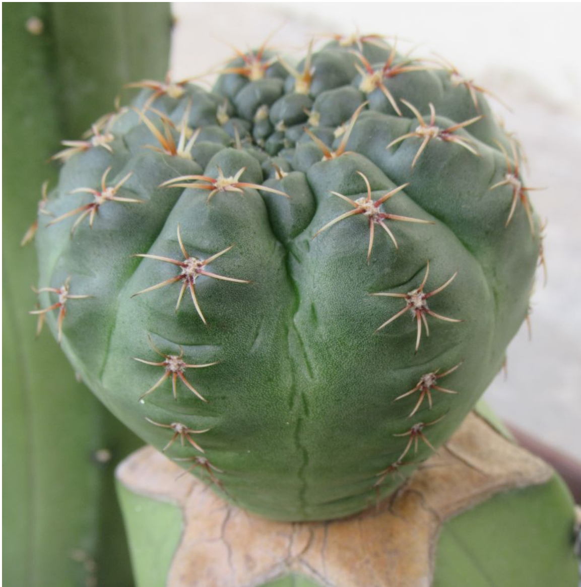
A closer view of the stretch marks, April 2020.

The stem of the GBald scion may be having a hard time accommodating the enormous increase in the diameter of the stem in a short period of time. While the upper part of the stem is ribbed, the lower part has a circular cross section. There is a line between the ribs in the above picture – this may be another stretch mark. The scion was about ½ inch across a year ago. Mature growth at the top of the stem is now about 2 inch across.