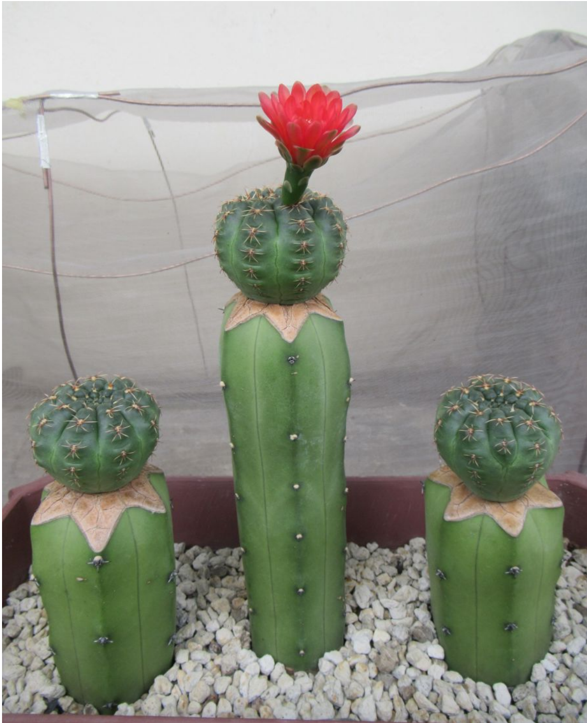
2019E with its first flower in mid-March 2020, 17 days after the bud was first detected.