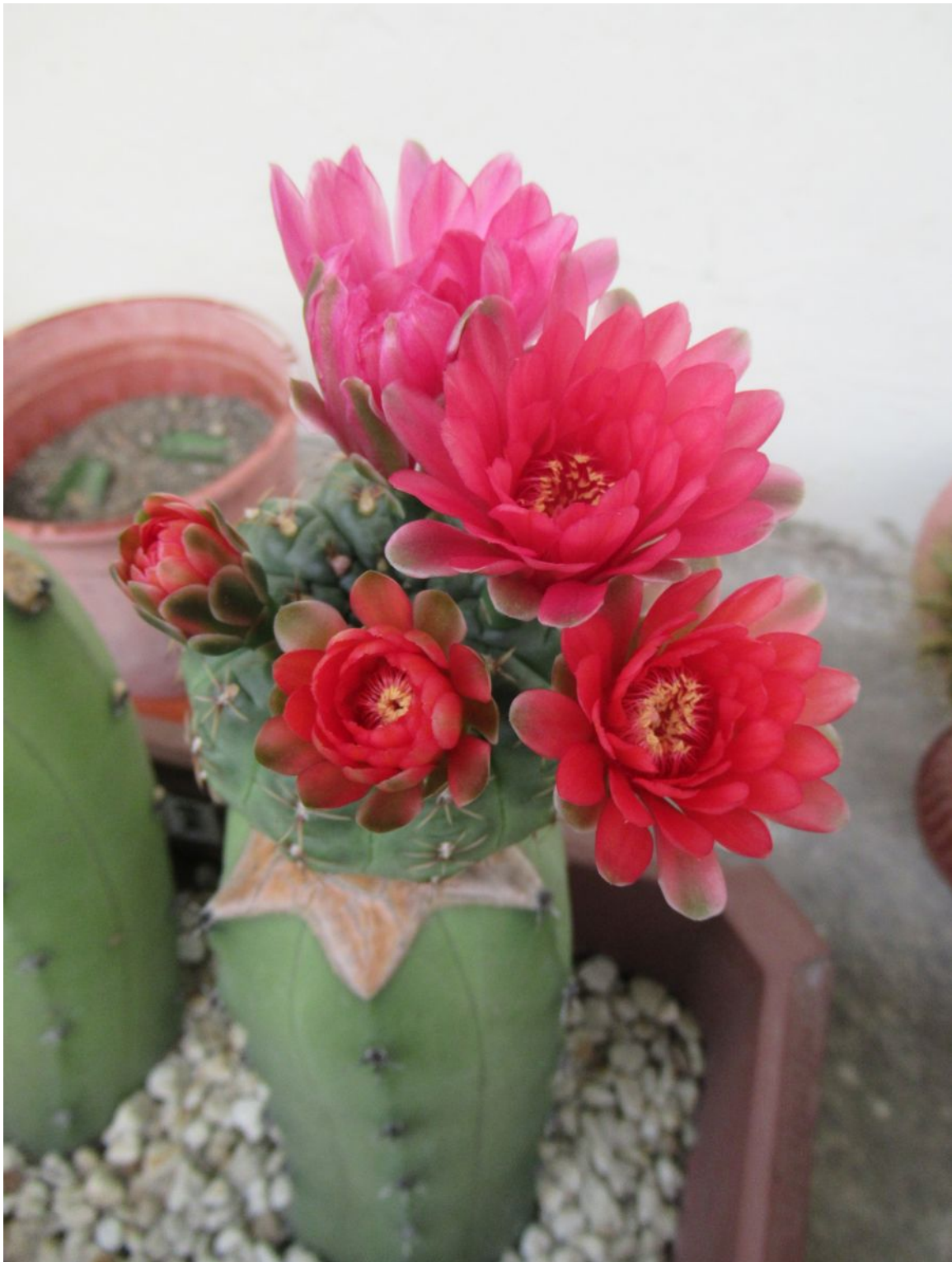
2019C in early July 2020. Another flush of flowers. At the upper left in the background is a pot containing three buried MGeo tops.