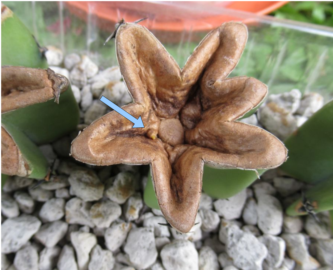
A closeup of the middle headless MGeo top. The root nub is an apparently new root just breaking out of the leathery bottom surface, at the 9 o'clock position (see arrow).

After six days, it was decided to bury the three headless MGeo tops as well. While inspecting the pieces prior to burying them in a pot of soil, I finally found one root – on the largest (and presumably, the strongest) headless piece. The root was new, only just breaking out, so it may have started growing only after the growing point or apex of the MGeo top was sliced off.