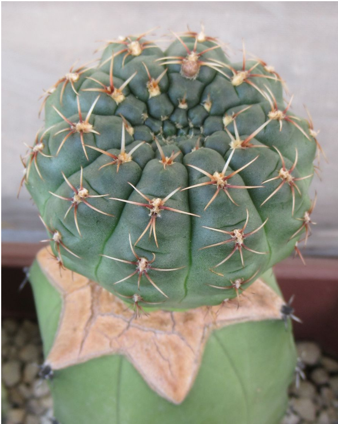
The second bud. On 2020-03-10, this bud was found on 2019C. 2019C was grafted on 2019-04-09 using the shrink wrap method. From this angle, the spines on 2019C look nice because we are generally looking at spines on new growth.