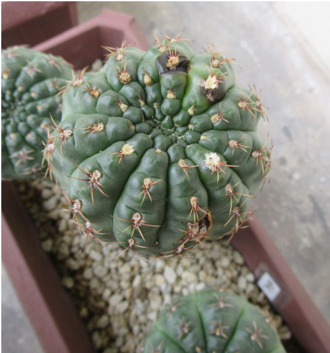
2019E four days later. Two post-flower areoles have black patches. To their left is yet another aborted flower bud. The scar from the June 2020 black patch is visible near the 6 o'clock position. (August 2020)

Small scars do not appear to hurt flower production. A large scar may distort the stem. Generally, the GBald hybrids appear to be more susceptible to black patches. Currently, when a black patch appears, I try to give the specimen more sunlight by moving it a bit. I don't always use thymol as a fungicide. With tens of flowers a month, it is difficult to keep at spraying a thymol solution on all dried flowers. I am also trying sulfur powder on new flower scars, but keeping track of all the flowers is not trivial. I am not crazy for perfect-looking cacti and so I don't mind some damage on my specimens. So far, this black patch problem has not gone out of control.