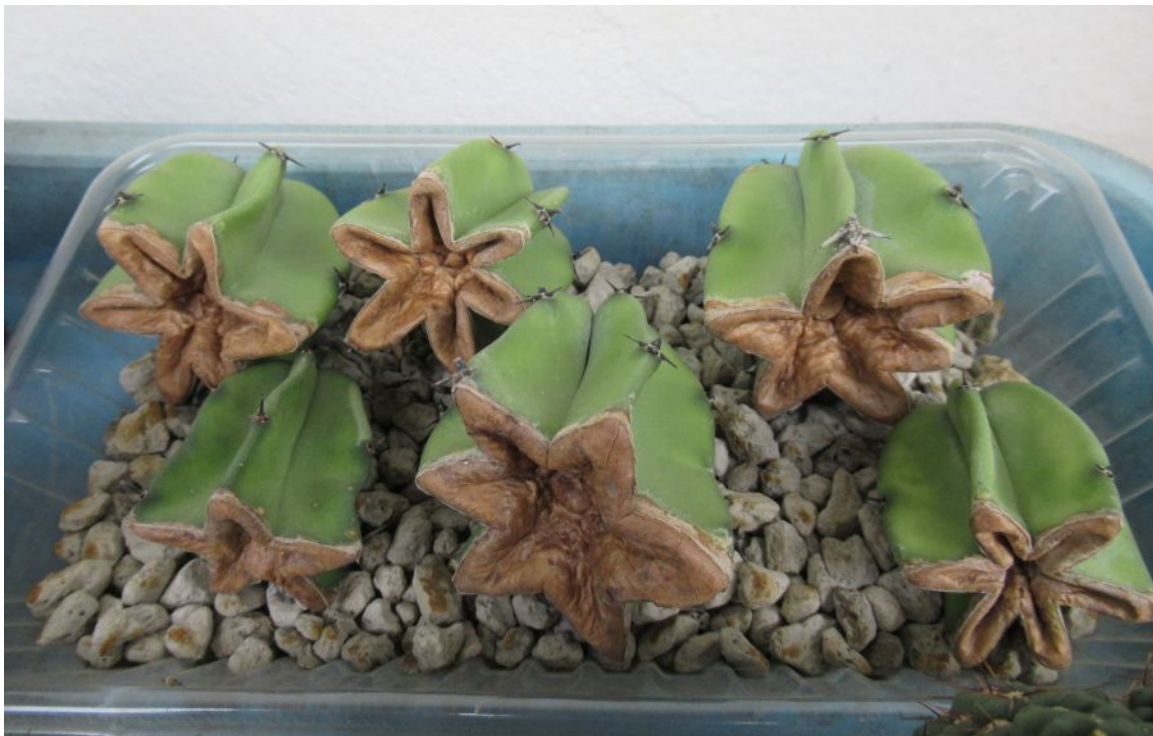
The bottom cut surfaces look leathery, and there is a lot of shrinking. Given the condition of the lower left piece, it is unlikely they will survive much longer.