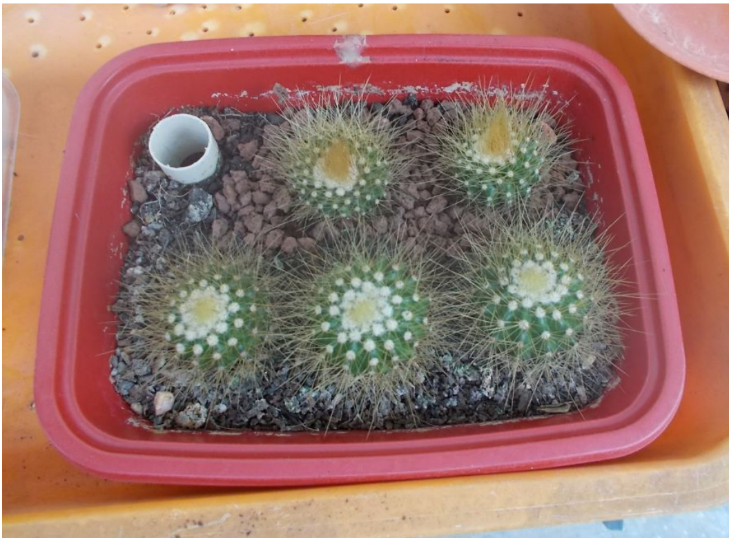
The two new offsets were simply placed on the scoria. The older three offsets have been growing in the tray for 4 months. (May 2019)