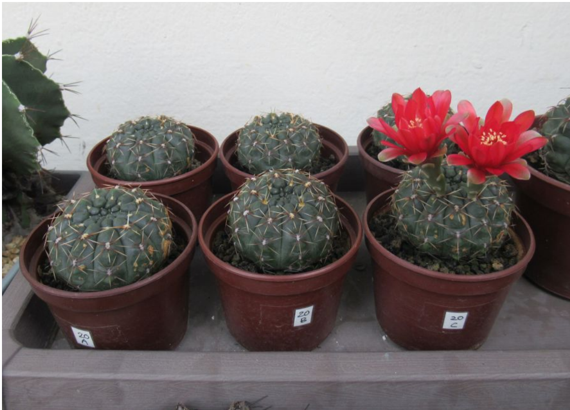
One of the six GBalds that was transplanted from the tray into pots finally produced two flowers in October 2023. The label is “20 C”, short for “GBald 2020C”.

The six GBalds that were removed from the tray in August 2020 and was potted up fared somewhat better. First I tried to grow them in a potting mix of mostly scoria. They grew a bit, then stopped. In retrospect, there wasn't much room to grow roots in 2 inch pots. Repotting to 3 inch pots was done in September 2022. The soil mix was layered, with black scoria on top.