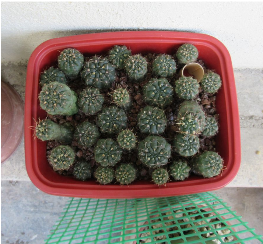
With more shade, the GBalds recovered quickly. It's getting somewhat cramped in there. The green plastic netting also provides some shade. (May 2020)