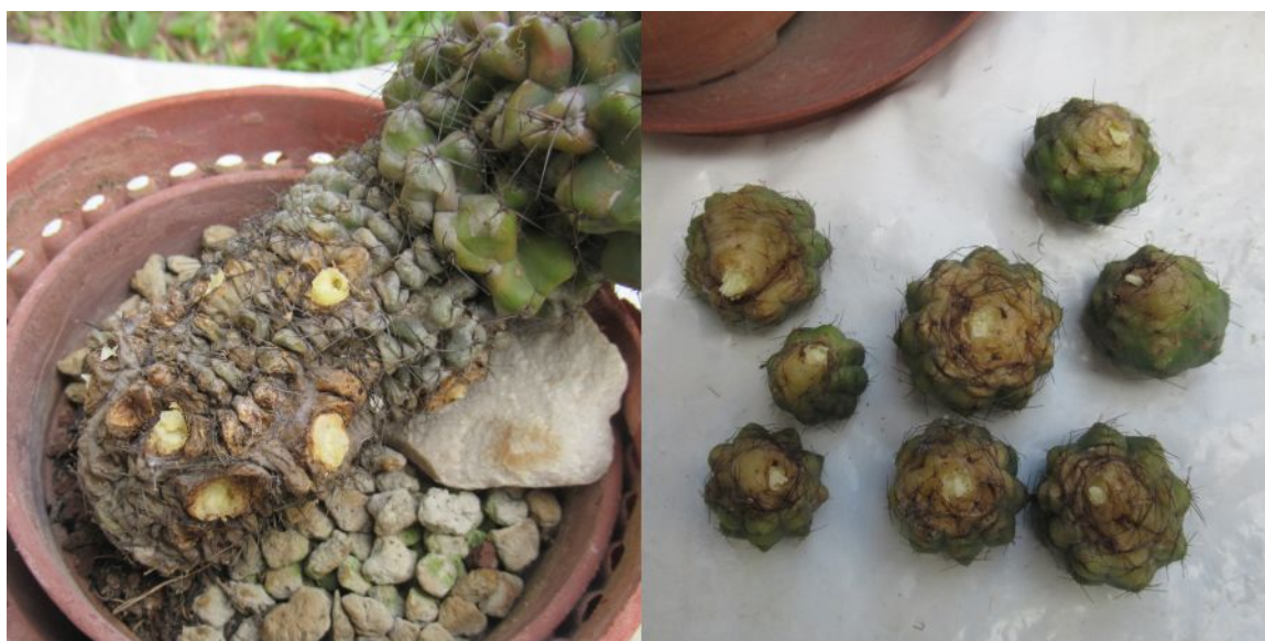
Left: Scars on the old GBald after the offsets were removed. Right: Underside of the GBald offsets, which have been growing for many months. (September 2020)