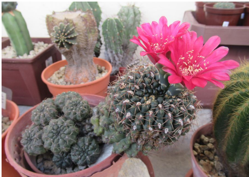
The GBald scion, now an ex-graft, with 8 offsets. The red flowers with awful-looking stamens are a typical feature of this old specimen. (September 2022)

The grafted GBald from the first section produced more offsets, which were harvested in late 2022. This specimen detached from its MGeo stock in January 2020 (rather, it fell off) and has been grown on its own roots since. It's not really healthy, but in 2023 it's still alive nine years after it was first grafted. You can read all about it in the later chapters on grafting.