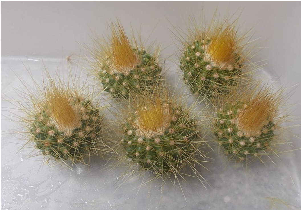
A closer look at the offsets. (January 2019)