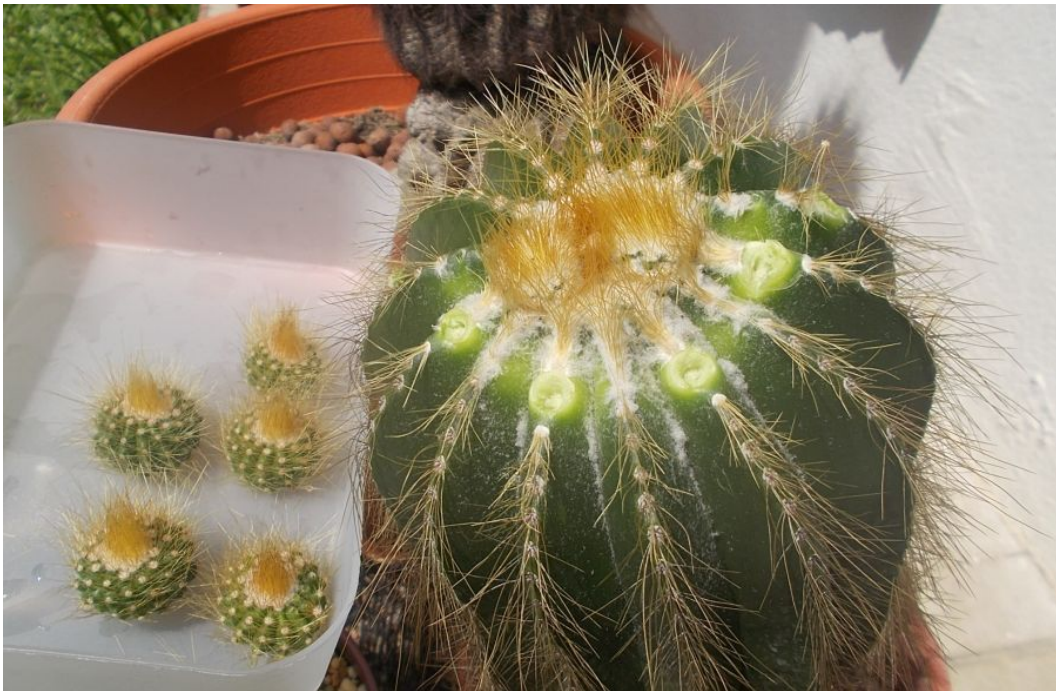
5 offsets after being detached by hand. (January 2019)