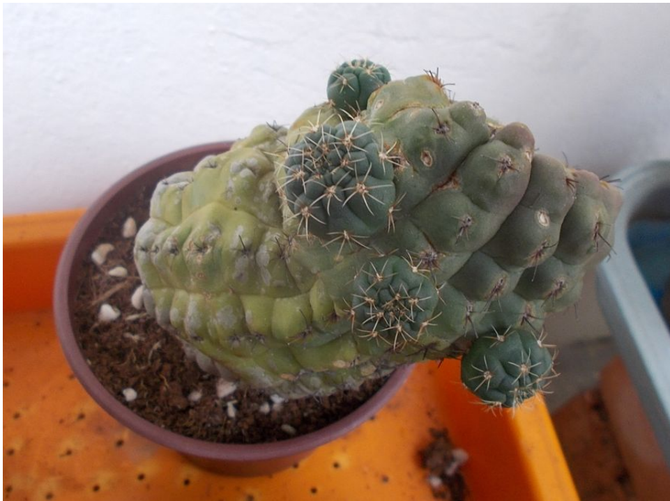
The healthier side in April 2017 is looking quite yellow and shrunken now. The offsets have grown at impressive speed.