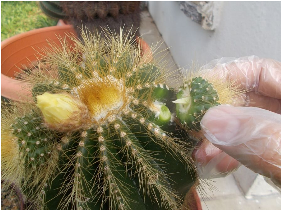
Detaching one offset. This time I wore disposable gloves. (May 2019)