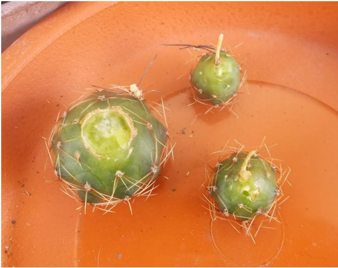
Three days later, the two GBald offsets each with a single stubby root have been removed, along with a larger offset. (January 2019)

As for the mother plant, it will be expendable from this point forward. The growing offsets may put out more roots and they may well end up killing the mother plant at some point. If you search for the phrase “ gymnocalycium baldianum habitat”, you will be able to see some pictures of small clusters of GBalds in habitat. Perhaps some of the plants in a cluster grew up as offsets. But plants in habitat probably cannot produce as many offsets as a well-fed grafted specimen.