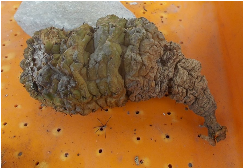
In April 2018, nearly 2 years after the original plant was cut into two. It is now something of a dried husk, but it is not completely dead yet. The barely moist plant tissue inside the stem is really spongy and airy (see next picture.)