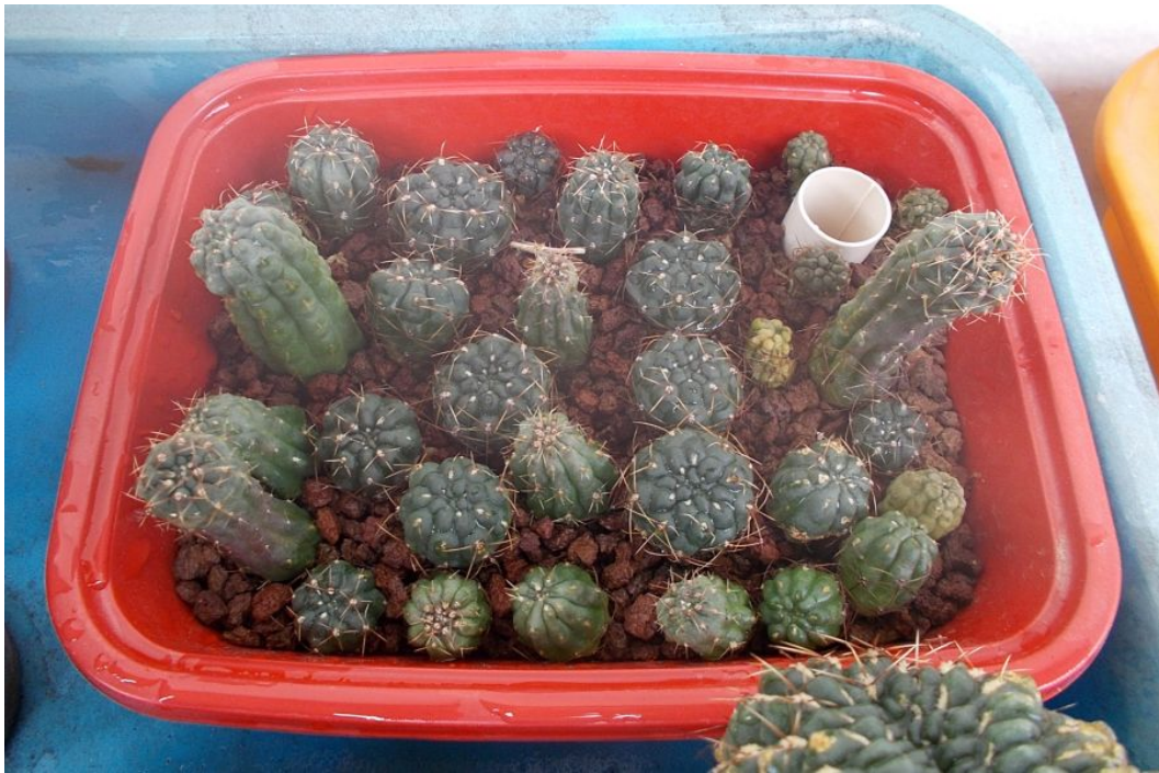
At 2 months after planting, in May 2019. The indoor GBalds have produced dense and spiny new growth, and their colour have improved.