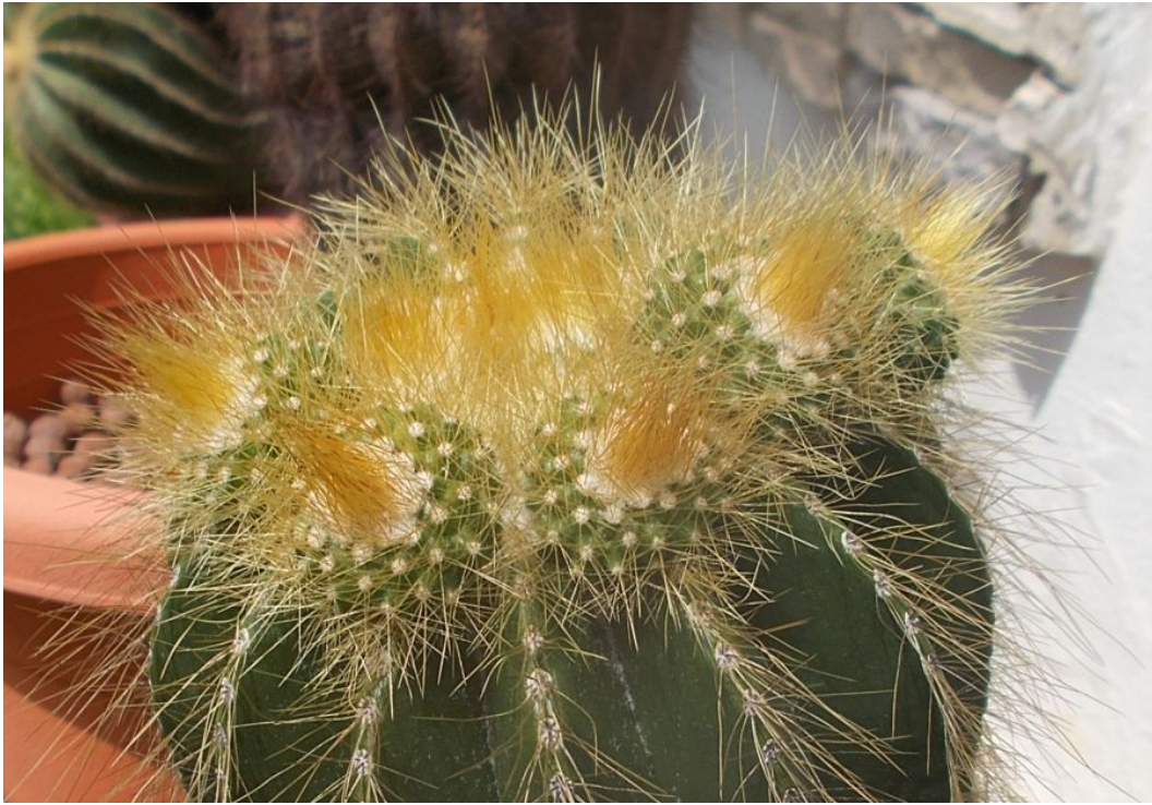
The PClav offsets just before harvesting. (January 2019)