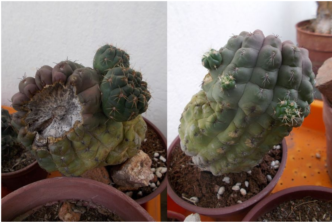
Left: the lower stem in February 2017. Right: the other side of the stem, March 2017.

After several more months, both sides are yellowed, because the stem has produced three offsets on the greener side. As far as I can tell, a cut GBald stem cannot stop its shrinking action; hence you cannot use a lower part of a GBald specimen to produce offsets in perpetuity.