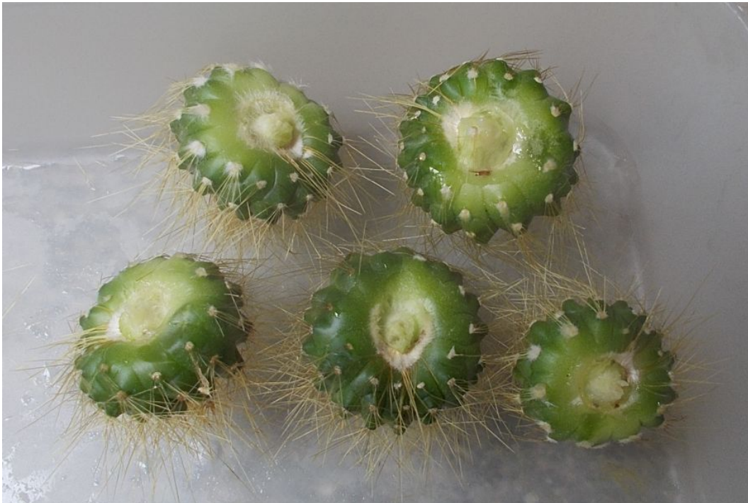
The concave underside of the offsets. If you buy a cactus plant and the base does not taper, it may be a harvested offset with a concave underside. (January 2019)