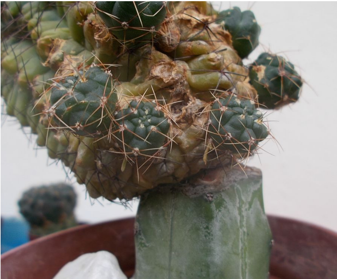
Closeup of the base area of the GBald. Note the thick roots on the two lowest offsets. GBald offsets sometimes produce roots while still attached. (January 2019)

In the above picture, we get to see the reason for the sudden production of offsets. The two lowest offsets each have one or more roots protruding from their base. Such roots are not uncommon. Evidently, the offsets are to be the next generation of plants – they will have a big advantage over seedlings that germinated from seeds because such offsets can get nutrients from the mother plant at the same time they are growing out their own root system.