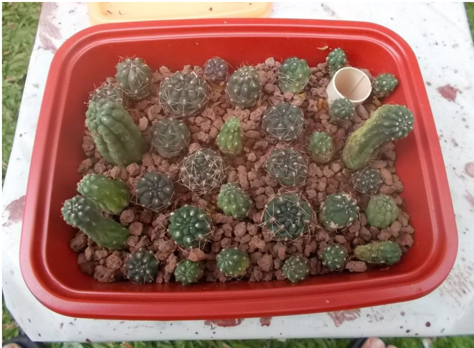
The tray pictured just after completion. There are bits of sphagnum moss under each small GBald so their root system won't dry out too quickly. Initially, they were sprayed with fortified water once or twice a week. (March 2019)