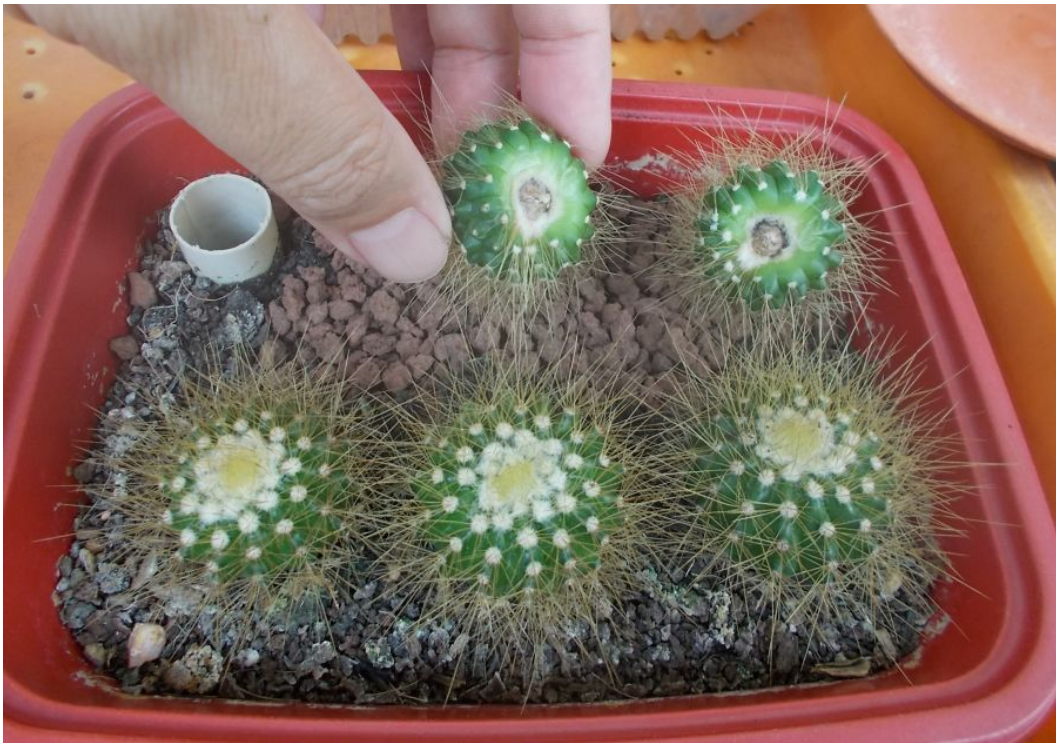
Ready to plant the two new offsets on some new scoria. (May 2019)