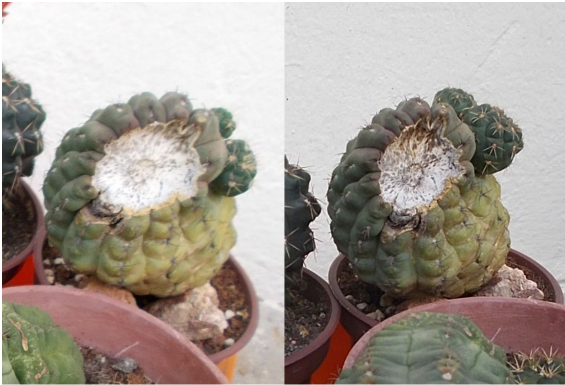
Left: the lower stem in November 2016. Right: the lower stem in December 2016.

After about 6 months, there is shrinking and two offsets have appeared. Thanks to a picture archive, we can observe an interesting behaviour: only one side of the stem has yellowed! The yellowed half has shrunk more.