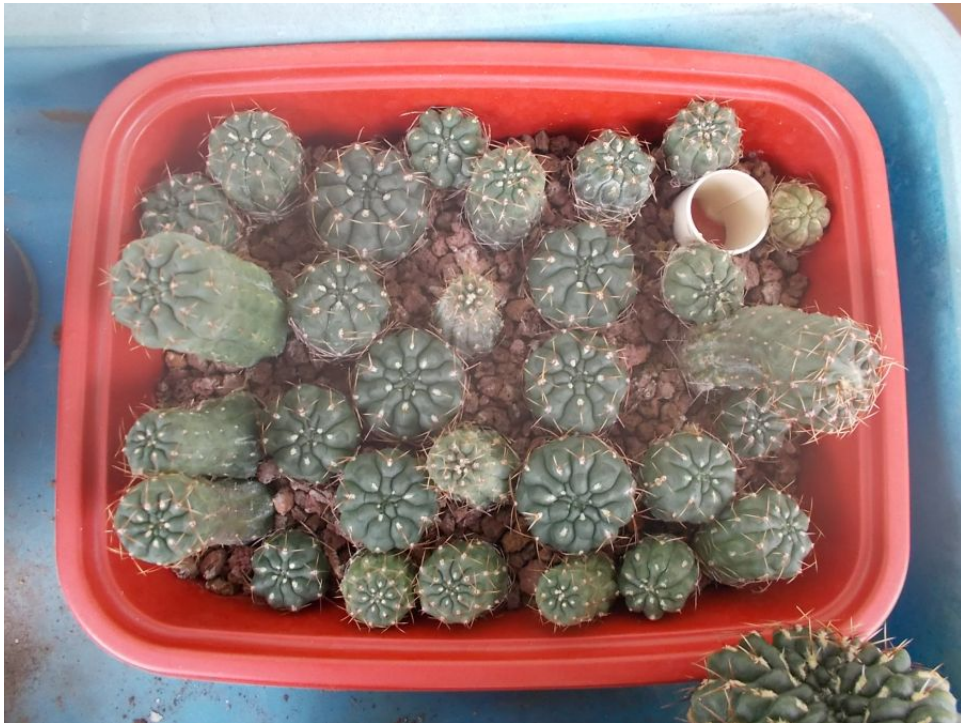
At 6 months after planting, in September 2019. Two weak GBalds near the tall specimen on the right have failed and both were removed. But there are still 30 plants in a single tray. Those that were never indoors look strong and healthy. This is a convenient way of growing a large number of small GBalds in one place.