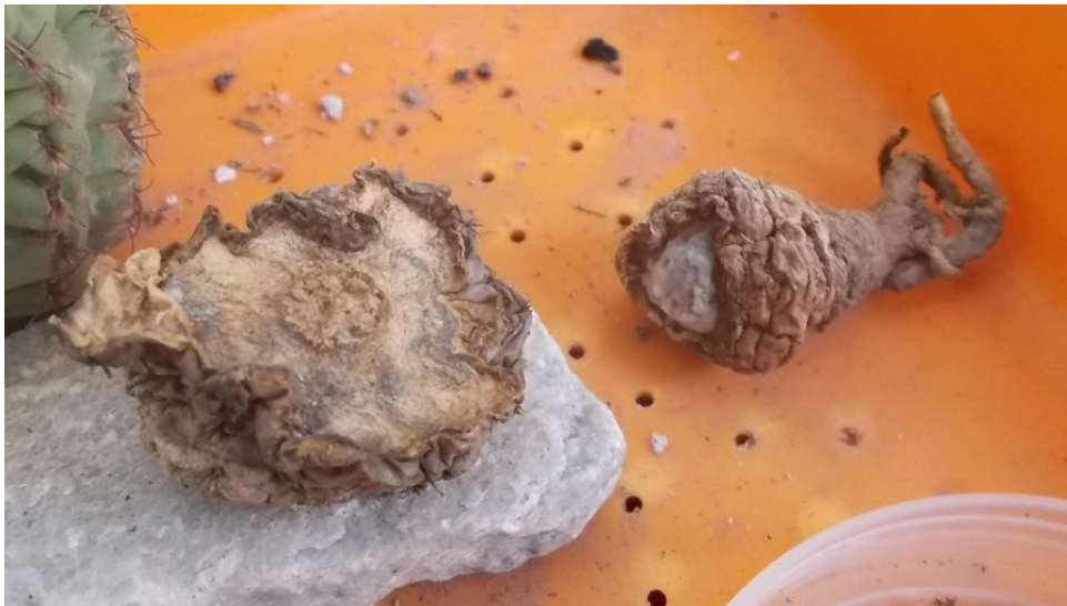
The two smaller pieces in April 2018, one week later. There is some fungi on the cut surfaces. The two pieces just dried up; there are no more reserves in those stem pieces to do anything. Note the circular pattern of the vascular bundles on the cut surface.

When dealing with the lower part of a GBald that was cut, remember the shrinking complication of GBalds. You will be able to harvest some offsets, but the operation is ultimately fatal and there is no escape. Observing the progress of this particular lower stem has made it clear that such shrinking stems have no capability to revive themselves and become green again. In the Refreshed, Revived, Resurrected chapter, a GBald made a nearly miraculous recovery in 2023, but that main stem had its apex to produce the appropriate hormonal signals. For now, I still think that a GBald without an apex will not survive in the long term.