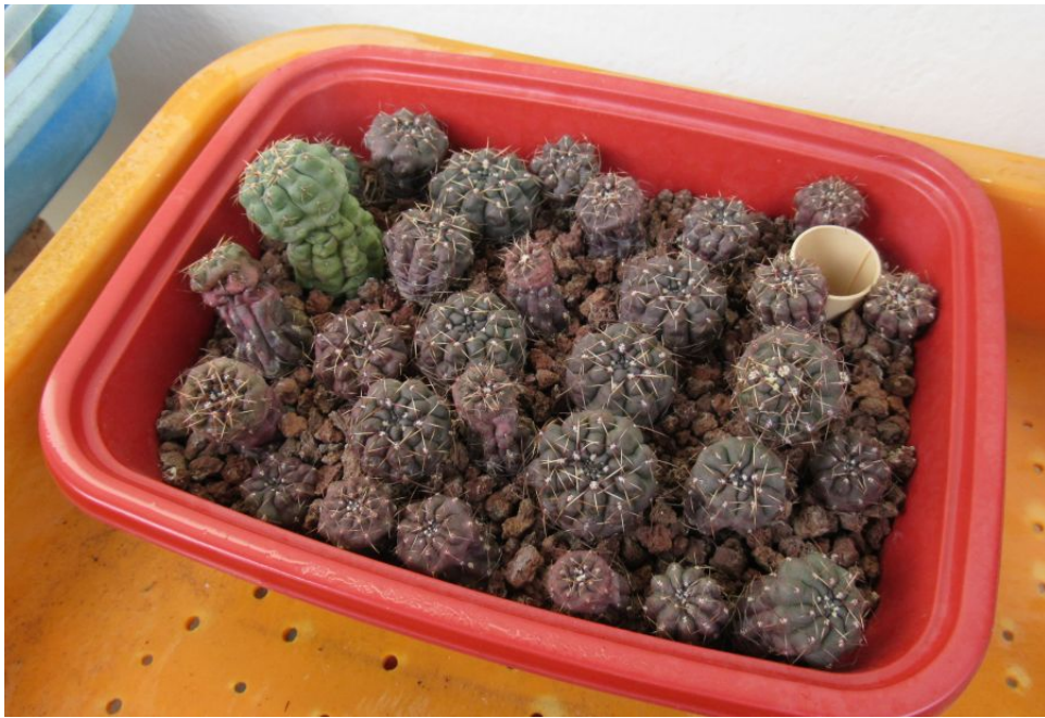
Around April 2020, a heat wave caused the GBalds to turn red-green in colour. Normal-sized GBalds did not change colour during this unusually hot weather.