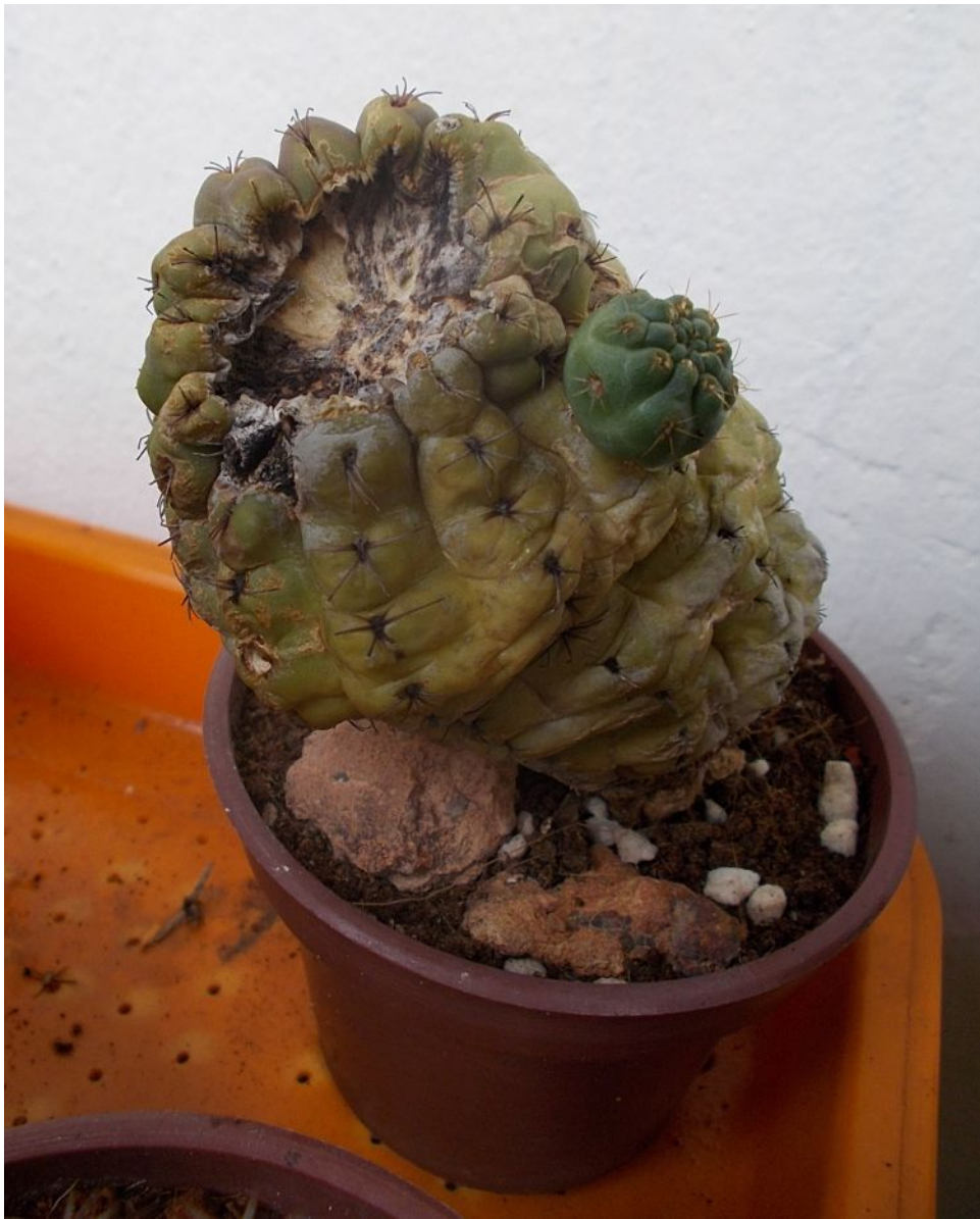
The specimen as seen from the weaker side in September 2017. That's the last offset.

After about 16 months, the lower stem does not have much more to give. It can no longer produce new offsets. The final offset, as seen in the picture, no longer grows bigger. The stem has become a drying husk that is slowly dying.