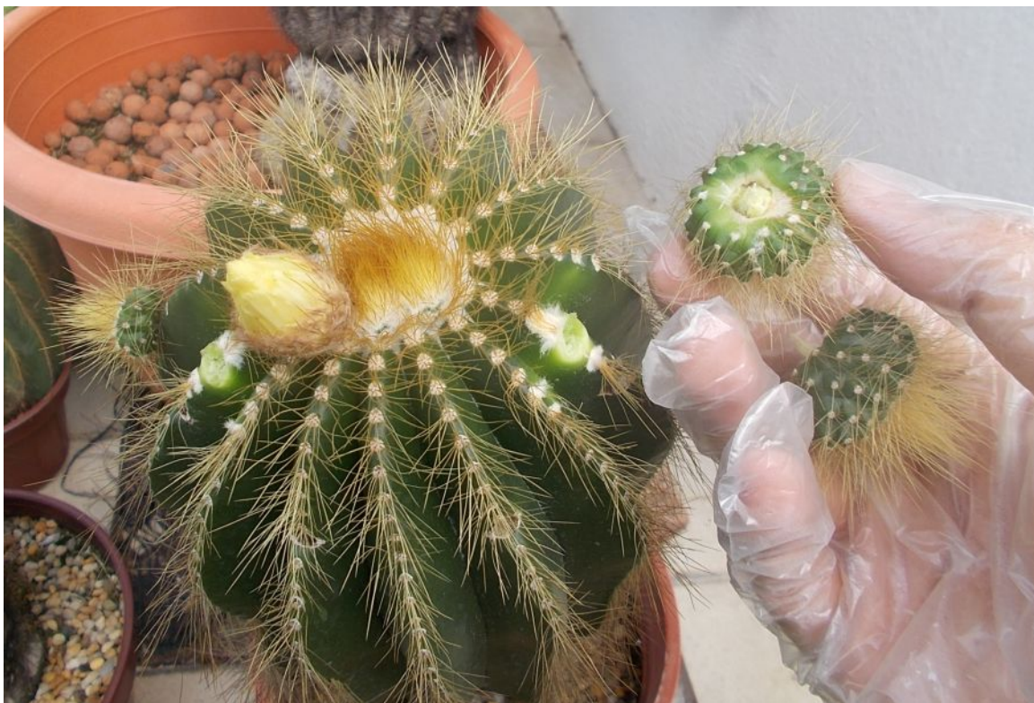
Two detached offsets with the parent plant. The PClav was still producing new offsets – very convenient if you want to multiply PClavs, but a tad annoying if you are looking forward to flowers. (May 2019)