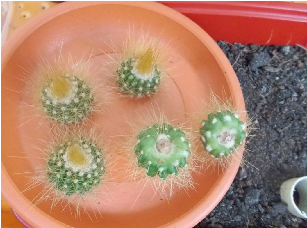
Planting out the offsets 8 days after harvesting. The attachment points of the offsets have dried and callused over. (January 2019)