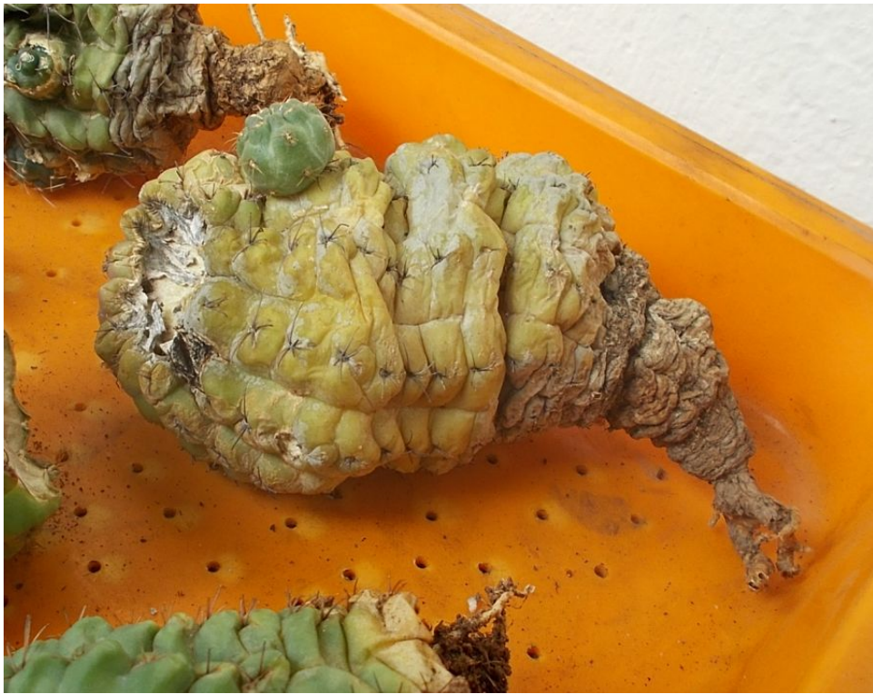
The specimen, out of its pot in October 2017.