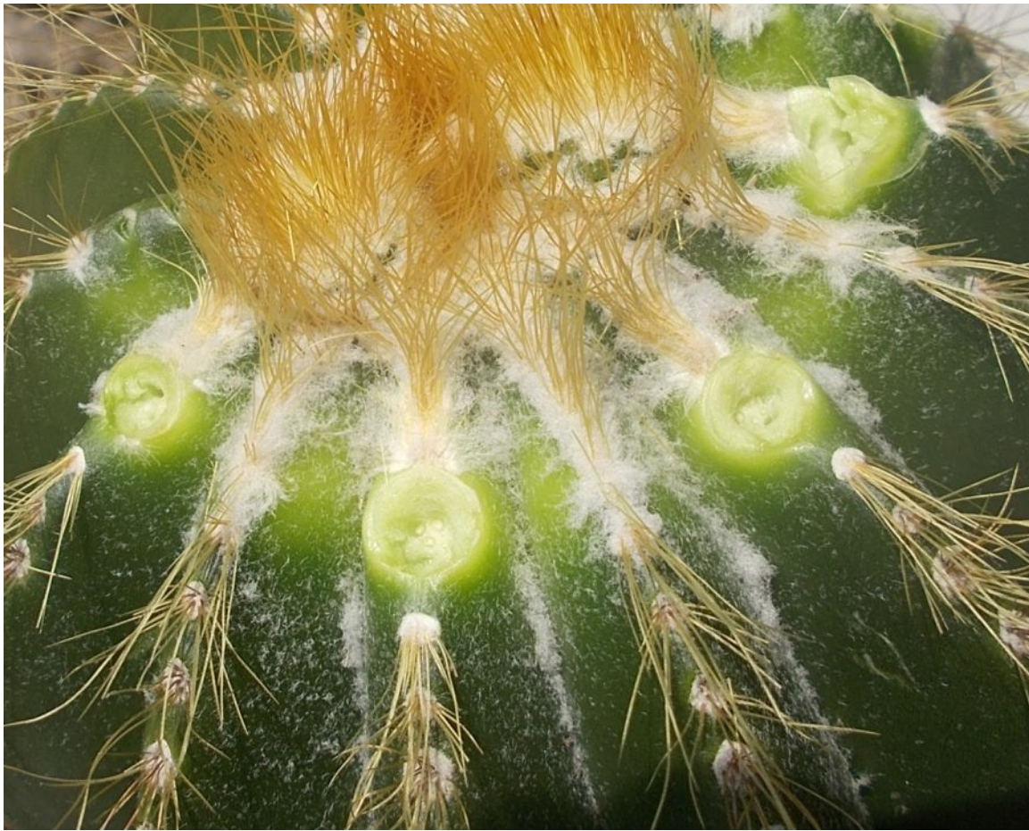
A closer view of the fresh scars just after the offsets were harvested. Also note the wool shed by newer areoles. (January 2019)

This has been partially covered in the chapter on Repotting Cacti. PClavs can produce offsets naturally, but in practice it rarely happens. To actively multiply your PClav collection, the best options are: (1) pump a specimen full of nitrogen so that it produces a mass of offsets, (2) cut up a specimen leaving the lower part to produce offsets, or (3) harvest seeds to grow seedlings. To get more genetic variation, use seeds or buy new plants.