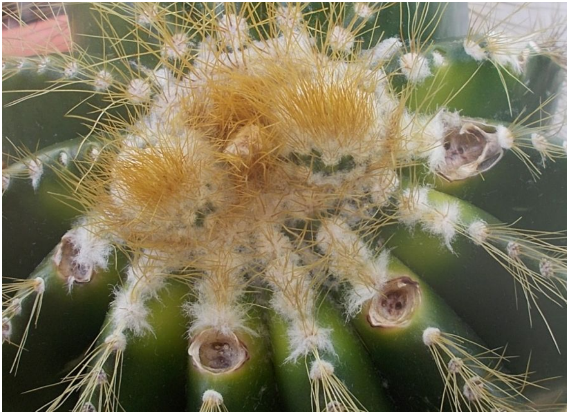
The scars, 3 days later. Now the offsets still on the plant are growing quickly. At least one flower bud can be seen in the center. (January 2019)

Scars that are left after you have detached the offsets are almost always never a problem. Fresh, the scars will look rather unsightly, but they will be much less prominent after a few months. Many cactus plants grow continuously – they can keep growing wider, up to a certain point. So the scars will shrink and in time, normal growth will crowd out the scars.