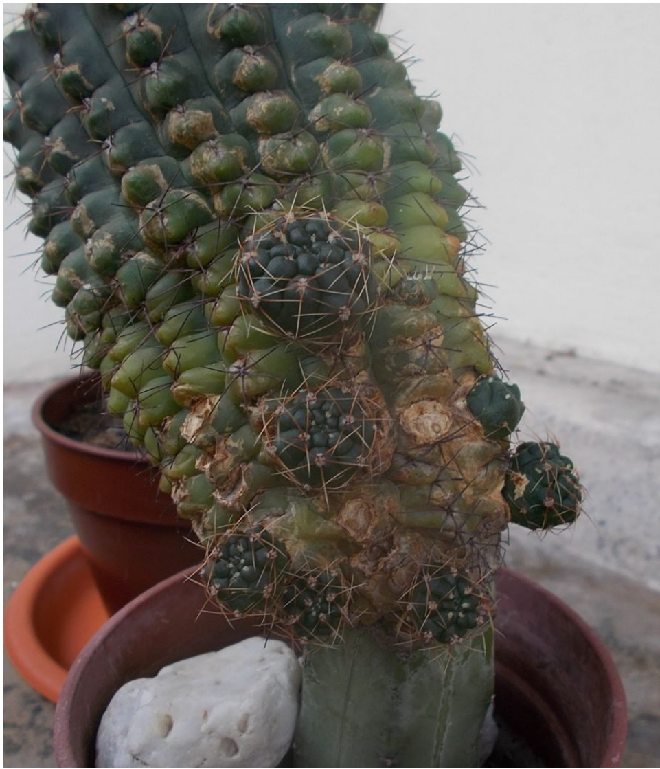
A closer look at the base of the grafted GBald. There are round scars due to the harvesting of earlier offsets. (December 2018)

With GBalds, success begets success. A large and strong specimen that grew well will have ample resources to produce many offsets. A grafted specimen will often be larger and stronger than normal plants – MGeo is great stock material for GBalds. Thus the easiest path towards multiplying your GBald collection quickly is to make a number of GBald-on-MGeo grafts.