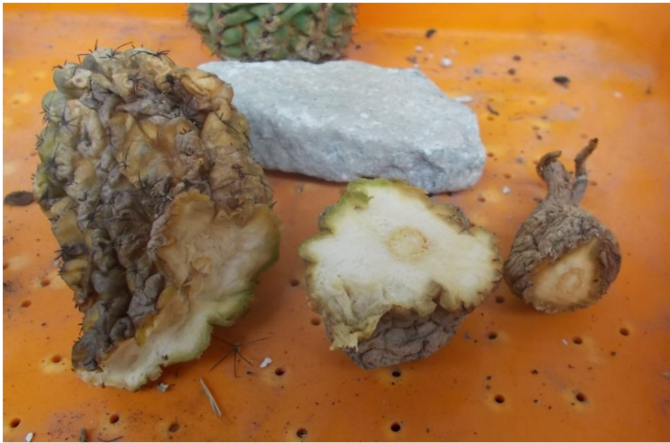
The mostly dried husk was cut up in April 2018 as an experiment. The biggest piece, which was the upper part of the stem, is already drying and collapsing.