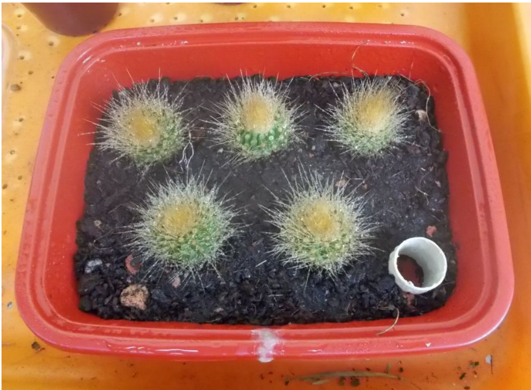
A disposable bento tray with 5 PClav offsets. (January 2019)