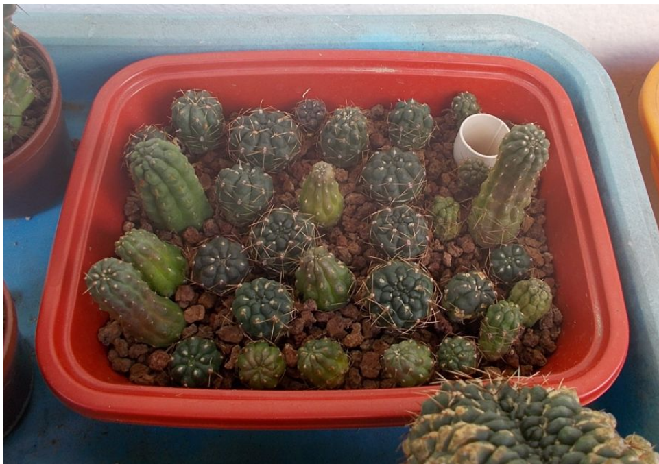
The tray pictured in the following month. The lighter coloured GBalds are plants from indoors, still adjusting to their new environment. The ones that grew outdoors had no problem settling into their new home. (April 2019)