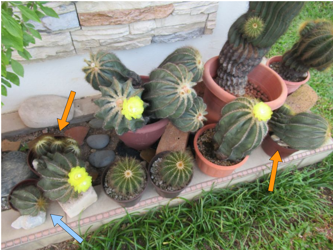
A year later, September 2021. The pail PMag is at far left (blue arrow). Two of the PMags (orange arrows) were from the blue plastic DWC pail seen earlier.

That was about as far as the PMag went. There were no more flowers and little or no new growth. It had been in the small pot for nearly 2 years at that point, so there probably isn't much more room for its roots to grow. It spent the next year slowly shrinking, bit by bit. Conveniently, neglecting the specimen was a simple way to study how a badly pot-bound PMag behaves.