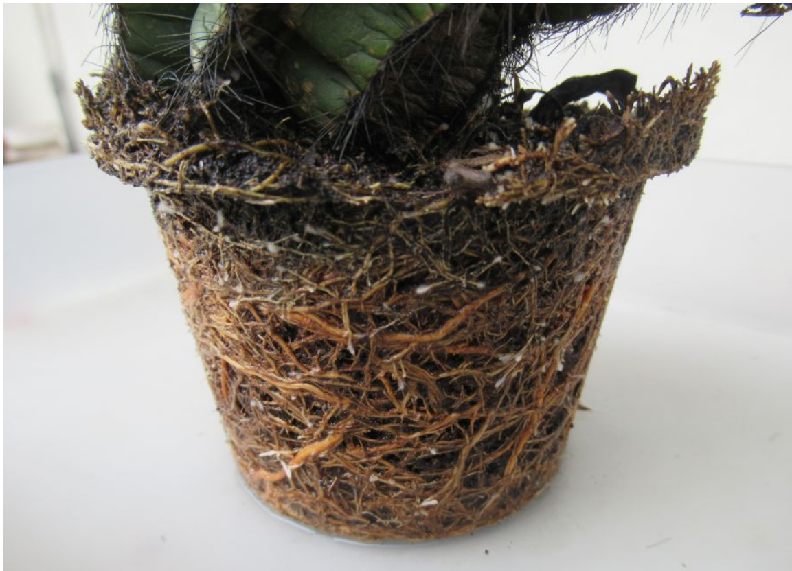
Almost immediately, I got some useful pictures out of the exercise. Here is the root ball the next morning, with some new root tips after just 16 hours. (Feb 2022)