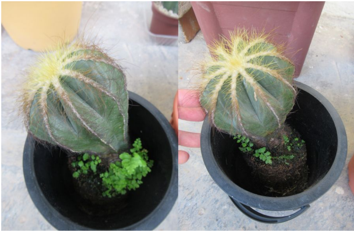
Left: After 4 months, with young ferns keeping the PMag company. (Jun 2022) Right: After 6 months in the pail. Much of the ferns have been removed. (Aug 2022)