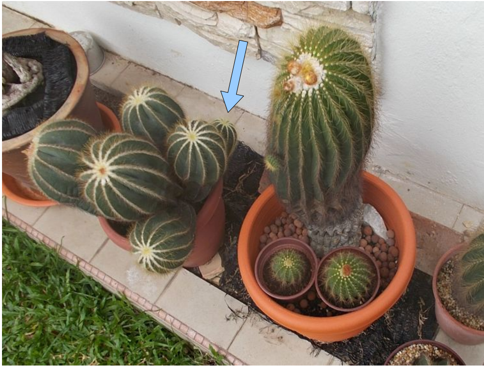
The arrow shows the “pail PMag” when it was still an offset. (Aug 2018)

The swampy PMag in a pail started as an offset of the big PMag specimen. When the latter was repotted in December 2018, the offset was removed, because I was going to let all the other stems lean in one direction – it was easier than trying to constantly rotate the heavy pot plus plant to cancel out the leaning of a species that tends to lean.