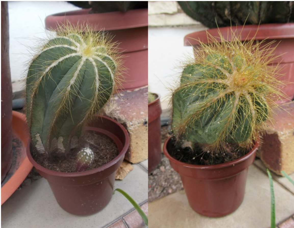
Left: At 6 months after potting up, October 2019. There is a lot of healthy new growth. The small cactus is a surplus Echinopsis subdenudata offset. Right: The first bud is just visible 10 months later in August 2020. The PMag is wet after being sprayed with fortified water. Colour rendering is slightly different due to different point-and-click cameras used.

While PMag is a great species to grow, I generally prefer solitary stems, so I try not to keep too many PMags around. But since it wasn't very crowded with plants yet, I potted up the stem in early April 2019 in a mix of mostly coco peat. But it was more or less treated as a surplus specimen, kept as a spare.