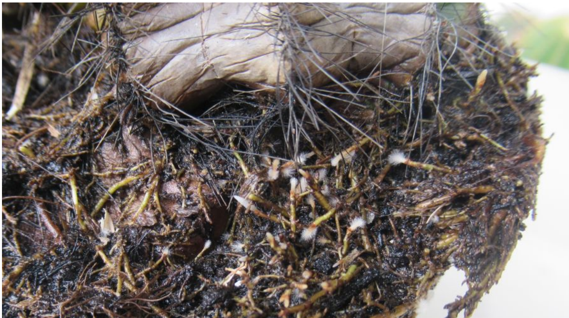
A closeup of the top surface of the root ball. In 16 hours, new root tips have appeared. I guess the root ball hasn't been properly moist in a long time. (February 2022)