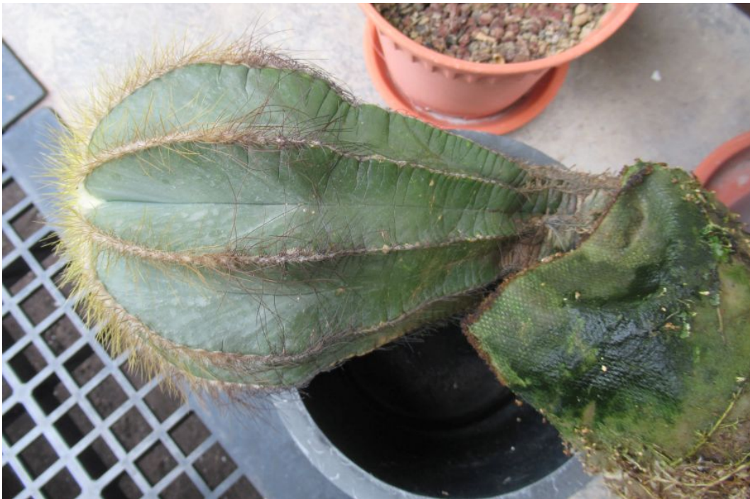
By August 2023, the nappy liner had a thick layer of algae in places. The PMag appears to be doing well in spite of all the algae.