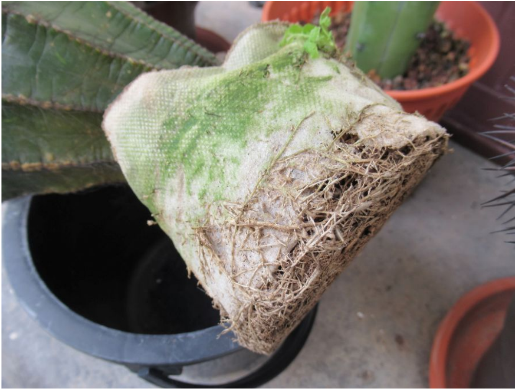
A closer view of the nearly-dry root ball in early May 2023.