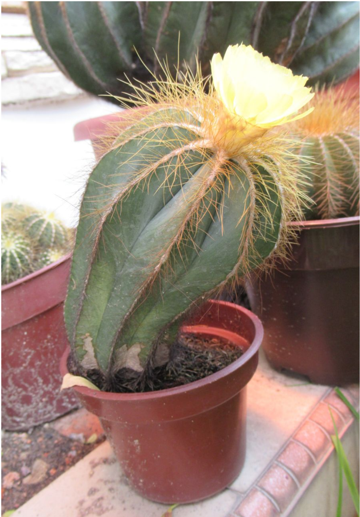
The PMag with its first flower in the midday sun, in early September 2020.