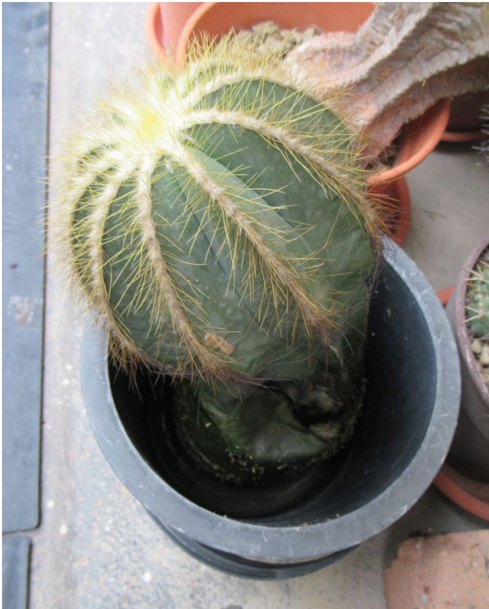
The PMag in late September 2023. Note the woolly apex of the PMag, plus bits of wool shed between the ribs.

In Klang Valley, Malaysia, the weather throughout most of 2023 was often wet and cool, making it a continuation of the wet year of 2022. El Niño is supposed to be dry and hot in these parts 1 , but I haven't seen its effects yet. Due to the often wet weather, feeding has been spotty but this PMag is doing well. By late 2023, the apex of the PMag has become quite woolly. Usually this means that the cactus is willing to flower – but this PMag hasn't done so. I think the lack of a good bit of hot weather is holding the PMag back.