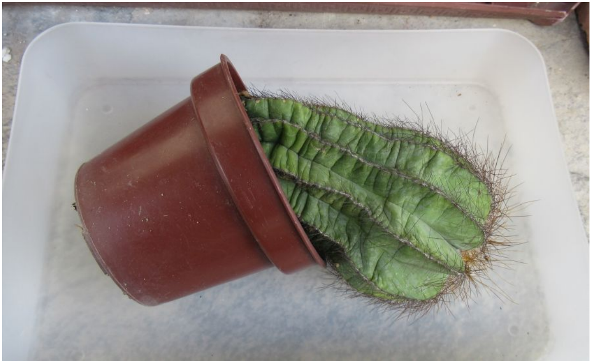
The PMag just before removal from its pot. (February 2022)