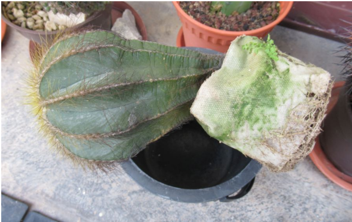
The PMag in early May 2023. Growth is steady. In this picture, the root ball is nearly dry on the outside and algae is well under control.

In 2023, I initially maintained low levels of NPK feeding, electing to water the specimen with fortified water most of the time. This feeding strategy contained the growth of algae. Growth was steady, but perhaps slower than it would be if the PMag was in rich soil. The PMag also grew a lot of roots on the nappy liner (picture above and on the next page) to capture moisture.