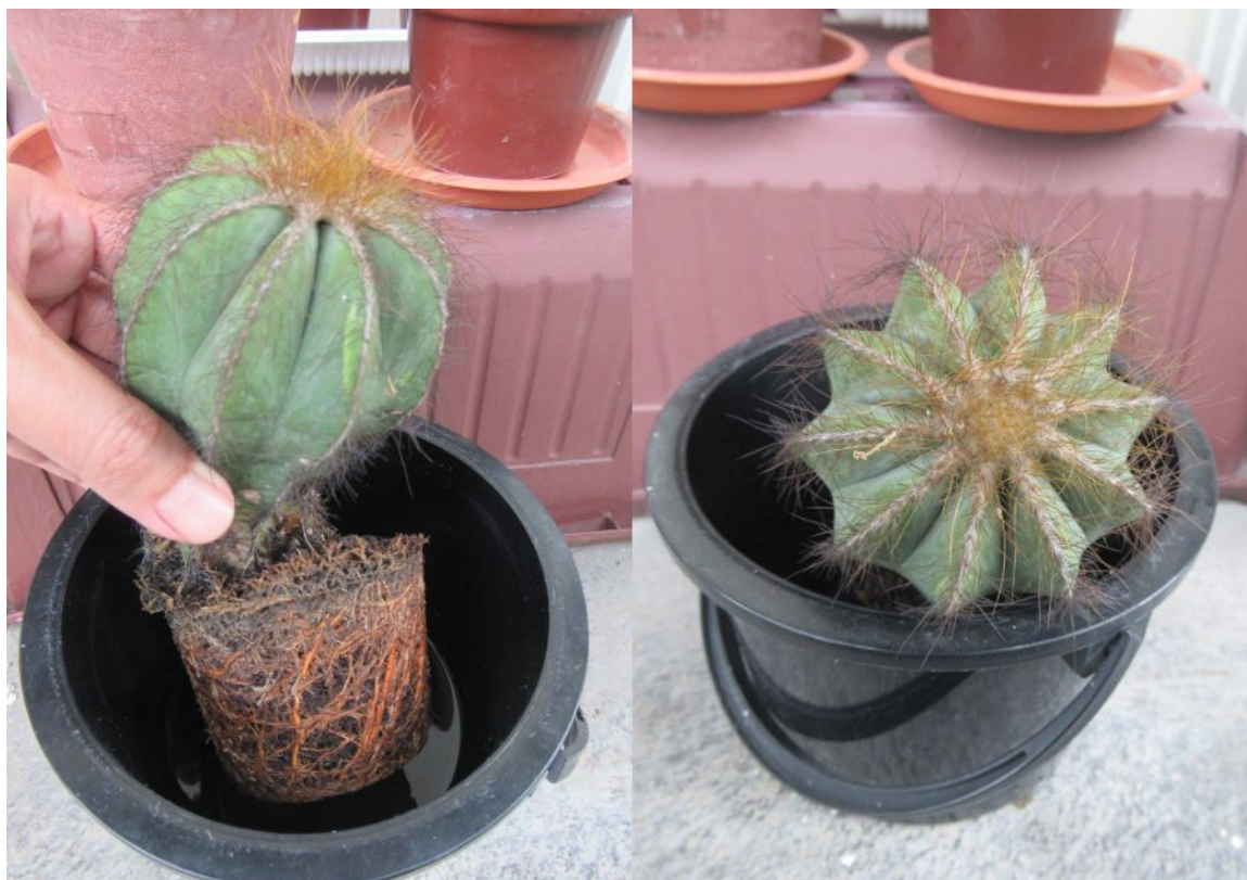
Left: After 2 days, the stem looks a bit better, with fewer wrinkles. (Feb 2022)

So, it's an experiment to collect data and maybe gain some useful insight. It does not target optimal or peak performance like a lot of agricultural research papers focused on crops or mass production of horticultural plants. I look for simple things that work, that's all.