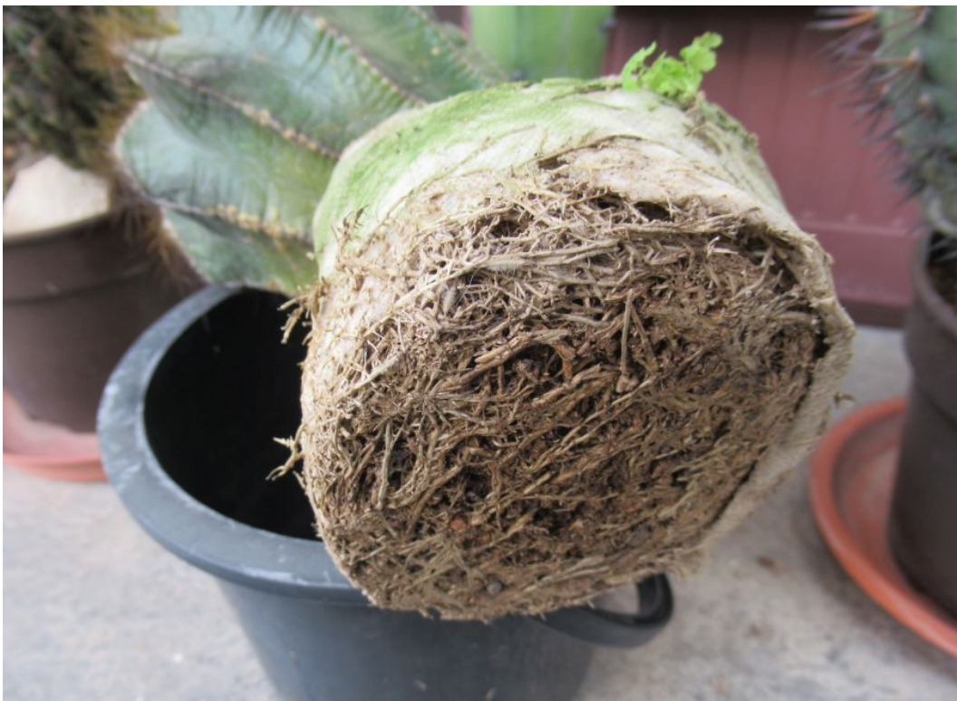
The underside of the nearly-dry root ball in early May 2023.