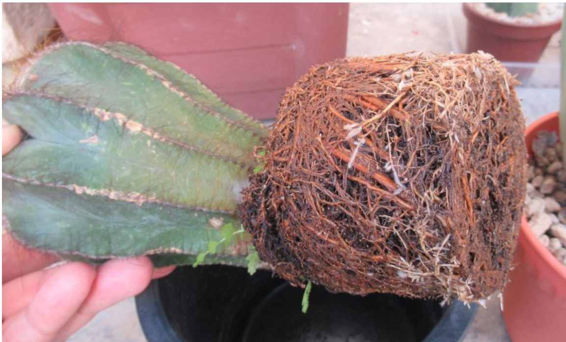
Much of the growth of new roots is near the base of the root ball, where it is wetter. Surprisingly, there is barely any sign of algae. The root ball was later wrapped in a piece of non-woven nappy liner because parts of it was falling apart. (August 2022)