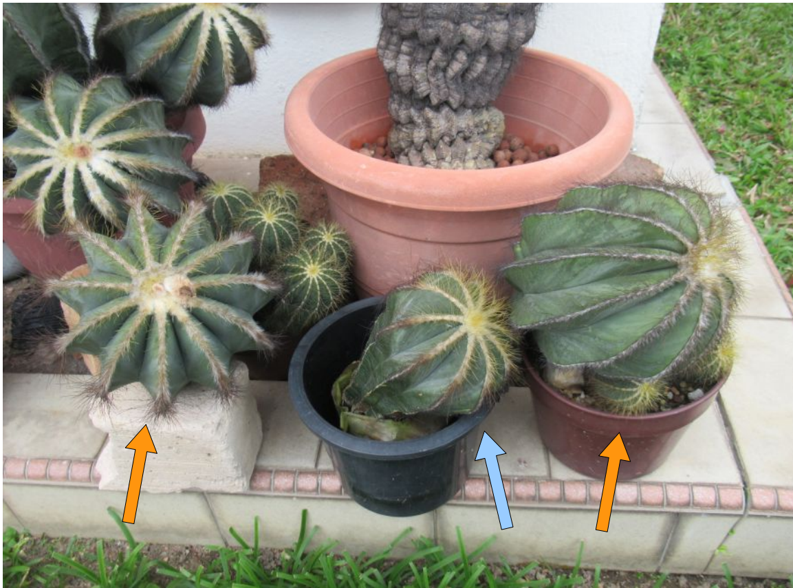
The PMag in a pail (blue arrow), now much larger, posed with the two PMags that used to be in DWC (orange arrows) in late October 2022. This was taken about 13 months after the picture on page 7 which shows the same trio of PMags.

Even with the limitations of CAM respiration, PMags can grow pretty fast. Looking at the PMag in the pail, I think that natural max-speed growth requires fresh, growing roots coupled with a fresh, growing stem . This gets the plant hormone signals running properly in the cactus so that nutrients and resources get utilized efficiently. In this way, we are making good use of the plant's limited machinery for growth.