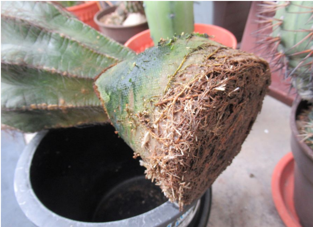
The root ball in August 2023. The root system and the nappy liner is still wet. A lot more roots have grown over the nappy liner. Nothing is turning black and falling off.