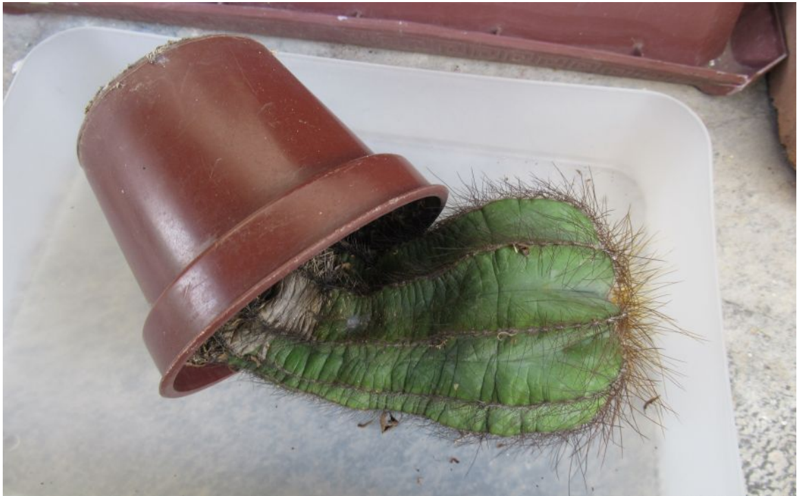
Another view of the somewhat shrunken specimen. (February 2022)