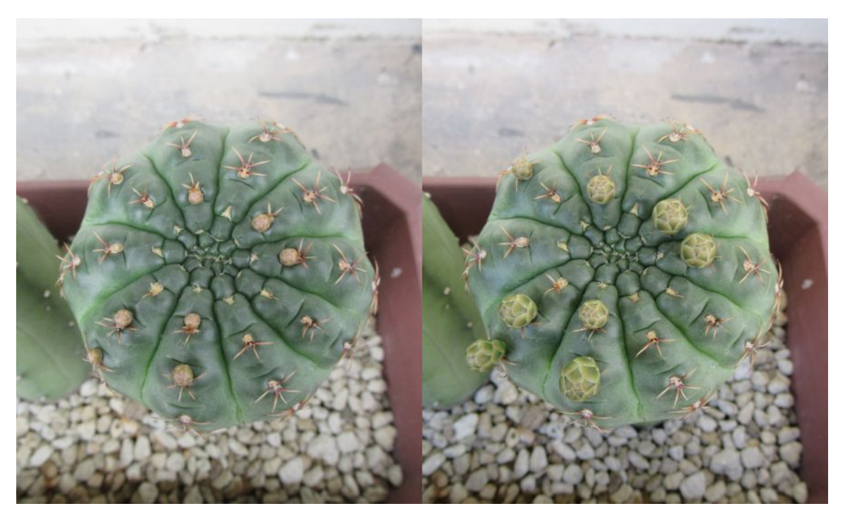
2019F trying to push out eight flower buds in late September 2020. The pictures were taken five days apart. Six buds made it and two were aborted.

There weren't any bug attacks until January—February 2021, so the rest of 2020 was mostly plain sailing. Detailed flower production performance for each specimen will have to wait until I get my spreadsheet data set processed.