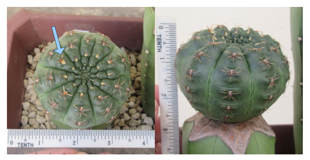
2019D with its first bud barely visible (blue arrow) around mid-August 2020. The diameter of the GBald scion is 2.8 inch while its height is about 2.3 inch. Note the stretch marks on 2019D in the picture at right.

Buds were finally seen on 2019D and 2019F in August 2020. The diameter of their stems were over 2.5 inch. By contrast, the diameter of 2019E was 2.0 inch when the first bud was seen. It's unclear if GBalds have any triggers for starting flower production. Here, 2019D and 2019F may simply be large enough for flower production to commence.