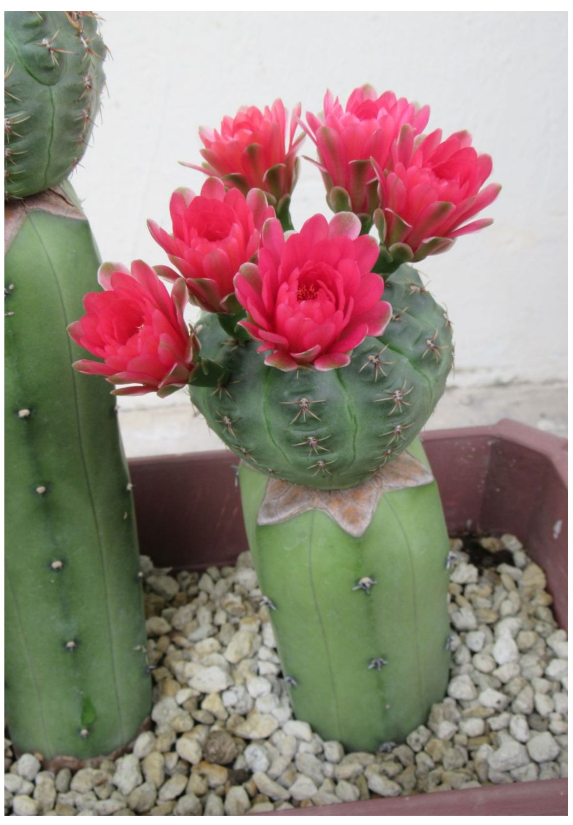
The next day. 2019F with six half-open flowers. (October 2020)