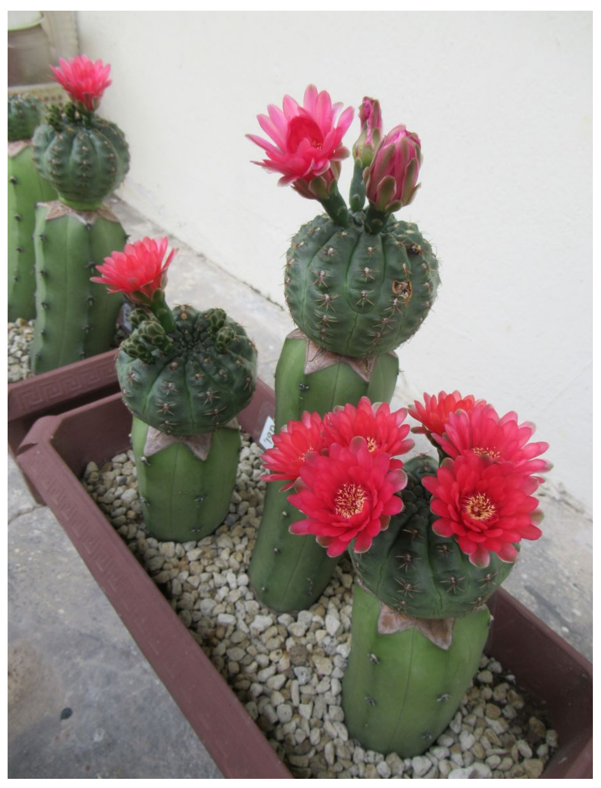
Four GBald-on-MGeo specimens in bloom the next day. There are six flowers on 2019F; two flower buds did not make it. Note the scars on 2019E. (October 2020)