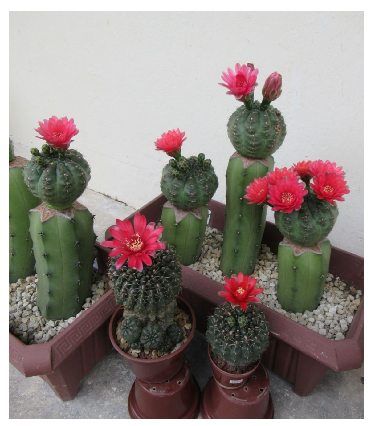
Flowering GBalds posed in a group picture in mid-October 2020. Since their flowers are not synchronized, one has to wait for opportunities to take nice group shots. But it's hard to have a lot of specimens simultaneously at the peak of their flower flush.

There were no new black patches during these three months. Perhaps the weather did not favour the fungal spores. One thing that I could not do is to get them to stop flowering and rest or recover. An area to explore is the grafting of GBald scions on MGeo areoles. There are cacti growers who are grafting seedlings on areoles. Since the slow growth of 2019B may be due to a poor grafted joint, small GBald scions on juicy MGeo areoles might just work. ◆