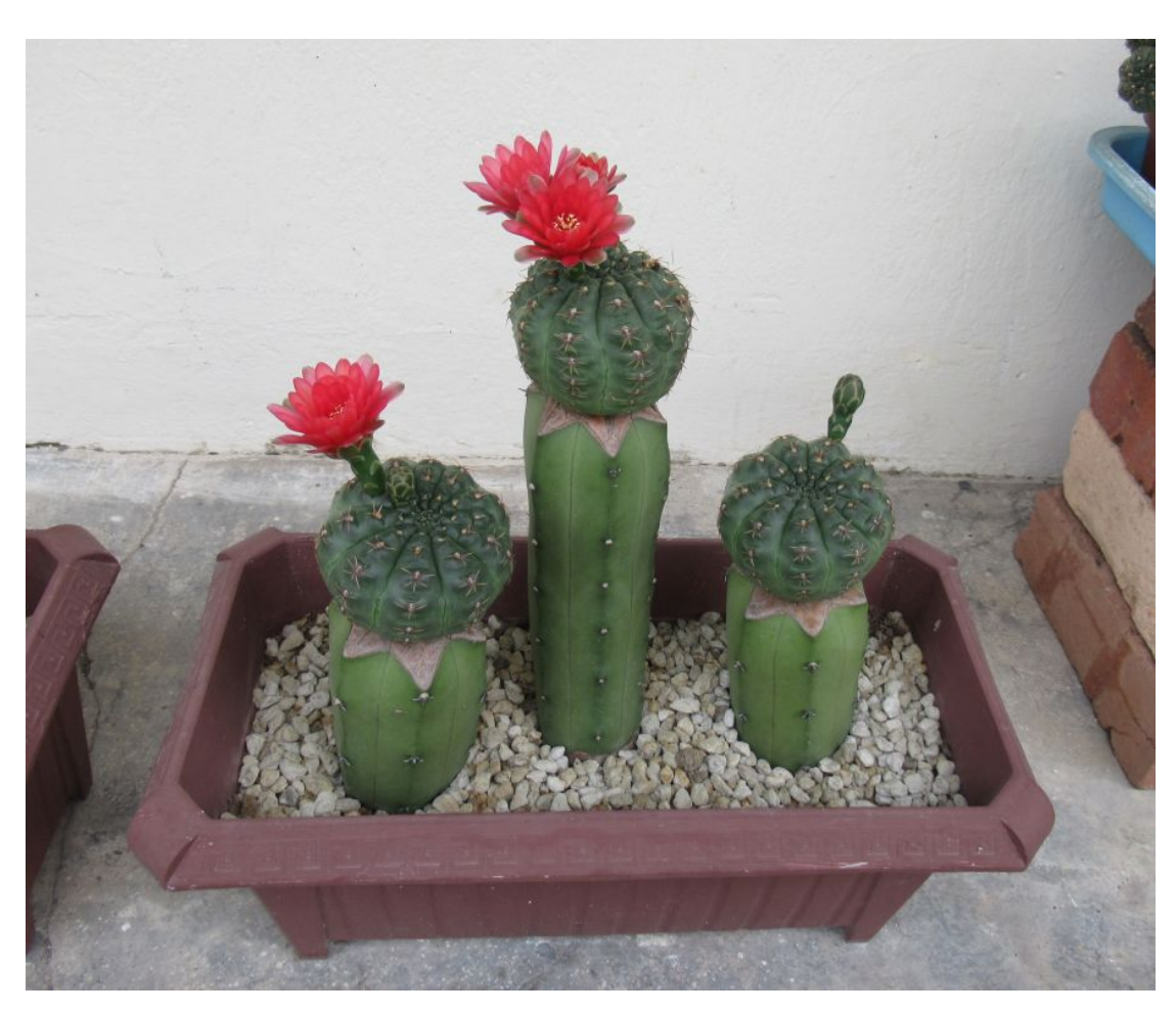
2019DEF on the same day. The flower on 2019D is open on its second day. 2019E is in the midst of another flush of flowers. (September 2020)