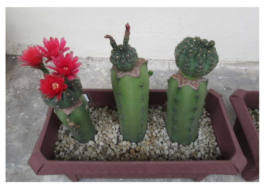
2019ABC at the end of October 2020. The normal GBald scion of 2019A managed to produce four flowers on its second flush of flowers. The smaller scion of 2019B managed two flowers; and there is another offset growing out of its MGeo stock.