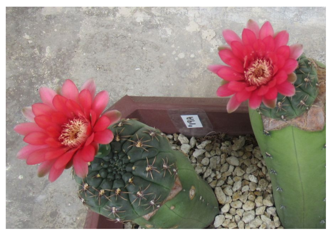
Top view of 2019AB showing healthy stamens with plenty of pollen inside the two flowers. (September 2020)