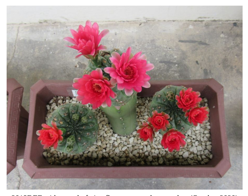
2019DEF with a total of nine flowers open the next day. (October 2020)