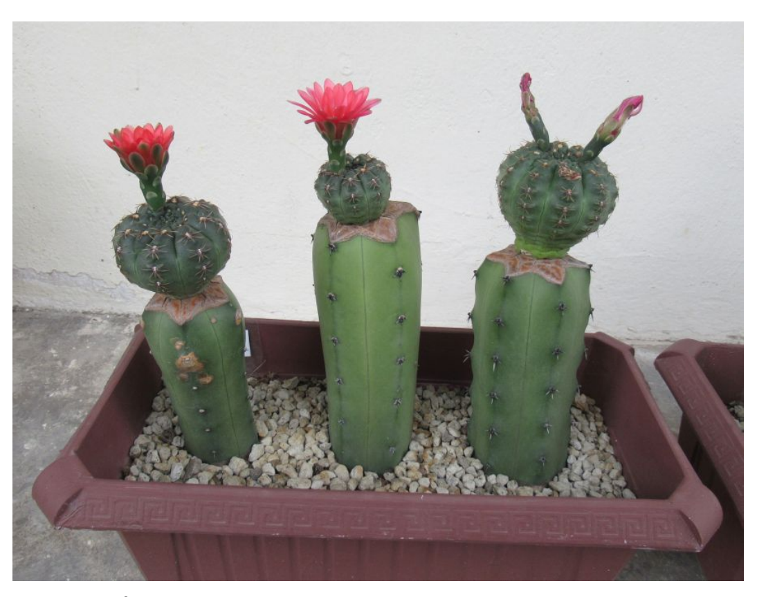
The flower bud on 2019A opened two days later. (September 2020) \,