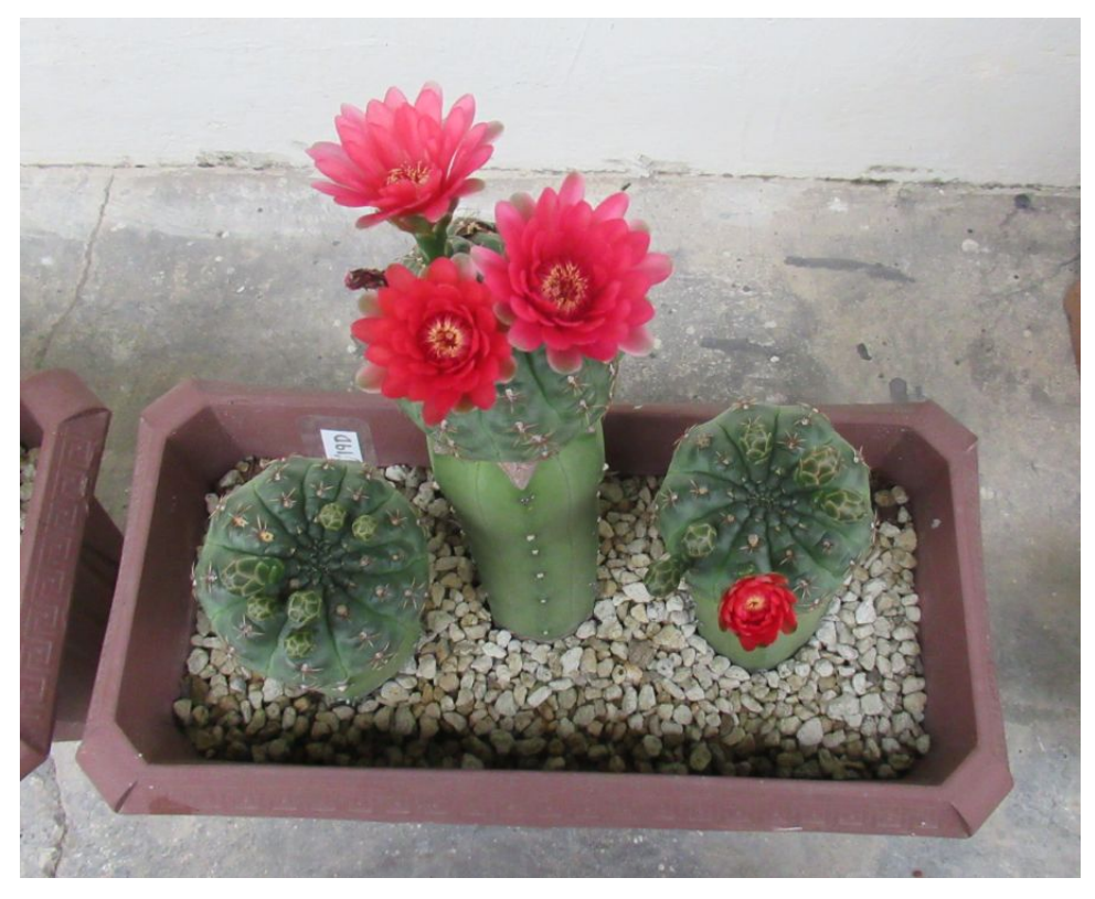
2019DEF the next day. (October 2020)