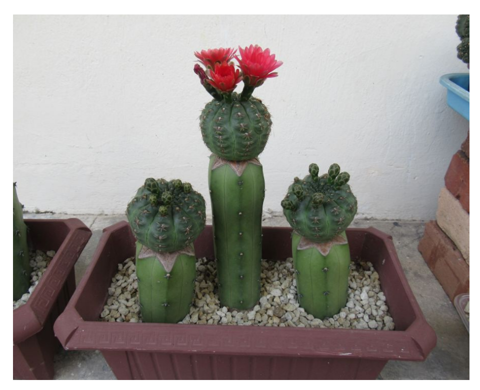
2019DEF in early October 2020. The specimens are not flowering in a synchronized manner; they are just mature and big enough to flower. Weather did not influence the timing of flowers, because these specimens did not stop flowering at all.