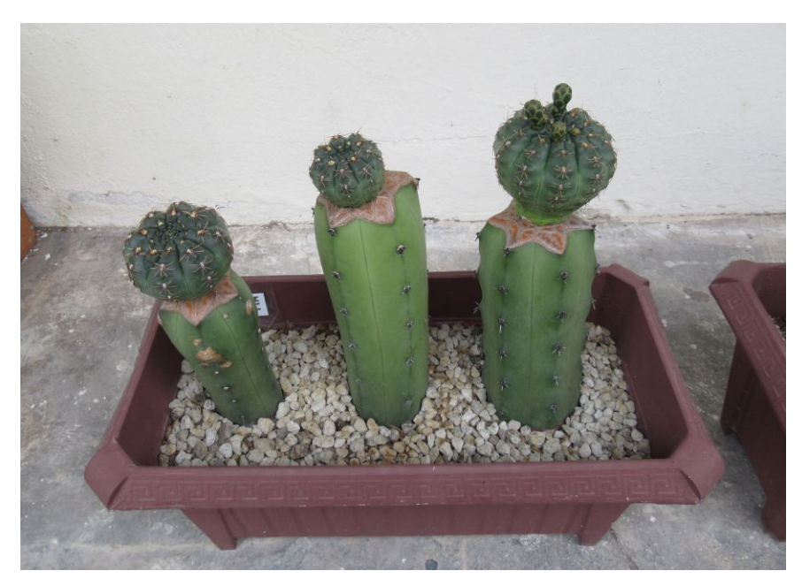
2019ABC at the beginning of September 2020.