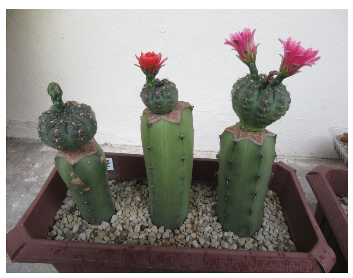
2019B with its first flower 12 days later. The planter box had been rotated. 2019C is just about finished with its flush of flowers. (September 2020)