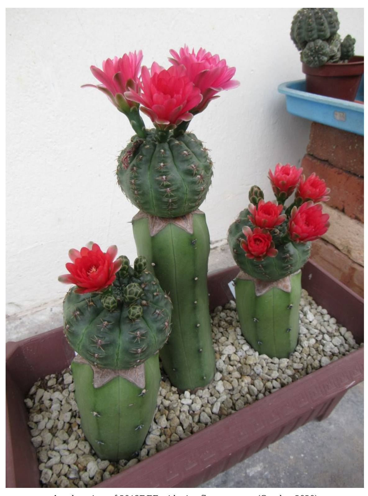
Another view of 2019DEF with nine flowers open. (October 2020)