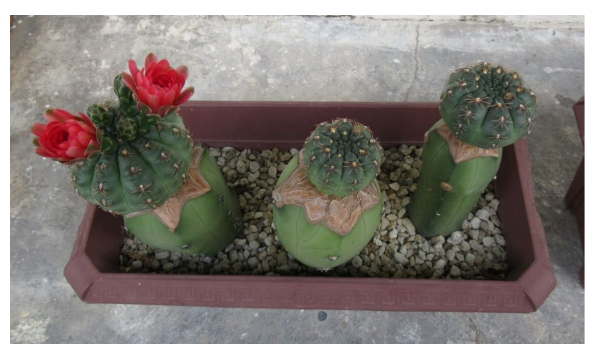
2019CBA three days later. The buds on 2019A and 2019B are just visible. (Sep 2020)