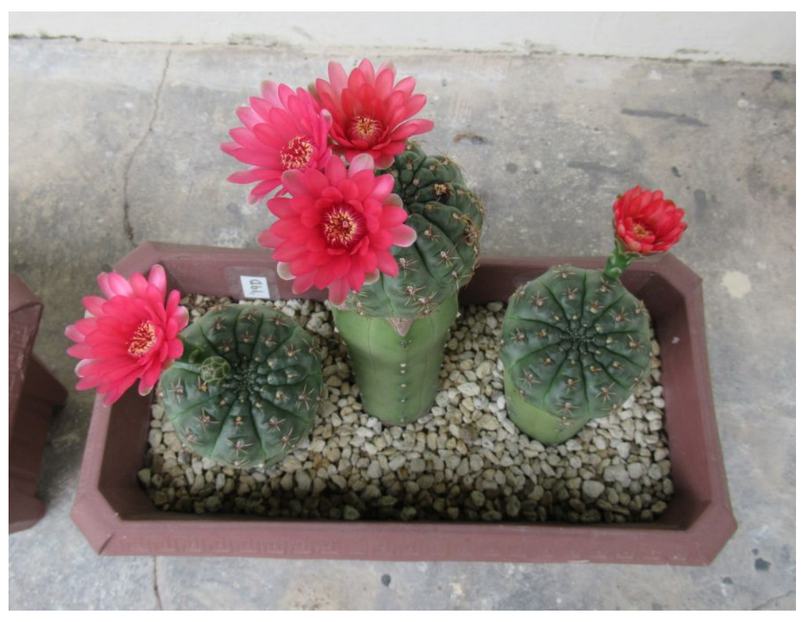
Top view of three grafted specimens (2019DEF) in bloom. All three have no pollen in their flowers, a trait of the hybrid GBalds that I have. (September 2020)