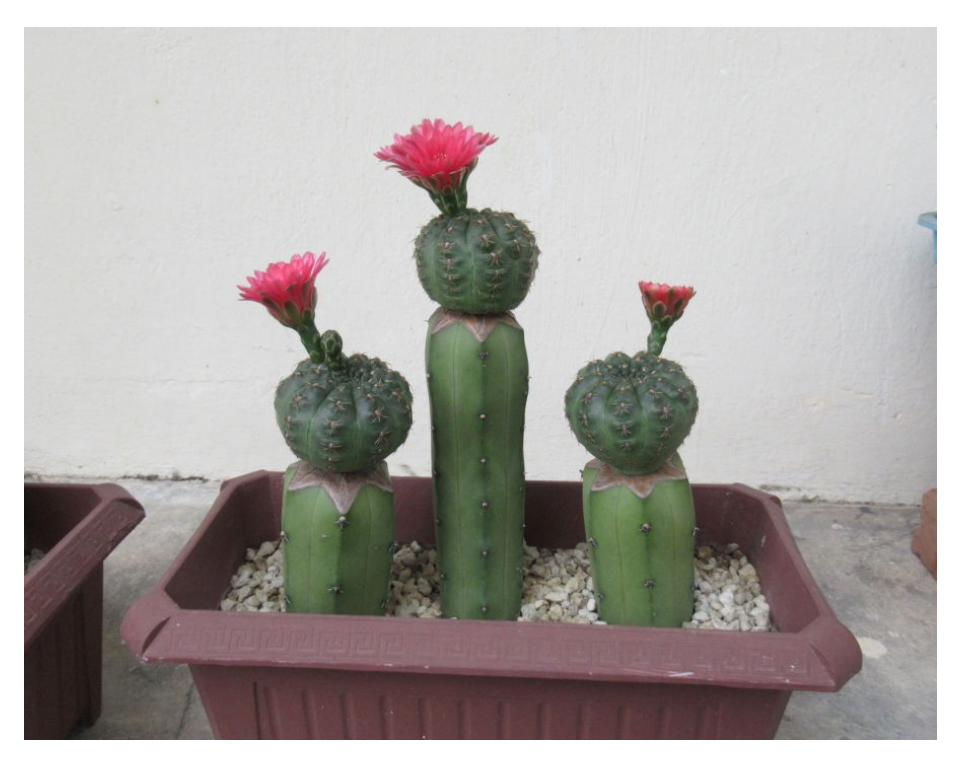
Two days later. The flower on 2019F is open on its first day. (September 2020)