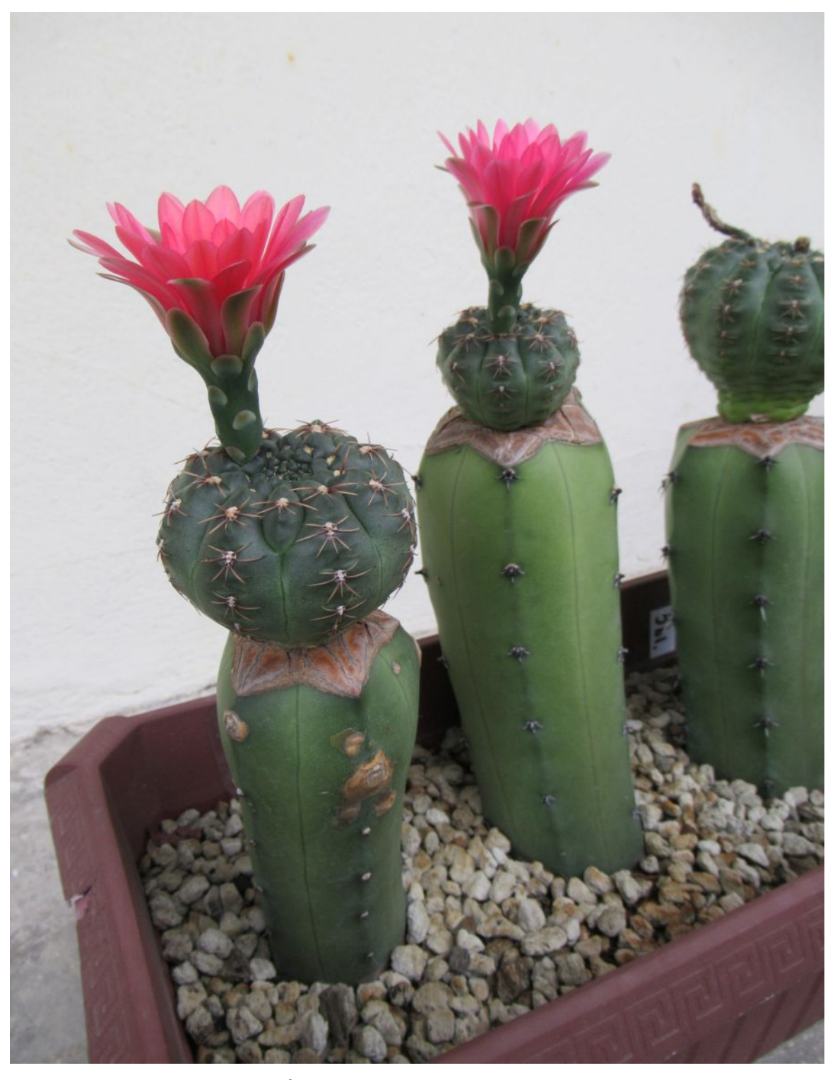
Another view of 2019AB the next day, late September 2020.

And so by the end of September 2020, all six of the GBald-on-MGeo grafts were in business. Two are normal GBald scions that have normal flowers with pollen in them. It's "mission accomplished" after just under 1\frac{1}{2} years. The challenge now is to keep the GBald scions healthy and productive.