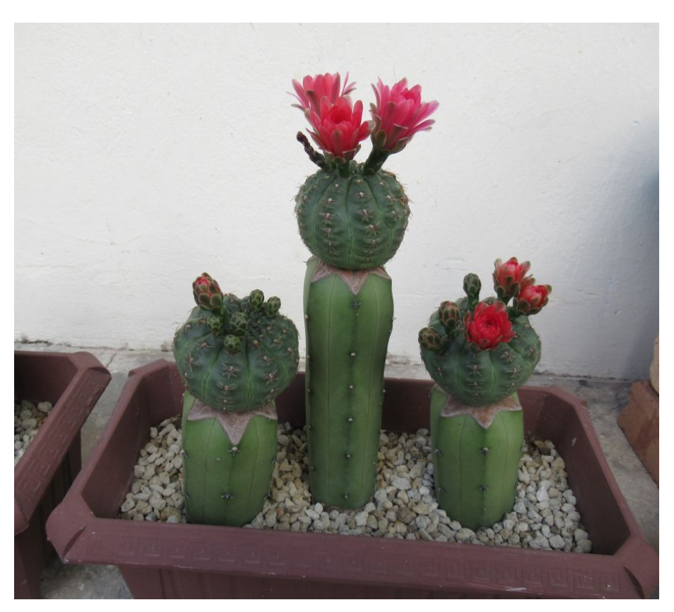
A day later, more flower buds were starting to open. (October 2020)