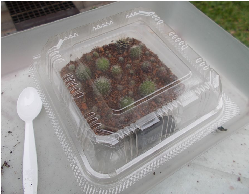
The container of seedlings was placed in a clamshell burger container so that airflow can be better controlled. (August 2019)