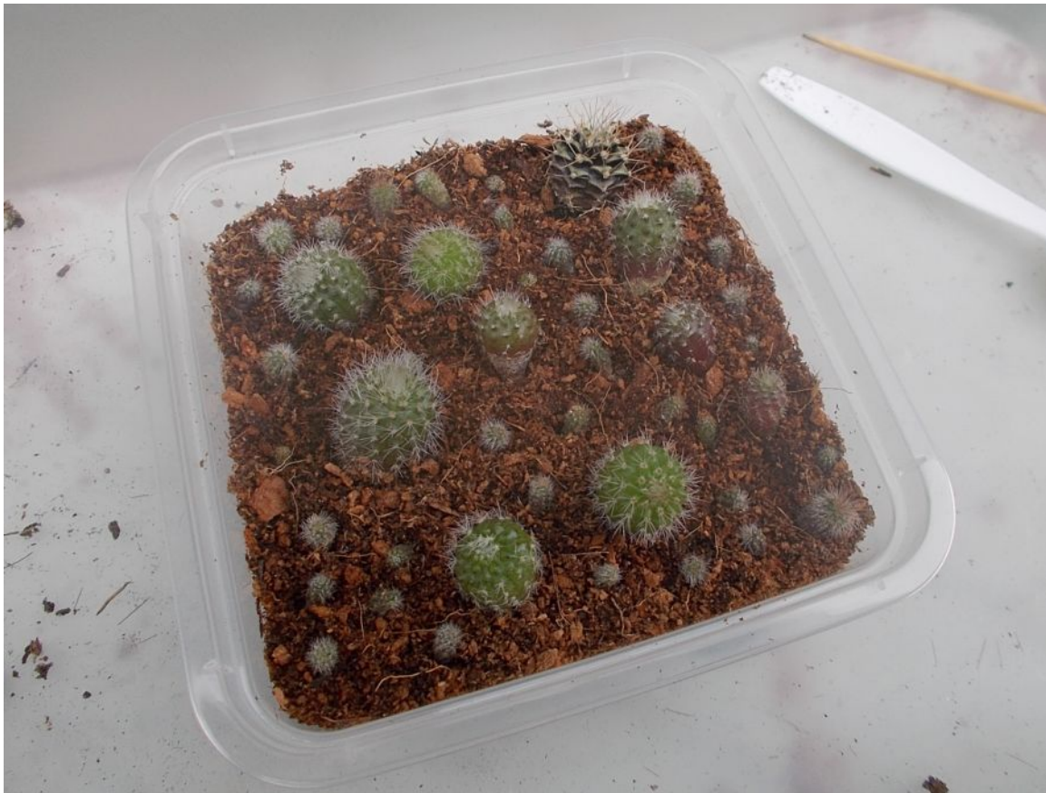
The new experiment: seedlings in a container of jiffy peat and coco peat. (Aug 2019)

The seedlings were transplanted into a new experiment: a square disposable container with no drainage filled with a mix of jiffy peat and coco peat. This avoids the use of soil. However, the risk of algae is still present due to nutrients in the mix 6 . Squeeze some water from the mass of jiffy peat if it's too wet. The coco peat will of course absorb some of the water.