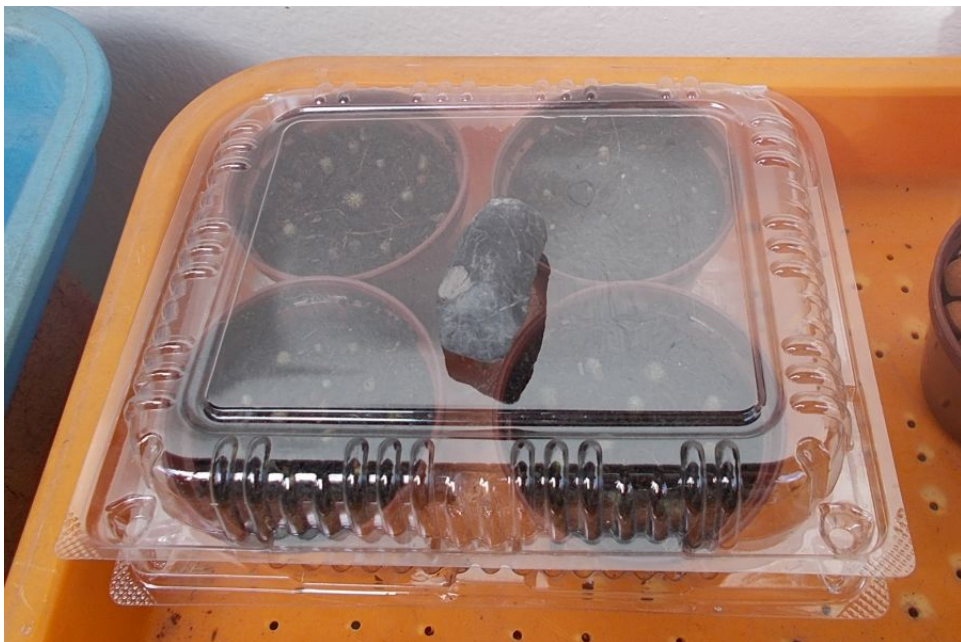
The pots were placed in a kiwifruit container as an additional shelter from the sometimes extreme urban tropical climate. (January 2019)