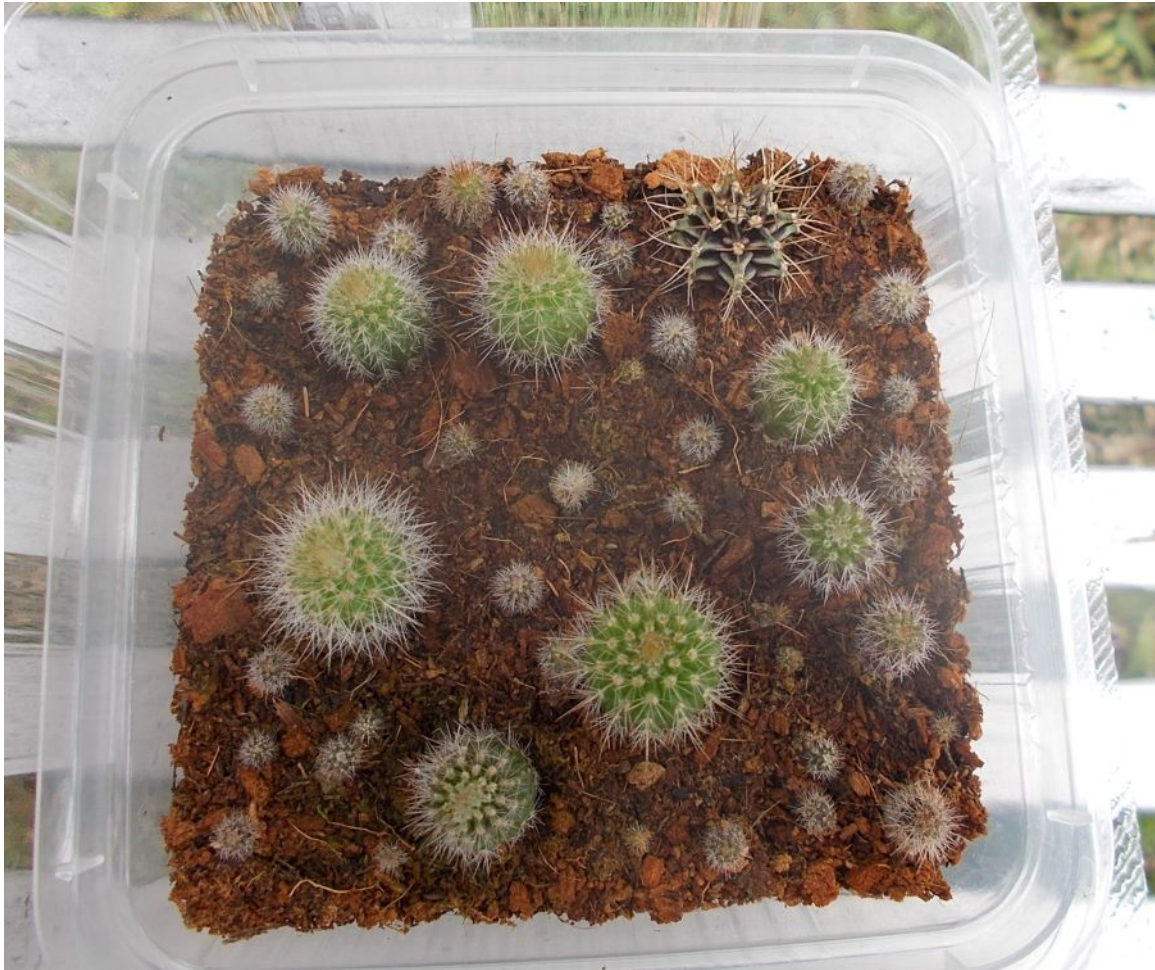
The seedlings a month later, in October 2019.

This kind of enclosed cultivation for cactus seedlings is appealing to growers like me in the tropics because it provides some level of protection to seedlings from the extremes of the microclimate. But a lot can still go wrong. The potting mix is now soilless but there will be trouble if it dries up completely. The presence of fertilizer or nutrients will tend to encourage algae to form, whatever kind of potting mix used. It's hard for hobby growers to provide perfect care to plants.