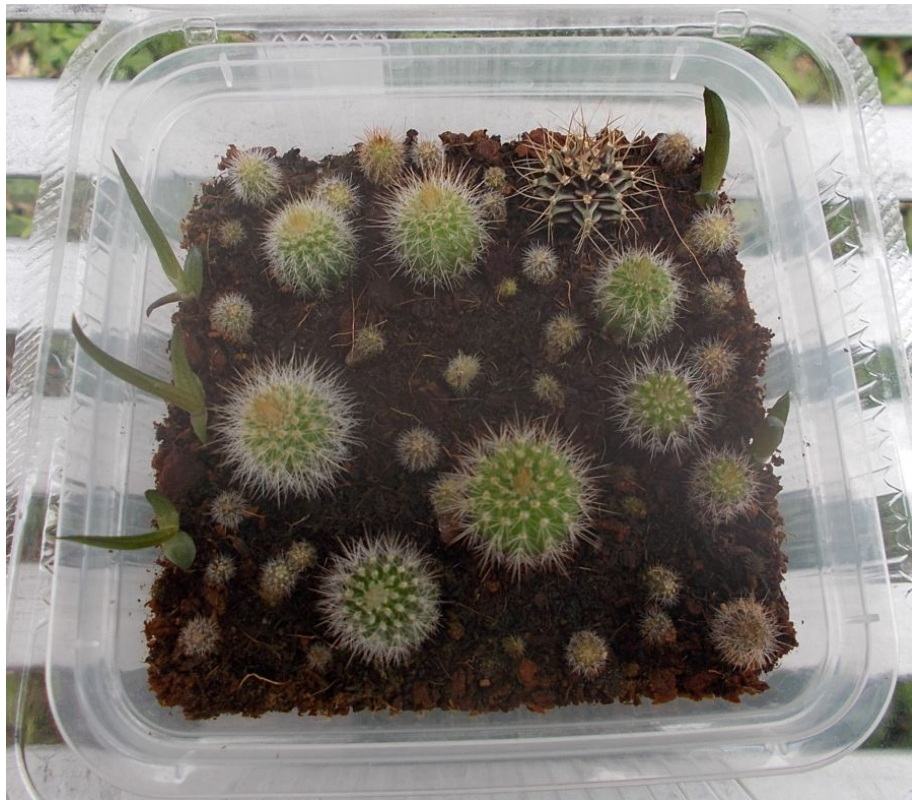
The container after adding the H. limifolia seedlings. (October 2019)