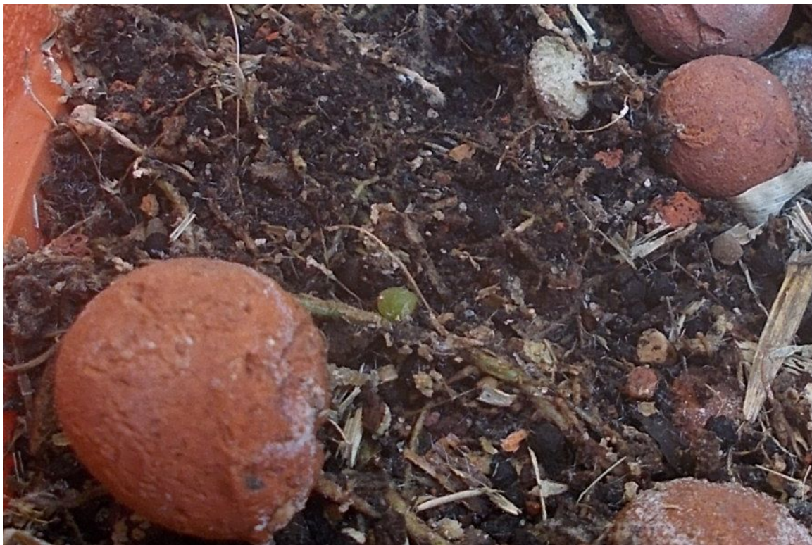
Closeup of the above. (December 2018)