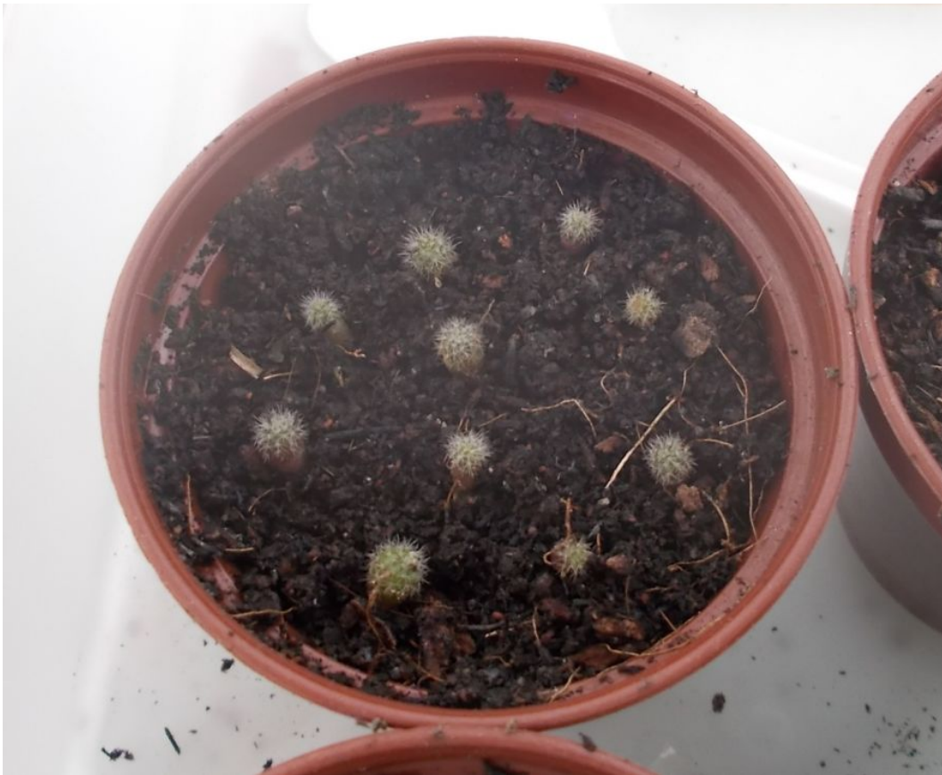
A closeup view of the largest bunch of rescued seedlings. (January 2019)