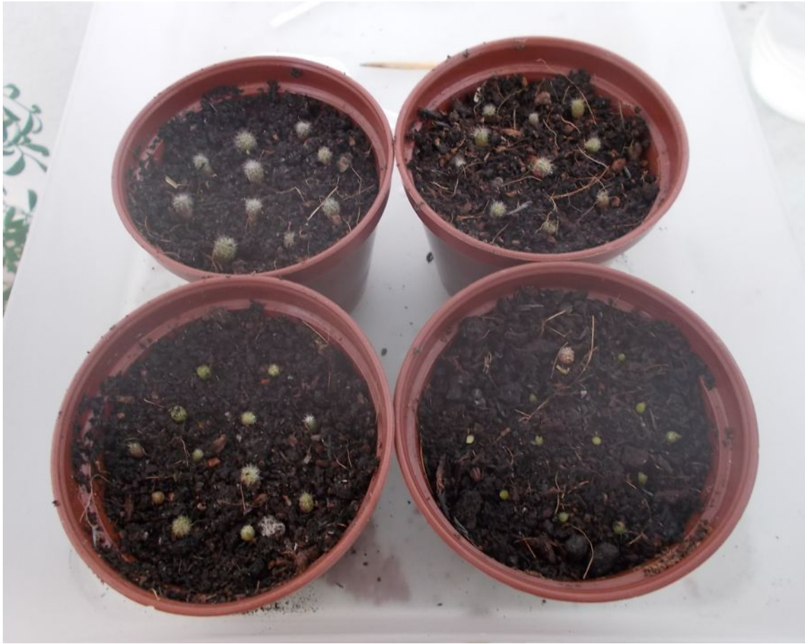
The PClav seedlings after transplanting into pots. (January 2019)

Since the volunteer PClav seedlings cannot be left in their original location forever, they were carefully picked out and transplanted in the following month (picture above.) My objective was to gain experience in growing seedlings outdoors. Losses are to be expected, given the extremes of the tropical urban microclimate 4 . On the bright side, these seedlings feel firm and have good spines.