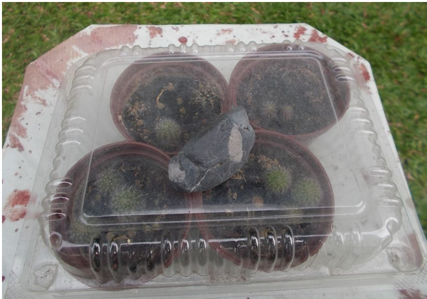
In August 2019, with a stone to hold the container cover down.