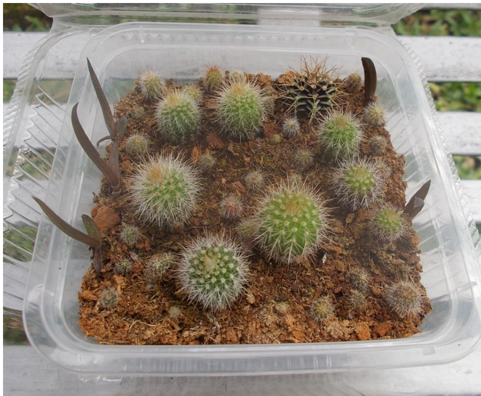
Uh oh, I have left it a bit dry. (November 2019)

There are pictures on the Internet of commercial growers showing off trays with hundreds of seedlings, grown outdoors under cover. The temptation is to try and replicate what you see. However, growers in the tropics should not assume that it will work well in their microclimate, especially if they live in an urban concrete jungle where there are occasional extreme conditions. Also, consider that commercial growers are highly motivated to provide good sustained care to minimize losses. But one useful takeaway is that a carpet of seedlings can act as their own mulch, because crowded seedlings will cover most of the surface of the potting mix.