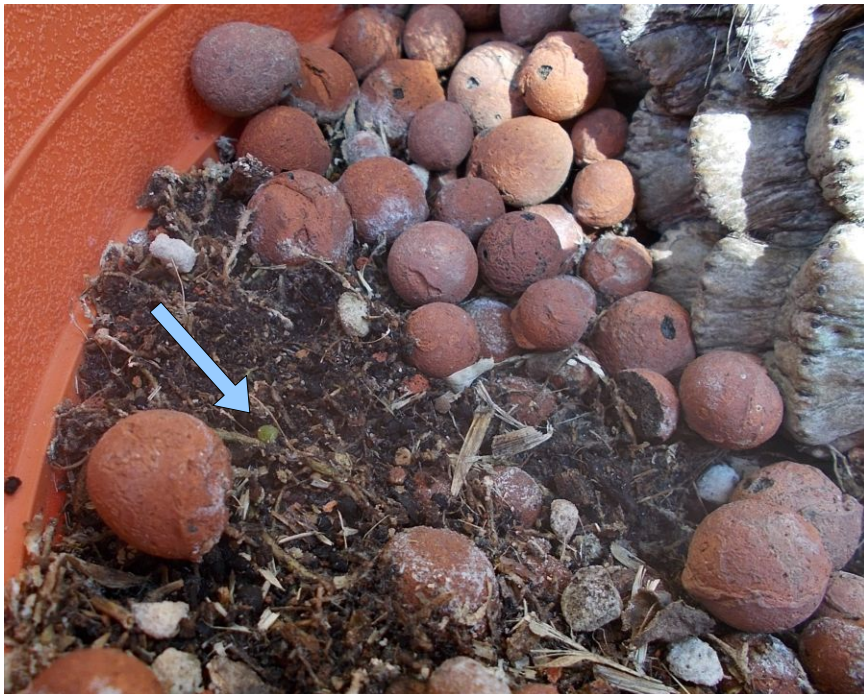
A volunteer seedling (arrow) was found in the big PClav pot in December 2018.