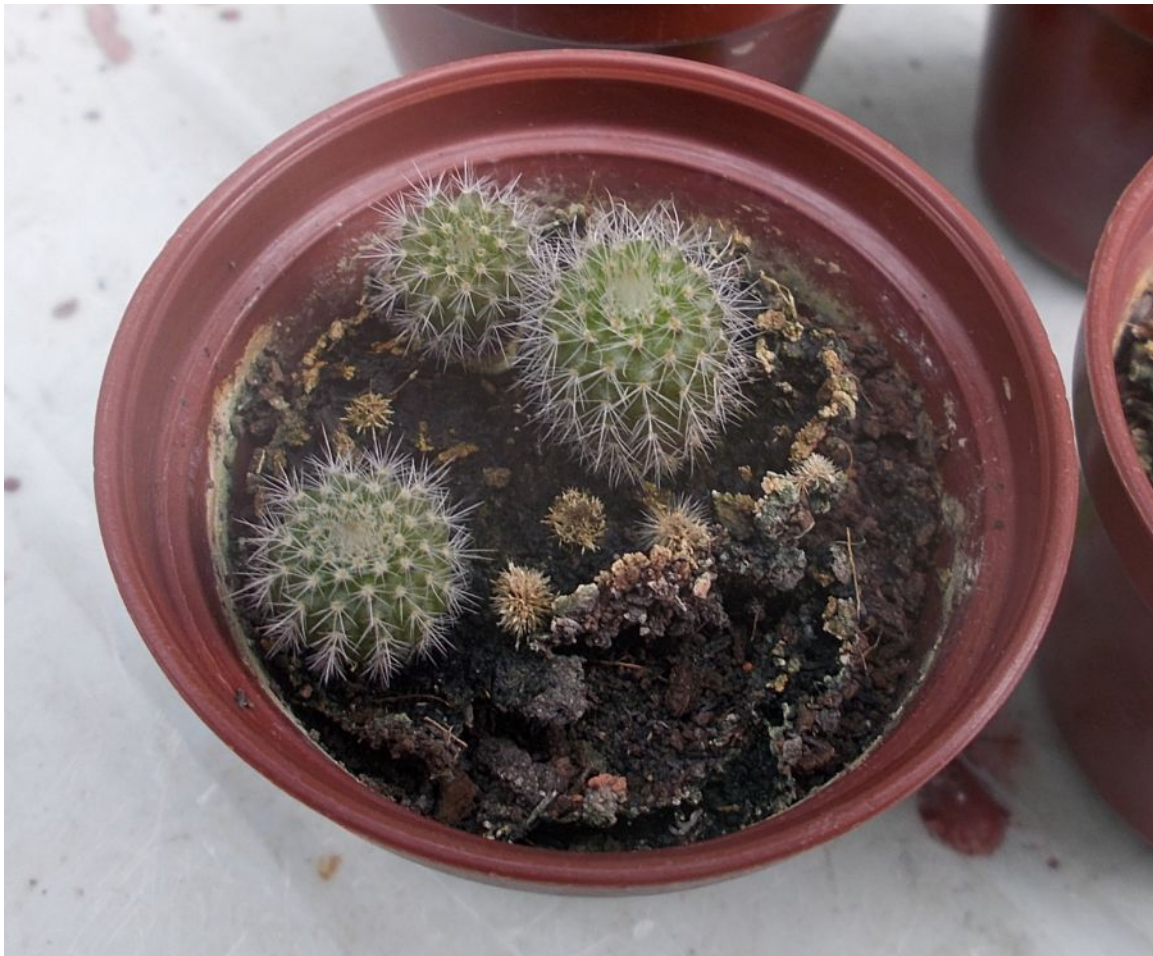
Closeup of one pot, showing the algae layer on top of the soil. The little brown spiny tuffs are dead seedlings. (August 2019)

If you are growing cactus seedlings outdoors in the urban tropics, and you occasionally over-water, then an algae invasion is inevitable. That extra bit of moisture and the bright tropical sun allows algae to grow very fast. Soon you will see a green layer on the soil surface. You'll be able to smell the algae. Watch out for the fungus gnats too – wet algae is yummy food for them.