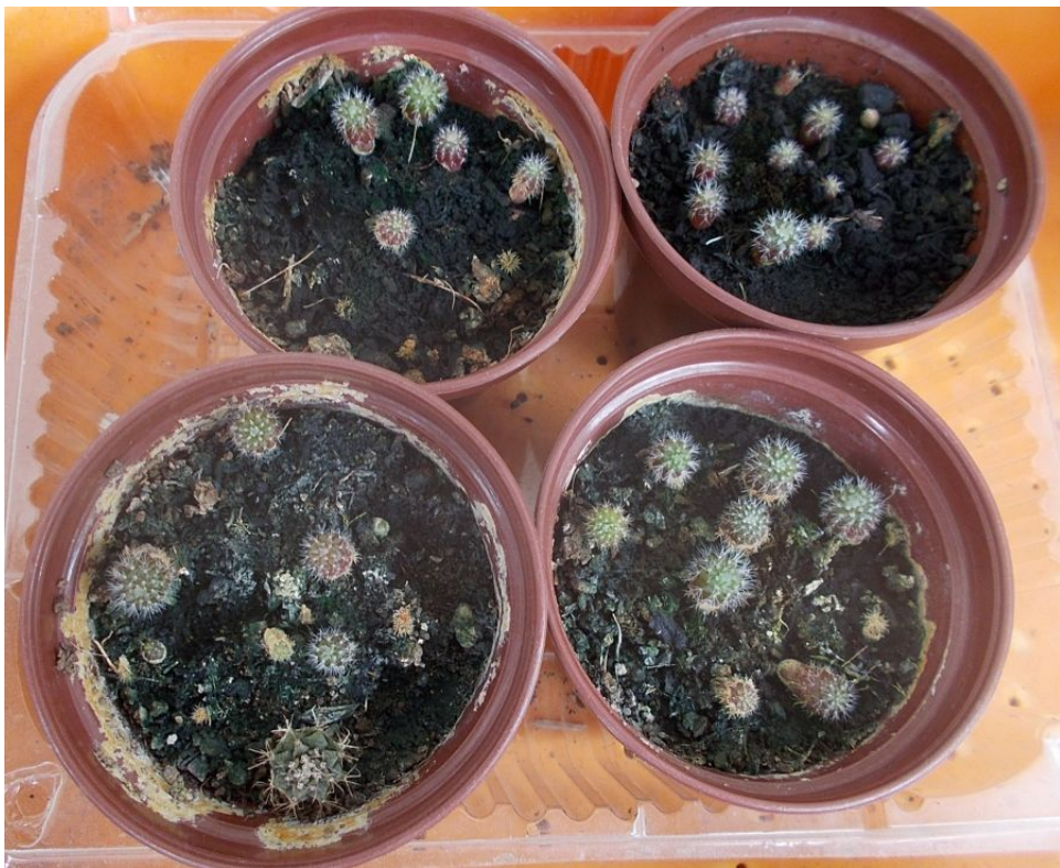
The algae problem is worsening. (April 2019)