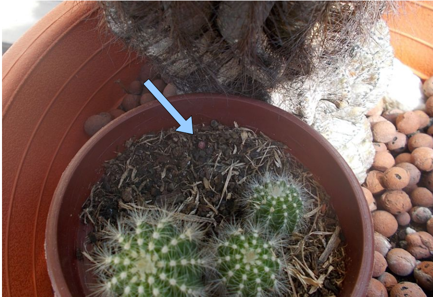
PCLav seeds spilled into other pots. Here is another volunteer seedling. (Dec 2018)

A volunteer seedling is a seedling that germinated and grew on its own. It's not something you intentionally grew from seed. Volunteer Parodia seedlings are unavoidable, because when seed pods work as intended, they burst open to spill some seeds out onto the ground below. In a hot urban tropical climate, most of these seedlings will not survive very long – one hot spell and they are done for. They need to be rescued if you want to see any grow into mature cactus specimens.