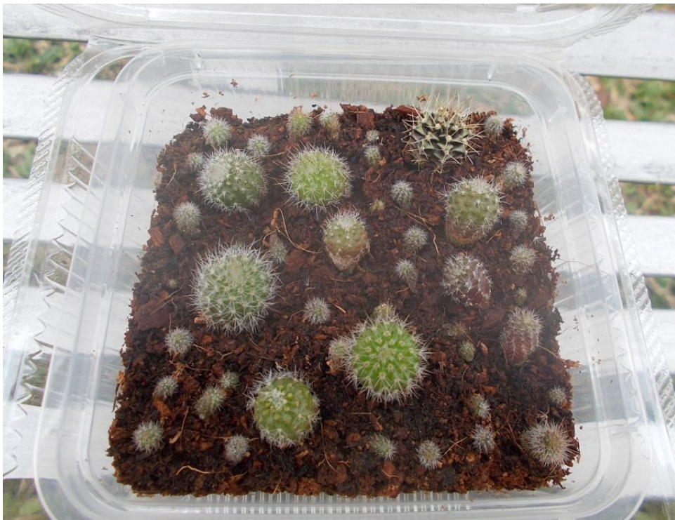
The seedlings after a spray of water. (August 2019)