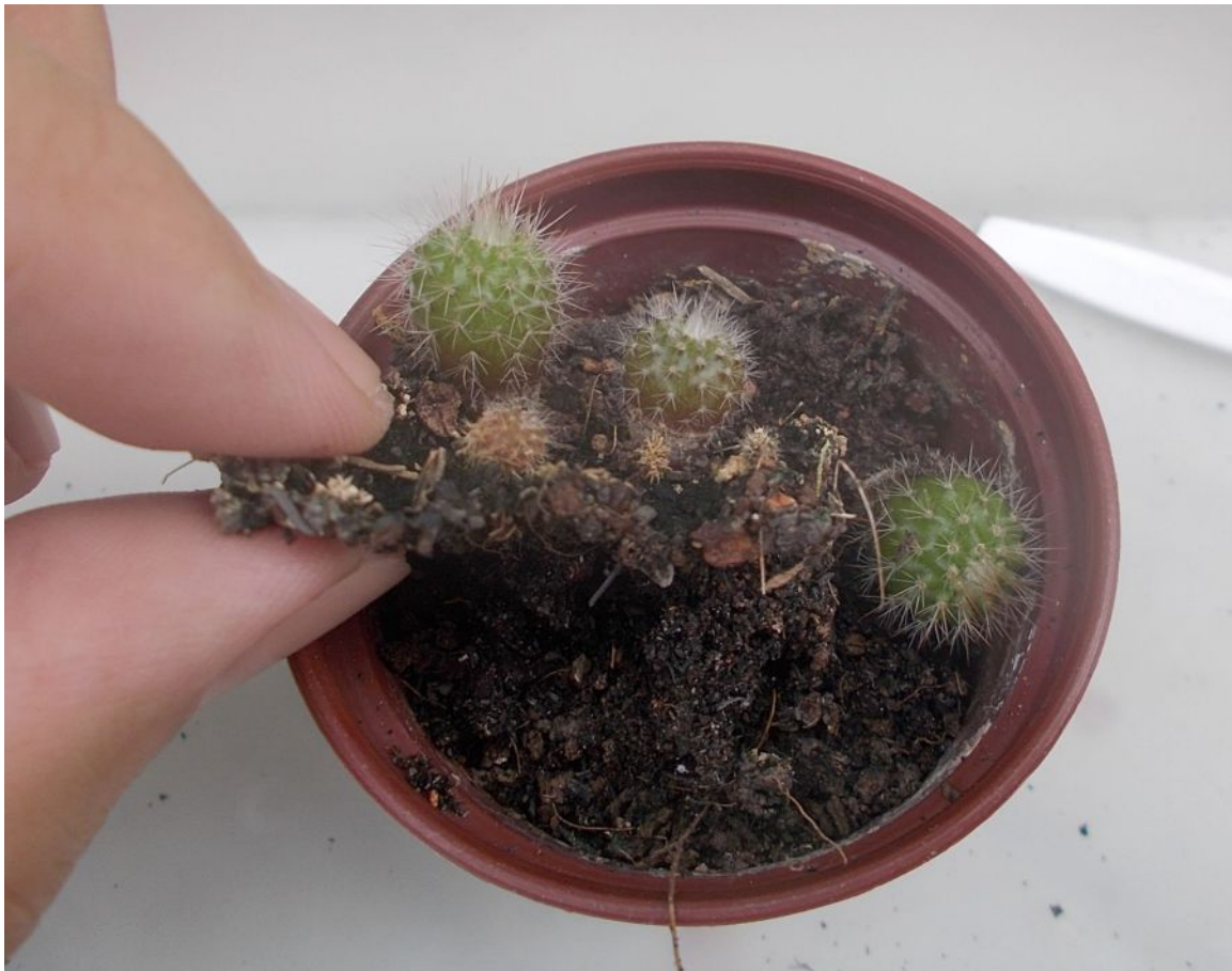
The entire algae layer can be removed from the pot as a single piece. (August 2019)

As you can see in the above picture, the algae has glued together the top layer of soil, so the algae layer can be pulled off in one piece. Lift the piece to your nose and you will be able to discern the smell of algae.