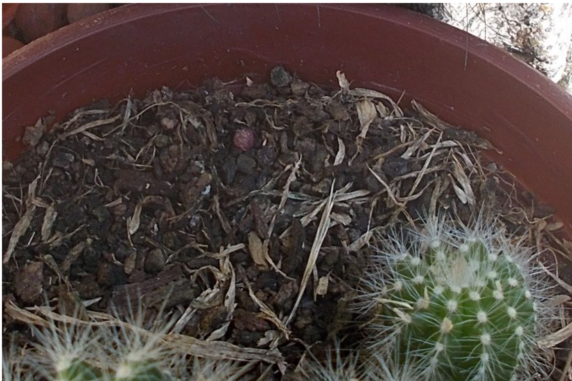
Closeup of the above. It's red in colour, poor thing. (Dec 2018)