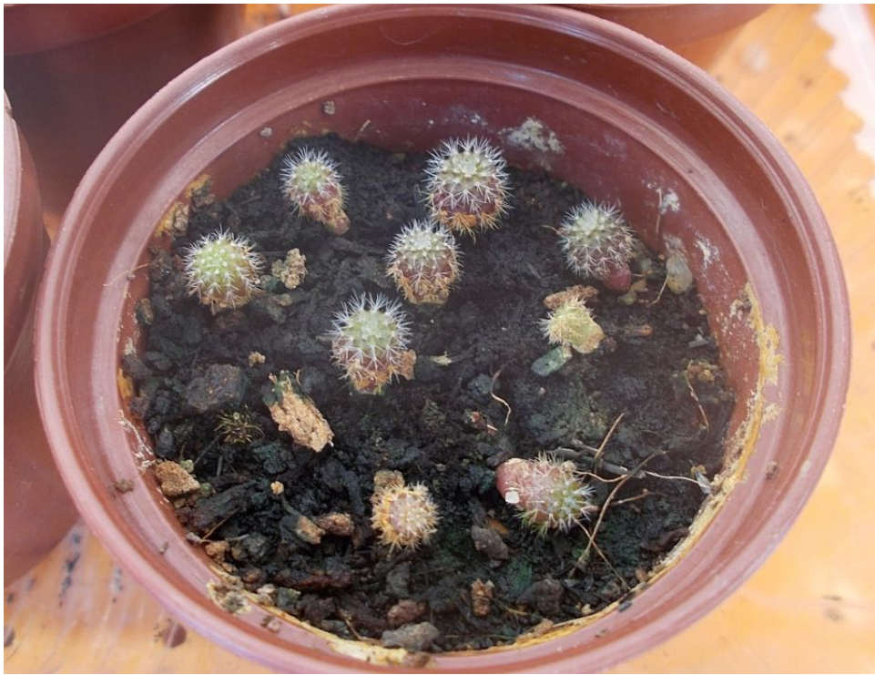
A closeup view of the largest seedlings. (March 2019)