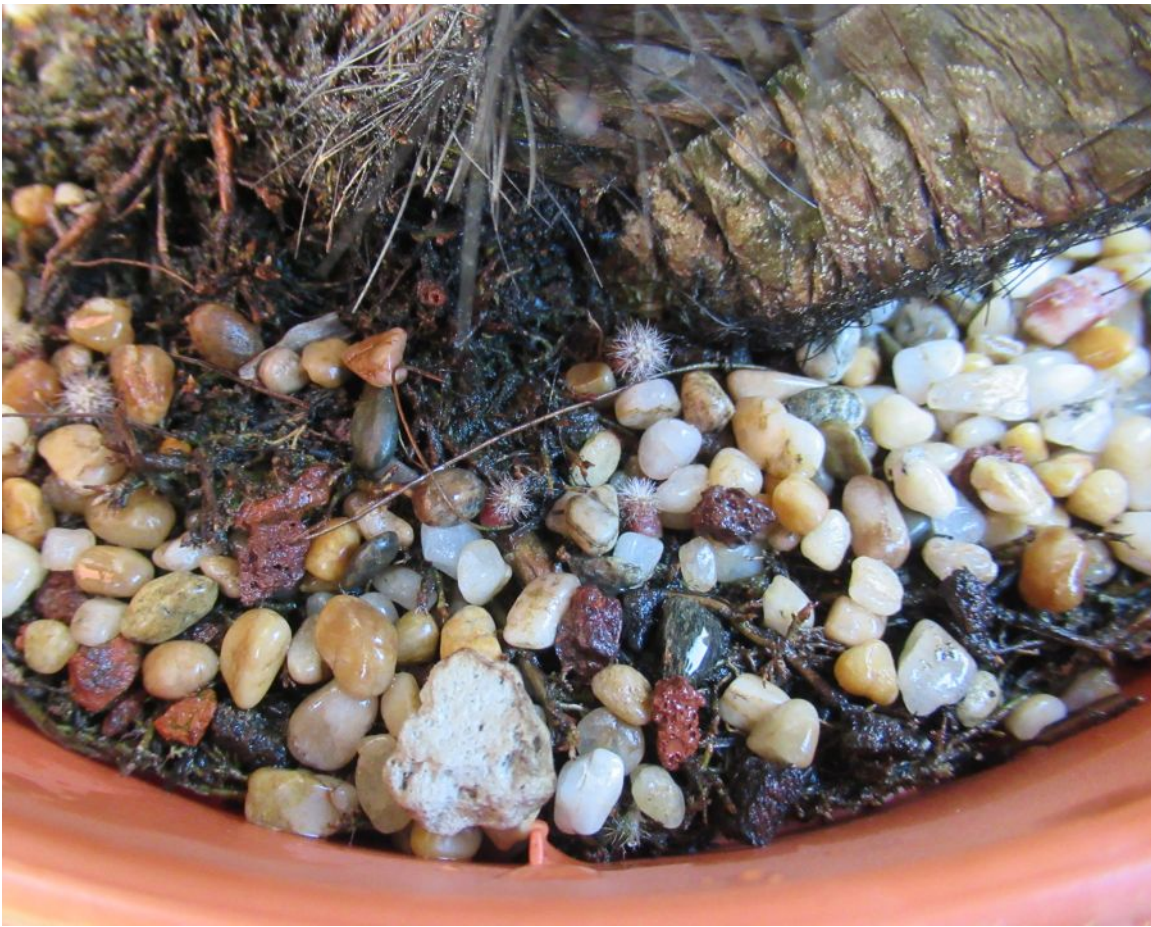
Four PMag seedlings can be seen in this closeup view. (November 2020)

The PMag seedlings in these pictures are not volunteer seedlings. Instead, they are the result of seeds dumped at the base of this PMag pot. The objective is to learn more about the viability of letting seedlings fend for themselves the way nature intended, only this time in a tropical microclimate.