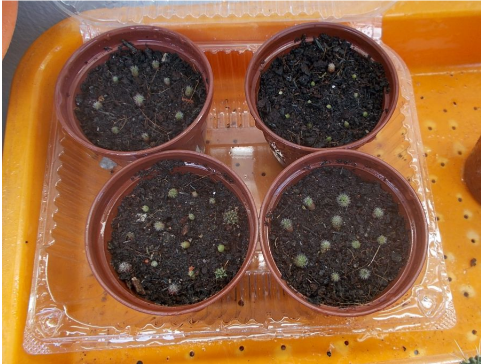
The kiwifruit container with its cover open. (January 2019)