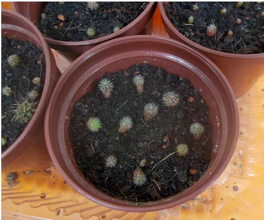
After a month, some progress can be discerned. These seedlings look noticeably larger. The large seedling at far left is not a PClav seedling, is a GSteno seedling from indoors. (February 2019)