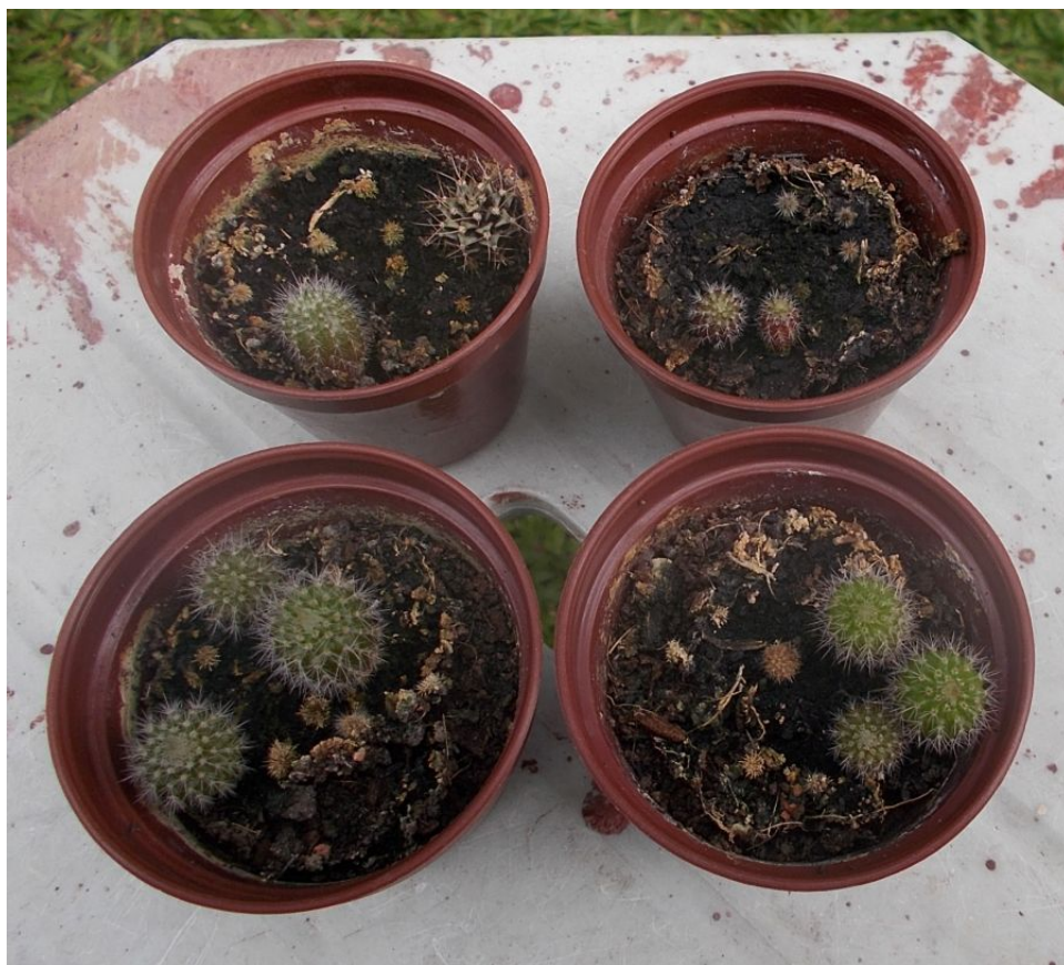
There is no fixing this algae invasion. (August 2019)