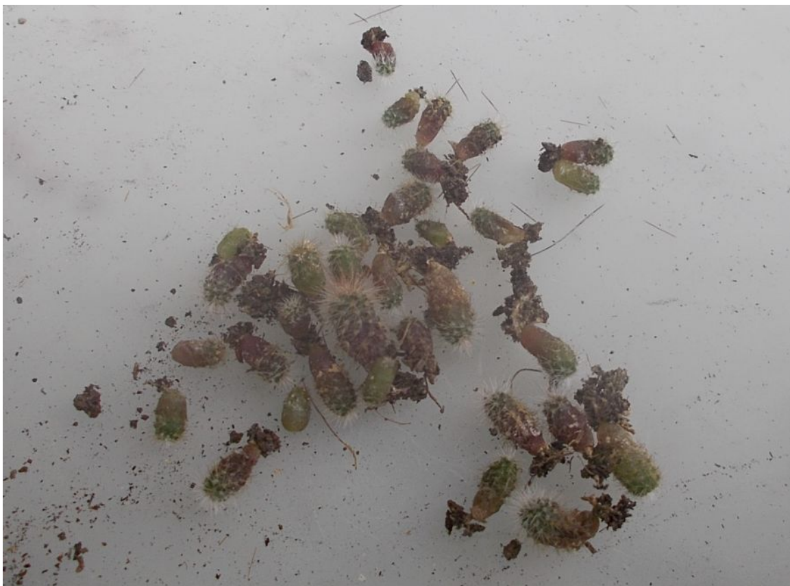
Surprisingly, there were still a good number of smaller seedlings. (August 2019)