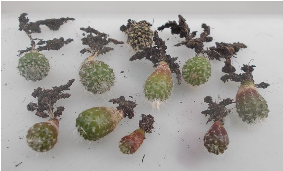
These are the larger seedlings. Note the root systems. (August 2019)